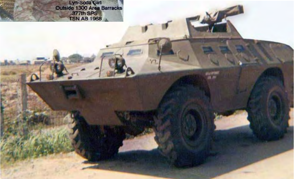
12. (below) Tan Son Nhut AB, V100, SAT Heavy Weapons, Perimeter Road. 1972.