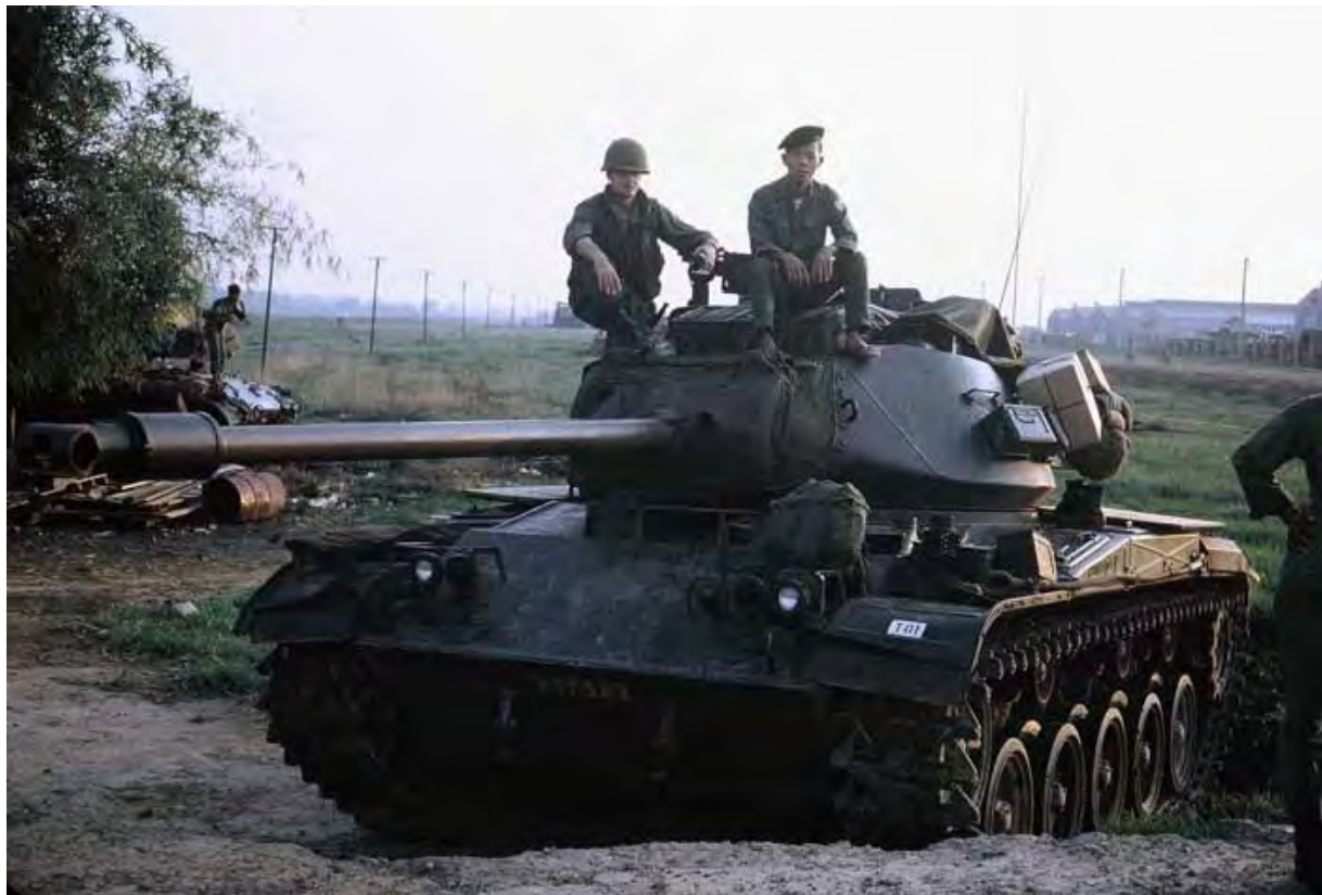
32. Tan Son Nhut AB, 377th Security Police and ARVN tanks. 1968.