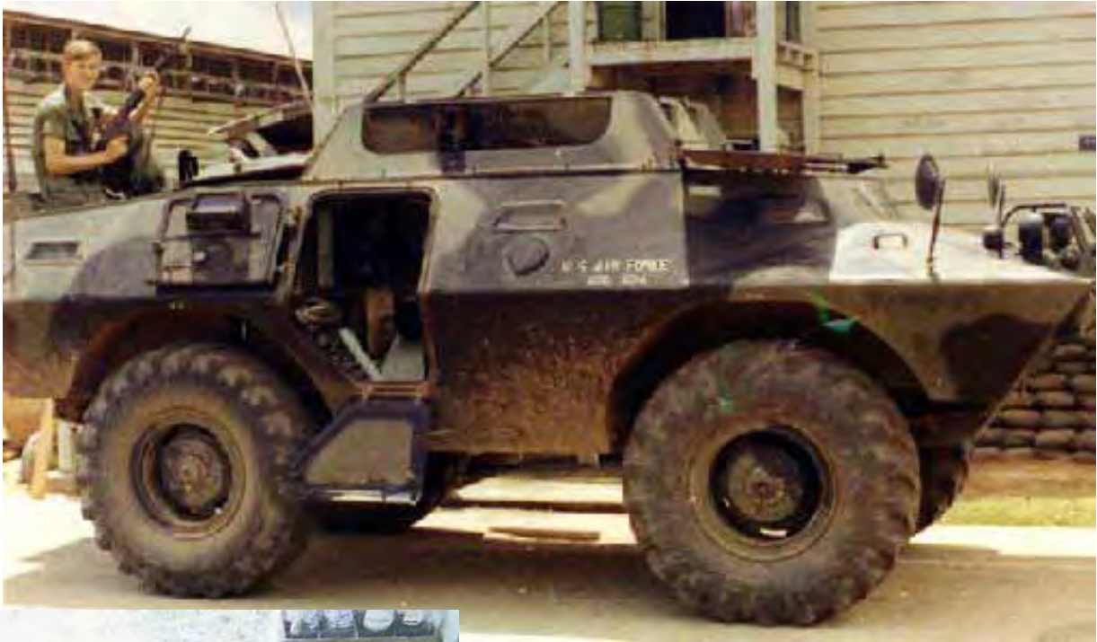
10. (above) Tan Son Nhut AB, V100, SAT Heavy Weapons, Barracks. 1972.