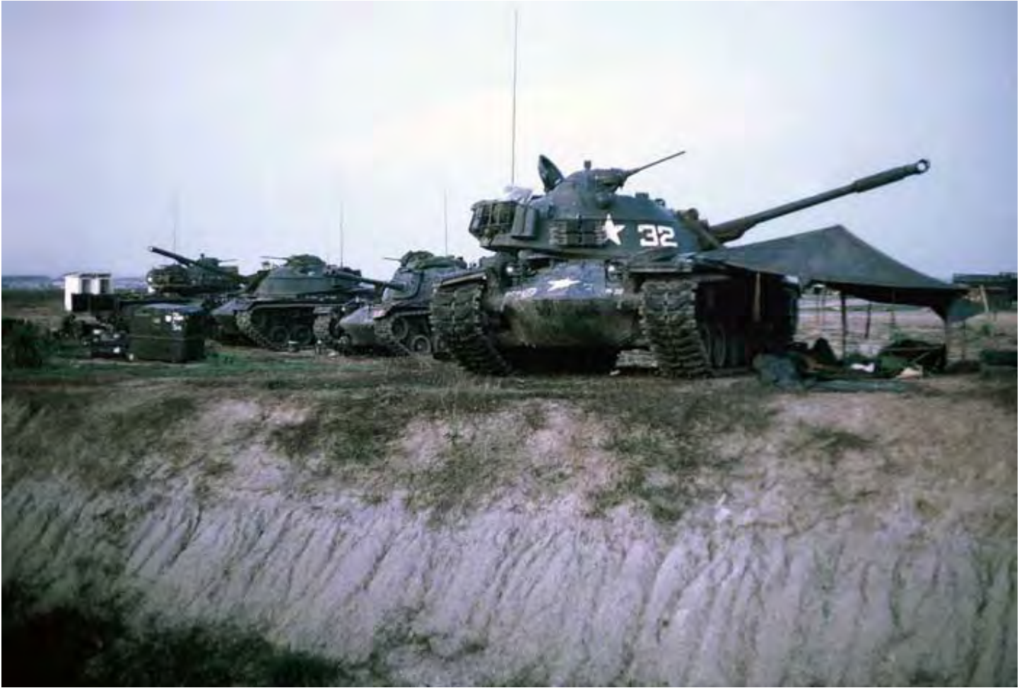
30. Tan Son Nhut AB, US Army tanks. Note rigged-tent to right. 1968.