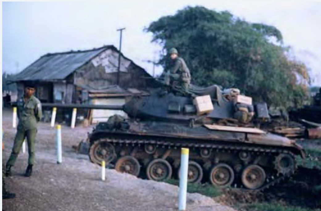
34. Tan Son Nhut AB, 377th Security Police and ARVN tanks. 1968.