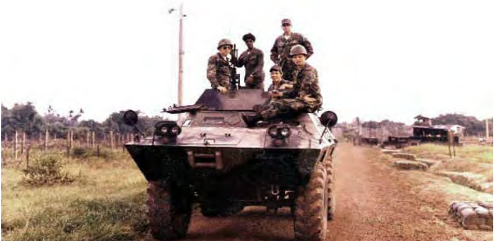
9. Tan Son Nhut AB, V100, SAT Heavy Weapons, Perimeter Road along Bunker Row. 1972.