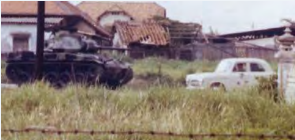
36. Tan Son Nhut AB, tank at Main Gate. 1972-1973.