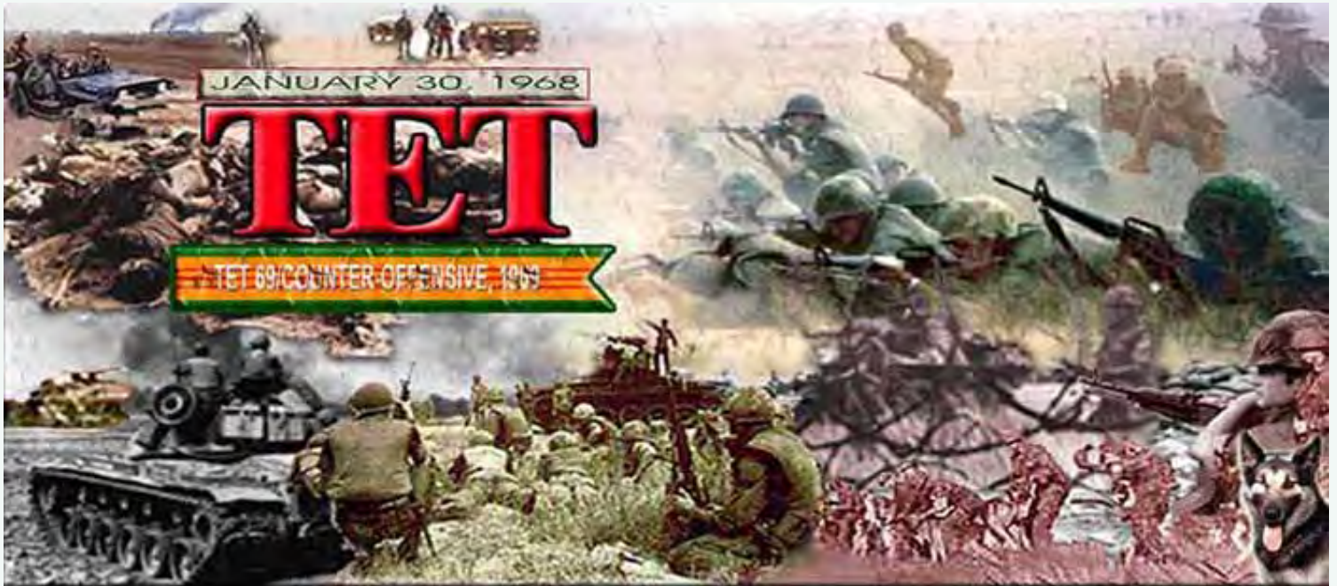
1. Tân Sơn Nhứt AB, Security Police Heavy Weapons, Tet 1968.