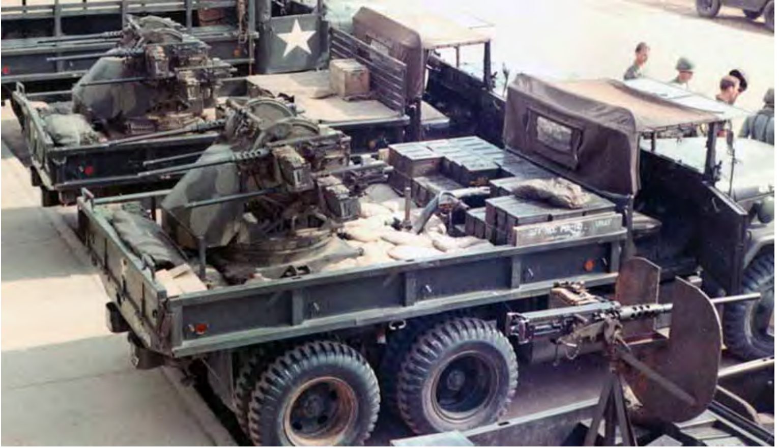
4. Tan Son Nhut AB, US ARMY Heavy Weapons, Quad-50s. 1965-1968.