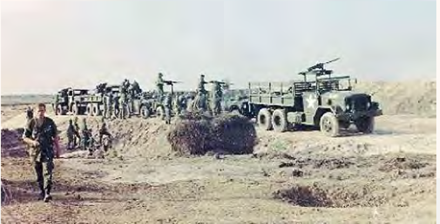
17. Tan Son Nhut AB, 377th SPS Special Weapons Unit Convoy out for weapons testing..50-cal., 60-mm Mortars, Quad-50's, LAAW (Light Anti-Tank Weapons), and other toys. 1968.