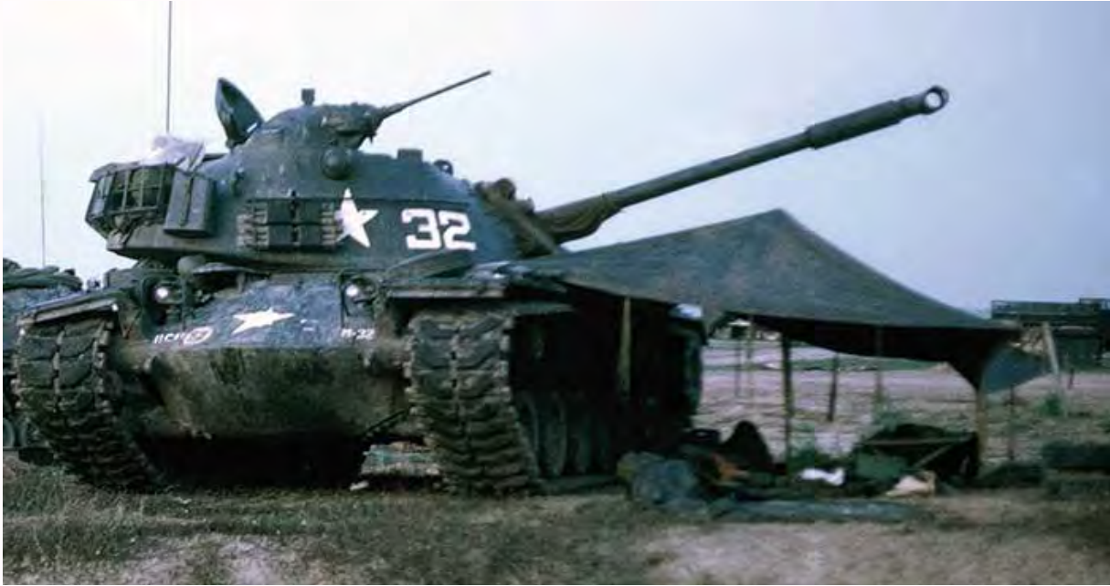
31. Tan Son Nhut AB, US Army tanks, and closeup of rigged-tent to right. 1968.