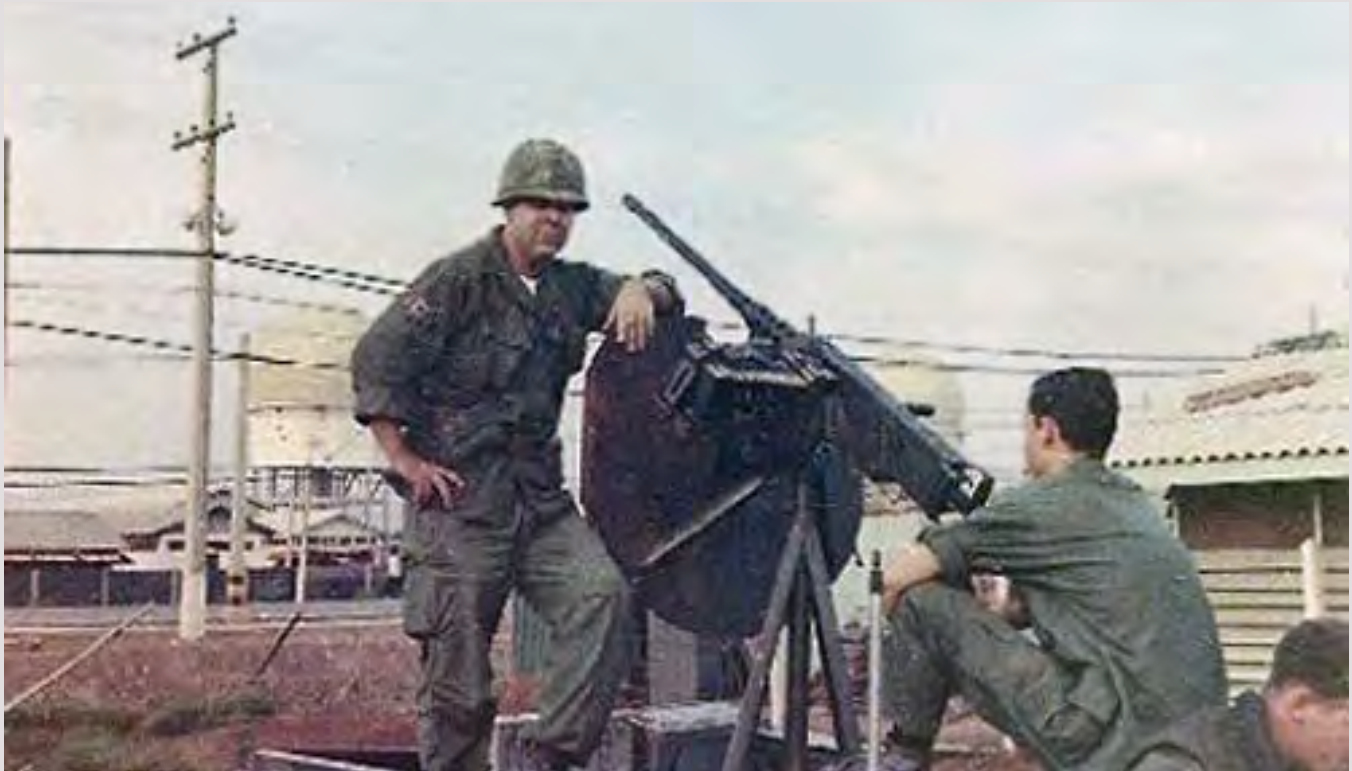
20. Tan Son Nhut AB, 377th SPS Special Weapons Unit Convoy. 1968.