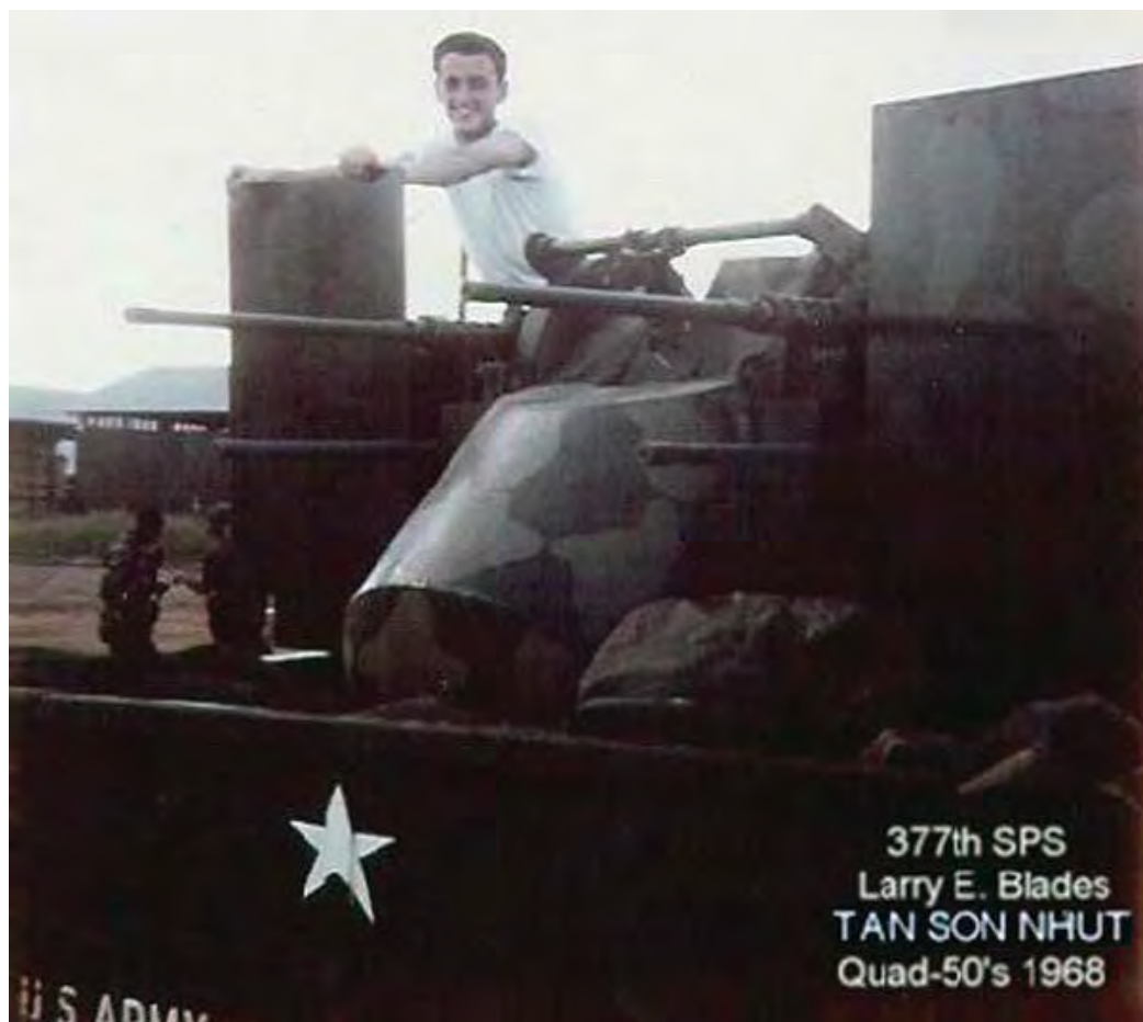
6. Tan Son Nhut AB, Security Police SAT Heavy Weapons, Quad-50s. 1968.