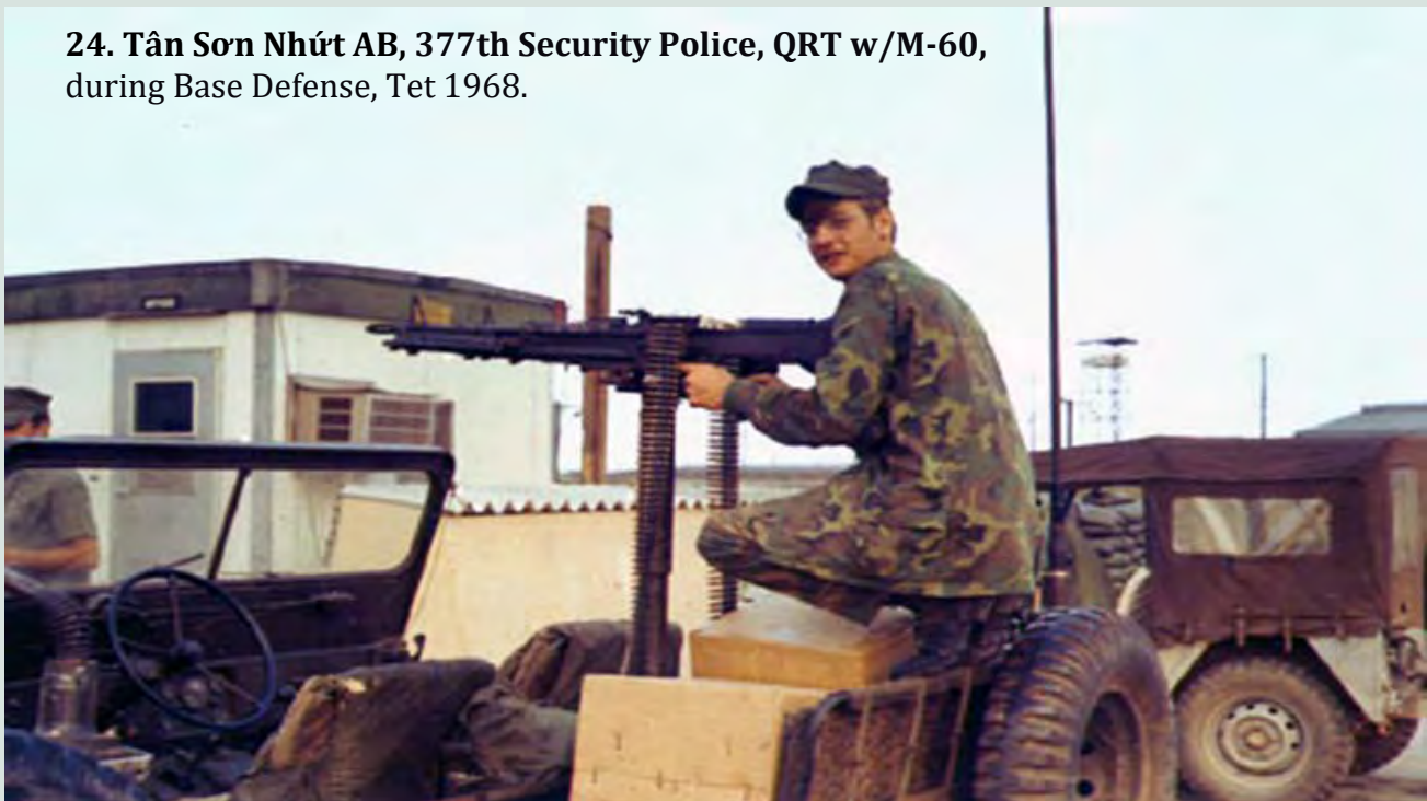
24. Tân Sơn Nhứt AB, 377th Security Police, QRT w/M-60, during Base Defense, Tet 1968.