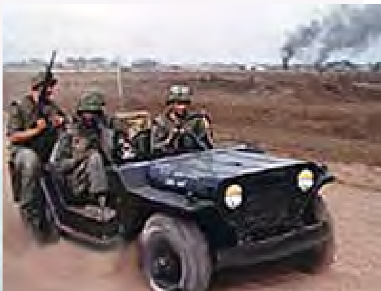
26. (Photo left) Tân Sơn Nhứt AB, 377th SPS form blocking force, morning of Tet 1968 attack at TSN. Photo by unknown.

26. (Photo right) Tân Sơn Nhứt AB, 377th SPS QRT looking for trouble, morning of Tet 1968 attack at TSN. Photo by unknown.