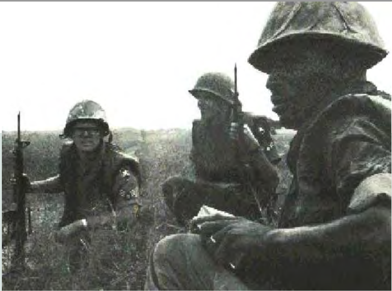
23. Tân Sơn Nhứt AB, 377th Security Police, engaging NVA/VC during Base Defense, Tet 1968.