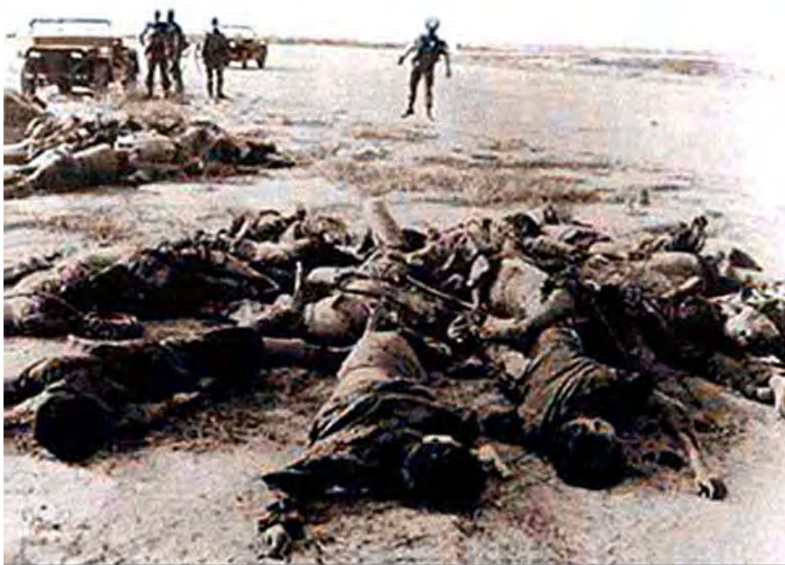
377th Security Police view the bodies of Communist forces killed in the attack on Tân Sơn Nhứt Air Base during Tet Offensive.

26. (Photo right) Tân Sơn Nhứt AB, 377th SPS QRT looking for trouble, morning of Tet 1968 attack at TSN.