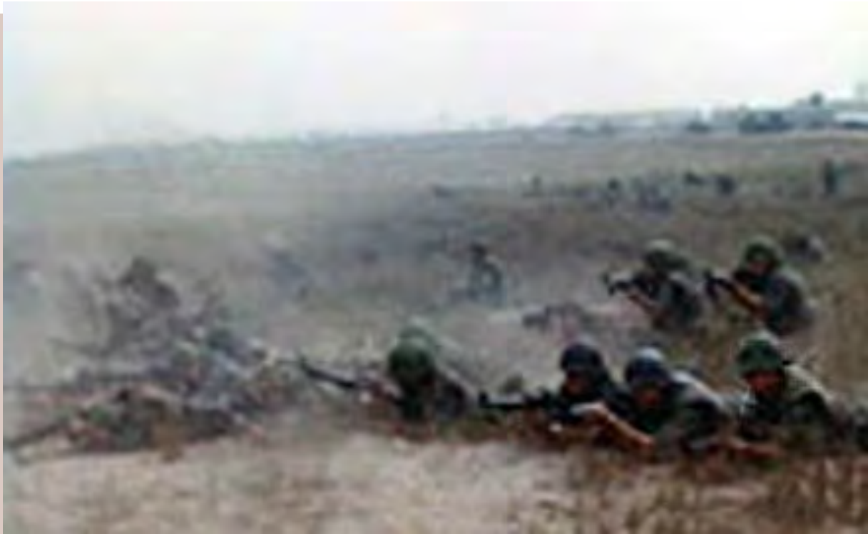
21. & 22. Tân Sơn Nhứt AB, 377th Security Police, engaging NVA/VC during Base Defense, Tet 1968.