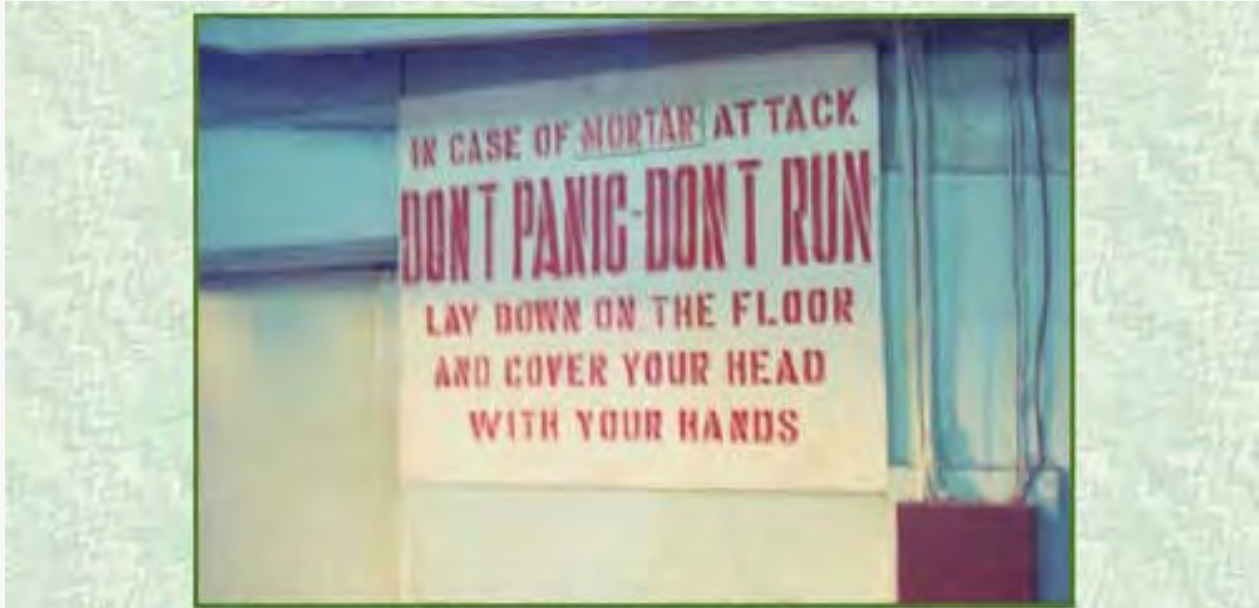
Sign on air terminal wall at Tan Son Nhut Airport. Photo taken in 1968.