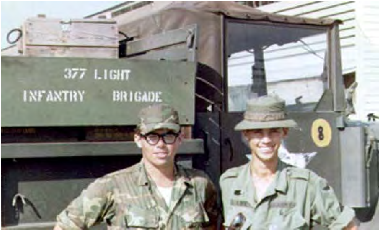
2. Tan Son Nhut AB, 377th "Light Infantry" Security Police (Base Defense) Quad-50 Truck. 1967-1968.