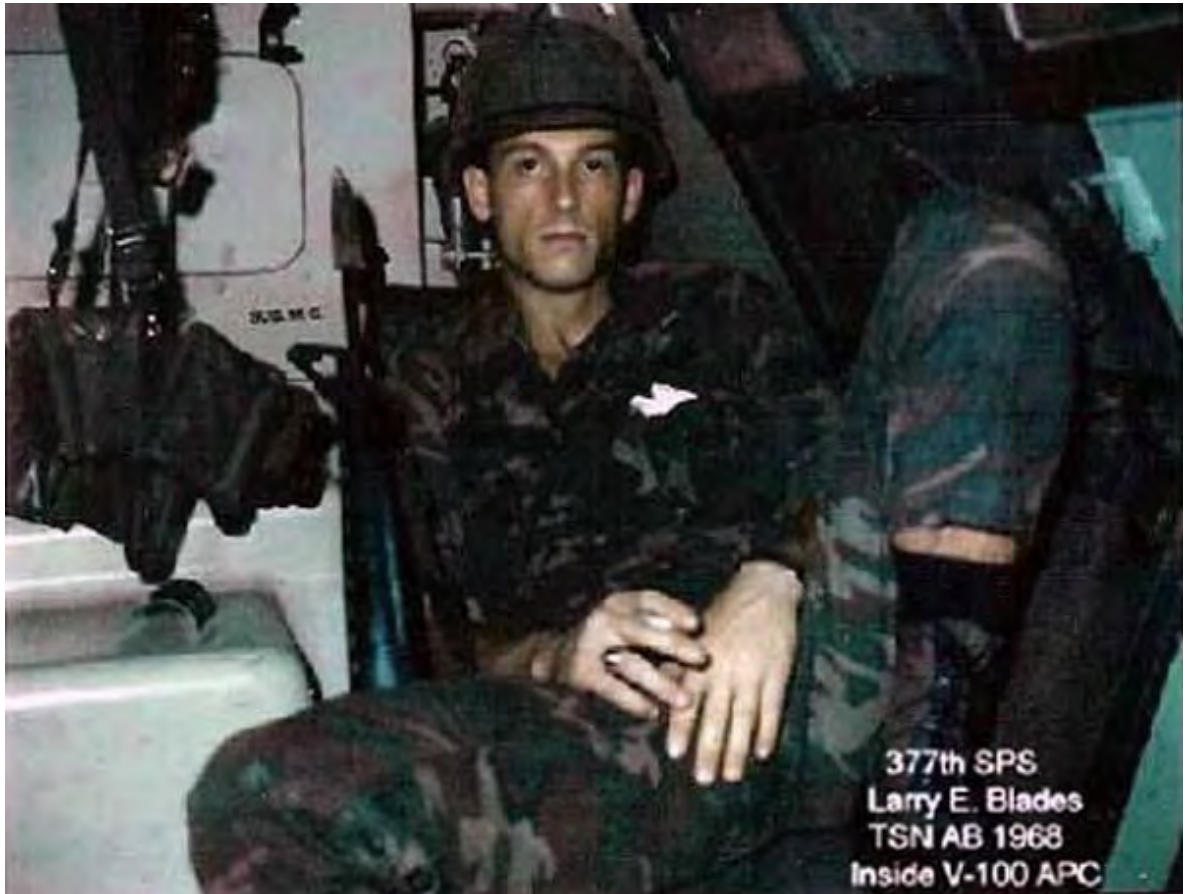
8. Tan Son Nhut AB, Inside V100, SP SAT Heavy Weapons, M60. 1968.