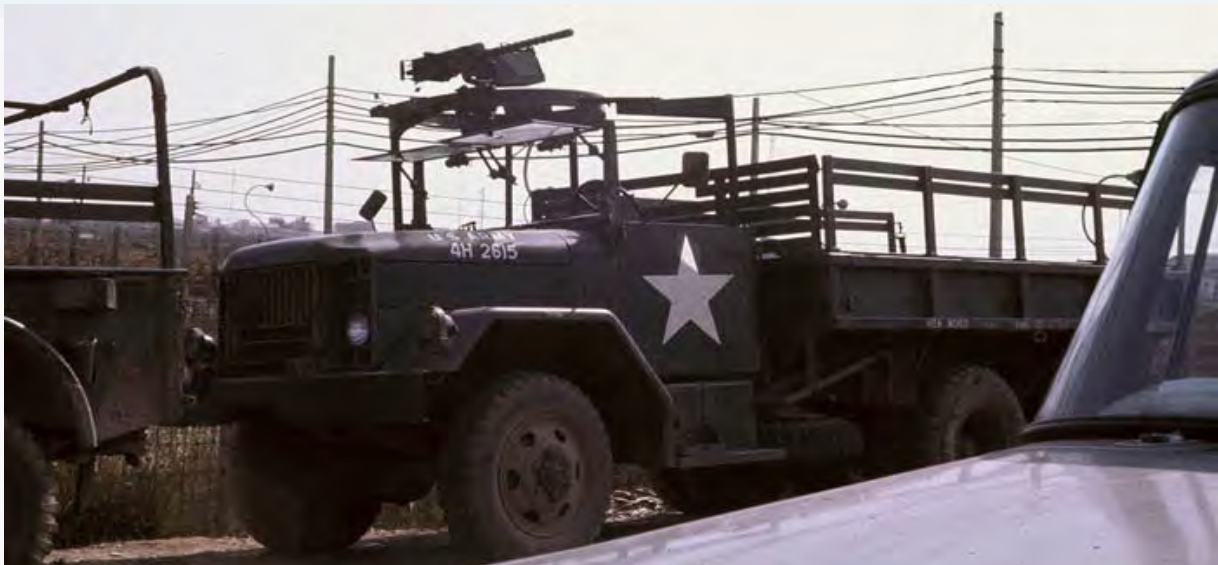
37. Tan Son Nhut AB, Convoy Truck with.50 cal. 1966-1968.