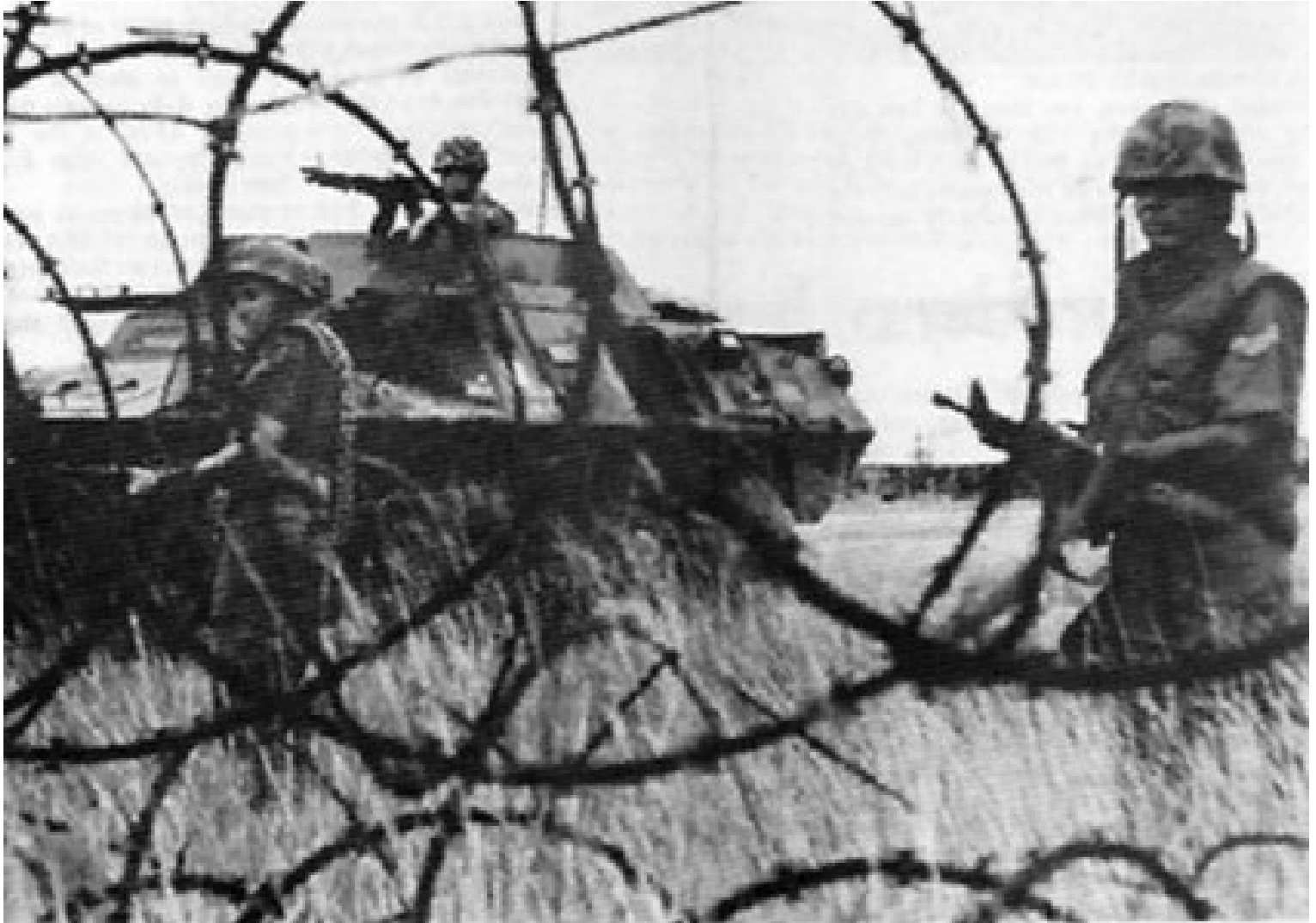
28. SEVENTH AIR FORCE PHOTO - 377th SPS: Tân Sơn Nhứt AB: V100, SAT HW, searching for concealed NVA/VC, morning of Tet 1968.