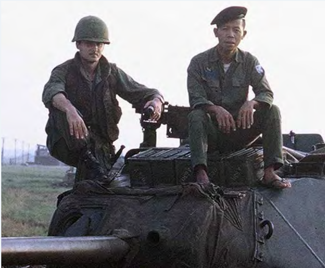
33. Tan Son Nhut AB, 377th Security Police and ARVN tanks, with.50 cal. Note perimeter bunker, center-left. 1968.