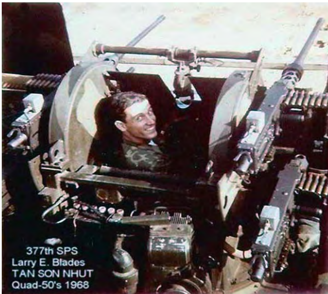
5. Tan Son Nhut AB, Security Police SAT Heavy Weapons, Quad-50s. 1968.