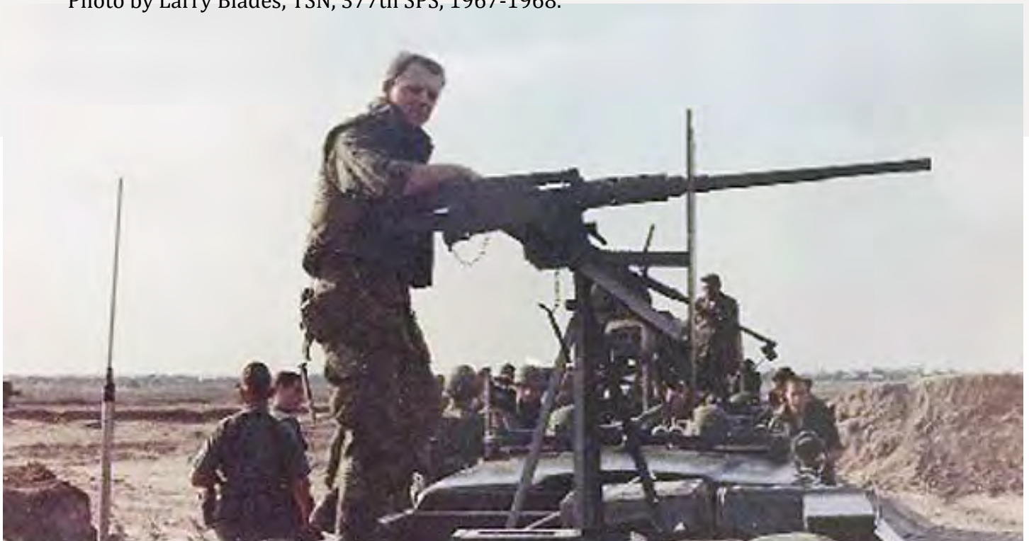
18. Tan Son Nhut AB, 377th SPS Special Weapons Unit Convoy, test firing.50-cal. 1968.