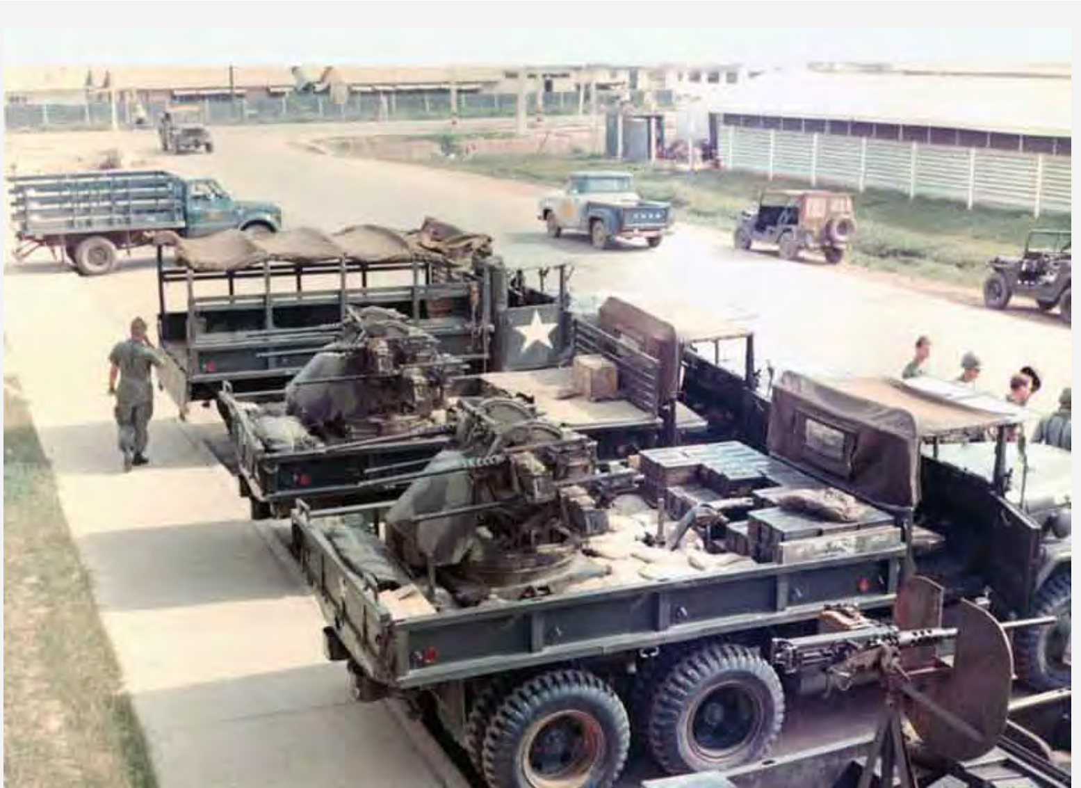
3. Tan Son Nhut AB, US ARMY Heavy Weapons, Quad-50s. 1965-1968.