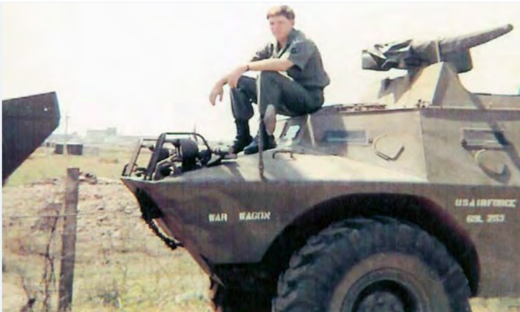
35. V-100 USAF "WAR WAGON".