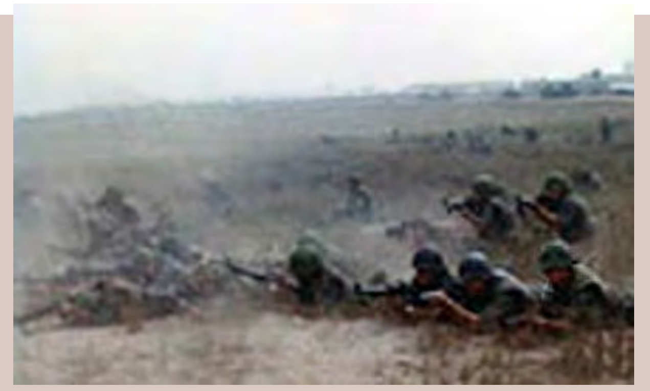
2. Tân Sơn Nhứt AB, 377th Security Police, engaging NVA/VC during Base Defense, Tet 1968.