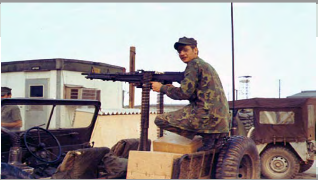
5. Tân Sơn Nhứt AB, 377th Security Police, engaging NVA/VC during Base Defense, Tet 1968.