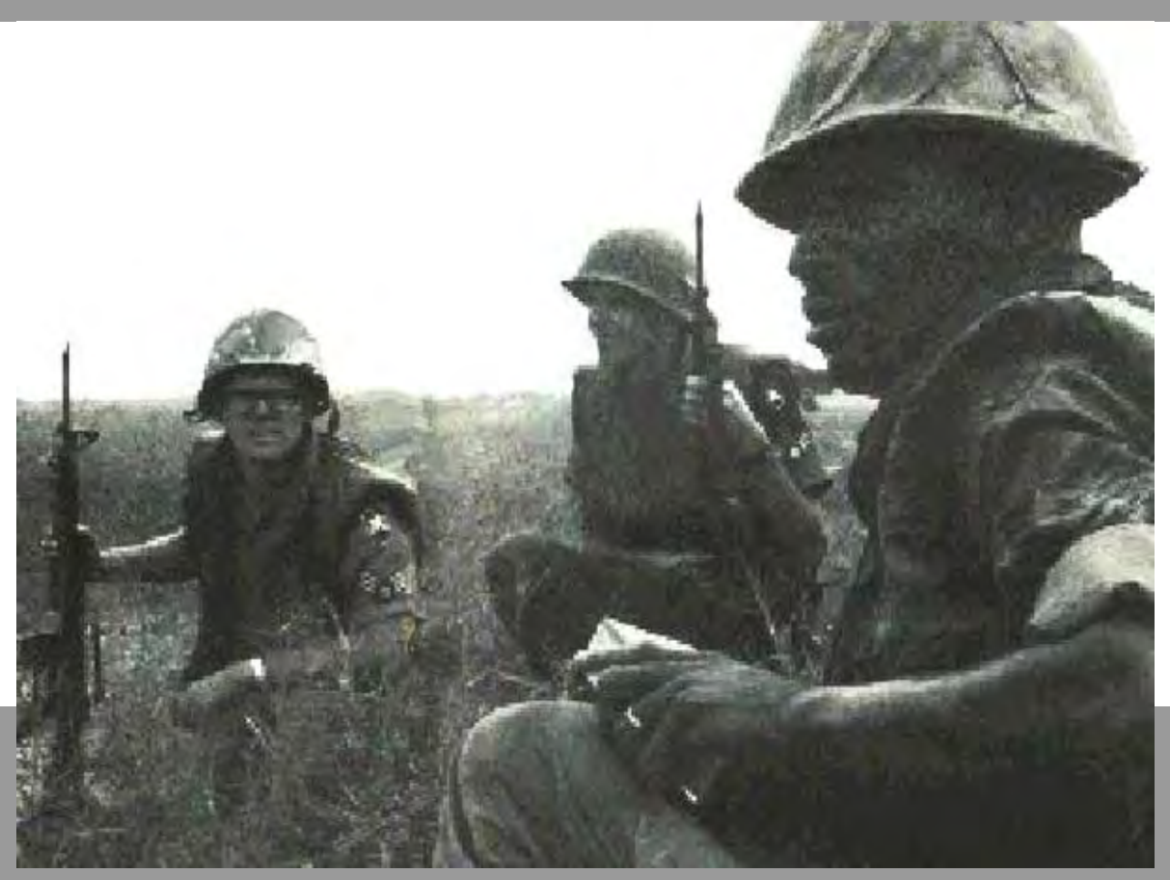
4. Tân Sơn Nhứt AB, 377th Security Police, engaging NVA/VC during Base Defense, Tet 1968.