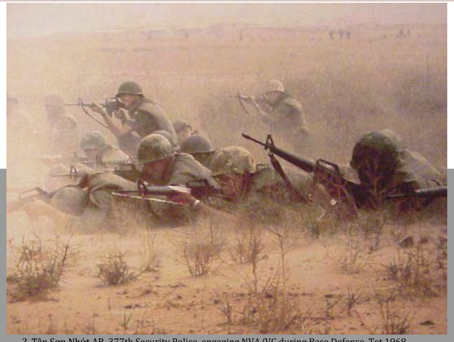
3. Tân Sơn Nhứt AB, 377th Security Police, engaging NVA/VC during Base Defense, Tet 1968.