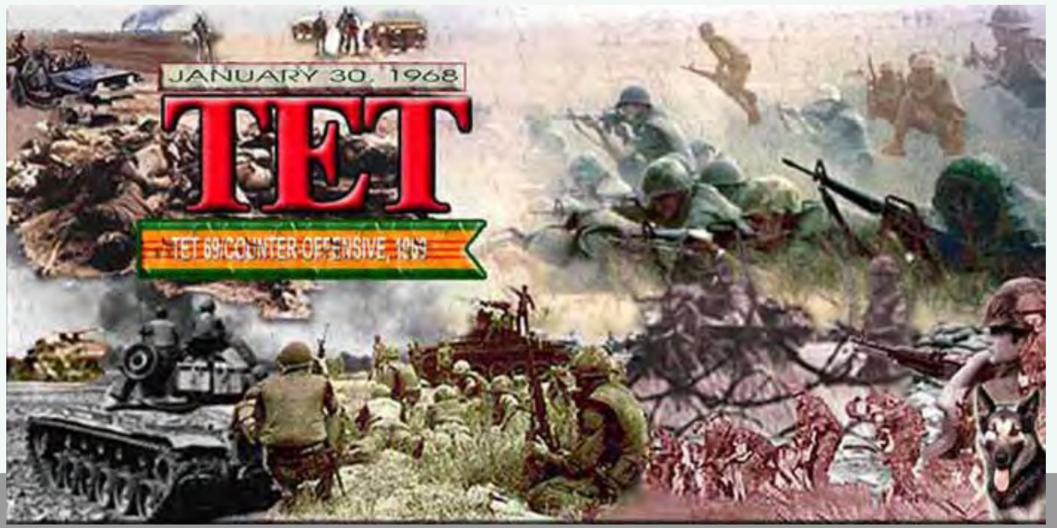
1. Tân Sơn Nhứt AB, Security Police Heavy Weapons, Tet 1968.