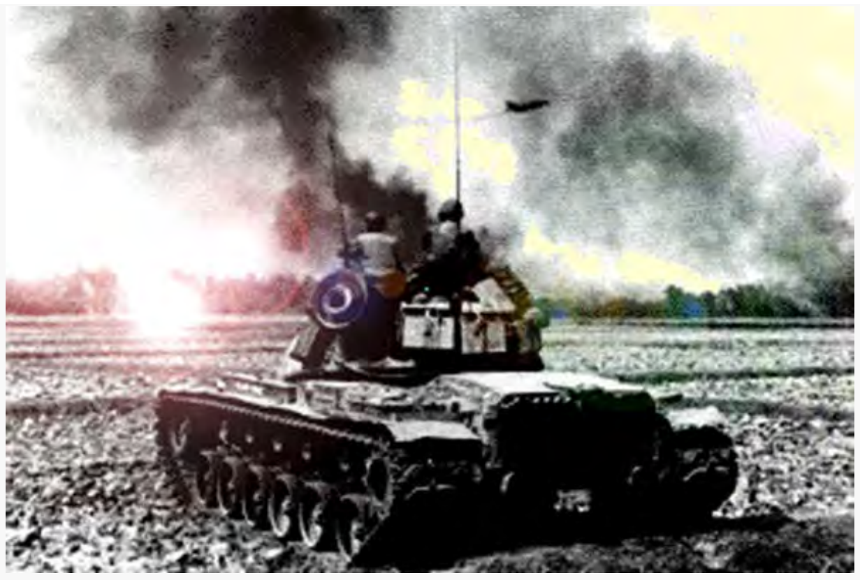
11. Tân Sơn Nhứt AB, US Army 25th Infantry armor arrive morning of Tet 1968.