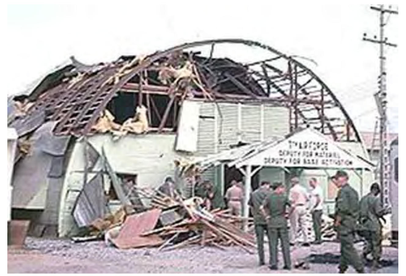
14. Supply headquarters hit by a rocket.