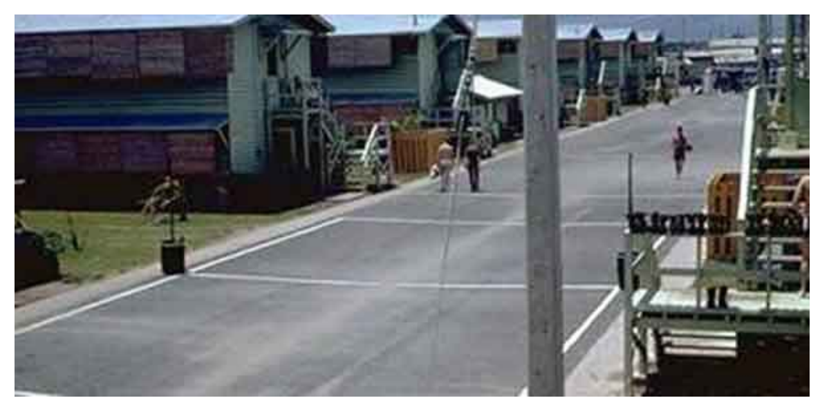
20. SP barracks in Oct 1968.