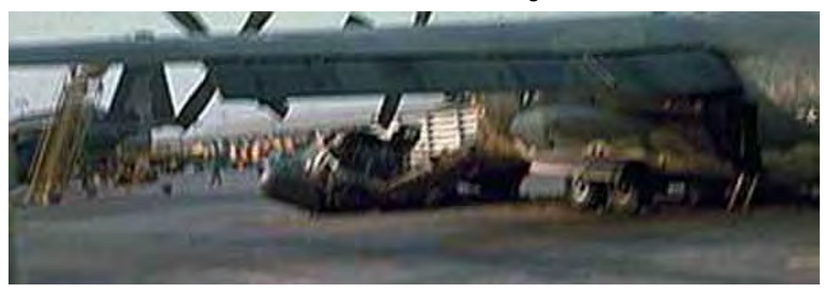
26. C-130 with it's nose blown off.