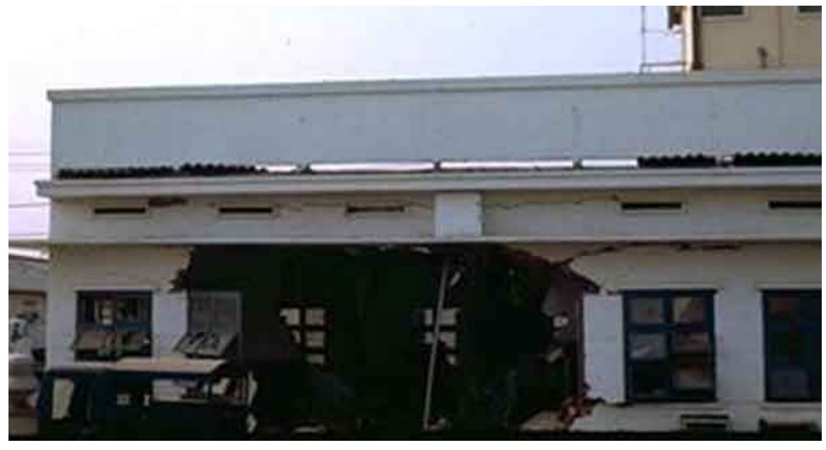
21. Tower hit by rockets