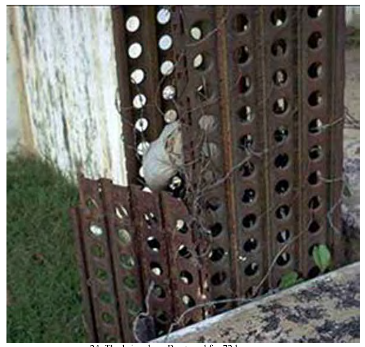
24. The brig where Be stayed for 72 hours.