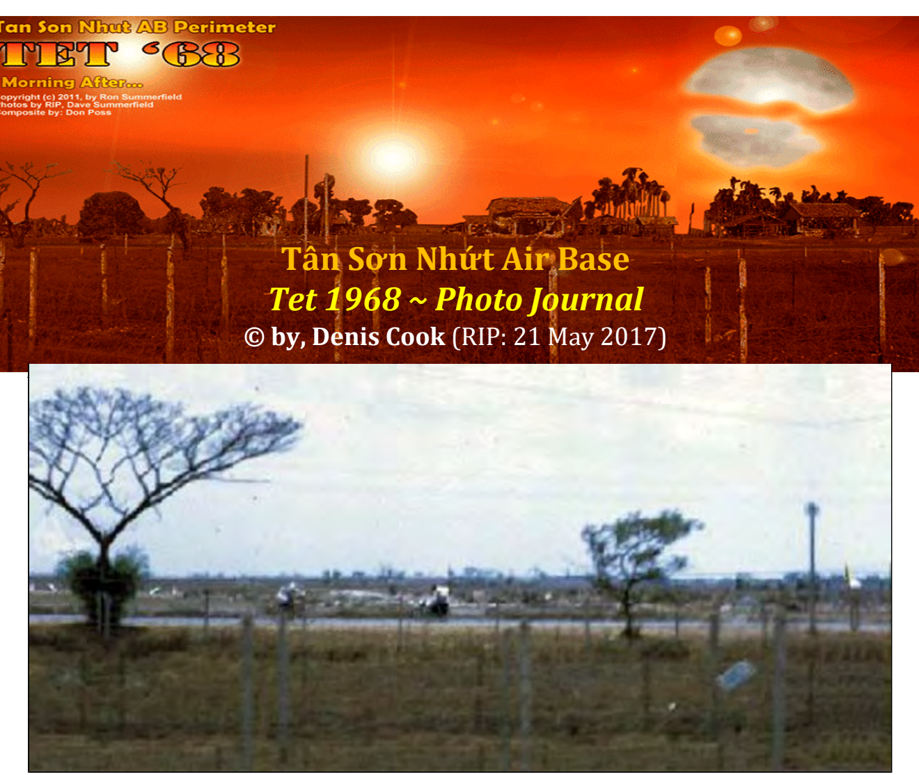
1. TSN Perimiter at Highway 1, just north of 051 gate. 100 yards.