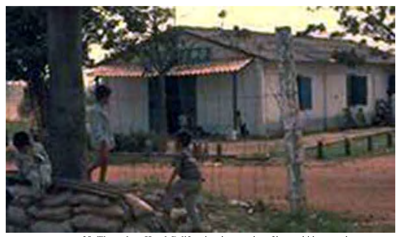
28. The pub at Hotel California, always a lot of happy kids around.