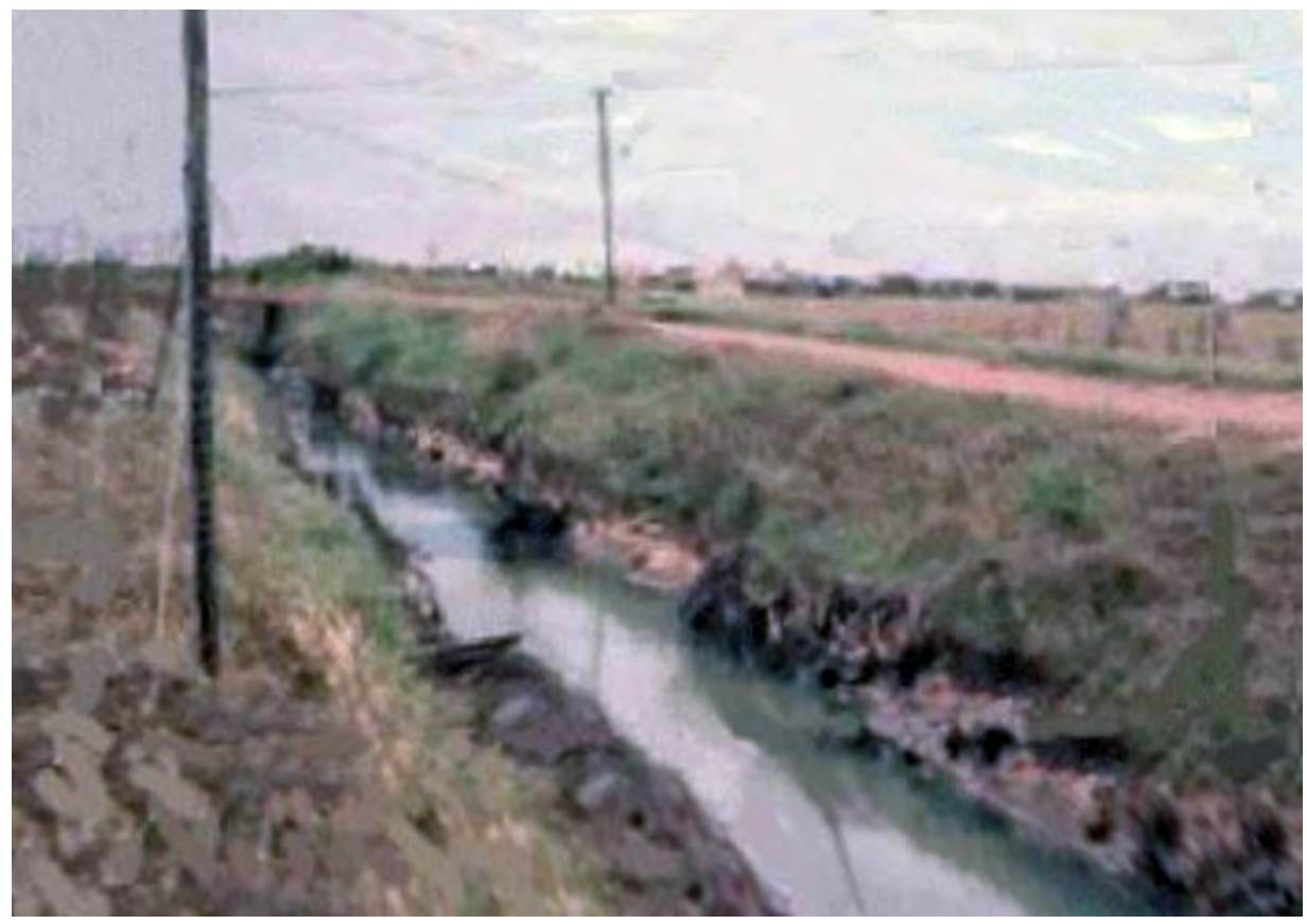
17. Utah Ditch: looking from the fence-line into the base.