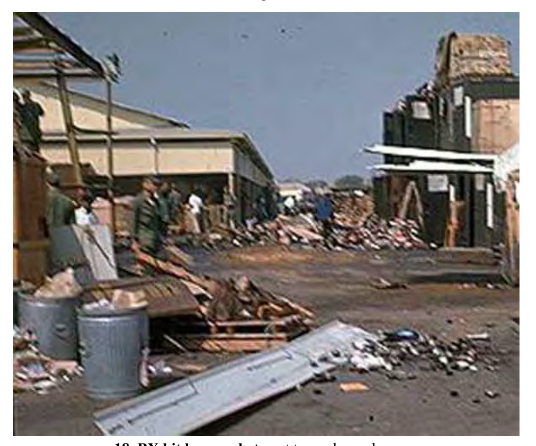
18. BX hit by a rocket next to my barracks.