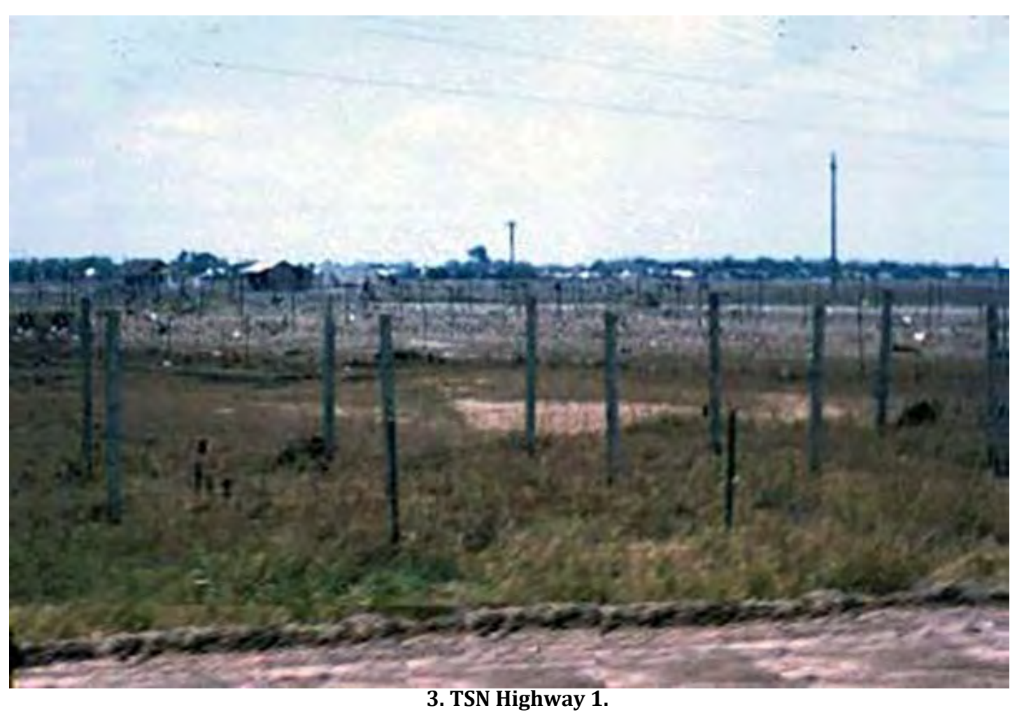
3. TSN Highway 1. (Photos 1,2,3,5 & 6 were taken several days after TET)