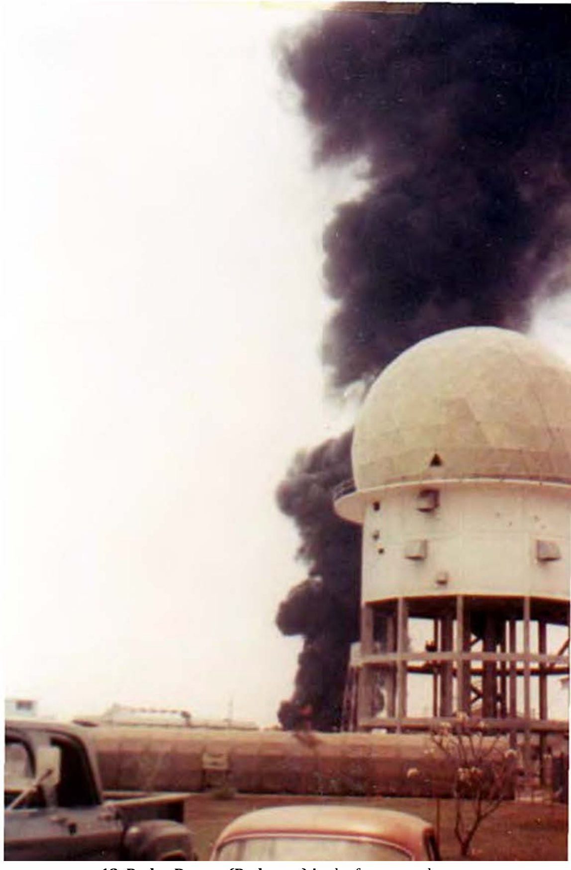
12. Radar Domes (Radomes) i n the foreground, rocket's impact burns furiously nearby. TET 1968.