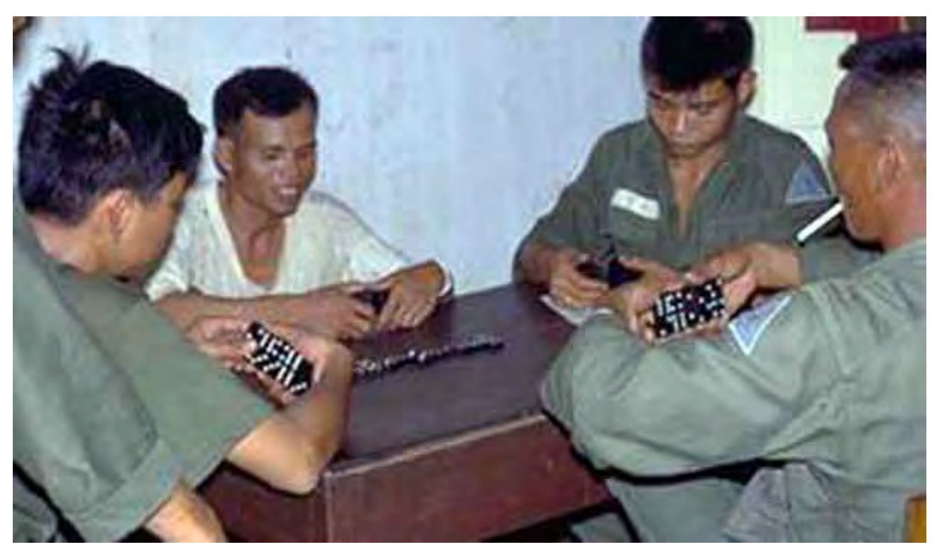
27. A dominos game in progress.