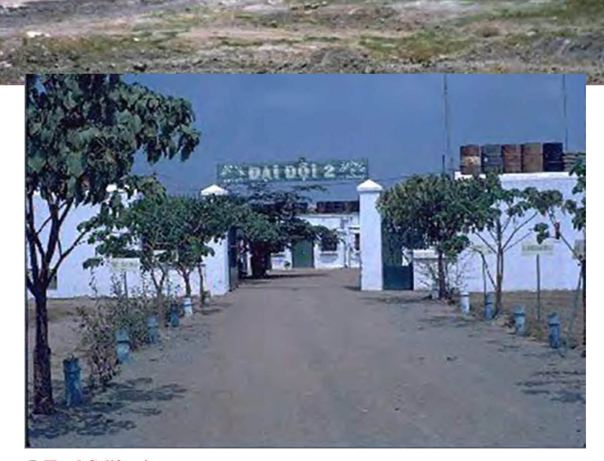
7. Hotel California.