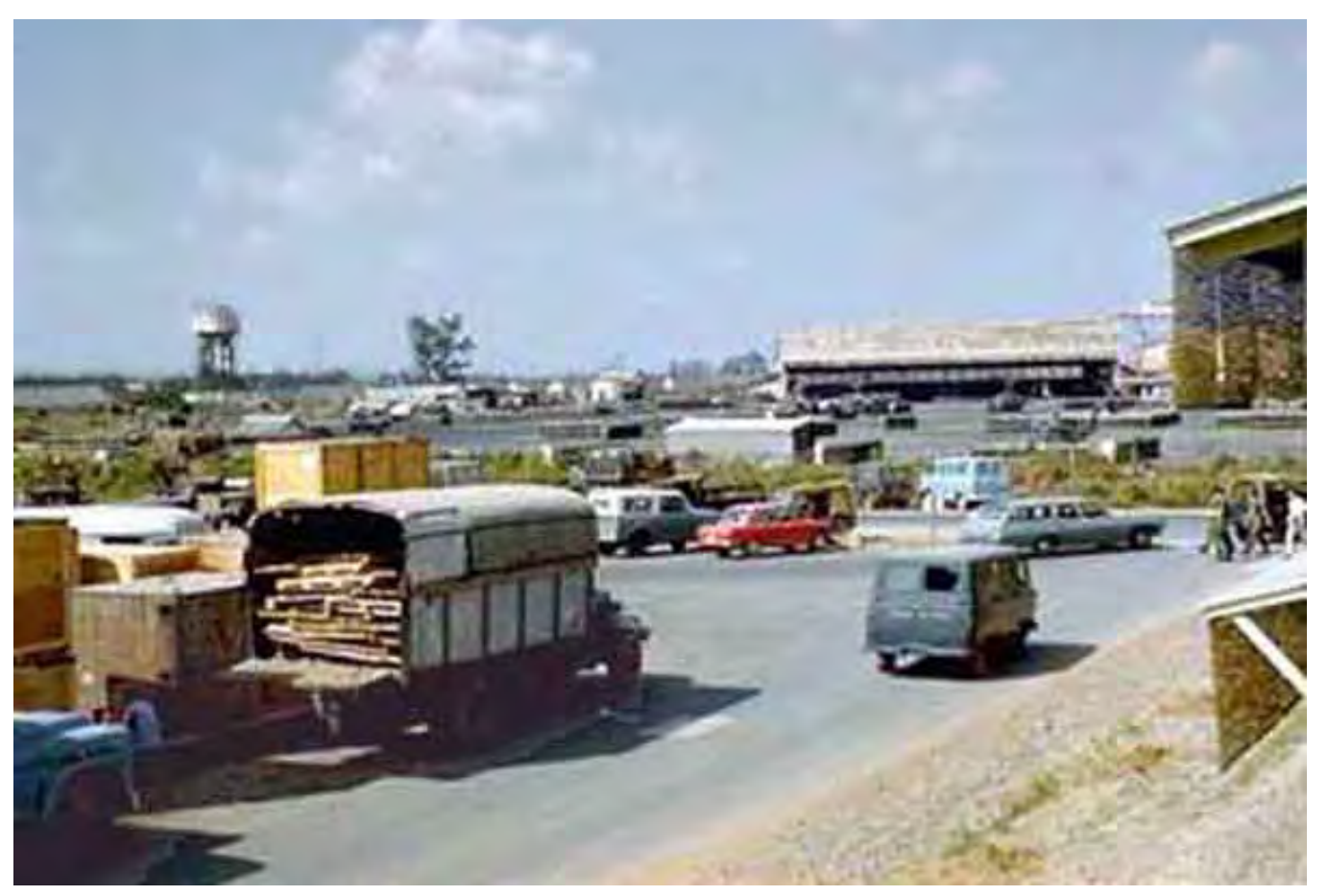
9. Hotel-3 just across from the SPS barracks area.