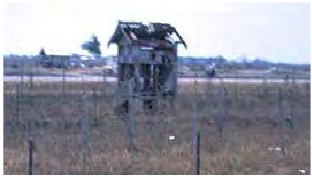
8. The Air Base shed just north of 051 gate, took many hits in the battle. Looking from my barracks toward Hotel-3 helicopter pad.