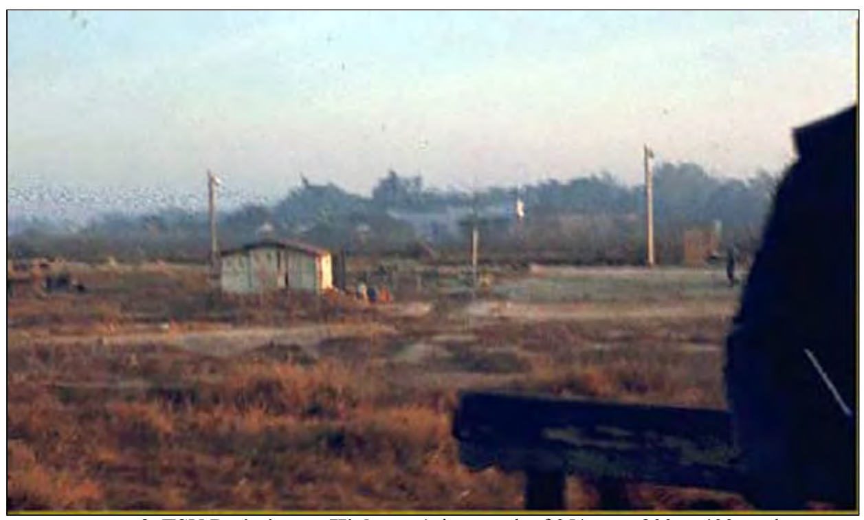
2. TSN Perimiter at Highway 1, just north of 051 gate. 200 to 400 yards.