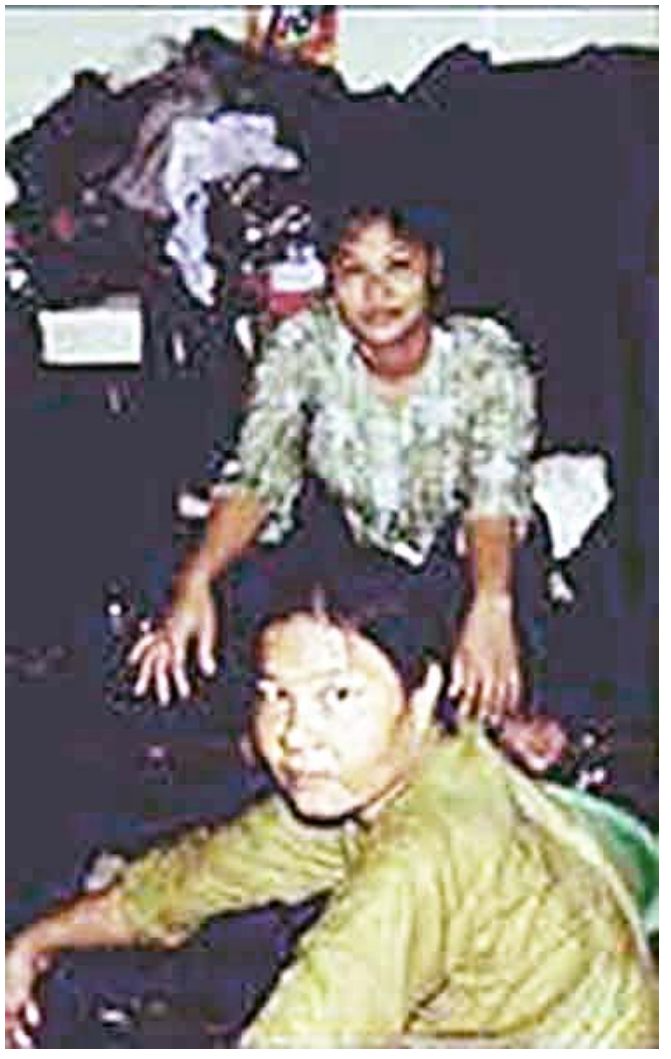
23. Mamasan and Babysan, doing the wash--note the Box of Tide at the top.