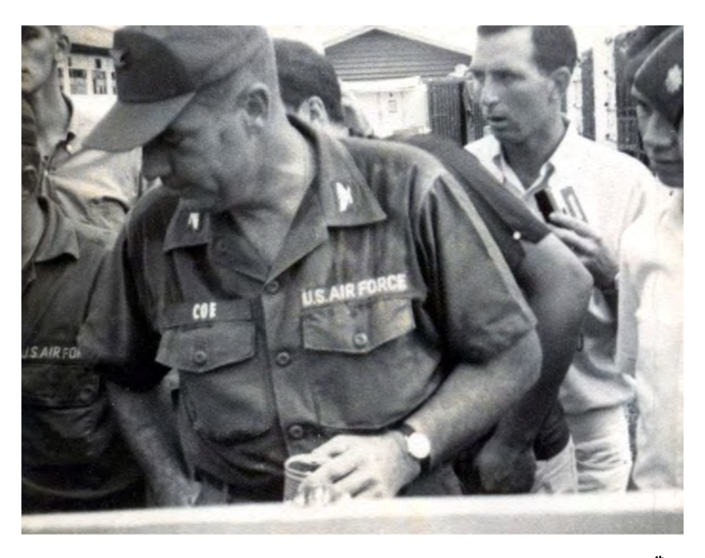
Col Grover K. Coe, Base Commander, chats it up with the men of the 377^{\text{th}} Security Police Squadron.