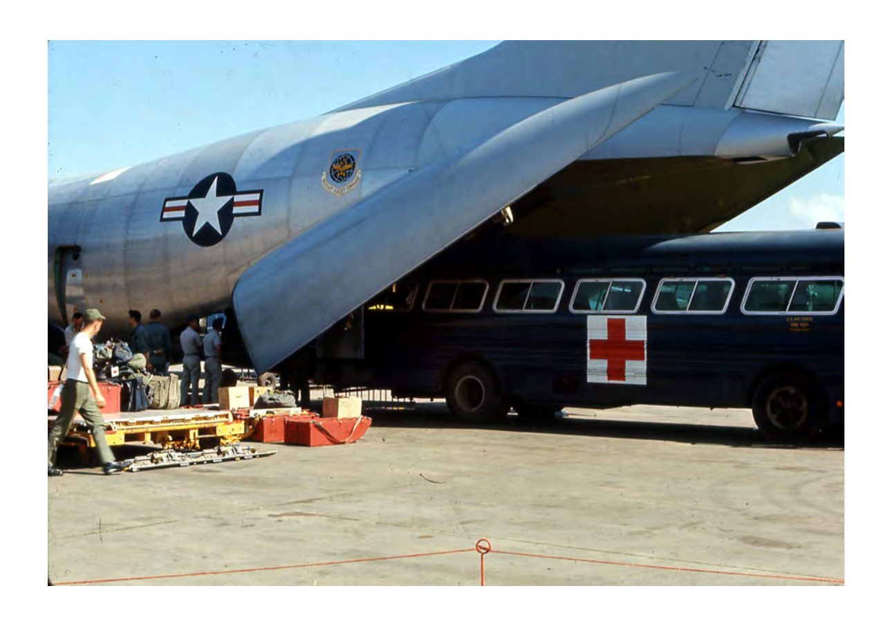
Closer view of the medivac aircraft.