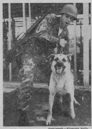
Sentry and dog: A near disaster

In the aftermath of the raid on Tan Son Nhut and the other attacks in Sai-