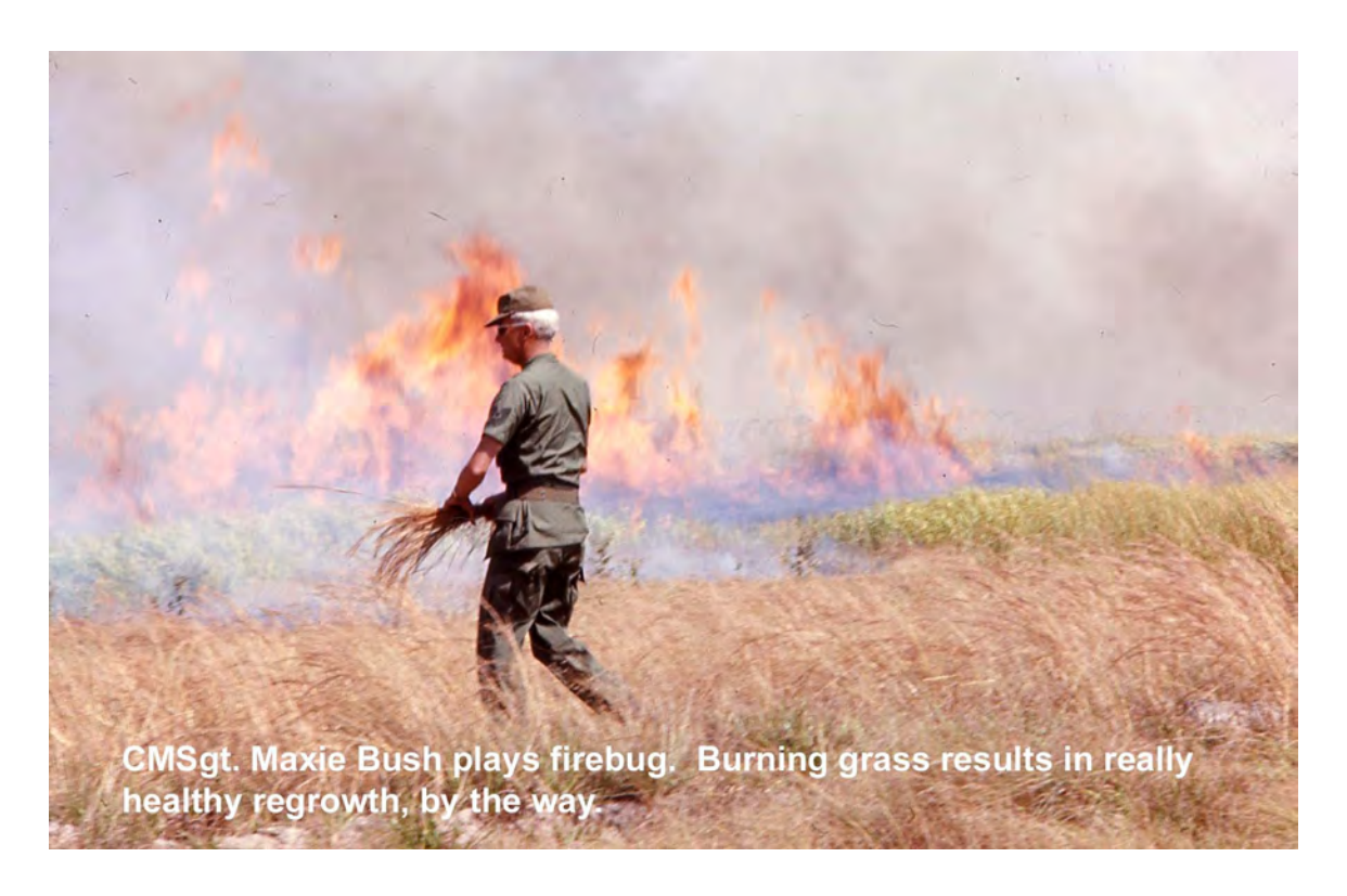
The words imprinted on the photograph says it all.