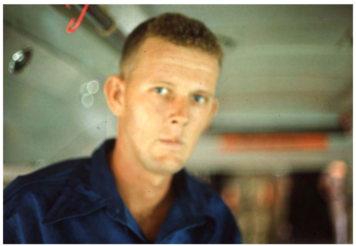
One of the injured airmen of the 377<sup>th</sup> Security Police Squadron enters one of the Medivac Aircraft to take him to either Japan or Germany for further treatment.