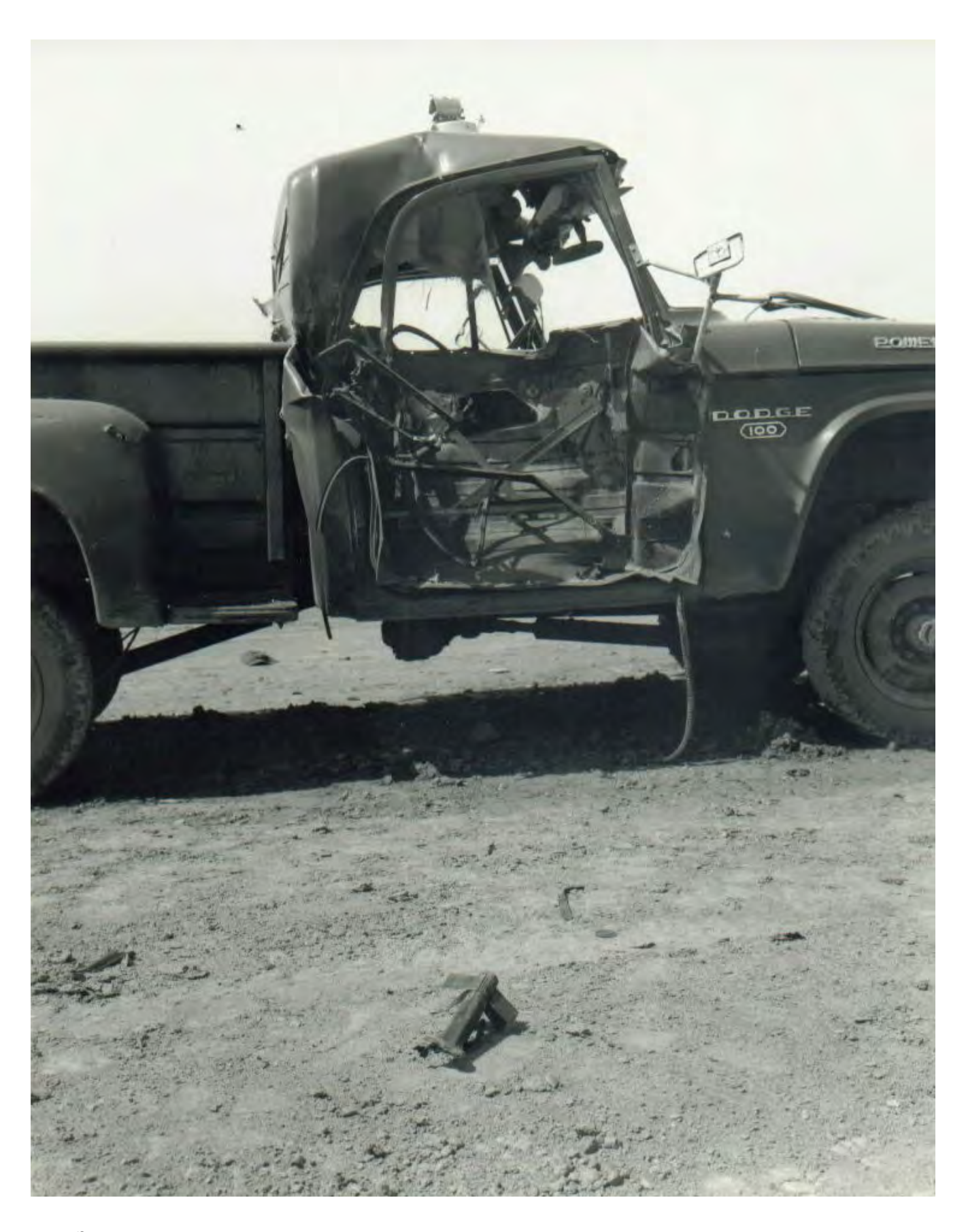
377<sup>th</sup> Air Police Squadron vehicle, used on Dec 4, 1966.