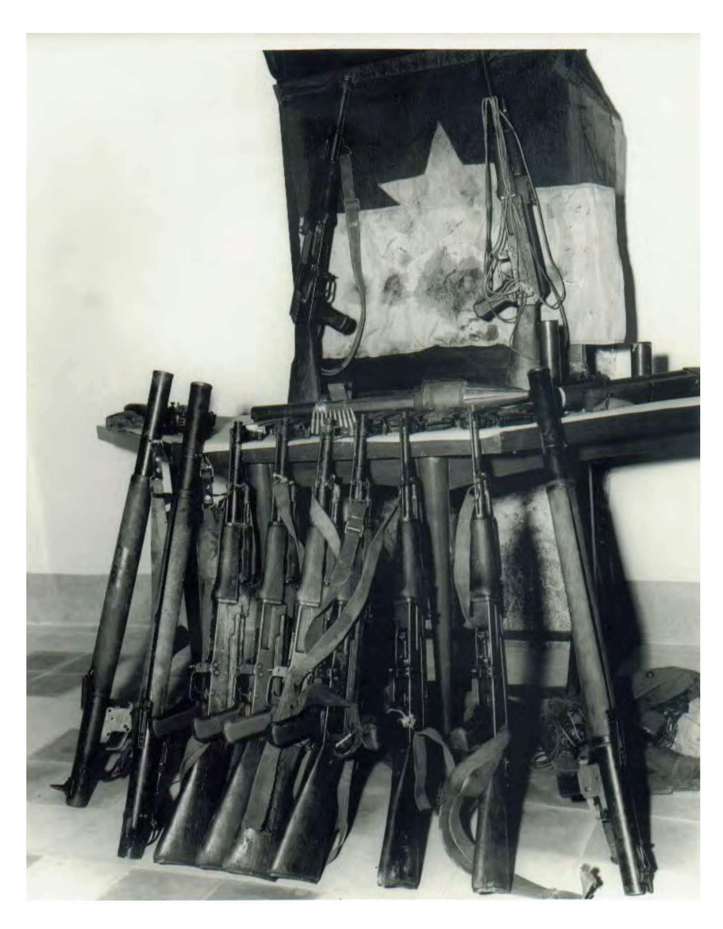
More weapons confiscated from the enemy, Dec 4, 1966.