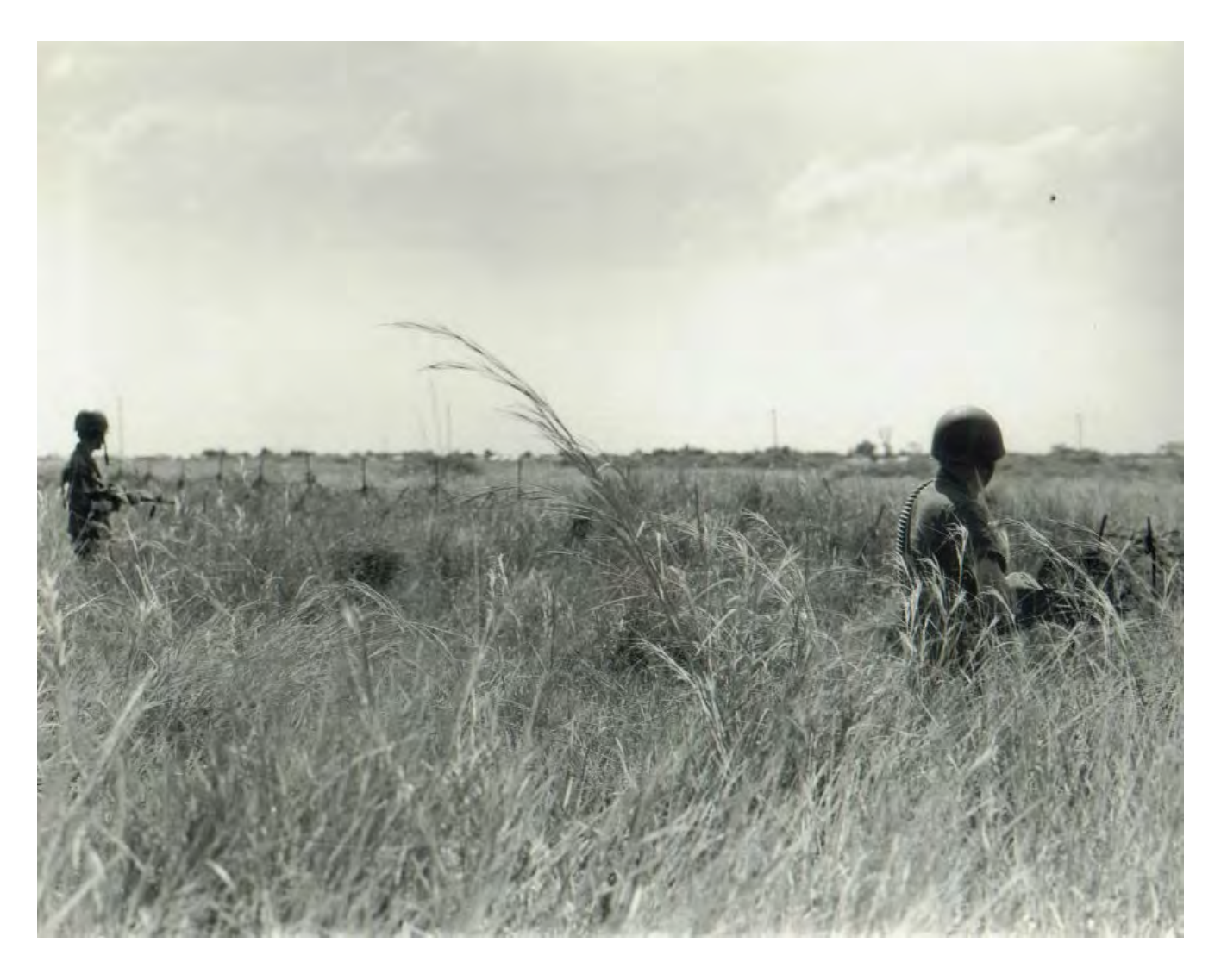
On the morning of Dec 5, 1966, men of the 377<sup>th</sup> Air Police Squadron make three seperate sweeps looking for additional enemy.