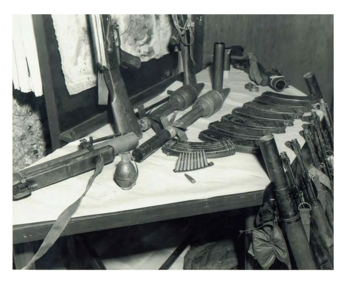
This photograph shows some of the enemy weapons confiscated after the Attack On Tan Son Nhut, Dec 4, 1966.