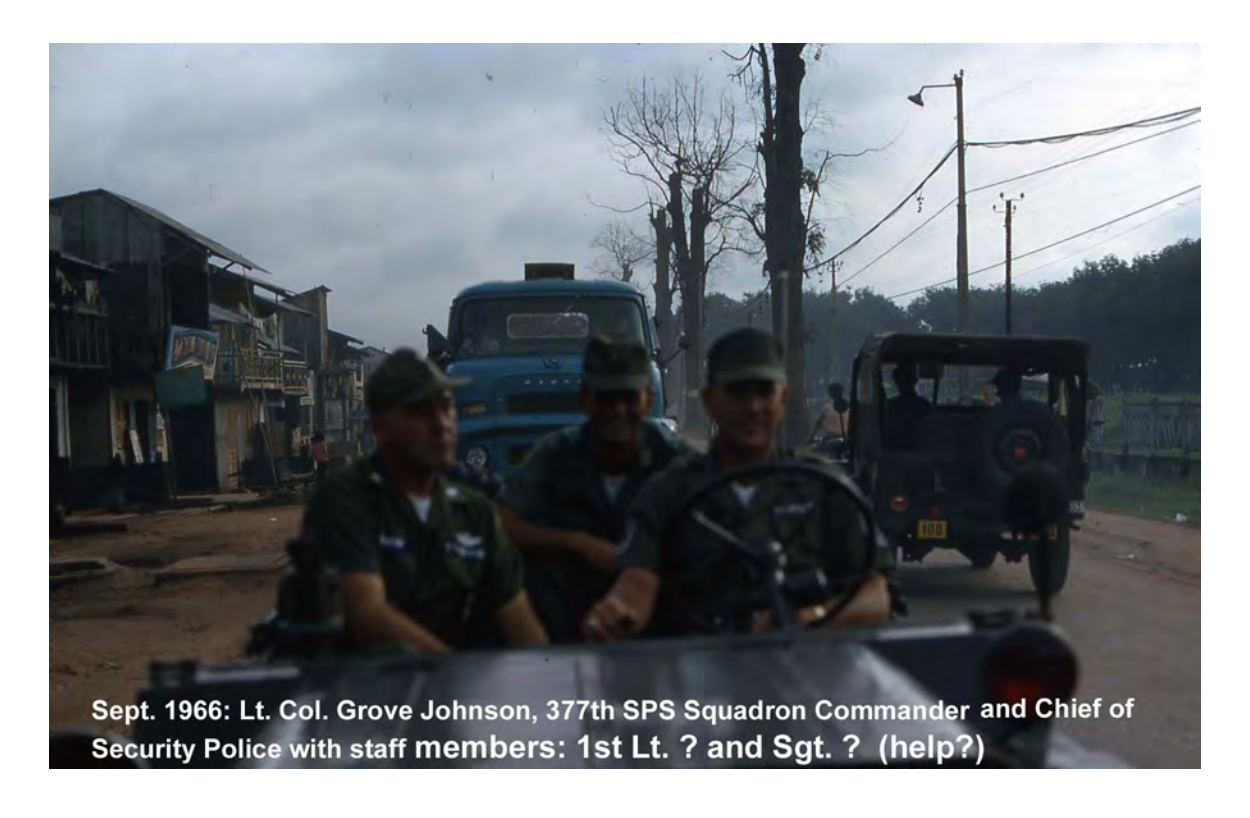
The information imprinted on the photograph says it all.