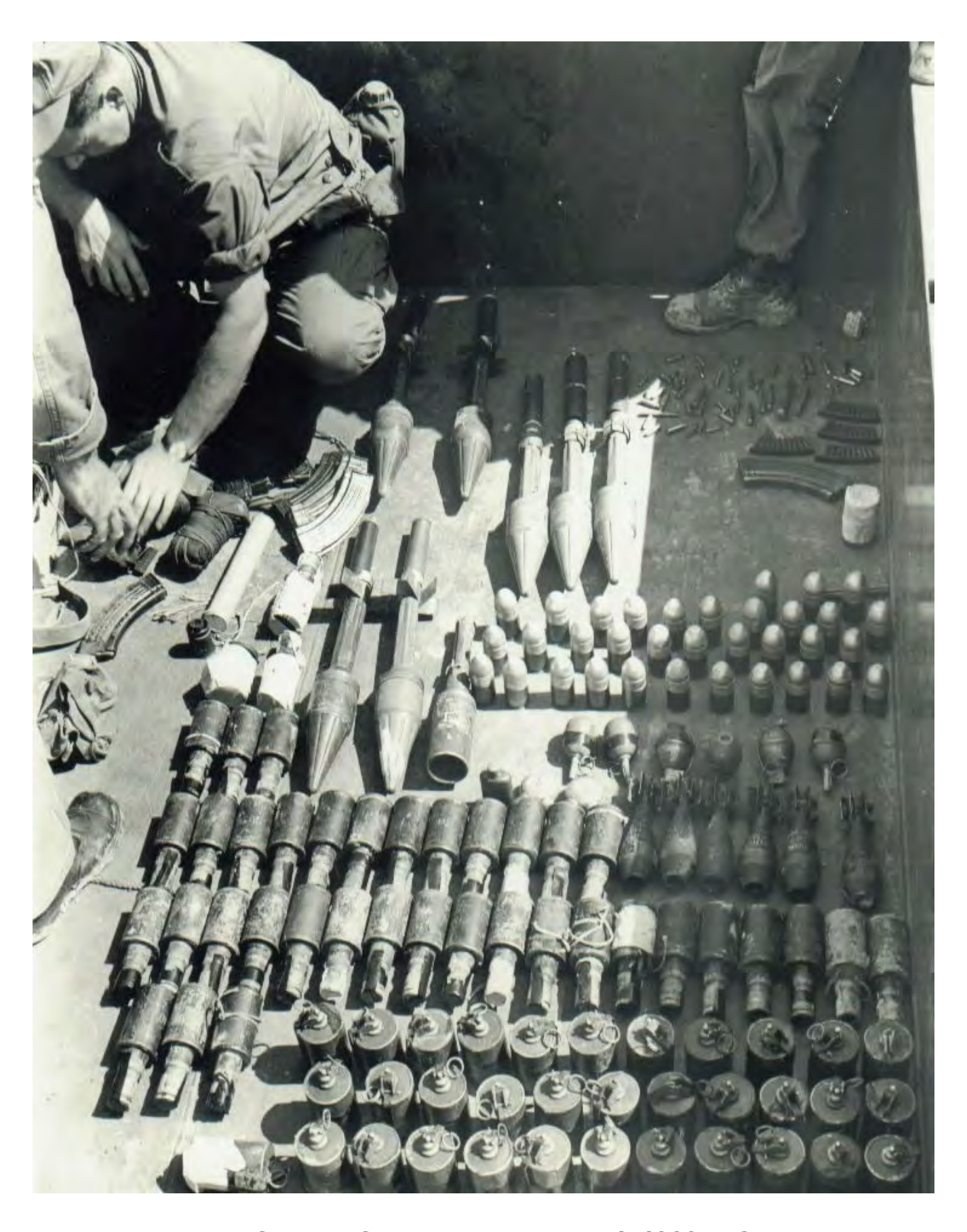
More weapons confiscated from the enemy, Dec 4, 1966. EOD personnel.