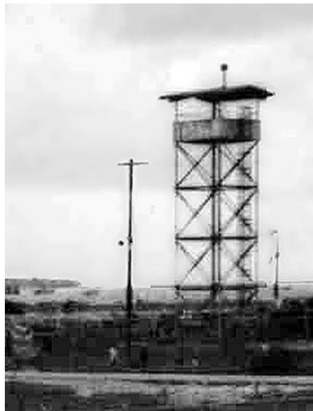
9. Tan My, Loran Station. Tower. Det-1. 1972.