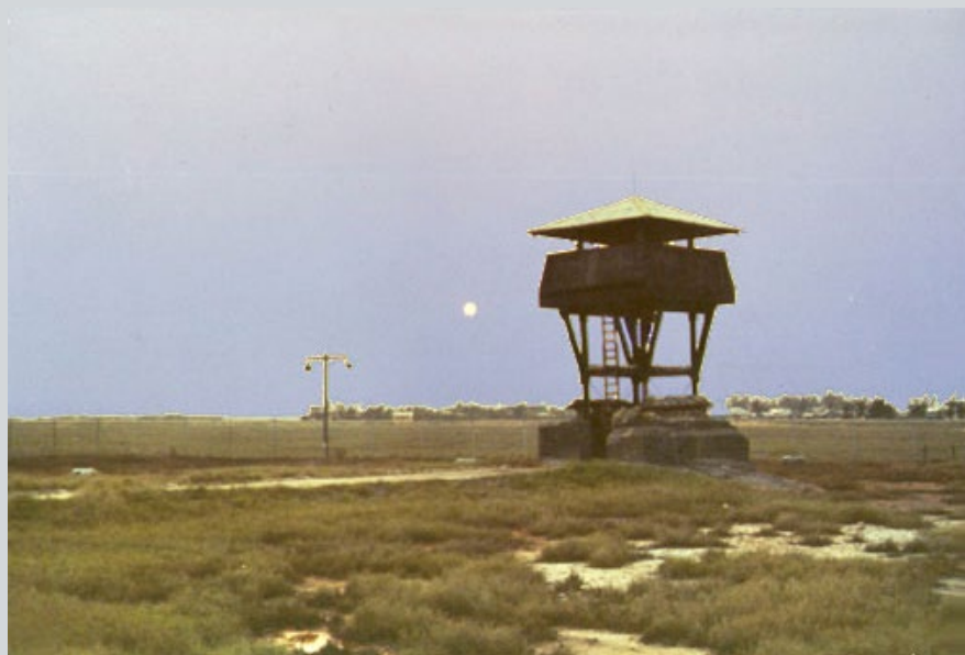
5. Tan My, Loran Station. Perimeter Tower. Det-1. 1971-1972.