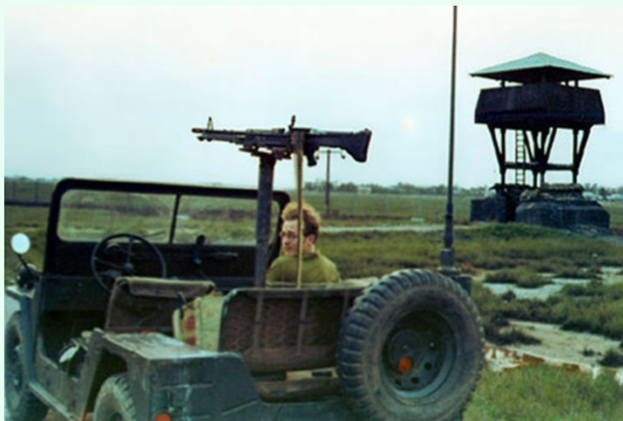
7. Tan My, Loran Station. Perimeter Tower and QRT Jeep. Det-1. 1971-1972.