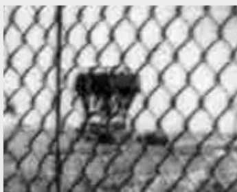
2. Tan My, Loran Station. Tower closeup. 1972.