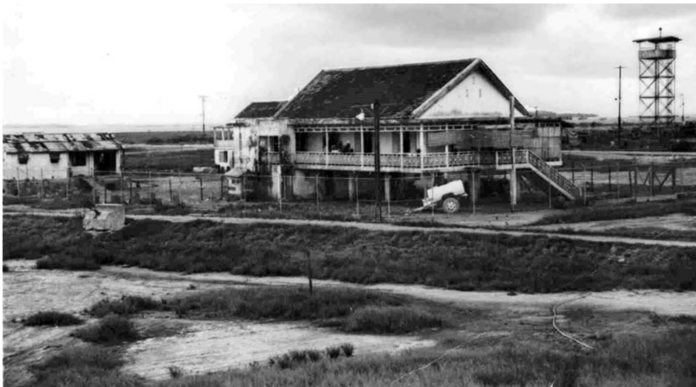
8. Tan My, Loran Station. Tower. Det-1. Foreground is the "Whoopie House." 1972.