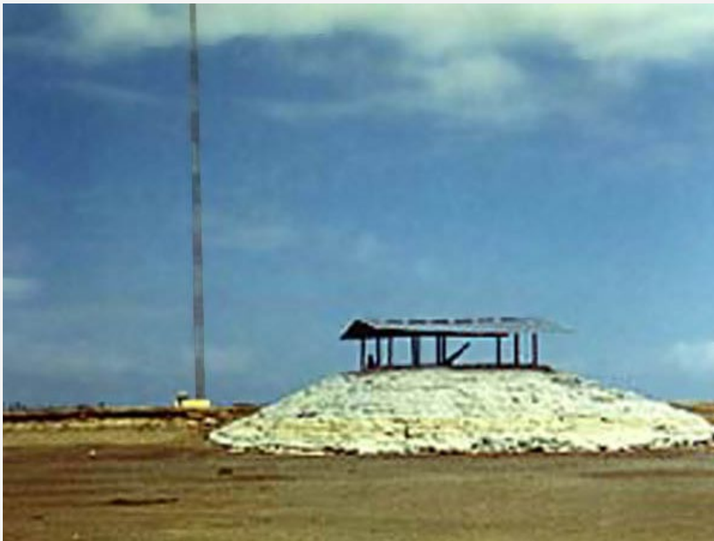
10. Tan My, Loran Station. Tower Bunker. Det-1.