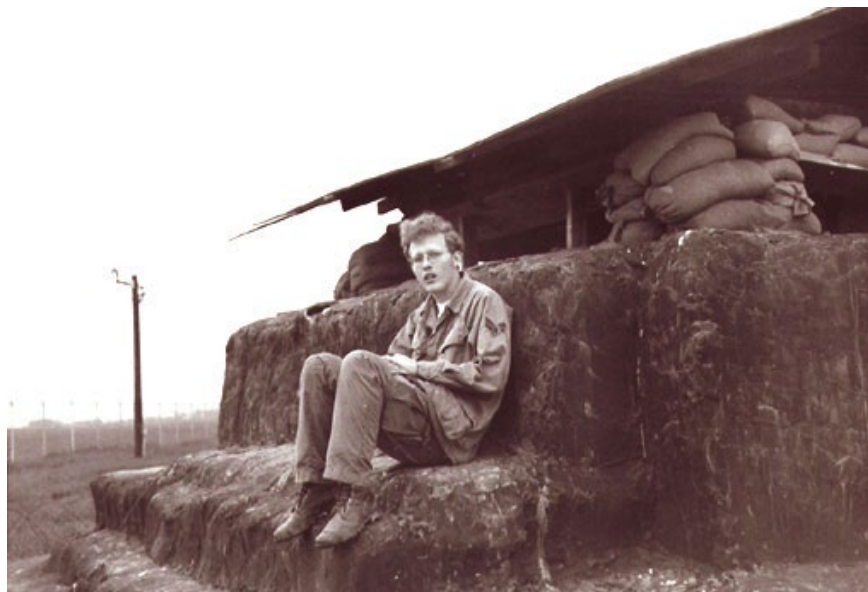
8. Tan My, Loran Station. Perimeter Bunker. Det-1. 1971-1972.