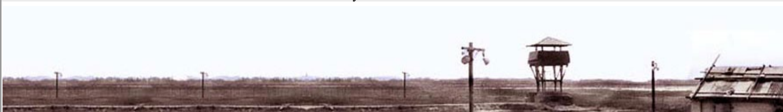
3. Tan My, Loran Station. Perimeter Tower. Det-1.