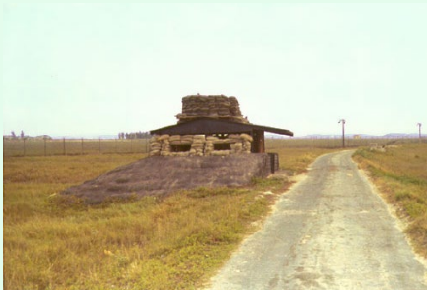
8. Tan My, Loran Station. Perimeter Bunker. Det-1. 1971-1972.