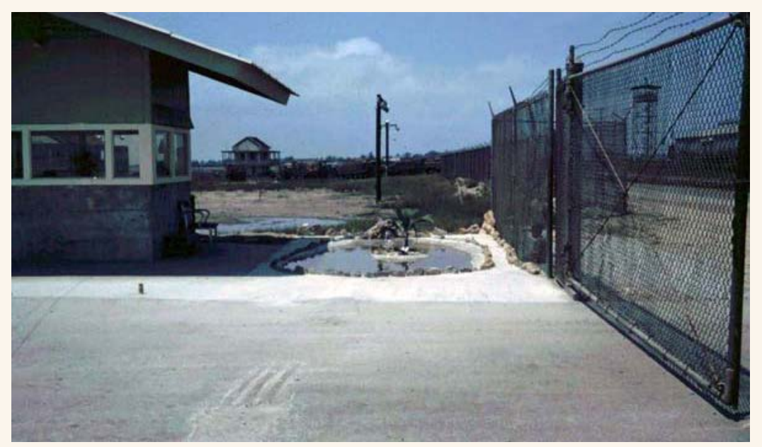
3. Cam Ranh Bay AB, Gate. Note the Tower through the sliding-gate. See anything unusual?