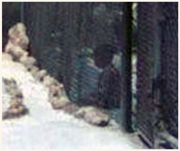
5. Cam Ranh Bay AB, Gate. Close up of child setting outside the fence line.