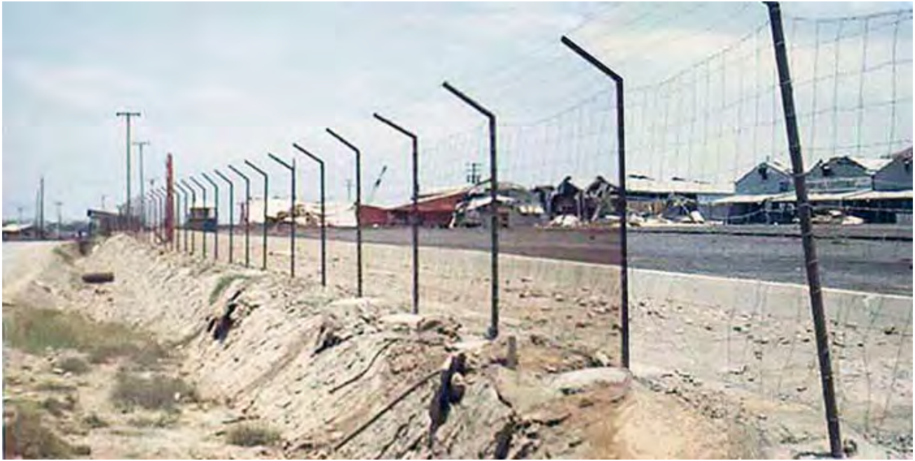
5. Đà Nẵng AB, 366th SPS. Perimeter fence cutting through civilization. Rocket damaged structures center-right.