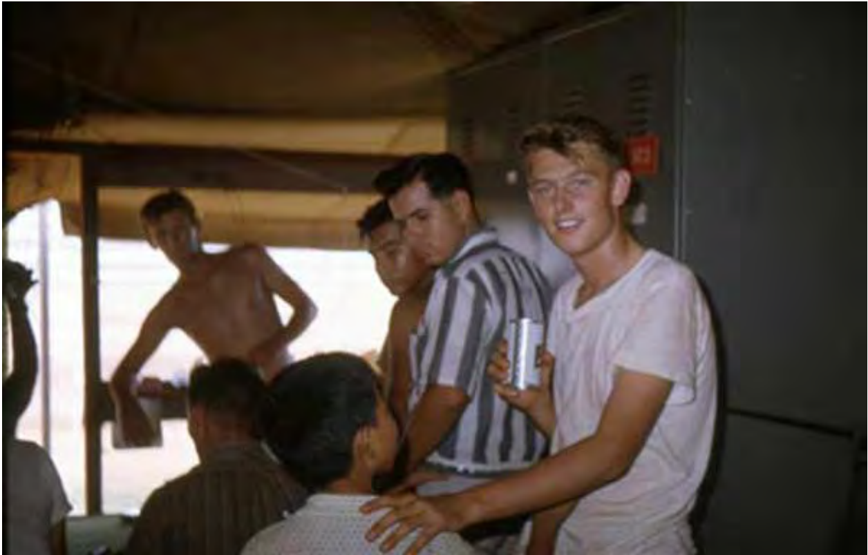
19. Đà Nẵng AB, 366th SPS. You Numba Tenthou... no Give me Beer!