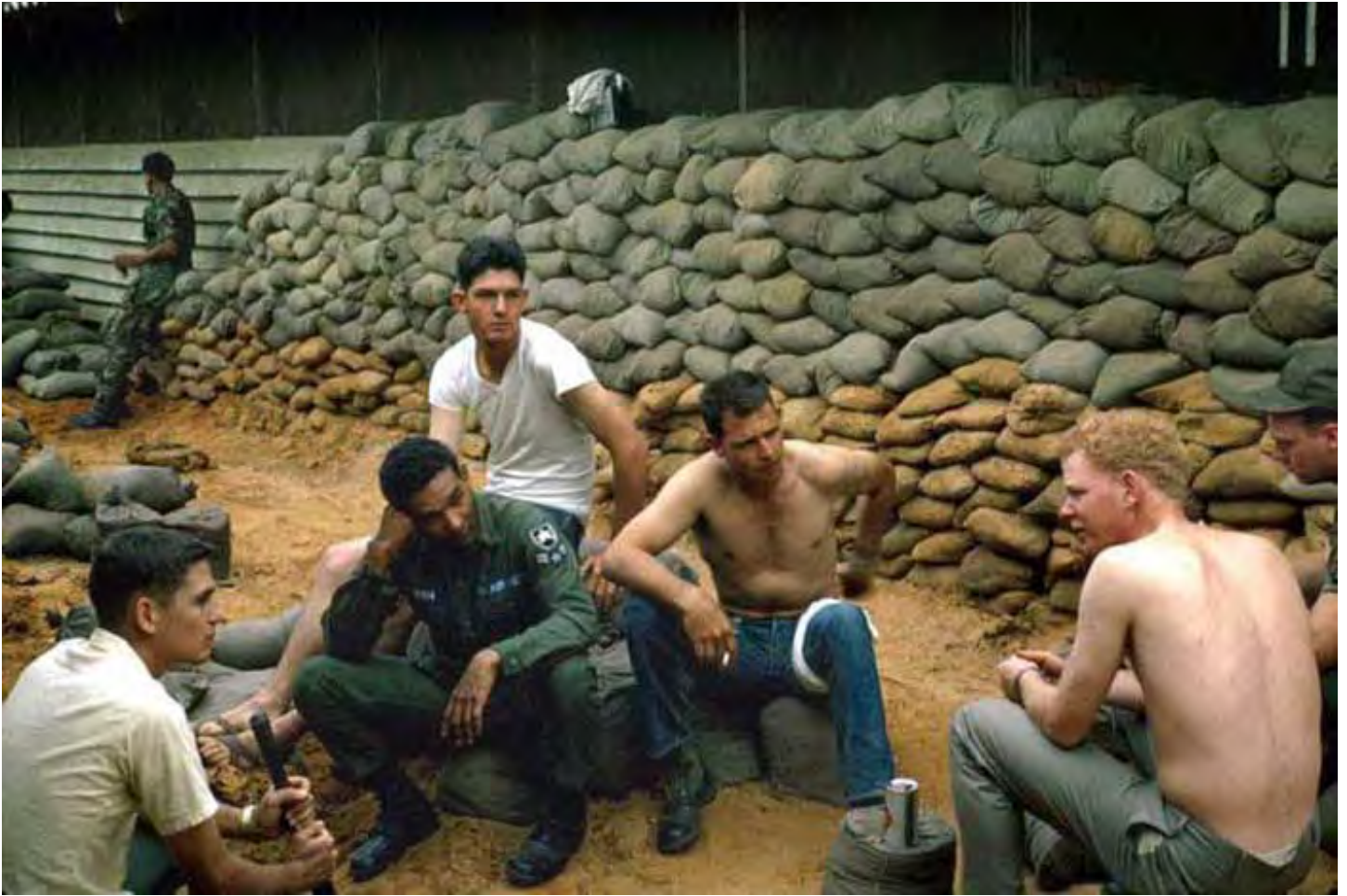
23. Đà Nẵng AB, 366th SPS. Hooch sandbag detail.