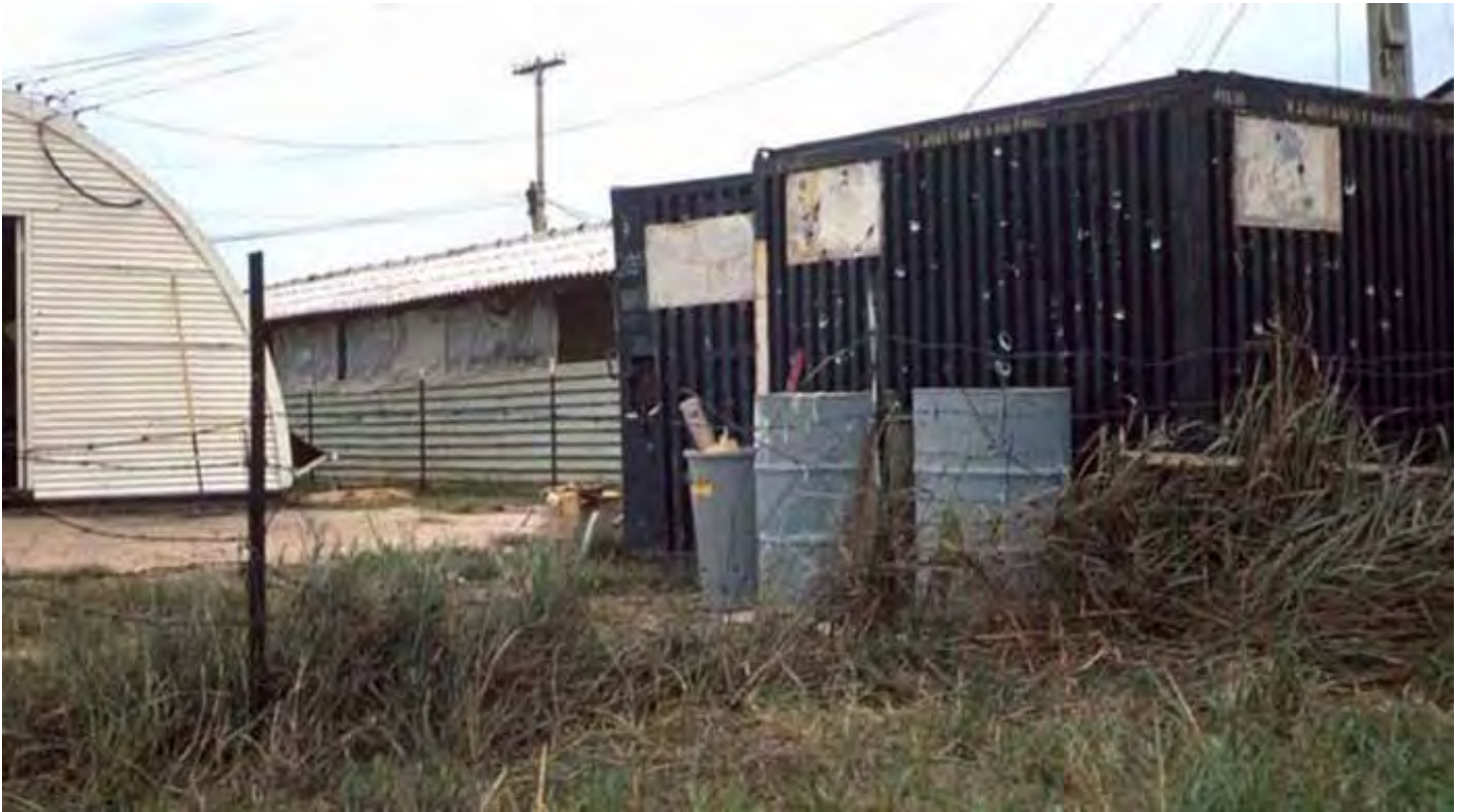
9. Đà Nẵng AB, 366th SPS. Rocket shrapnel peppers SP huts, quonset hut and storage containers, indifferent as always.