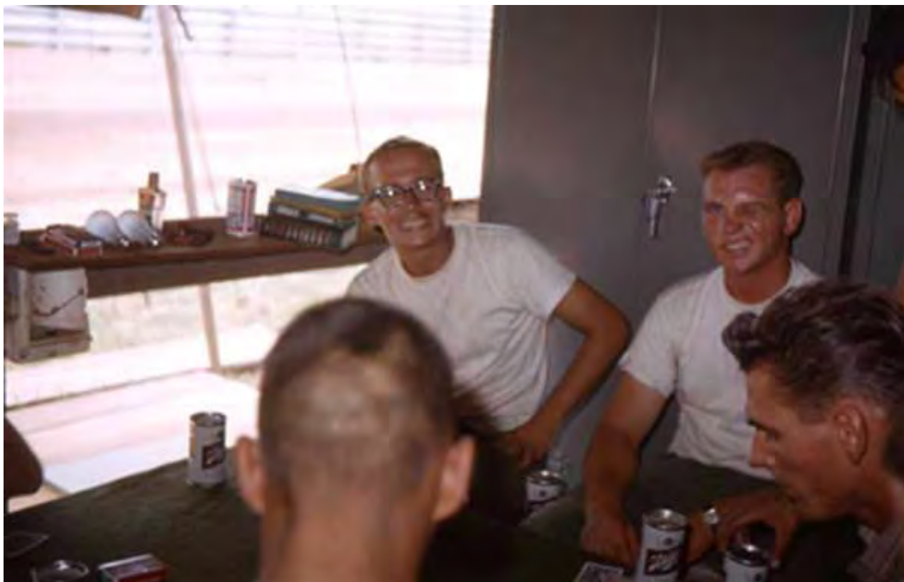
16. Da Nang AB, 366th SPS. Beer, Cards... Cards, Beer. Too hot to sleep.