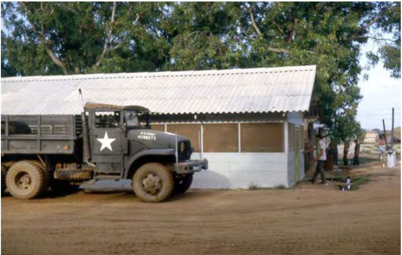
12. Đà Nẵng AB, 366th SPS. SP Tent City Chow Hall.