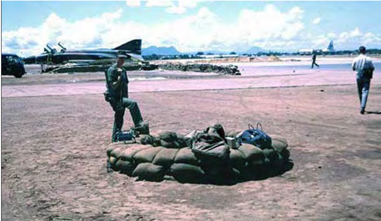
3. Đà Nẵng AB, 366th SPS. SP Post. No where to hide from a blistering sun. When the rains come the fighting-hole will fill with water. Last of the old sandbag revetments visible for F-4 Phantom parking.

Photo by: James Paul Mashburn 1966-1967.