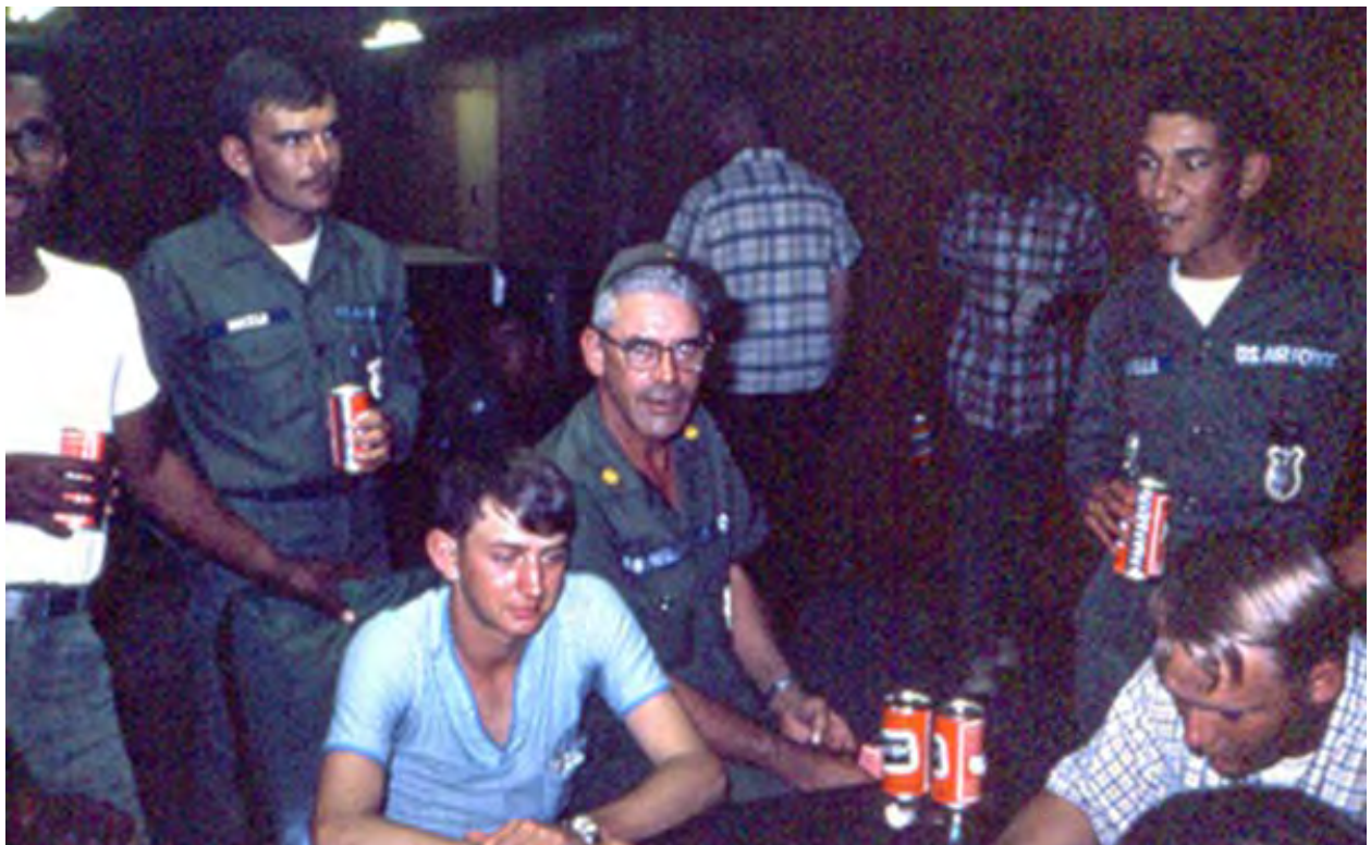
24. Đà Nẵng AB, 366th SPS. Day off.