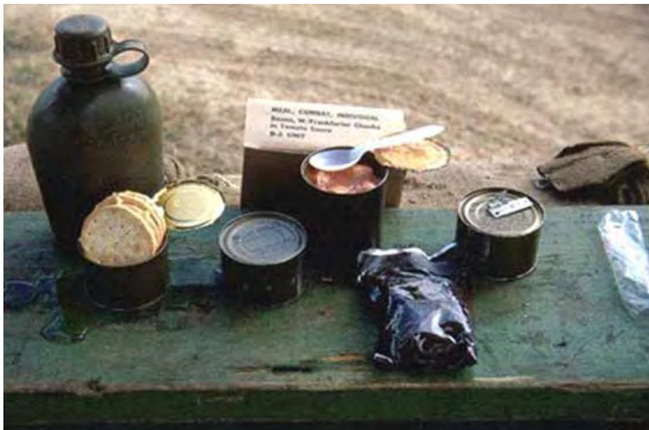
22. Đà Nẵng AB, 366th SPS. B2 unit, C-rats. Beans and Franks.