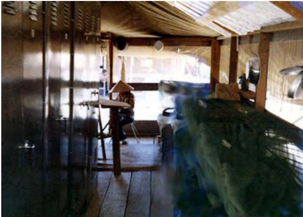
14. Đà Nẵng AB, 366th SPS. Tent City Mamasan working on boots (center).