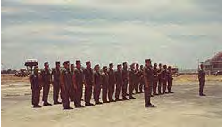
49. The commissioning of Tan My Loran Station, RVN, August 1969. In the foreground is the Coast Guard detachment, and in the rear is the U. S. Air Force detachment assigned to protect the site.