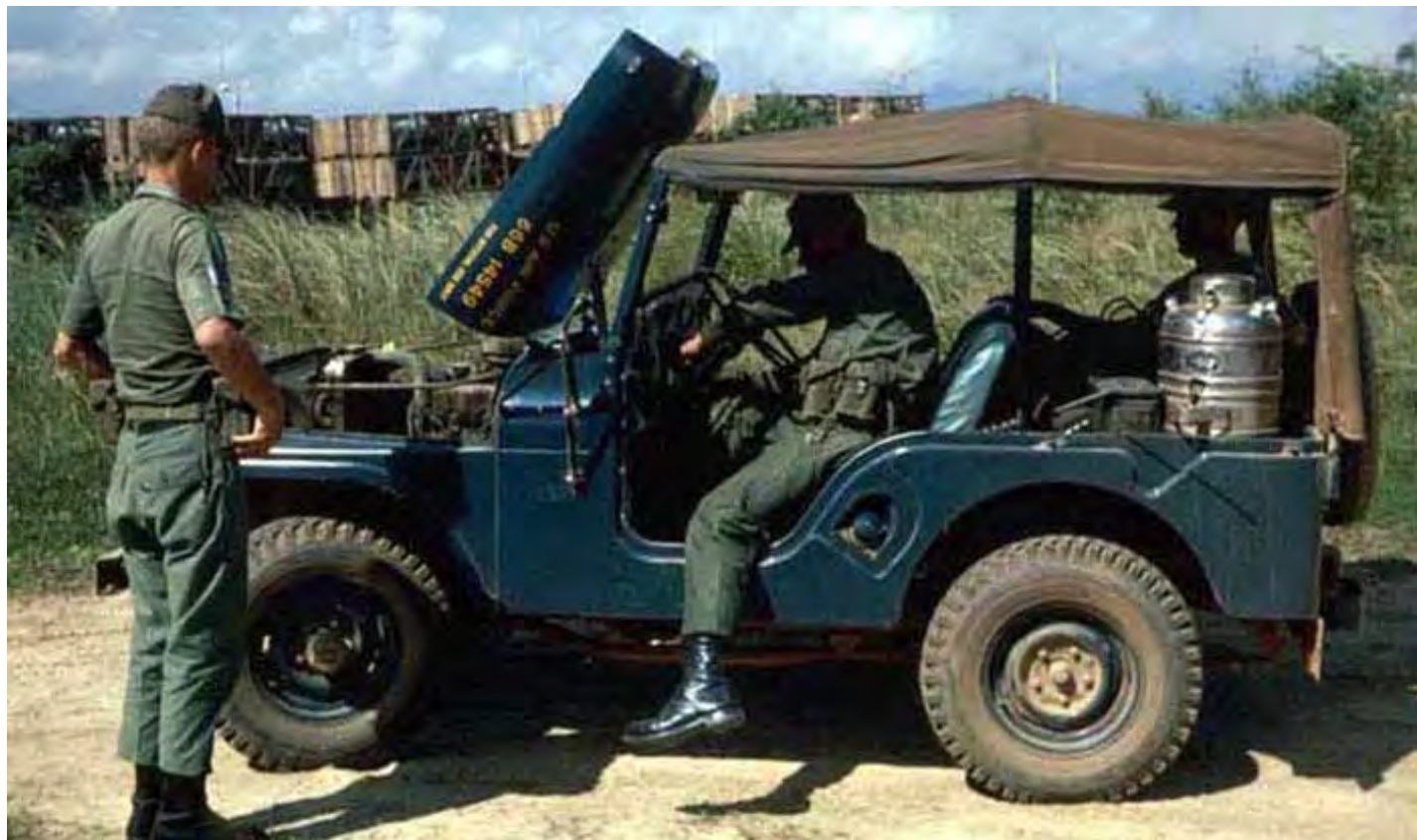
21. Đà Nẵng AB, 366th SPS. Hot C-rats heated on the jeep's engine.