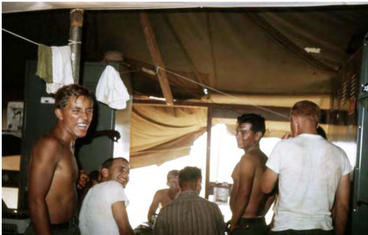
15. Da Nang AB, 366th SPS. Tent Card Game.