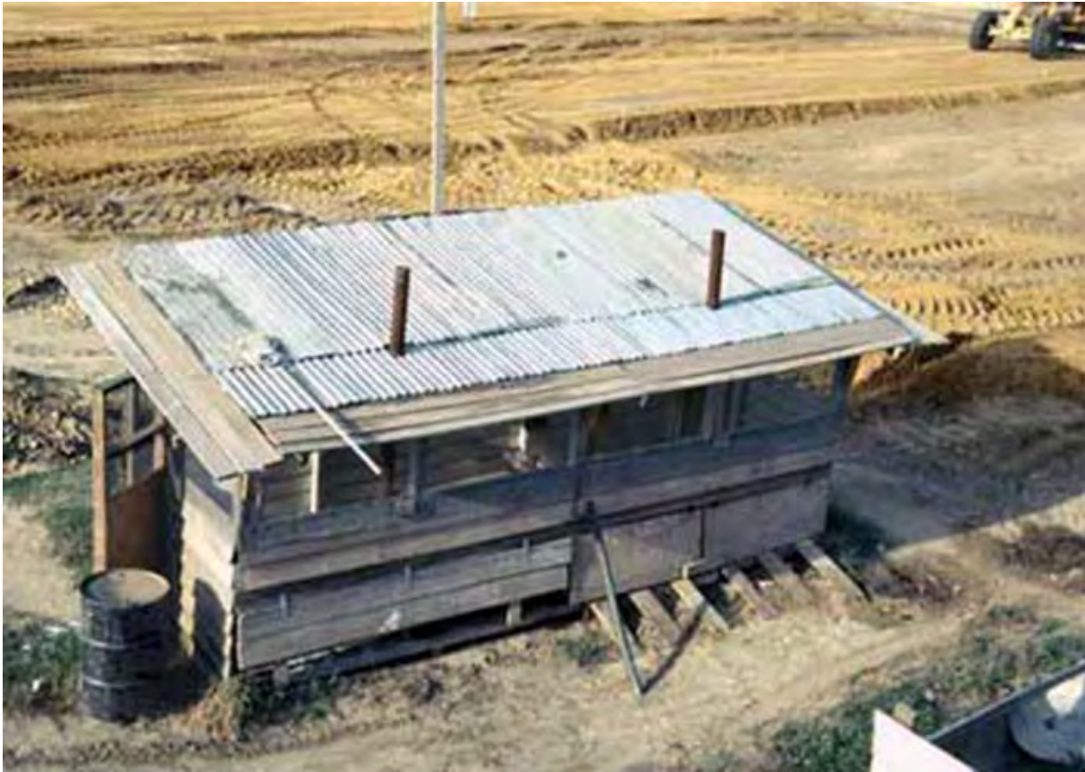
13. Đà Nẵng AB, 366th SPS. Four seater crapper.