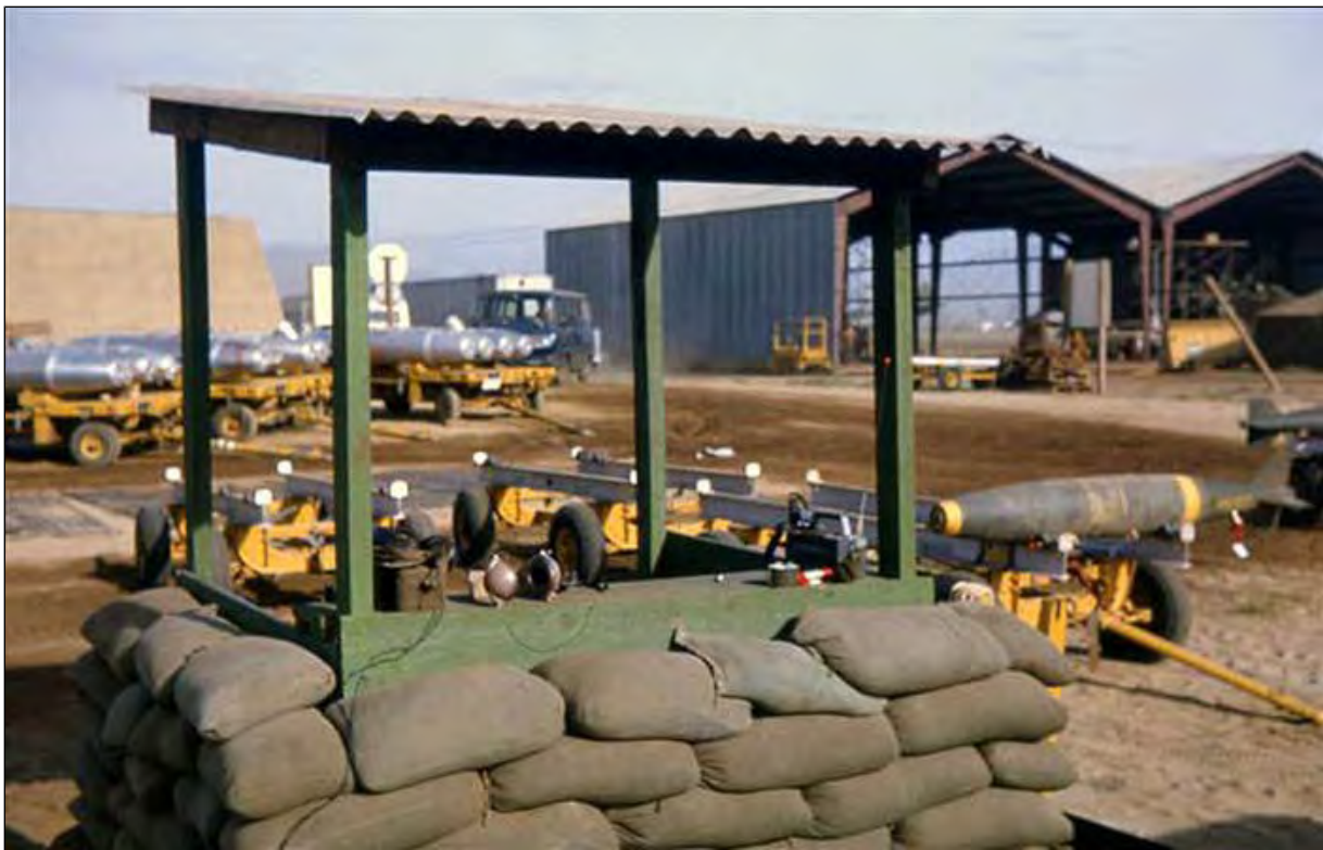
4. Đà Nẵng AB, 366th SPS. Alpha Post, facing East. 750 LB bombs waiting for a ride.