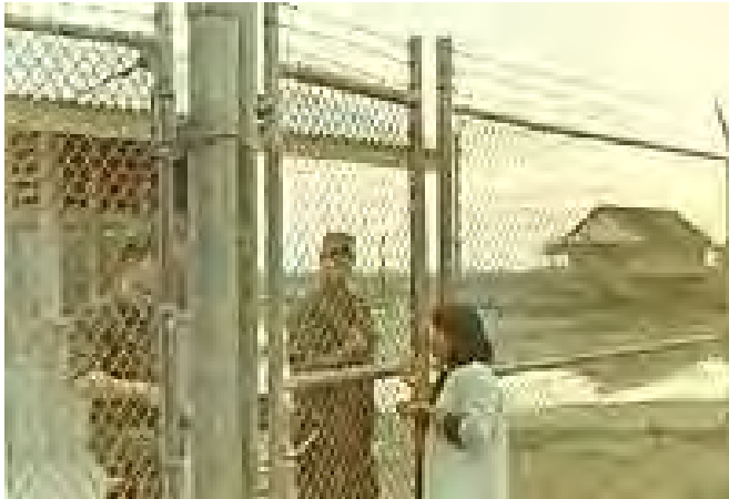
50. Air Force Security at Station front gate. In the background is the villa of the former South Vietnamese President Ngo Dinh Diem.