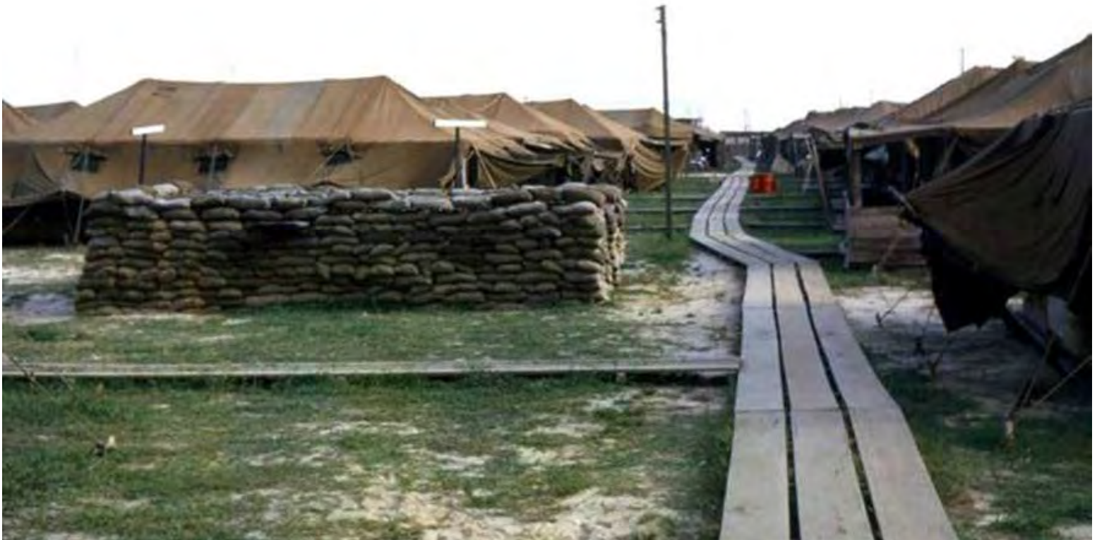
10. Đà Nẵng AB, 366th SPS. Original AP/SP Tent City, South. View is south from the showers.