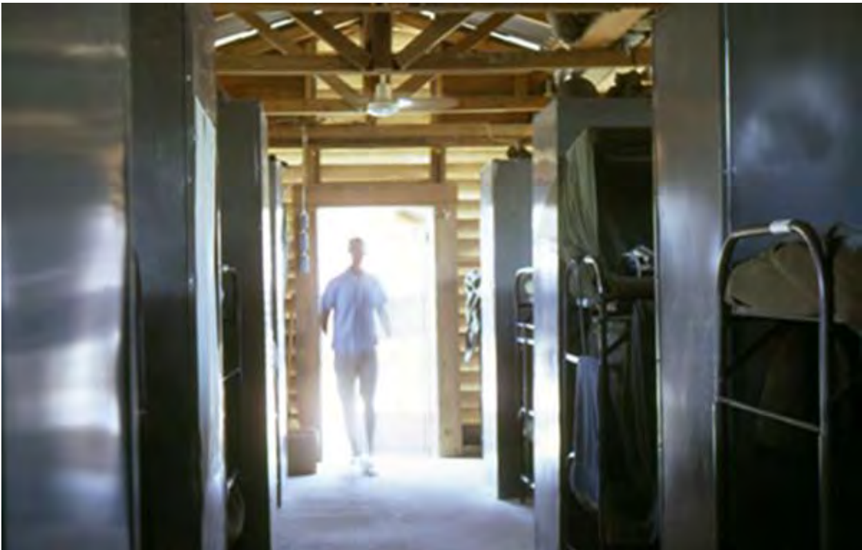
20. Đà Nẵng AB, 366th SPS. New SP Huts construction raced to keep up with the expanding SP squadron.