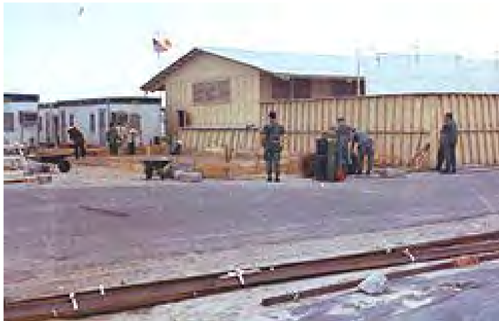
51. Construction of the warehouse.