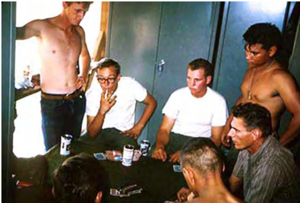
17. Đà Nẵng AB, 366th SPS. Card Game.