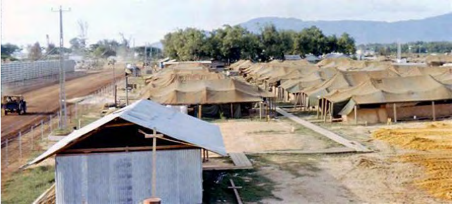
11. Đà Nẵng AB, 366th SPS. New SP Tent City, North. 1966-1967.