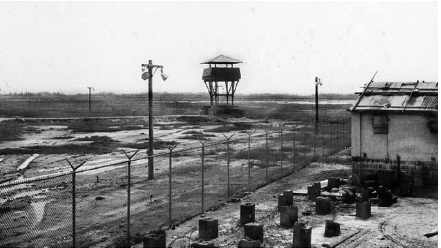
47 This is a very large target. The guard tower in any compound in Vietnam was a good point of reference for enemy mortar, rocket or artillery fire.