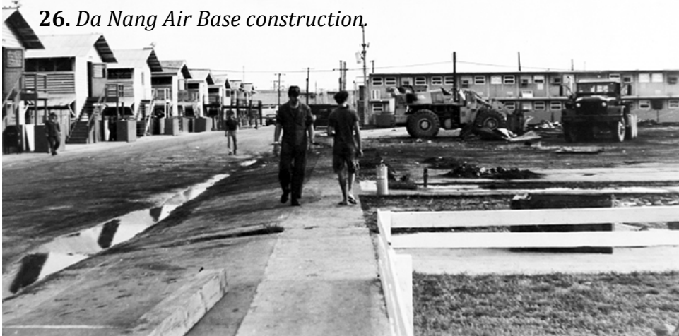
26. Da Nang Air Base construction.

My journey to Tan My started about a month and a half after I landed at Đà Nẵng on August 13th, 1971. Đà Nẵng was supposed to be my home for the next 365 days, but that changed when, without going into too many details, I found myself facing an Article 132 court martial, much to my chagrin. I didn't agree with that decision and got a lawyer. He was able to convince the CO that there was no merit to this punitive action, and the charges were dropped -- and I was labeled as trouble.