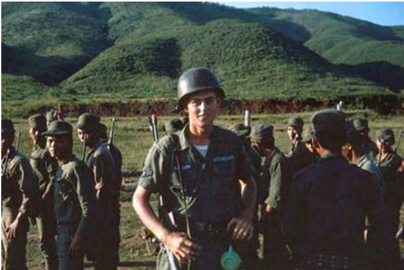
6. Đà Nẵng AB, 366th SPS. Freedom Hill 327, and firing range at the base. ARVNs wondering what the big-guy is up to.