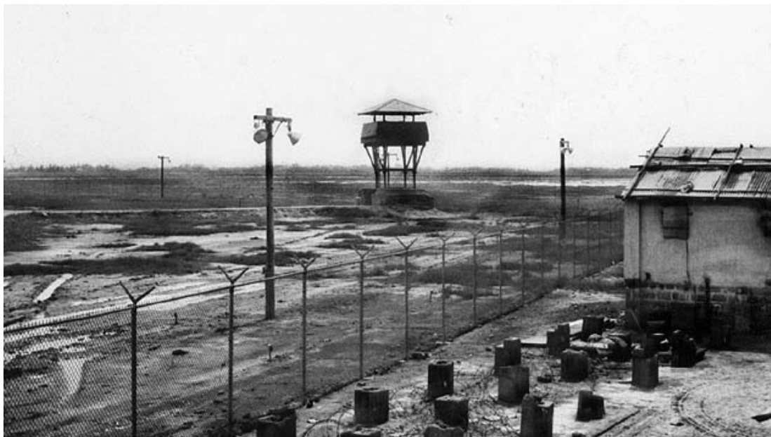
This is a very large target. The guard tower in any compound in Vietnam was a good point of reference for enemy mortar, rocket or artillery fire.