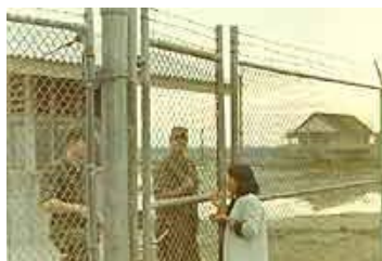
Air Force security at Station front gate. In the background is the villa of the former South Vietnamese President Ngo Dinh Diem.