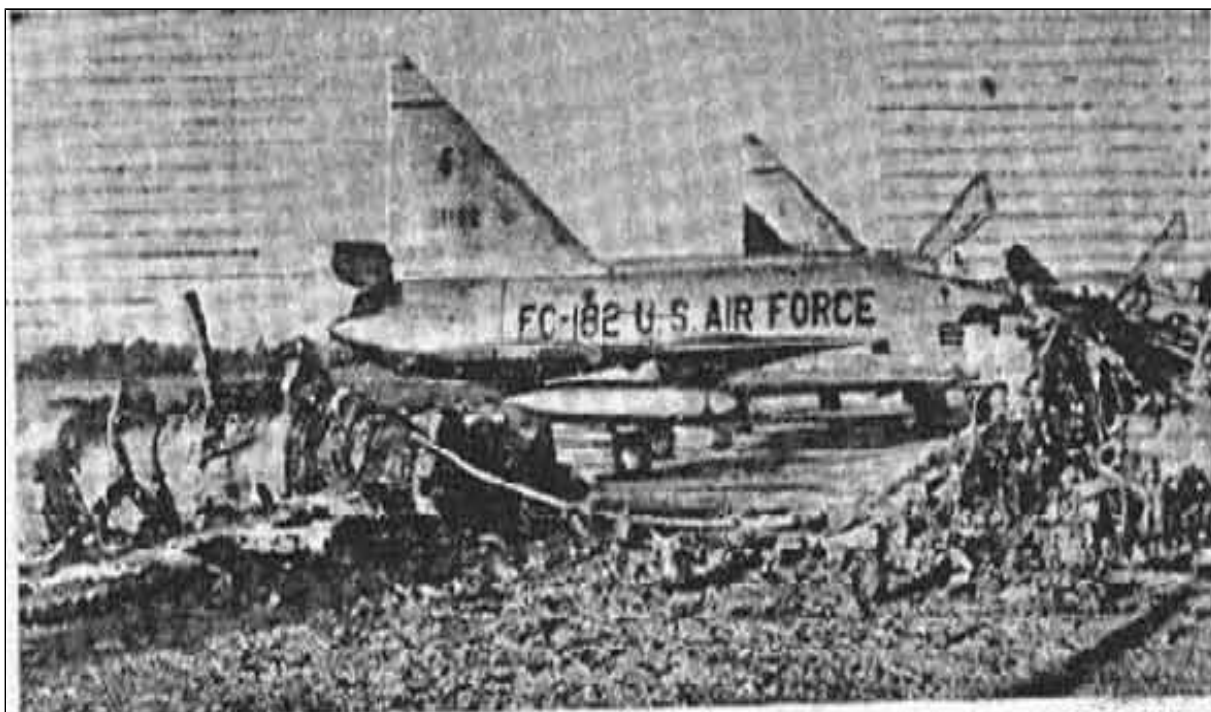
VIET CONG SURPRISE ATTACK ON DA NANG AB DESTROYED F-102 DELTA DAGGER (FOREGROUND).