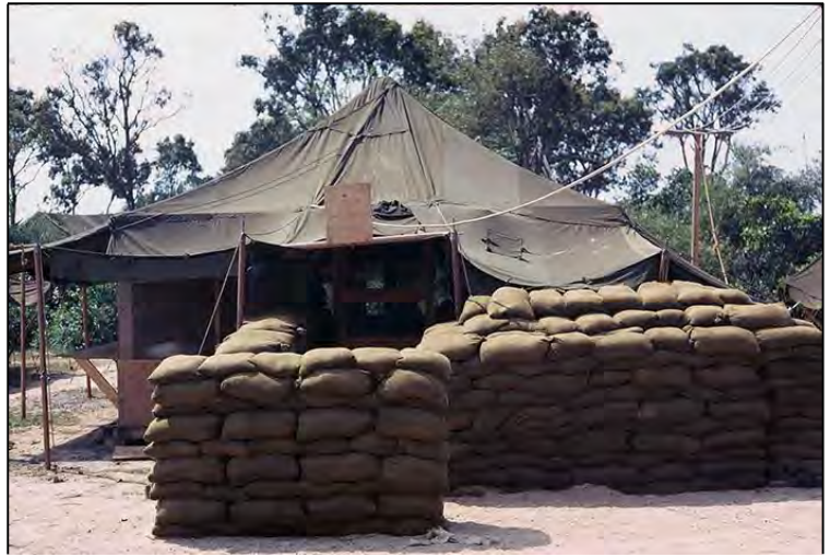
3.18_31: 1041 st SPS(T). 1967.