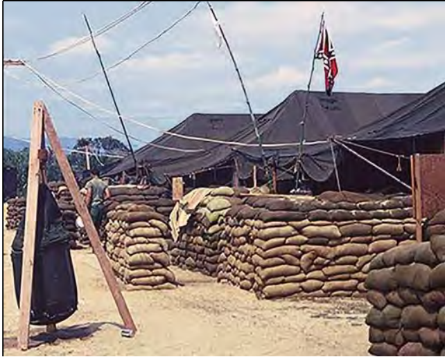
3.18_41: 1041st SPS(T). Tents, water-bag, and historical CSA flag.