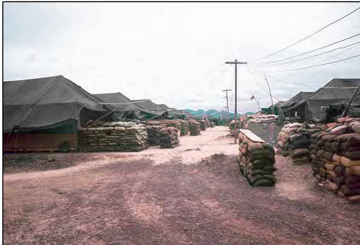
3.18_37: 1041st SPS(T), tents. 1967.