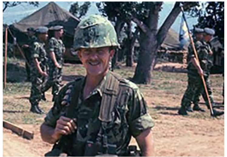
3.18_5: 1041 st SPS(T). Closeup. 1967.