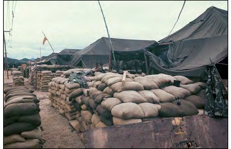
3.18_38: 1041 st SPS(T), tents.