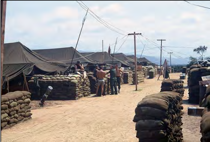
3.18_35: 1041st SPS(T). P-Tube in front of tent. Shootin' the breeze. 1967.