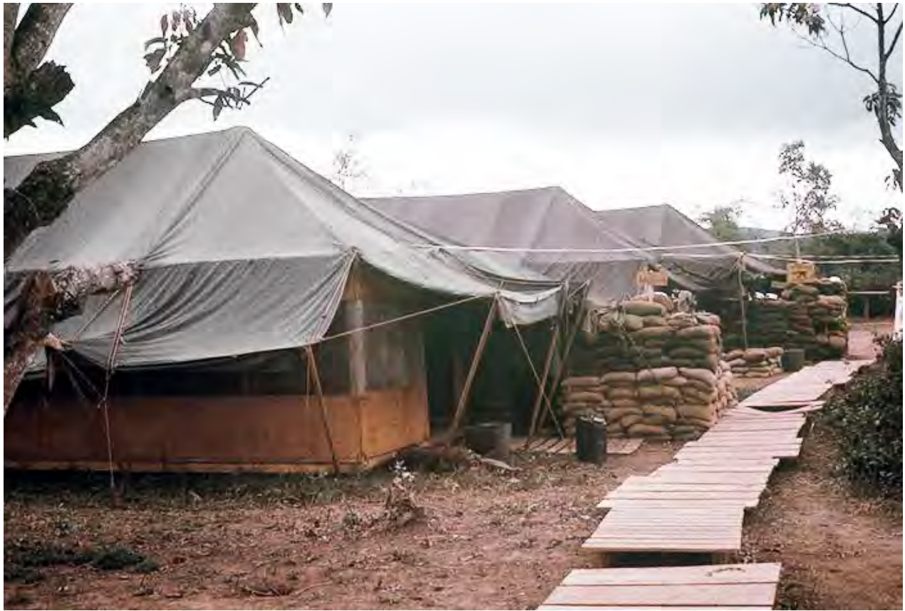
3.18_16: 1041st SPS(T). Tents and walkways. 1967.