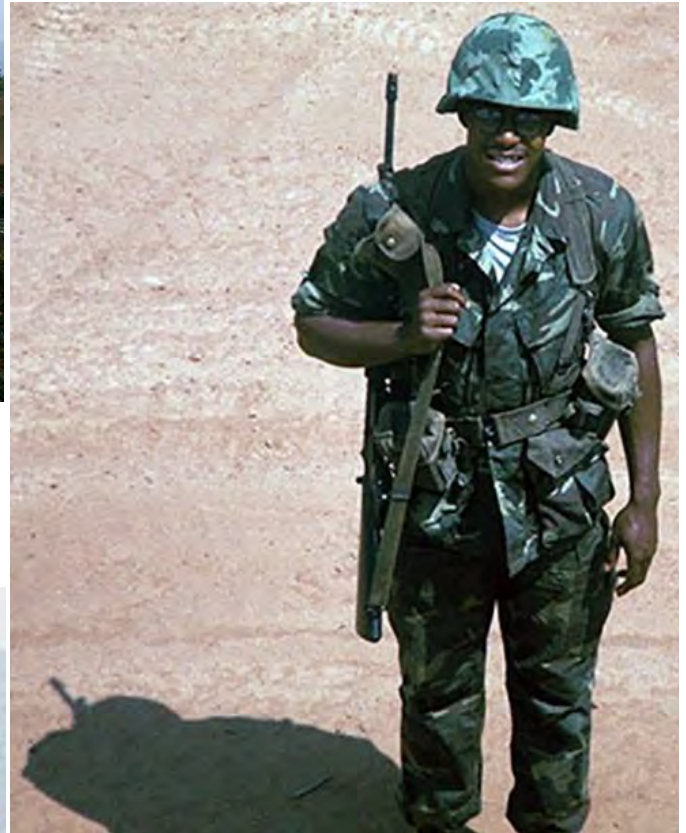
3.18_34 (above): 1041 st SPS(T). HEY--TOWER! You takin 'a picture of ME? 1967.