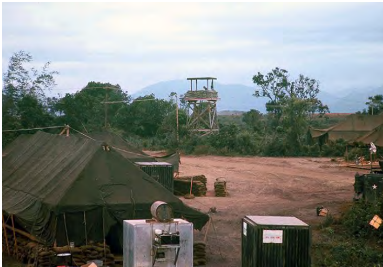
3.18_32 (above): 1041 st SPS(T). Base Camp, with five Perimeter Towers. 1967.