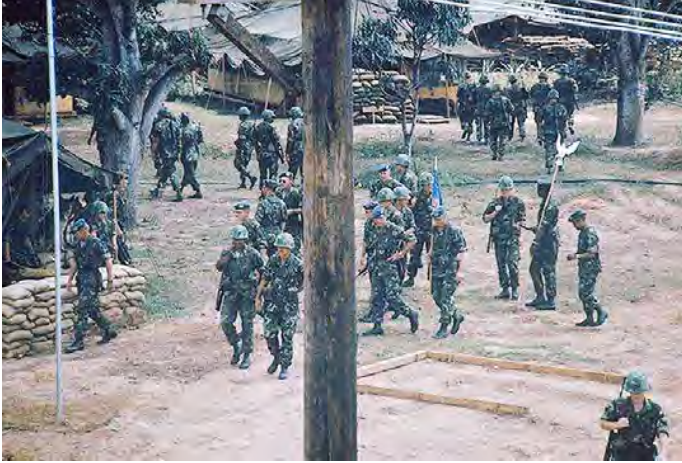
3.18_11 (left): 1041 st SPS(T). 1967. Falcon Guideon.