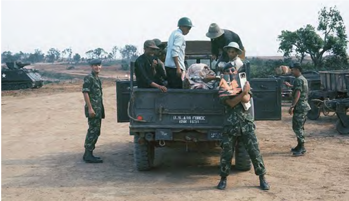
3.18_14 (above) & 3.18_15 (Closeup, below): Vietnamese workers in truck. Airman holds up a training manual? 1967.