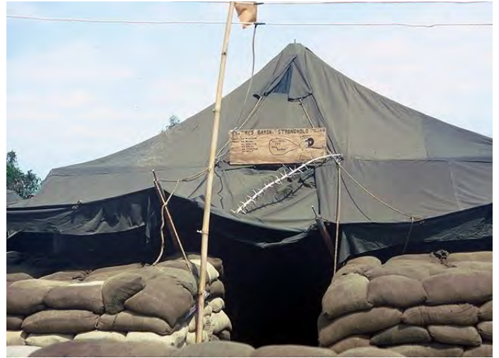
3.18_42: 1041st SPS(T). Sign: The Red Baron Stronghold .