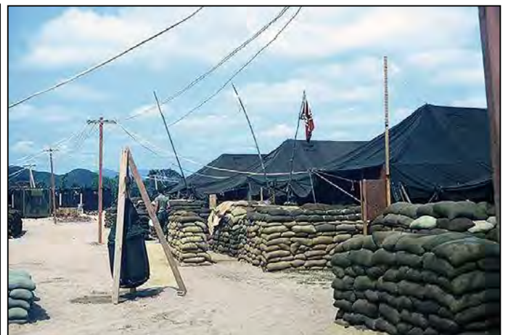
3.18_40: 1041 st SPS(T). 1967.