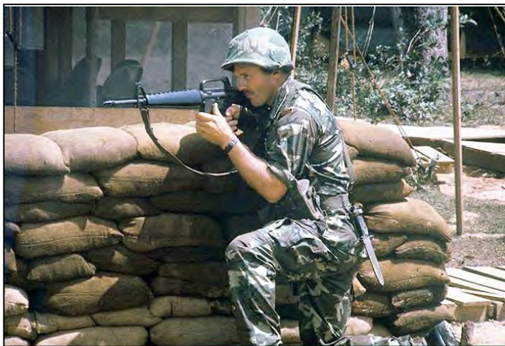
3.18_39: 1041st SPS(T). Mugging for the camera. 1967.