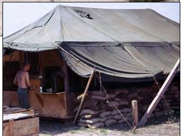
3.18_28: 1041 st SPS(T). 1967.