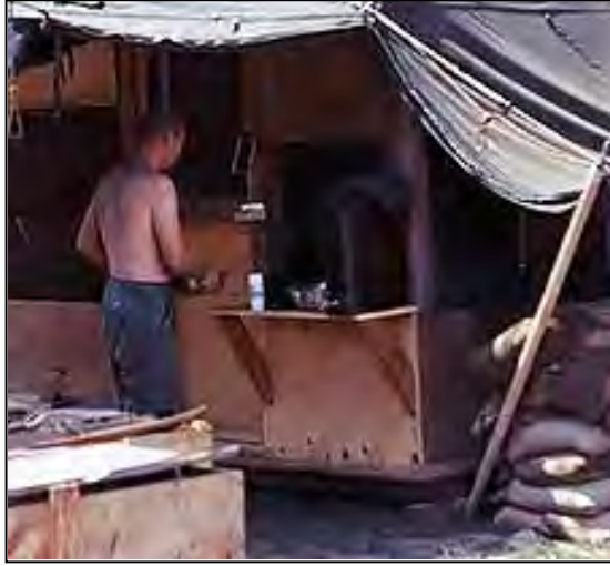
3.18_30: 1041 st SPS(T). 1967.