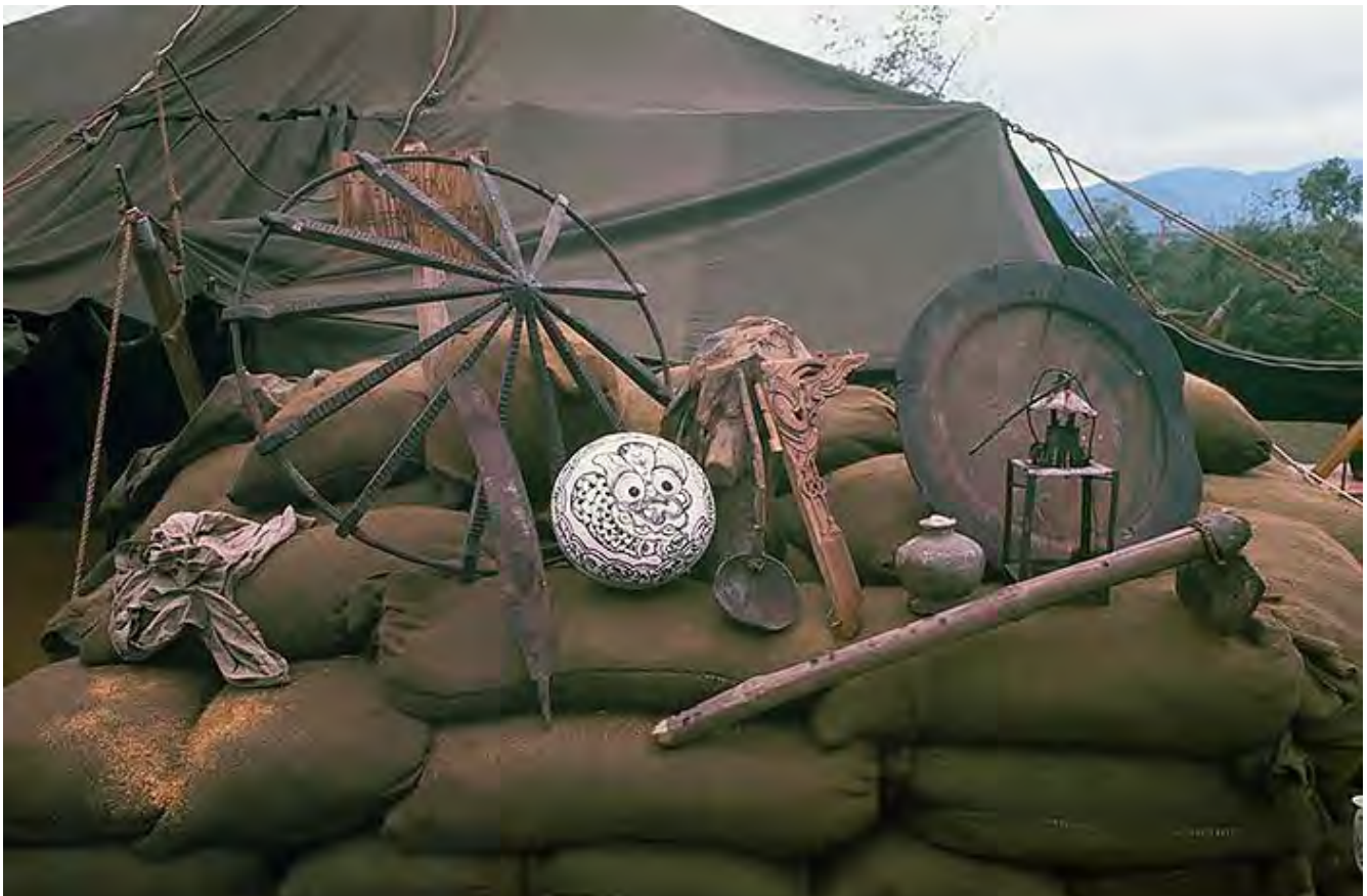
3.18_17: 1041st SPS(T). 1967.