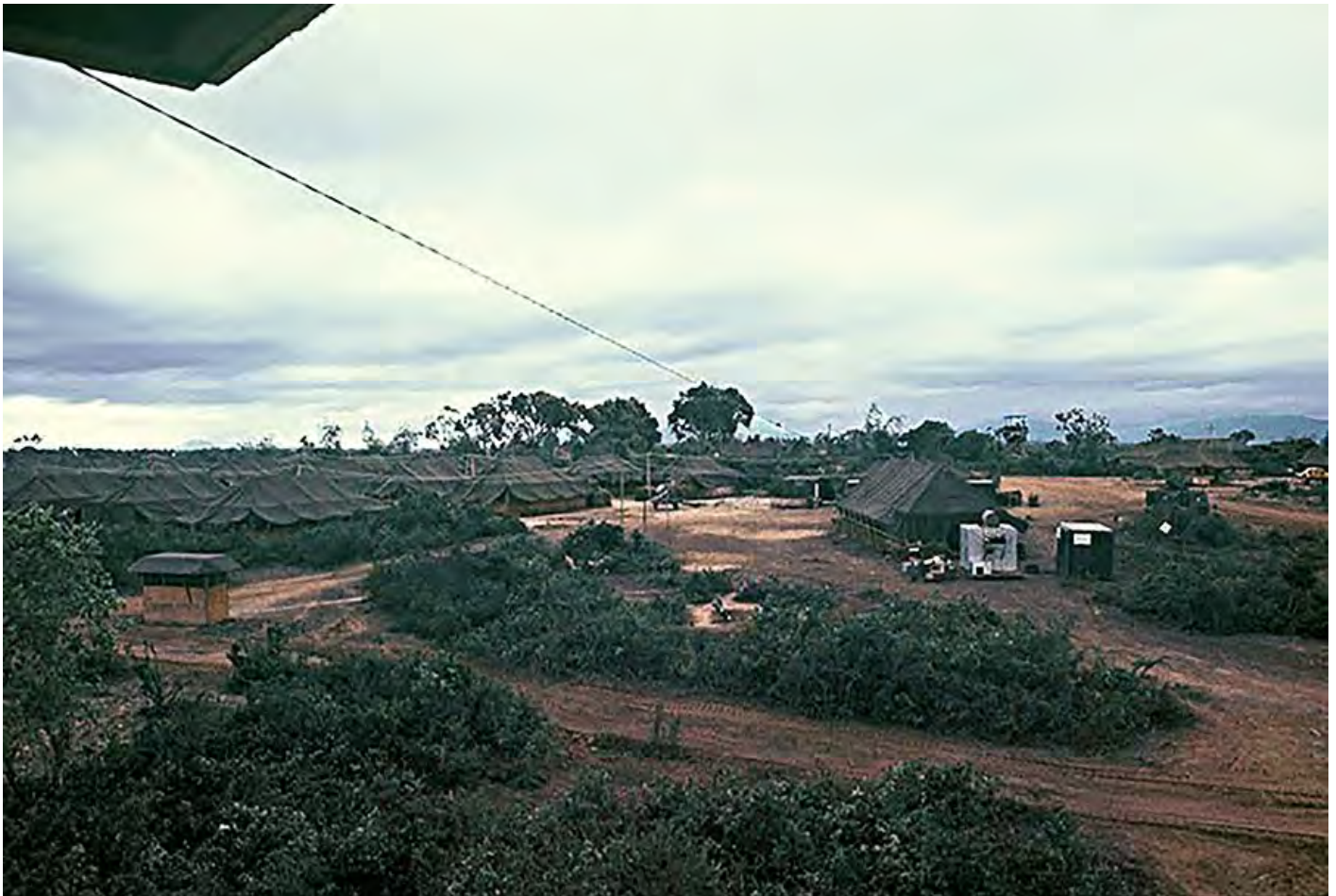
3.18_1: 1041st Security Police Squadron(T) Base Camp, Tower view. 1967.