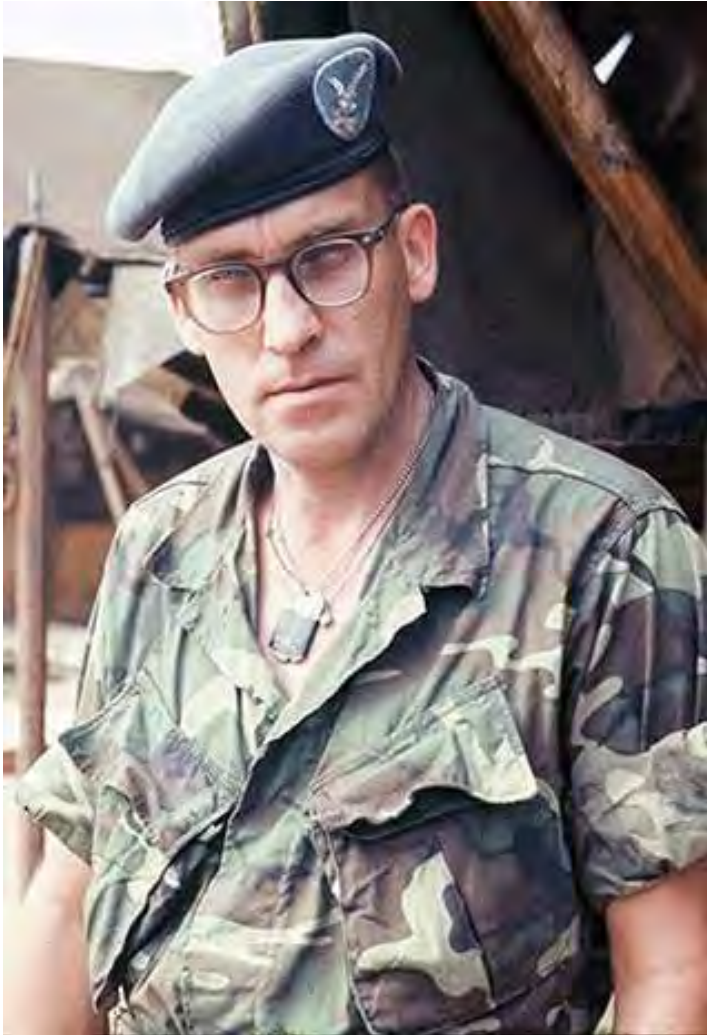
3.18_48: 1041 st SPS(T).