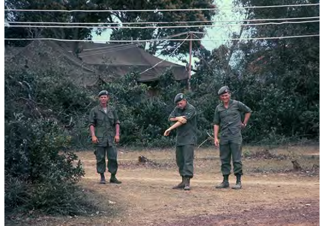
3.18_12 (right): 1041 st SPS(T). 1967. Falcon Guideon.