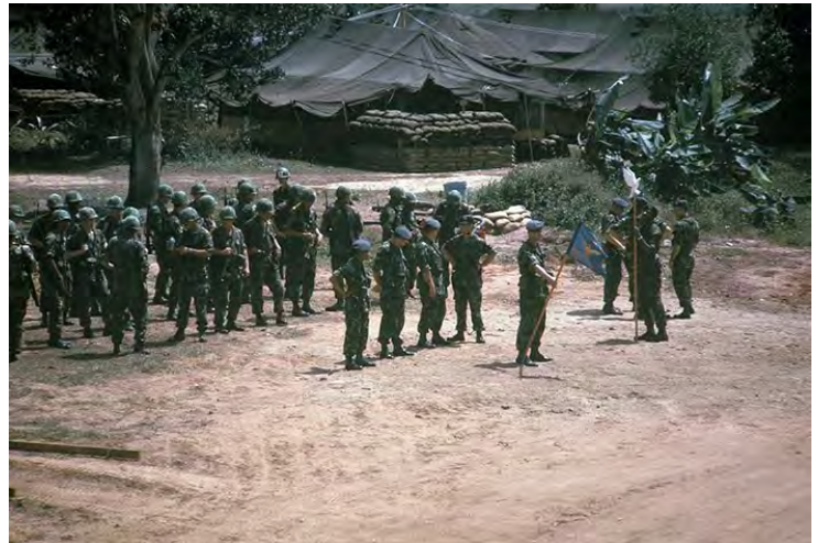
3.18_7: 1041 st SPS(T). 1967. Falcon Guideon.