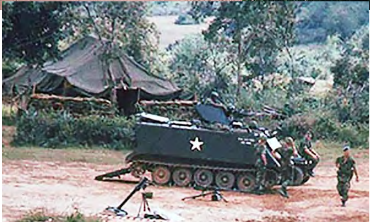
3.18_10: 1041 st SPS(T). 1967. (Closeup from previous photo) M113 APC, with team. .50 Cal Machinegun top, hatch open for squad, mortar and machinegun setup for display.