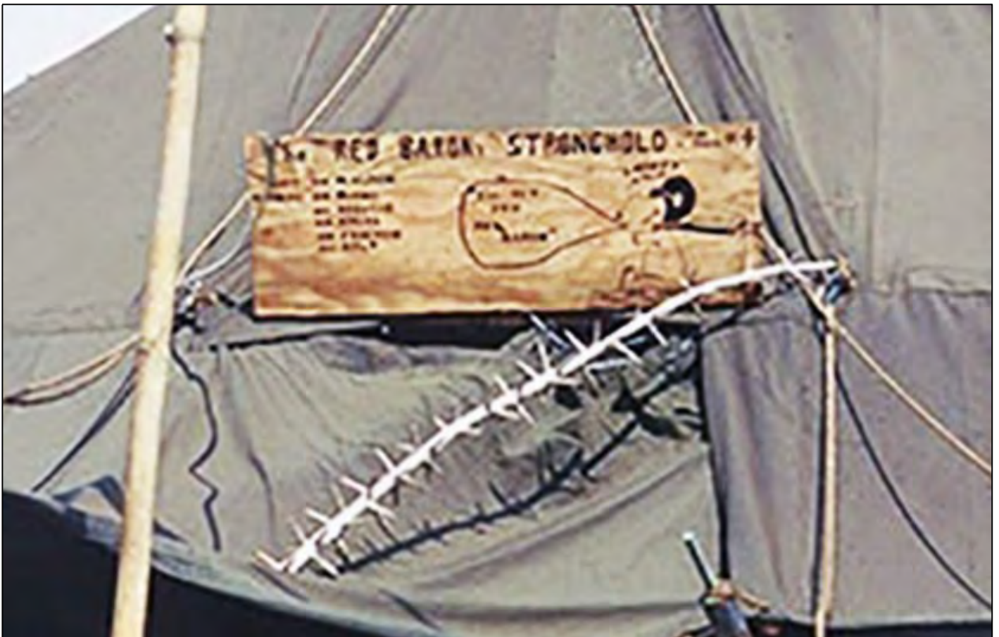
3.18_43: 1041 st SPS(T). Snoopy tent sign: THE RED BARON STRONGHOLD . (closeup)