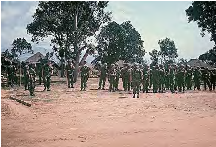
3.18_6: 1041 st SPS(T). 1967. Falcon Guideon.