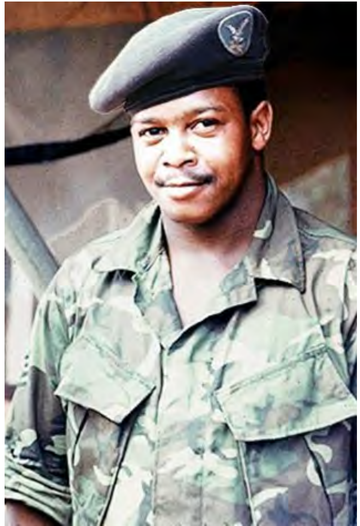
3.18_49 1041 st SPS(T).