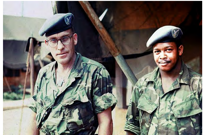
3.18_47: 1041 st SPS(T).