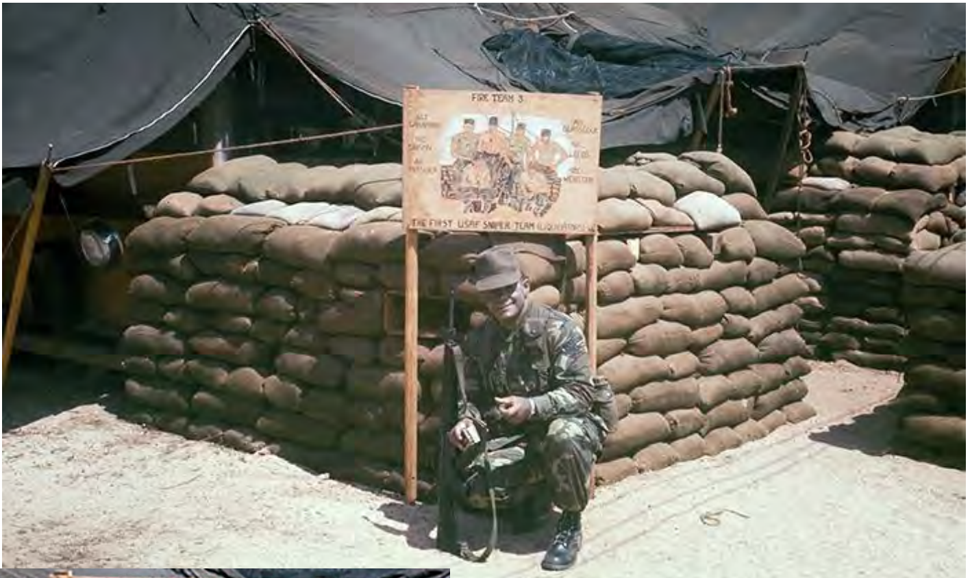
3.18_18 (above, USAF Photo) Tent, Bunker, Sign;