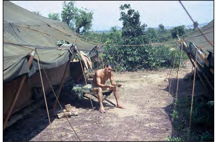
3.18_36: 1041st SPS(T). Hey fella ... hand me my boots, will ya? 1967.