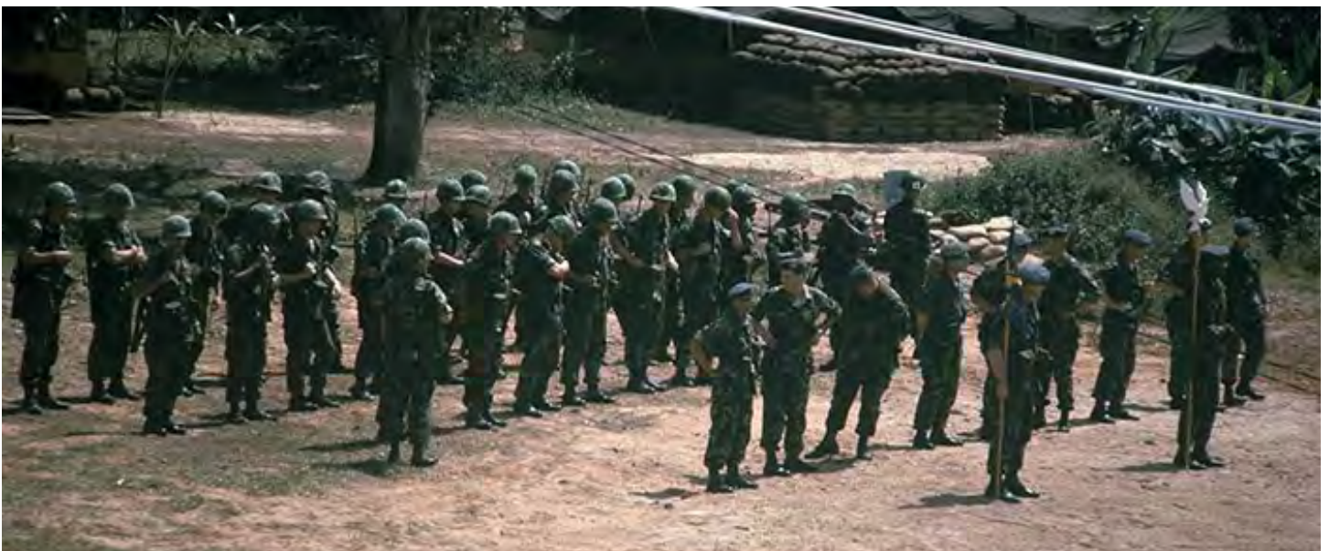
3.18_8: 1041 st SPS(T). M113 APC. 1967. (below, USAF Photo)