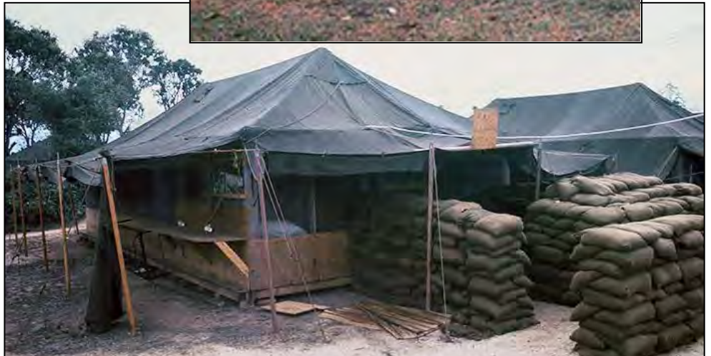
3.18_27 (right): 1041st SPS(T). Beer Bar. 1967.