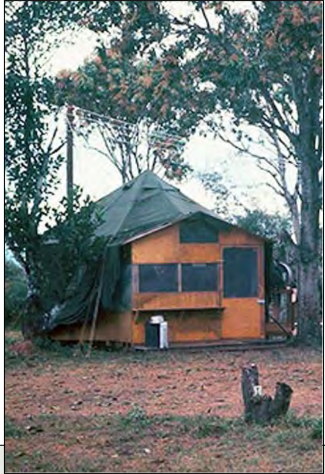
above right/closeup, ( Beer Bar). 1967.