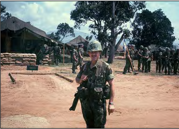
3.18_4: 1041 st SPS(T). 1967.