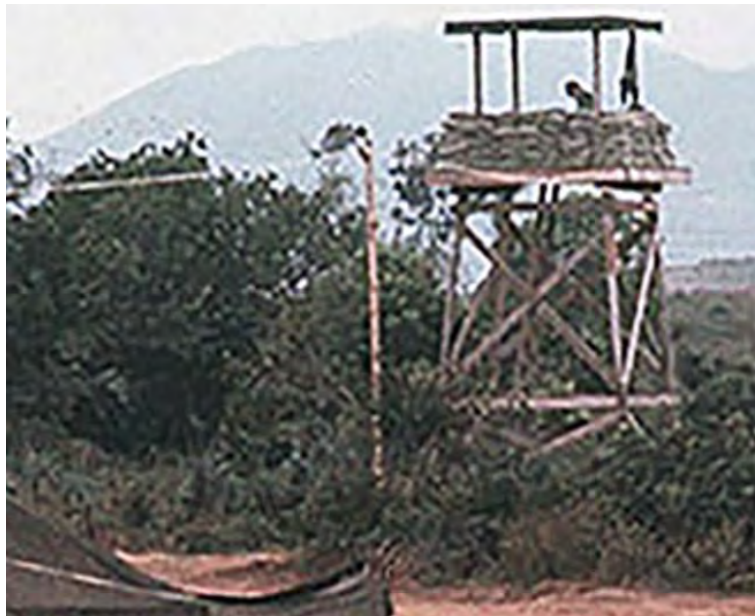
3.18_33 (below): 1041 st SPS(T). Base Camp, Perimeter Tower. Closeup. 1967.