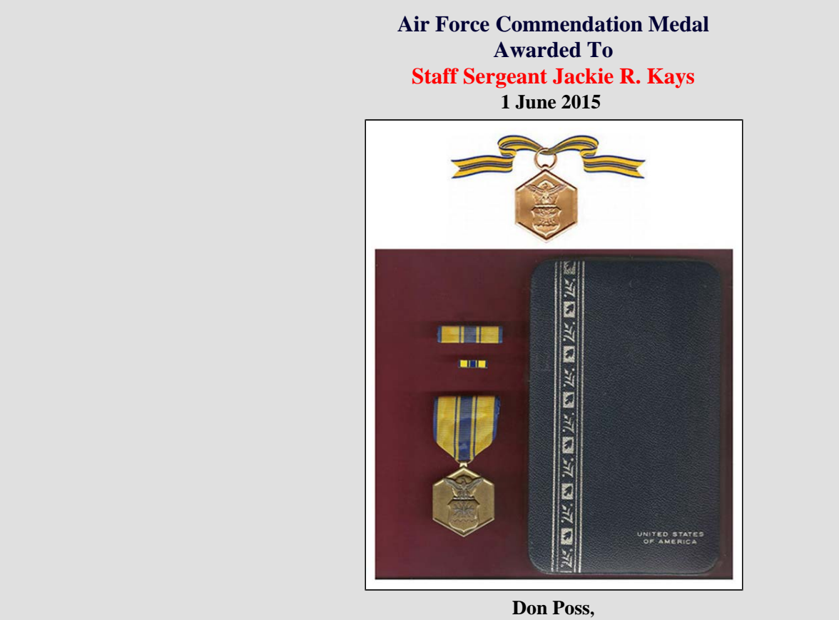
Don Poss, VSPA Webmaster, LM 37