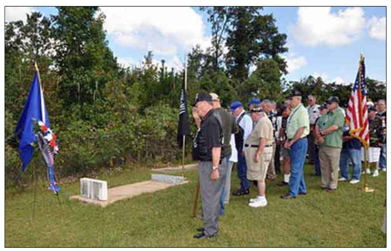
(90) Silence... No words are necessary.