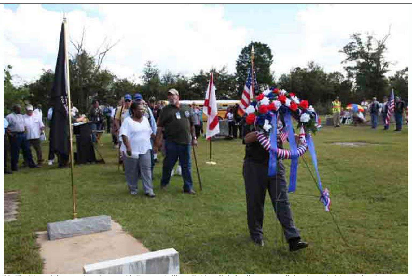
(80) The Memorial procession advances Air Force style like at F-4 in a flight landing pattern: flying downwind (parallel to the runway), turning base-leg (to align with runway), then turn short-final (descending to touchdown) around the tombstone for wreath placement.