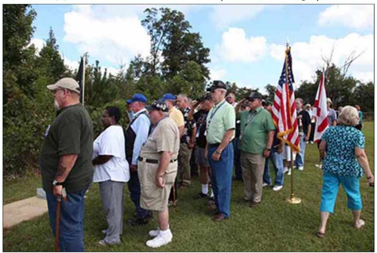
(89) Final salutes are offered....