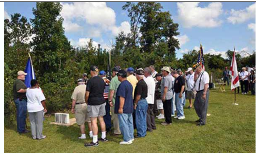
(88) Tân Son Nhứt AB members close in... some hands pat or touch the tombstone gently.