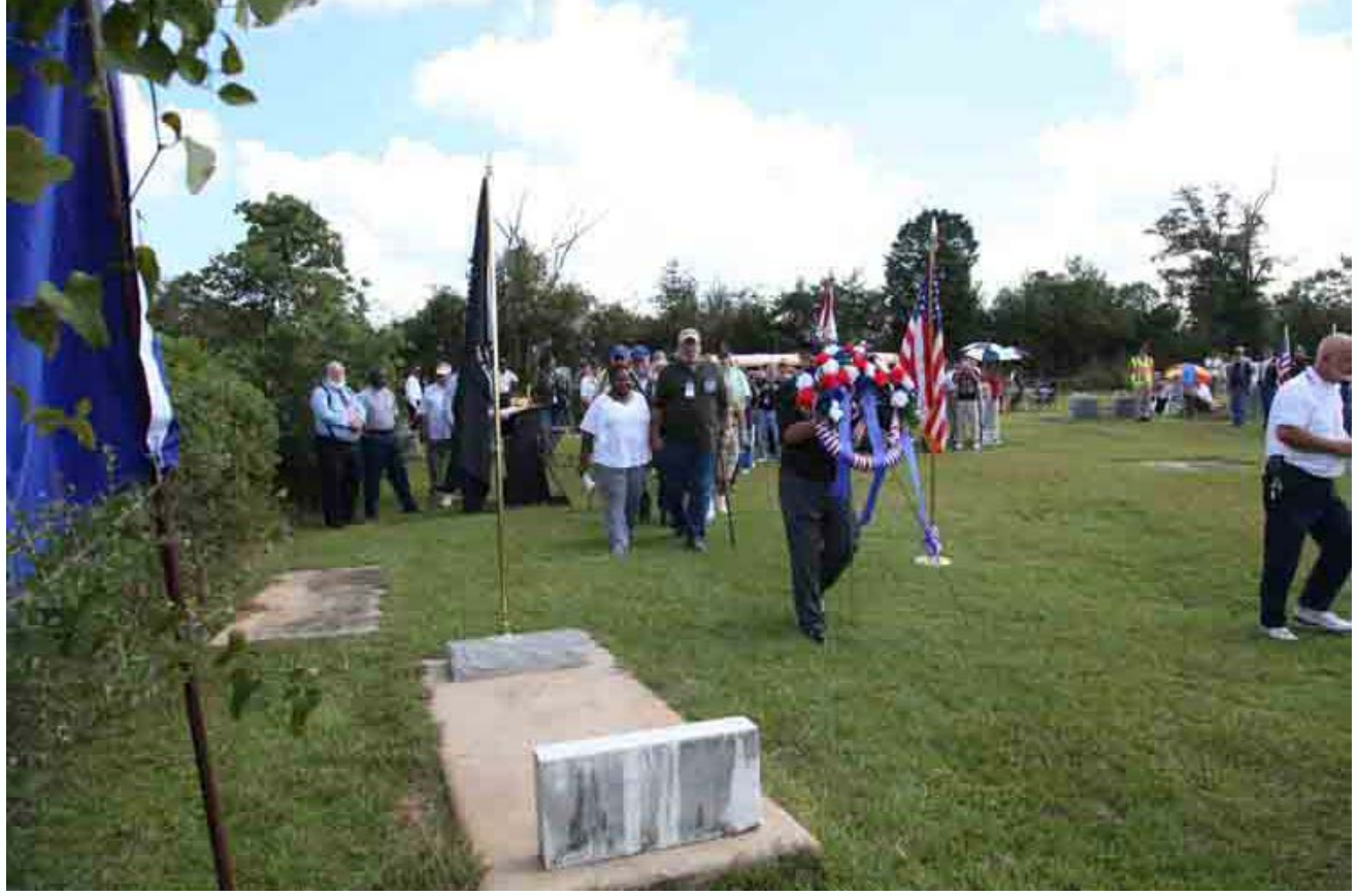
(79) The Memorial procession begins, and the line extends back to the bus and fence line.