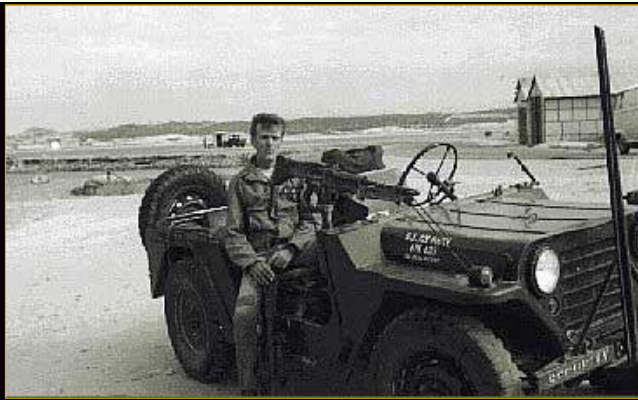
14) Convoy duty between Phan Rang and Cam Ranh Bay AB. SP Jeep was a newer M-141 (?) mounted with an M60 machine gun.