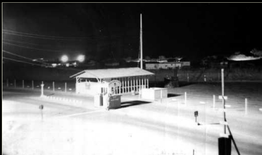
13) Front Gate: Building in background with stalls was where local workers were searched both coming in (for explosives, guns, knives, etc) and going out (for contraband).