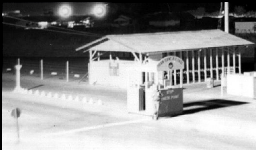
12) Phan Rang's front gate, at road to Top Cham and Phan Rang.