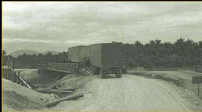
15) Part of a convoy over new bridge. The bridge on the left had been destroyed days before, by Viet Cong.