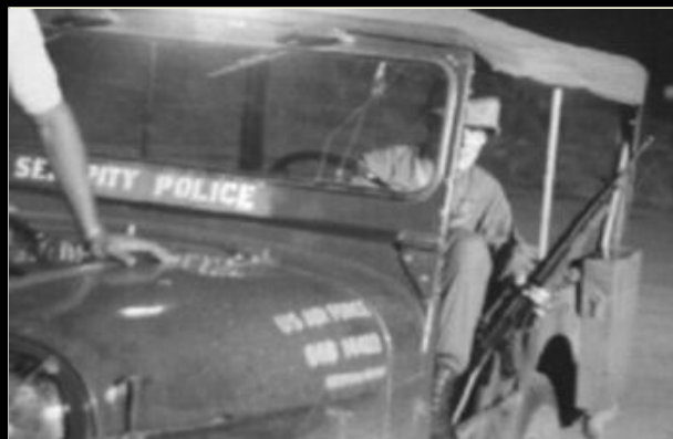
11) Law Enforcement Security Police, armed with an M16.