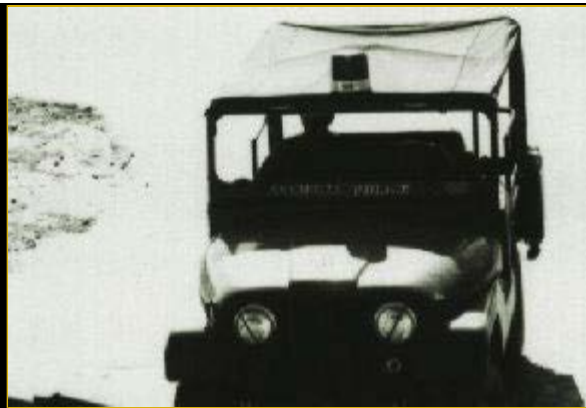
16) SP base patrol jeep.