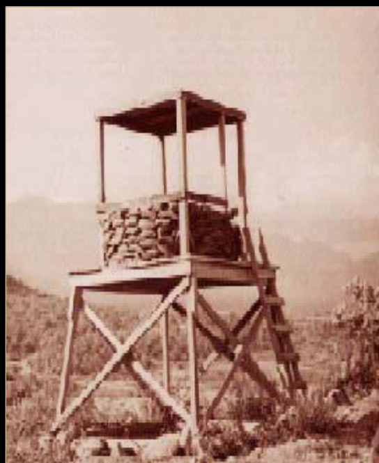
13) Guard tower near the NCO Club overlooking back of base.