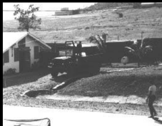
15) SP HQ: Area to right was the fenced in SP's 'beer garden'.