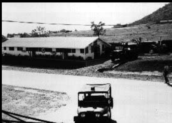
14) 35th Security Police Headquarters building.