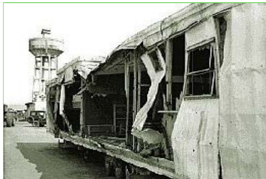
7) A Wing officer's trailer hit by a rocket (he wasn't in it). The water tower in the background was manned by an SP who gave the warning (siren and radio) whenever he spotted any incoming ("the rocket's red glare.....") hence saving untold lives.