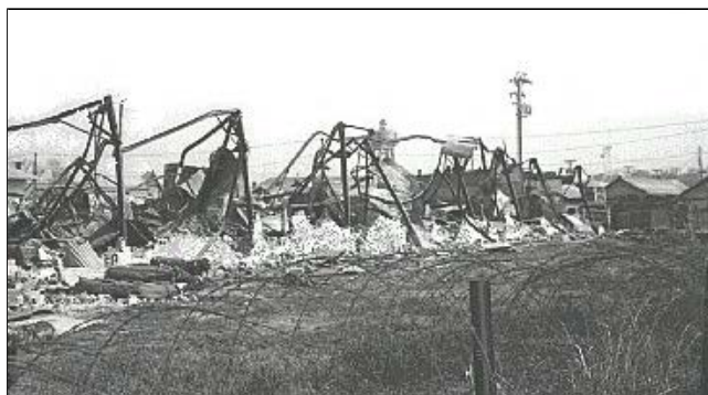
1) Warehouse 100 feet from our barracks hit by rockets - late Jan. / early Feb 1968.