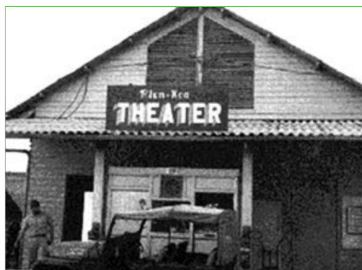
3) Base Theatre