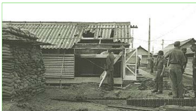
5) Sandbag/PSP bunker used to go to corner of building. Bunkbed of 'surgically removed' wall contained body of Airman killed by shockwave. Between 12-16 troops were vaporized by a rocket that hit the bunker. Author had tried to get into the bunker but it was too full - it was hit when he was running for another bunker 75 feet away. This is where some of our MIA's may have been.