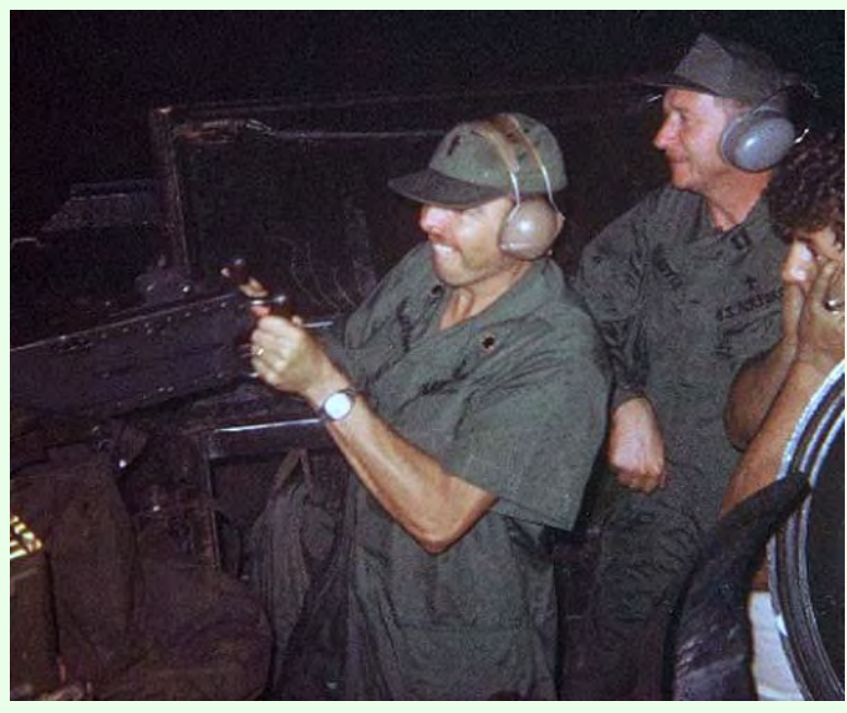
4. Phan Rang AB: Heavy Weapons, letting the base Chaplins fire the .50cal. 1970. 'Repent, Commies!'