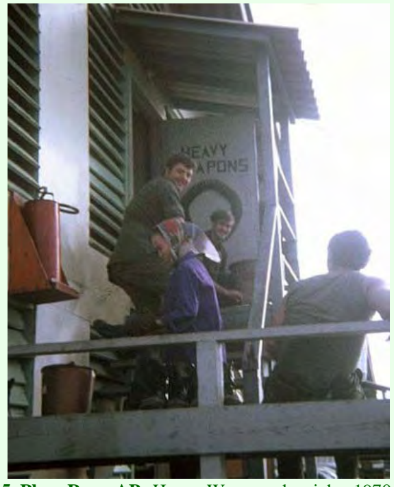
5. Phan Rang AB: Heavy Weapons barricks. 1970.