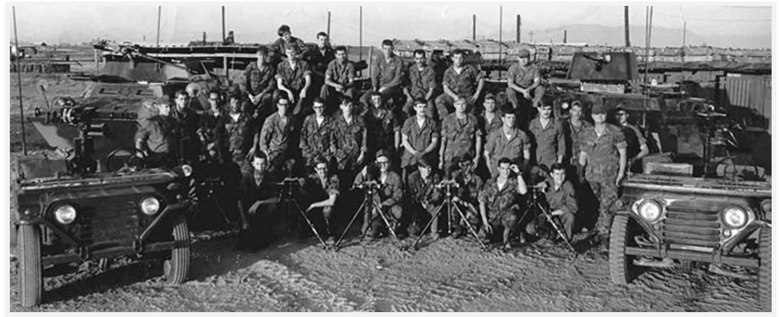
1. Phan Rang AB: Heavy Weapons. 1970.