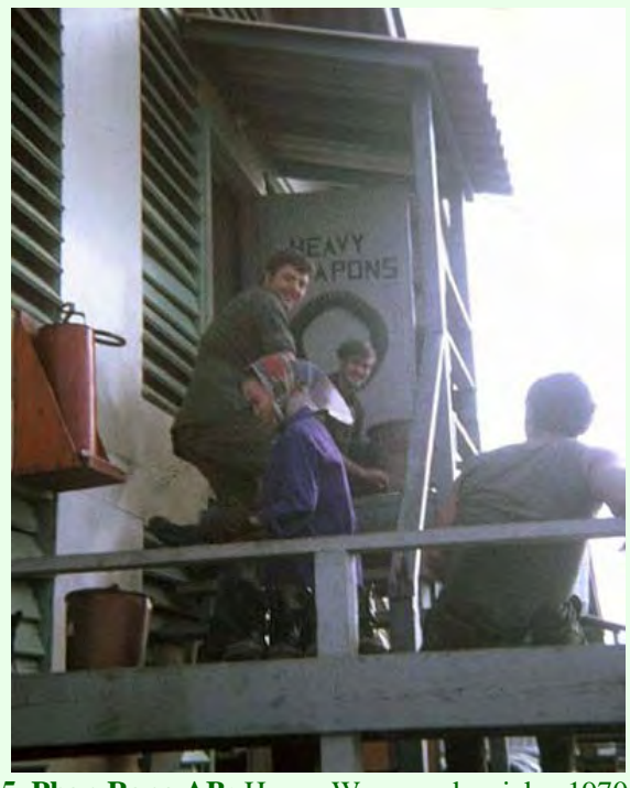
5. Phan Rang AB: Heavy Weapons barricks. 1970.