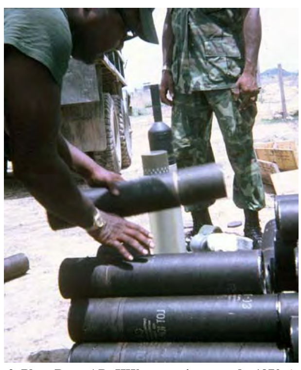
2. Phan Rang AB: HW, preparing rounds. 1970. \ensuremath{^*}