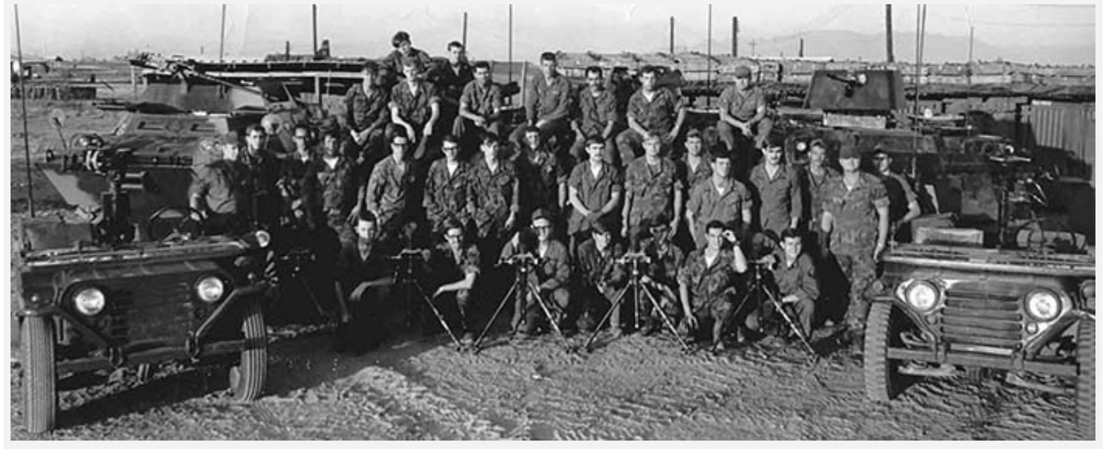
1. Phan Rang AB: Heavy Weapons. 1970.