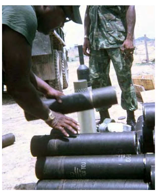
2. Phan Rang AB: HW, preparing rounds. 1970. \ensuremath{^*}