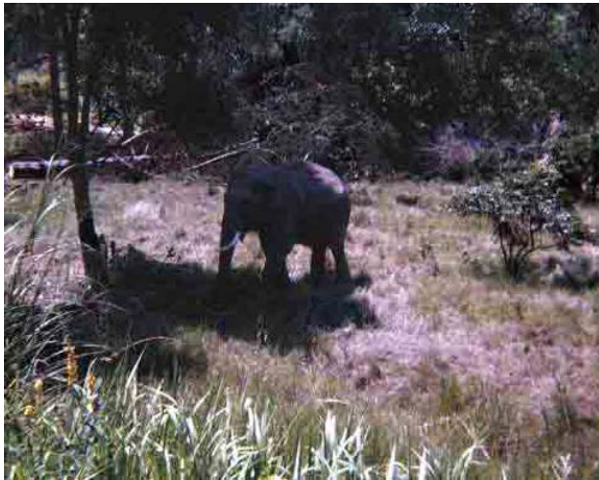
pr-swartz-12-elephant-1966.jpg Photo of a Vietnamese four legged tow truck.