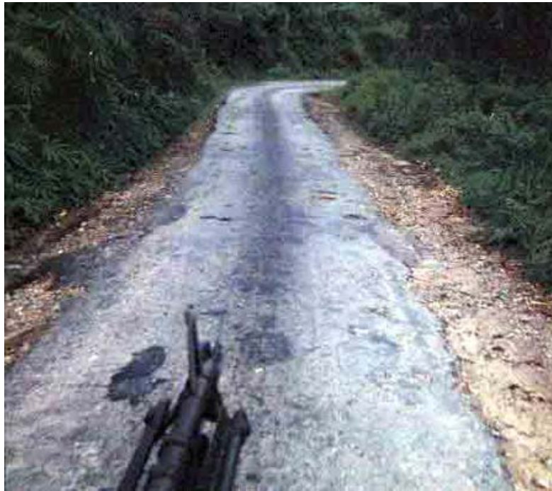
pr-swartz-09-convoy-jeep-1966.jpg Ambush Heaven, potholes for mines, thick foliage for claymores and machine guns. Three weeks after our convoy, another convoy carrying the equipment we transported from Cam Ly and Ling Cong Airports to Đà Lạt was devastated in an ambush on a mountain highway like this.