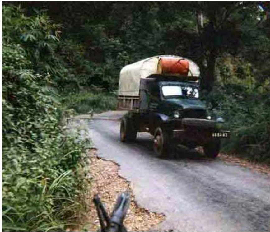
pr-swartz-08-dlt-convoy-1966.jpg Gun jeep having to force traffic to very edge of drop off on mountain road. Edge is soft from rain.