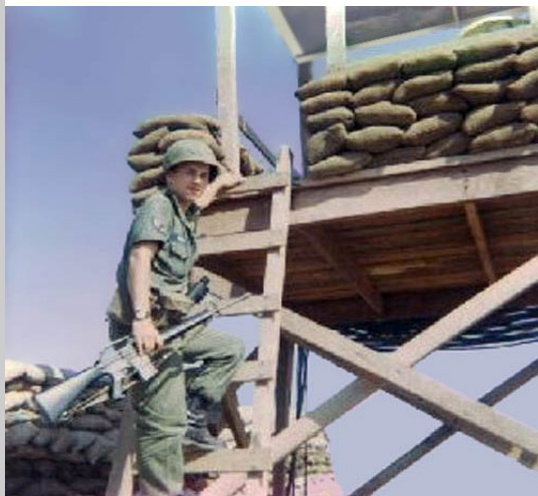
Tower OP-1.