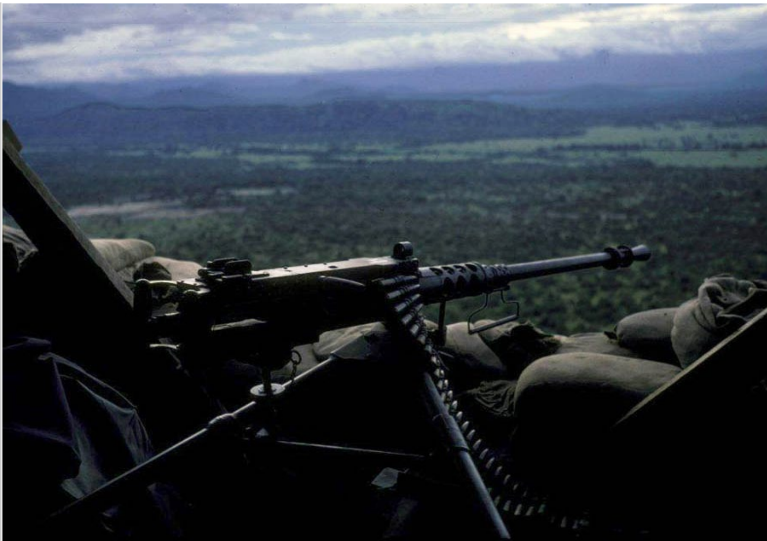
4. Phan Rang AB: Nui Dat Hill, 366th APS: View from OP-2 Bunker, atop Nui Dat Hill. .50 cal machinegun.