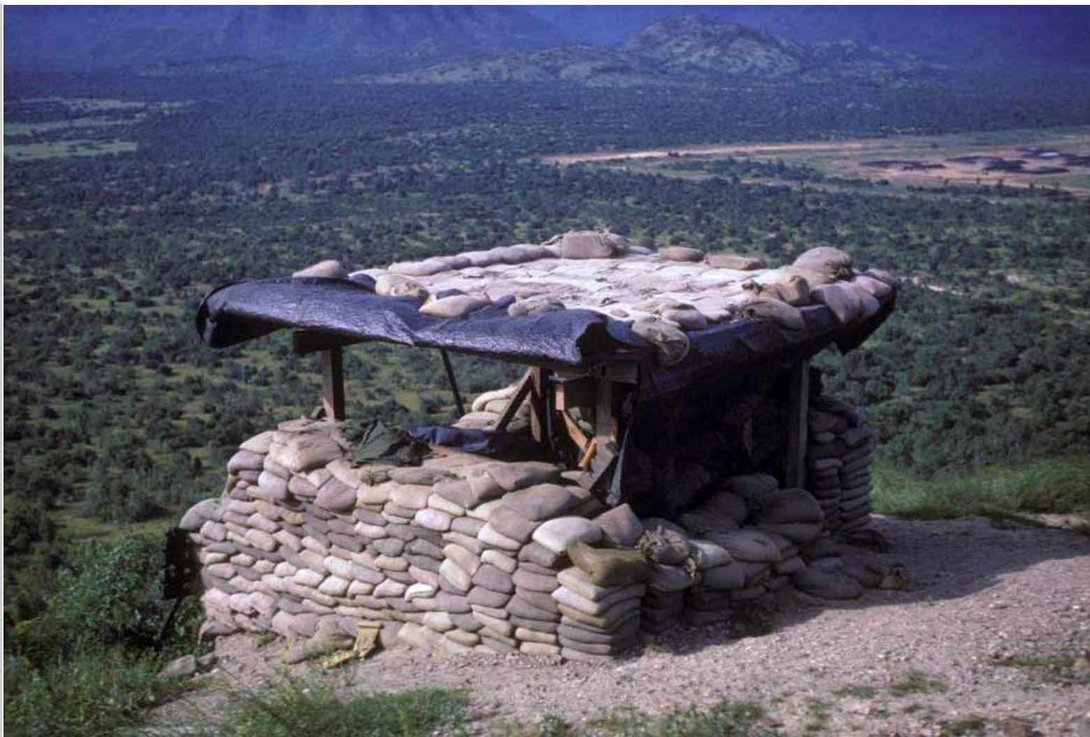
3. Phan Rang AB: Nui Dat Hill, 366th APS: OP-2 Bunker, atop Nui Dat Hill.