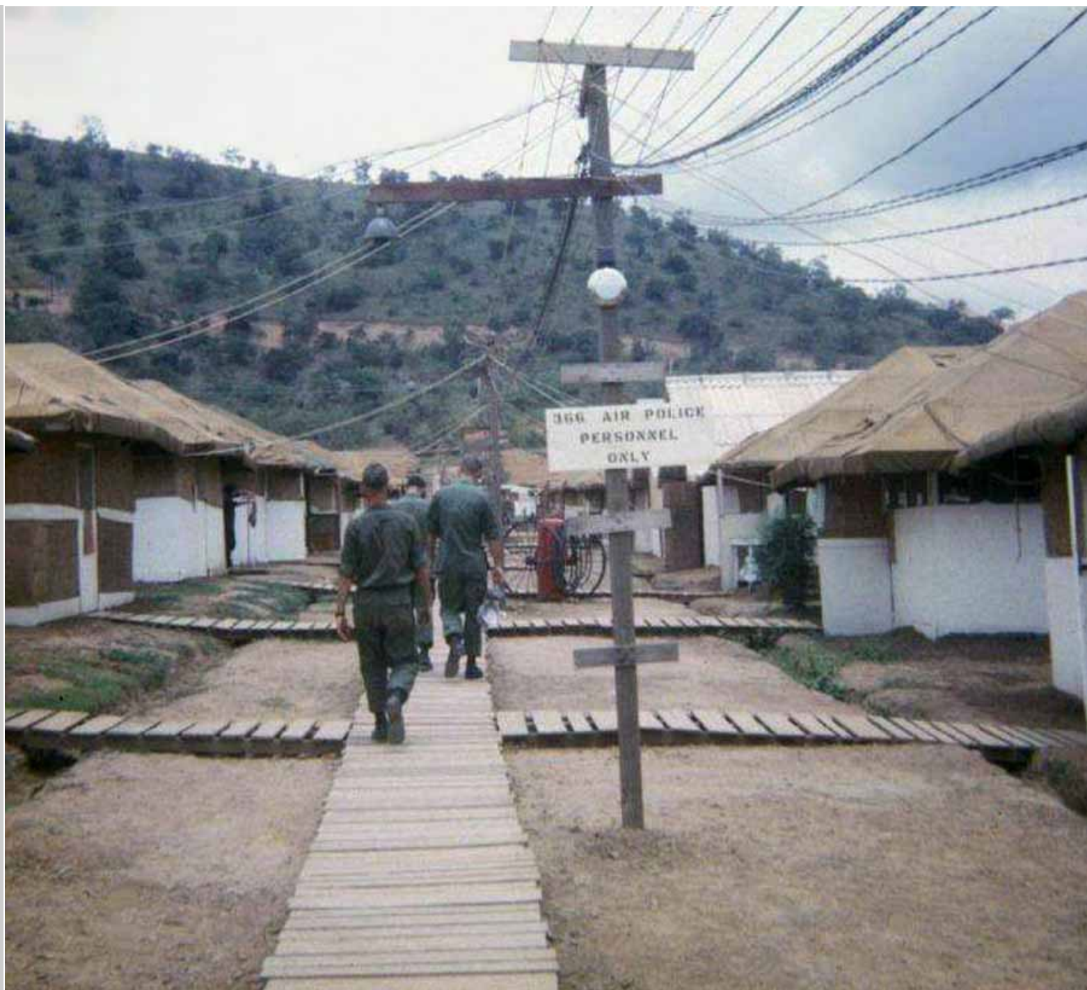
2. Phan Rang AB: Nui Dat Hill, 366th APS: Tent-Huts and wooden plank-walks for monsoon weather, with Nui Dat Hill in background.