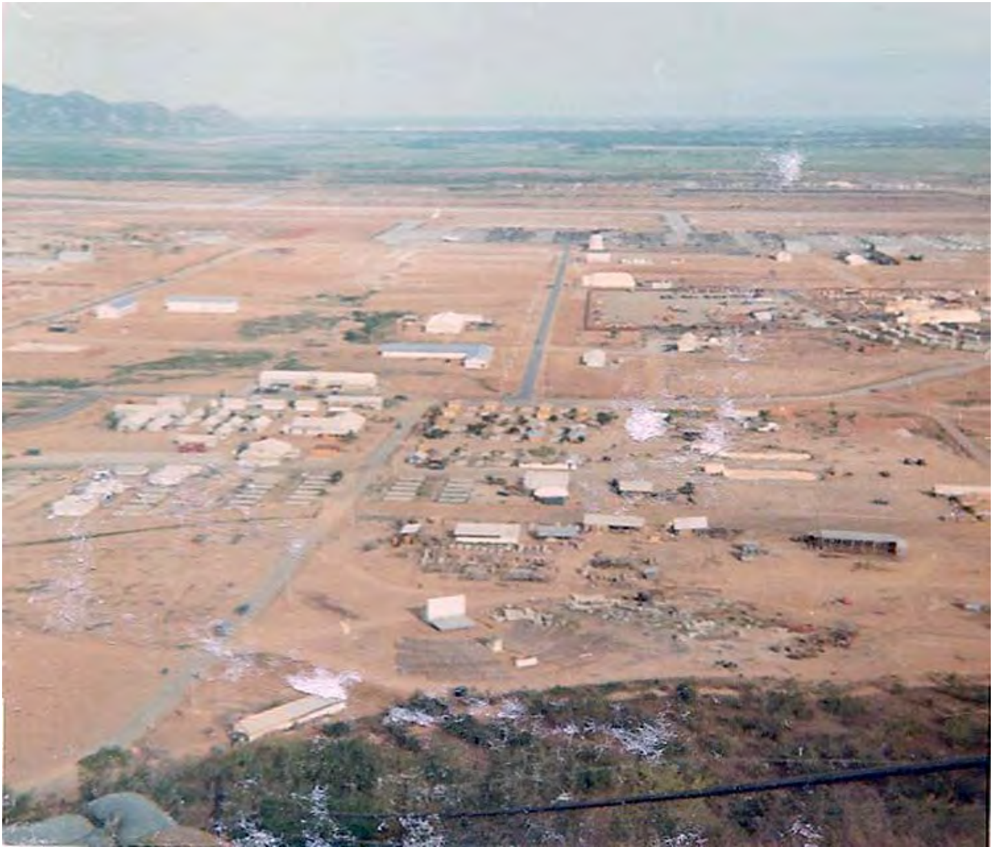
15. Phan Rang AB: Photo taken atop Nui Dat Mountain at OP-1.