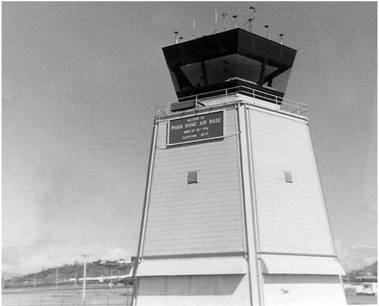
7. Phan Rang AB: Control Tower.