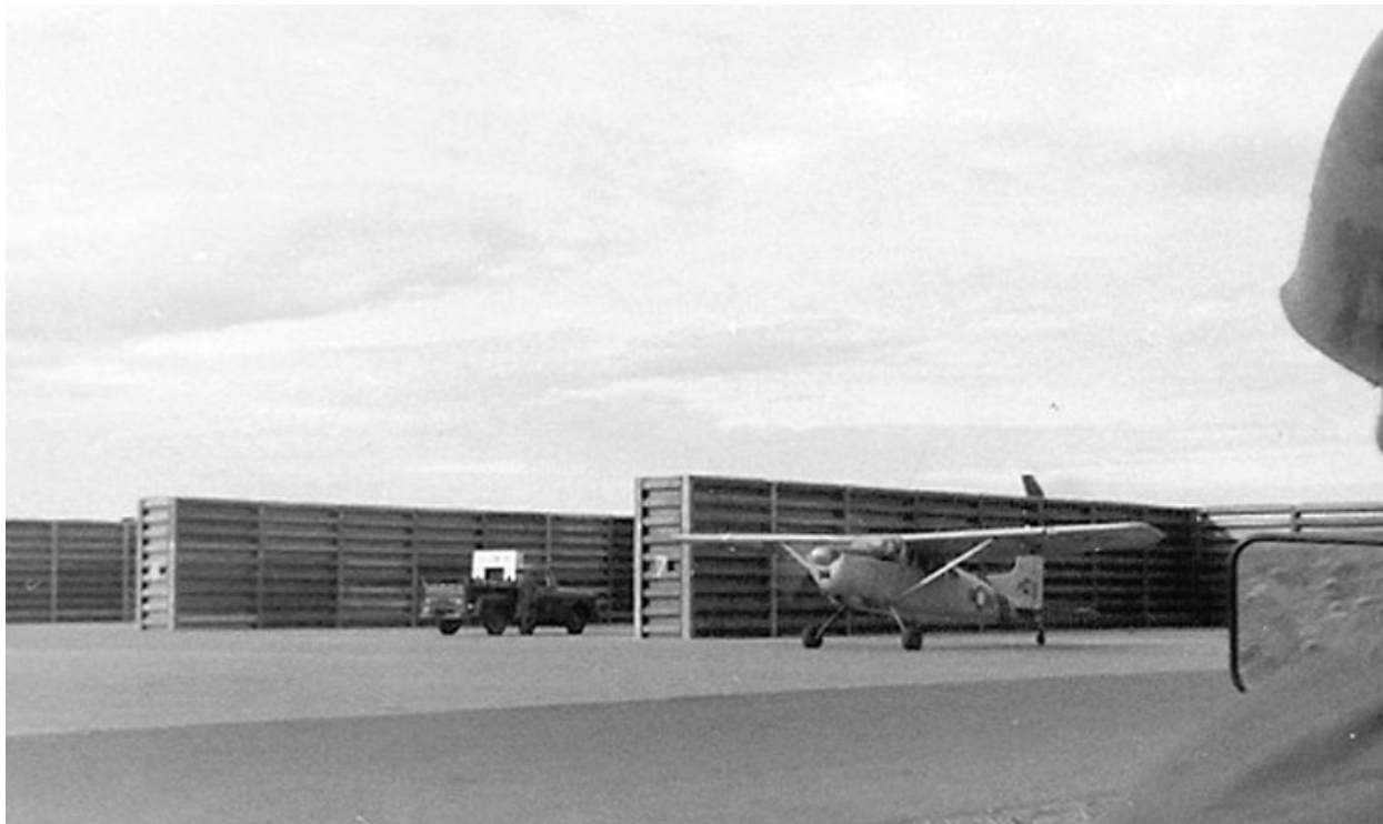
13. Phan Rang AB: Revetment Area.