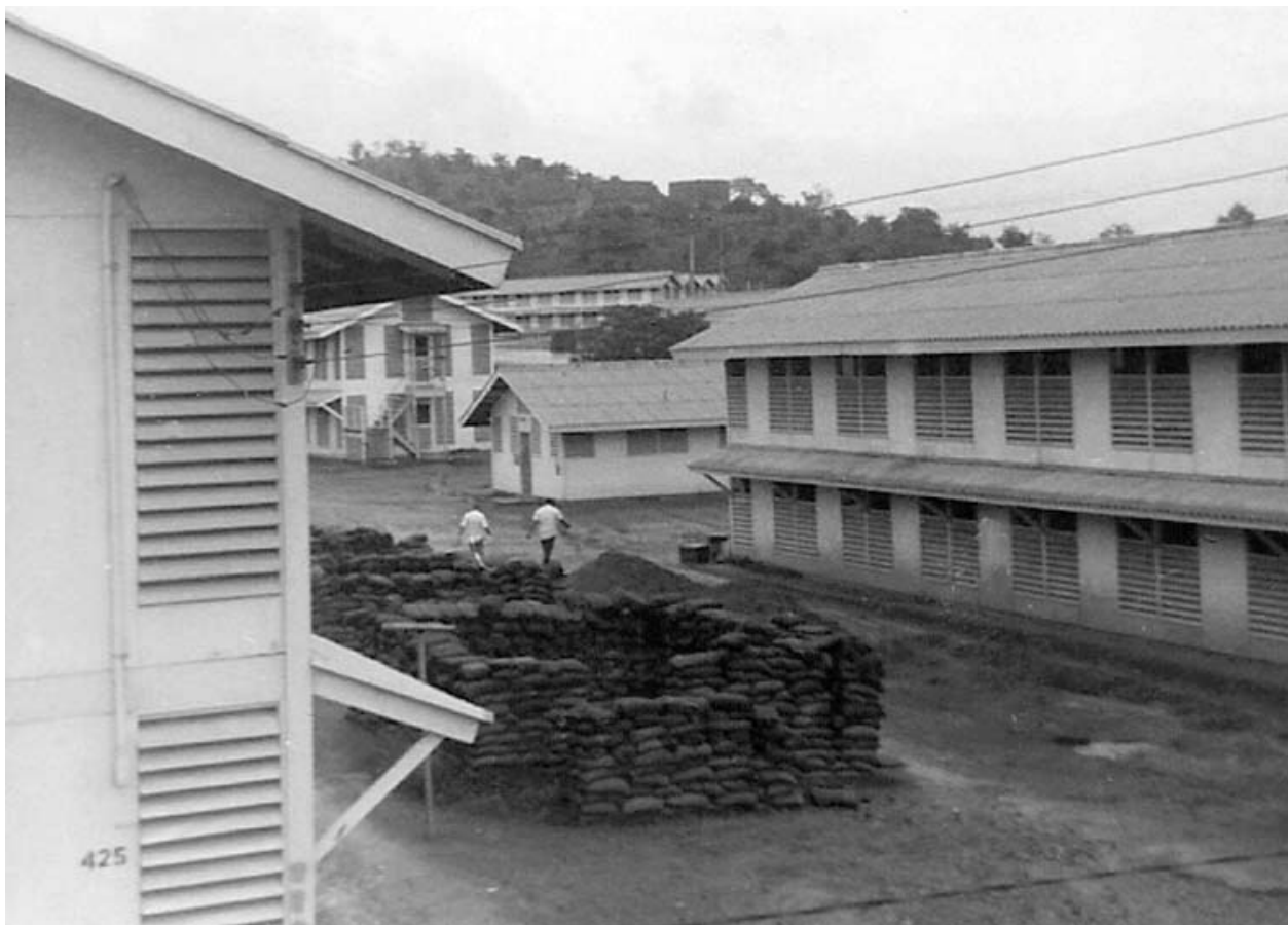
17. Phan Rang Barracks Area under construction.