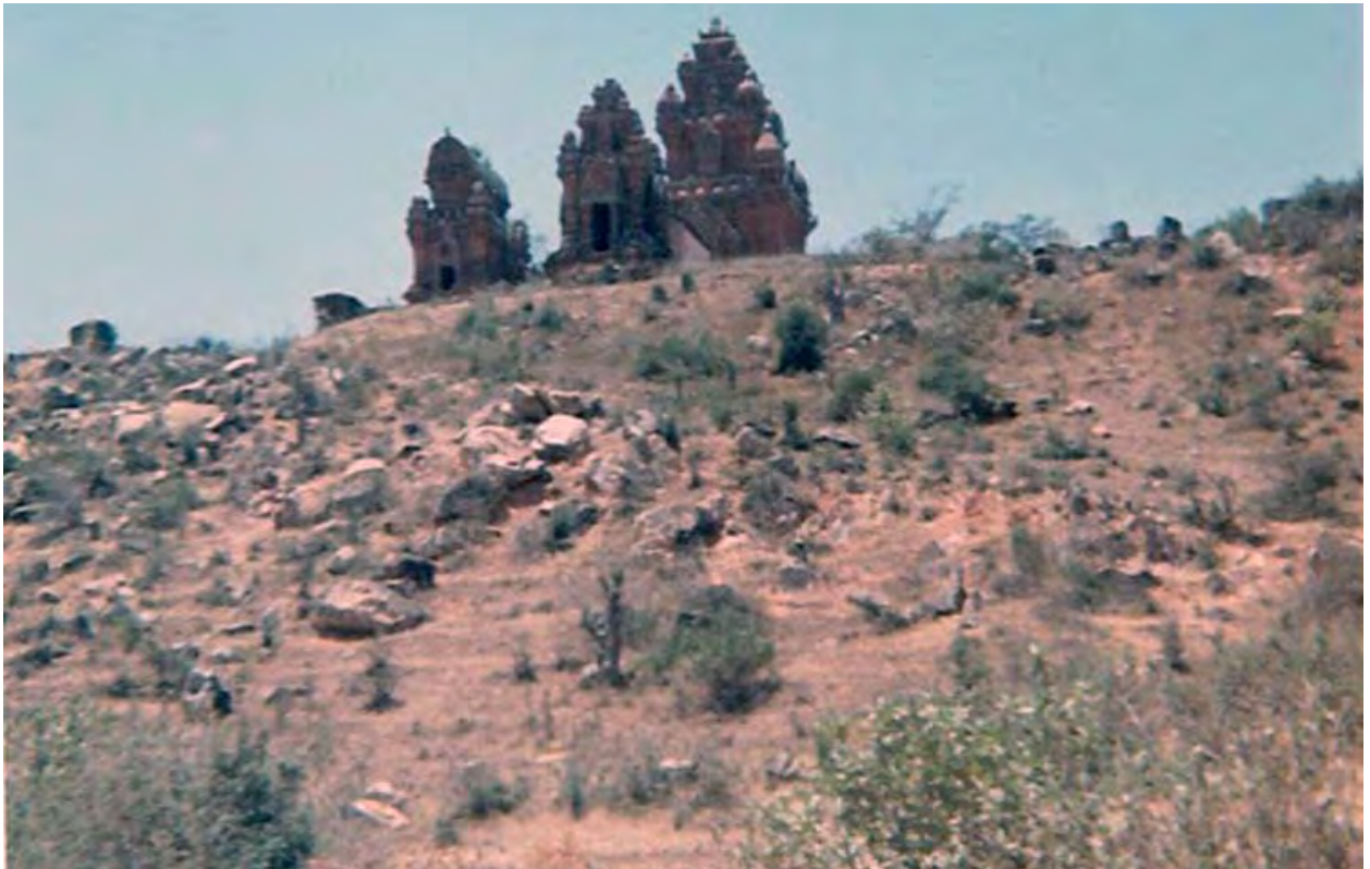
9. Phan Rang AB: Buddhist Temple outside PR Main Gate.