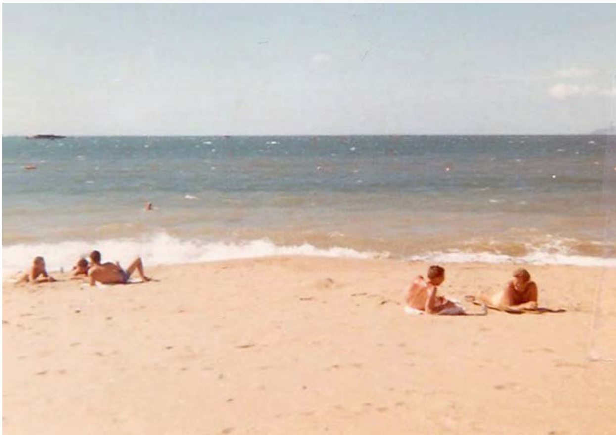
11. Phan Rang AB: Beach.