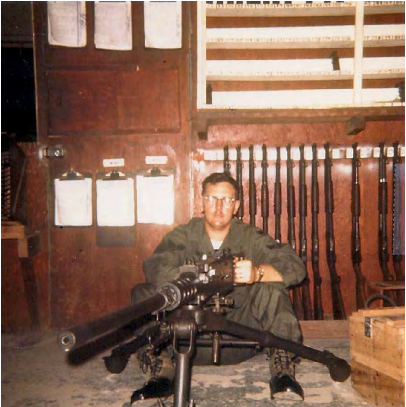
24. Phan Rang AB: Law and Security Weapons Room:.50 Cal. arrived at Phan Rang after Tet'68.