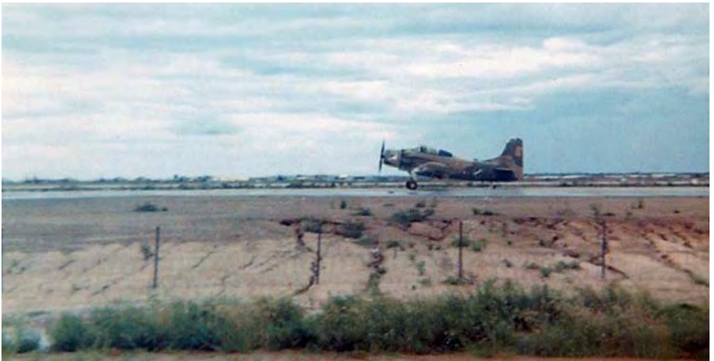
1. Phan Rang AB: A Vietnamese A1 Skyraider on the taxiway.

There was a hill you would pass going to the bomb dump. That hill was used for the AP firing range at the time. There were several towers past the Beach Gate (OP-2?), along the road to the bomb dump, that did not get guards posted very often. There were sandbag bunkers all along the wire between the towers and under the towers. I have a map from 1970 showing gates and tower numbers. Some were different from 1967 when I was there.