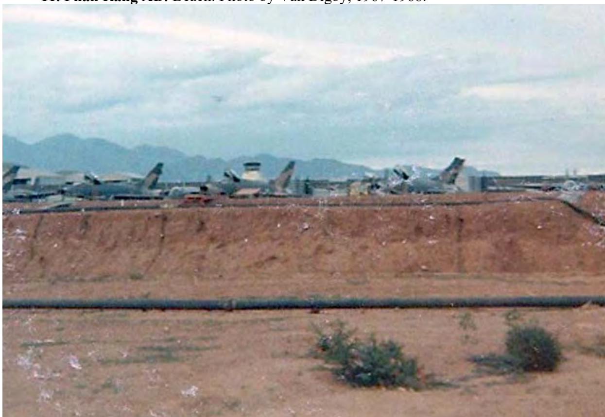
12. Phan Rang AB: F-100 Refueling Area.