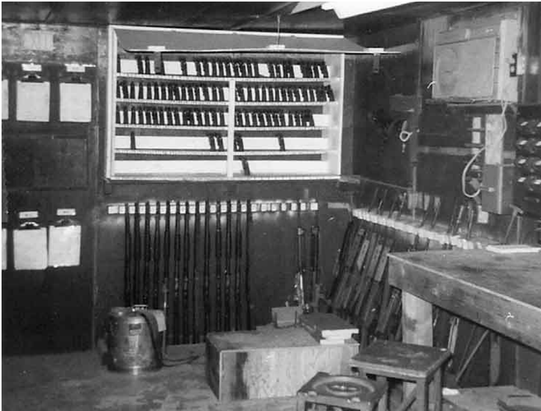
22. Phan Rang AB: Law and Security Weapons Room. Handguns, Shotguns and Weapons racks.