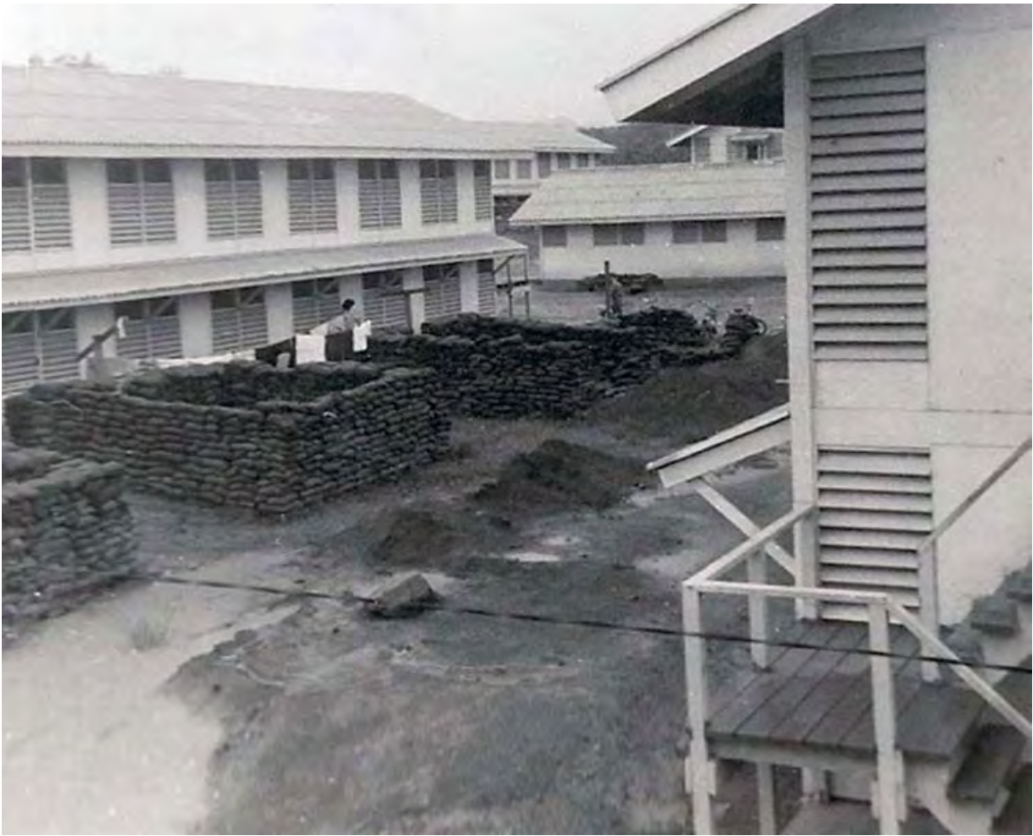
18. Phan Rang AB: Barracks Area under construction.