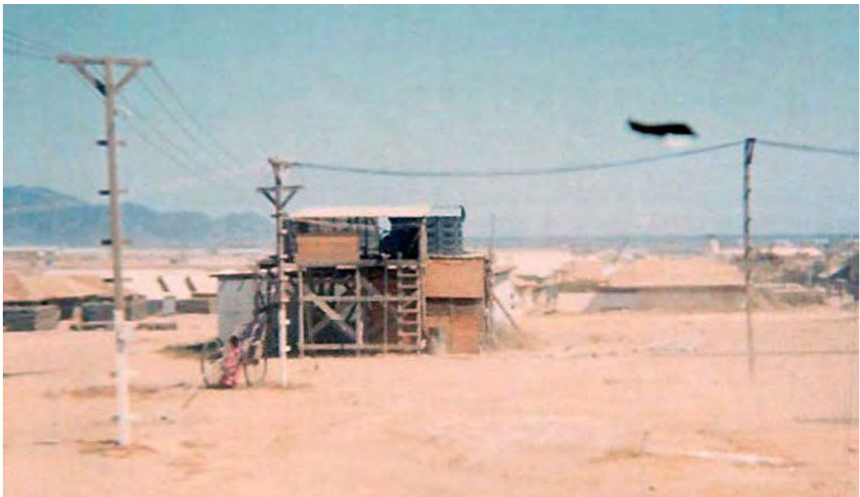
6. Phan Rang AB: Shower Room -- Get there early or water would be too hot.