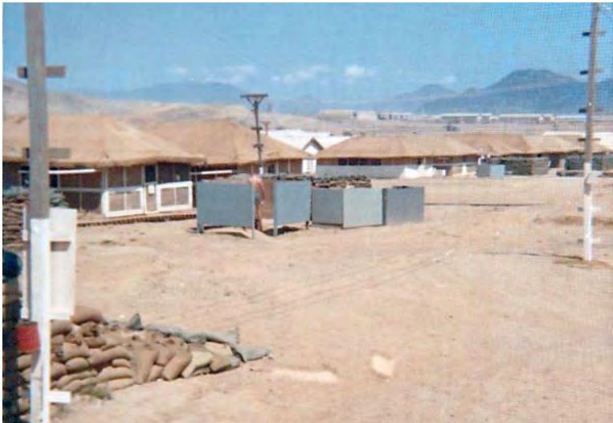
3. Phan Rang AB: Piss Tube at SP hooch area.