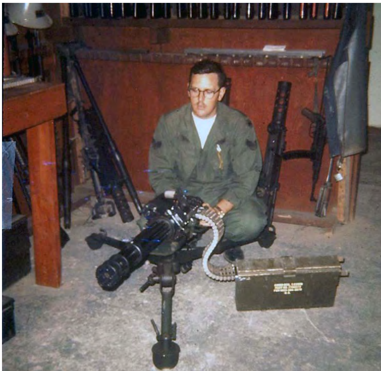
25. Phan Rang AB: Law and Security Weapons Room: Mini Gun arrived at Phan Rang after Tet'68.