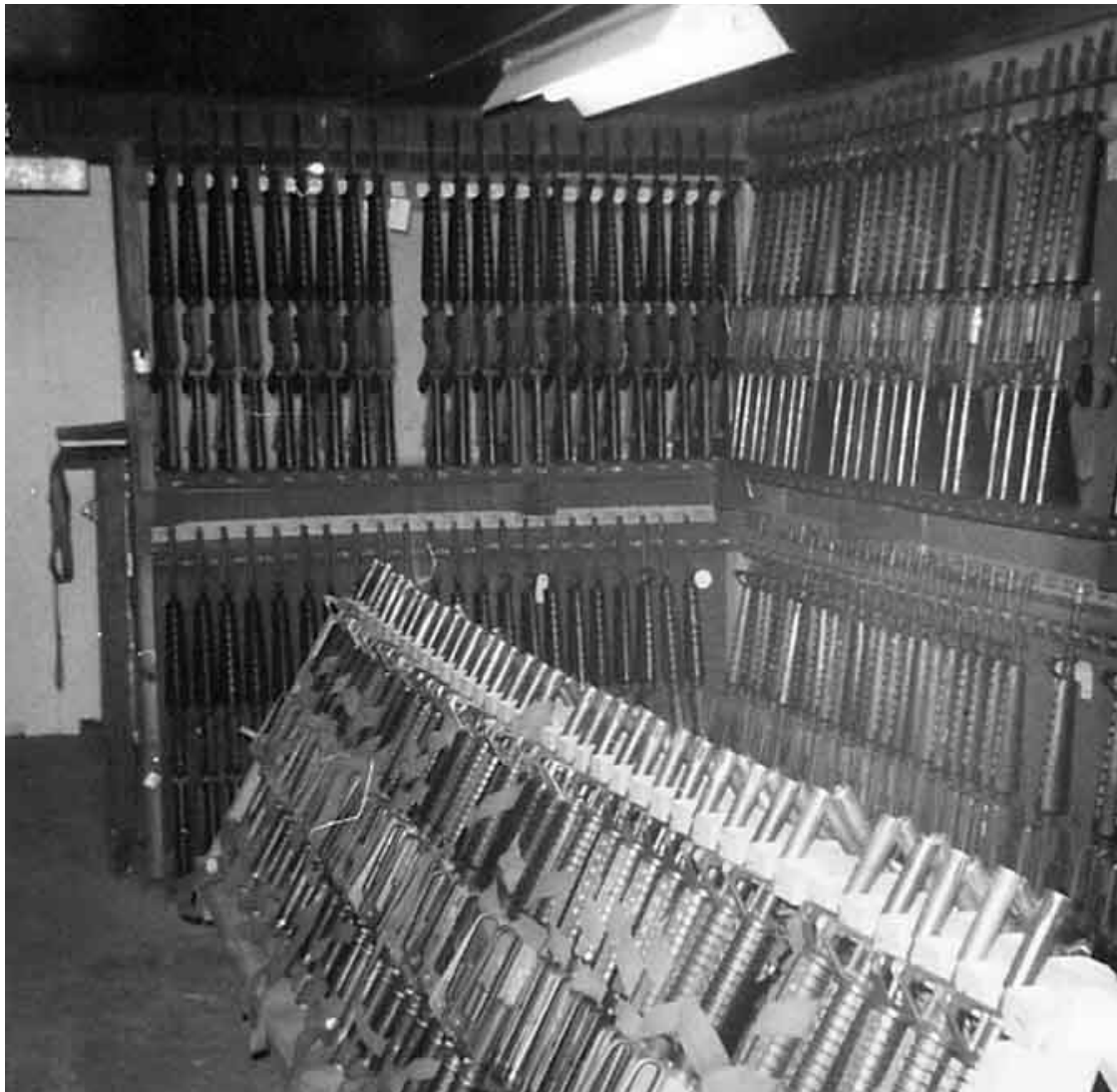
21. Phan Rang Law and Security Weapons Room, M16's Weapons Racks.