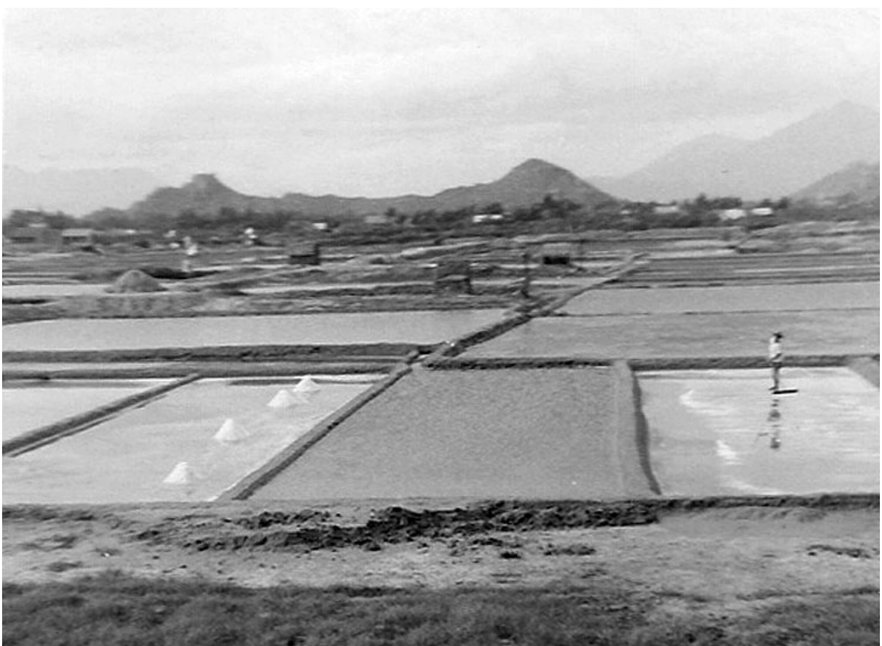
10. Phan Rang AB: Salt Farms outside Beach Gate.