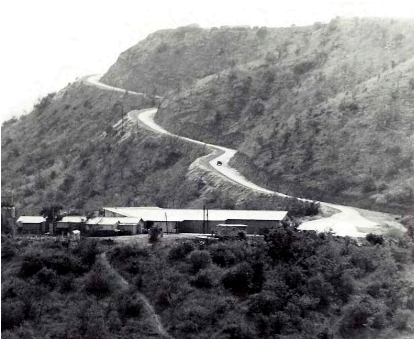
Nui Dat, NW of Phan Rang. Steep road to the top.