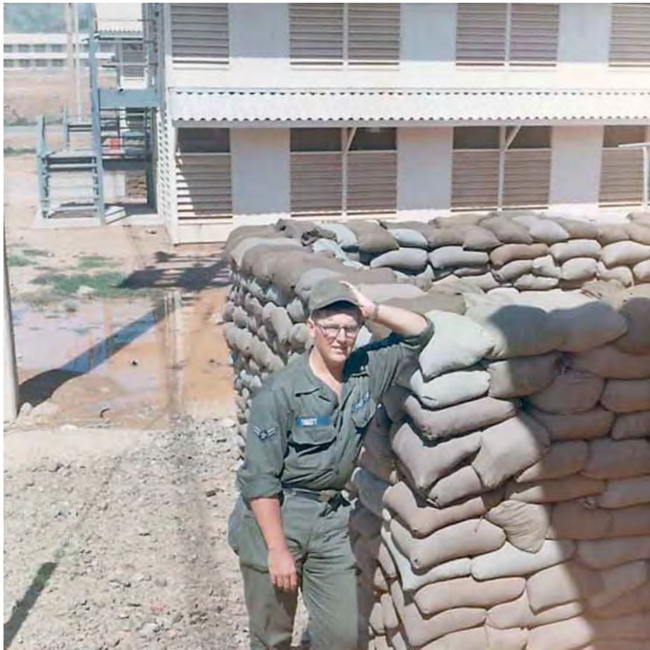
19. Phan Rang Bunkers under construction, A2C Digby. Photo by Van Digby, 1968.