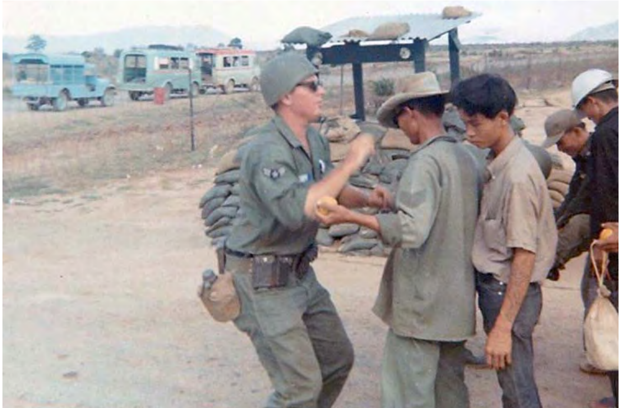
2. Phan Rang AB: Searching Vietnamese workers going home from bomb dump.