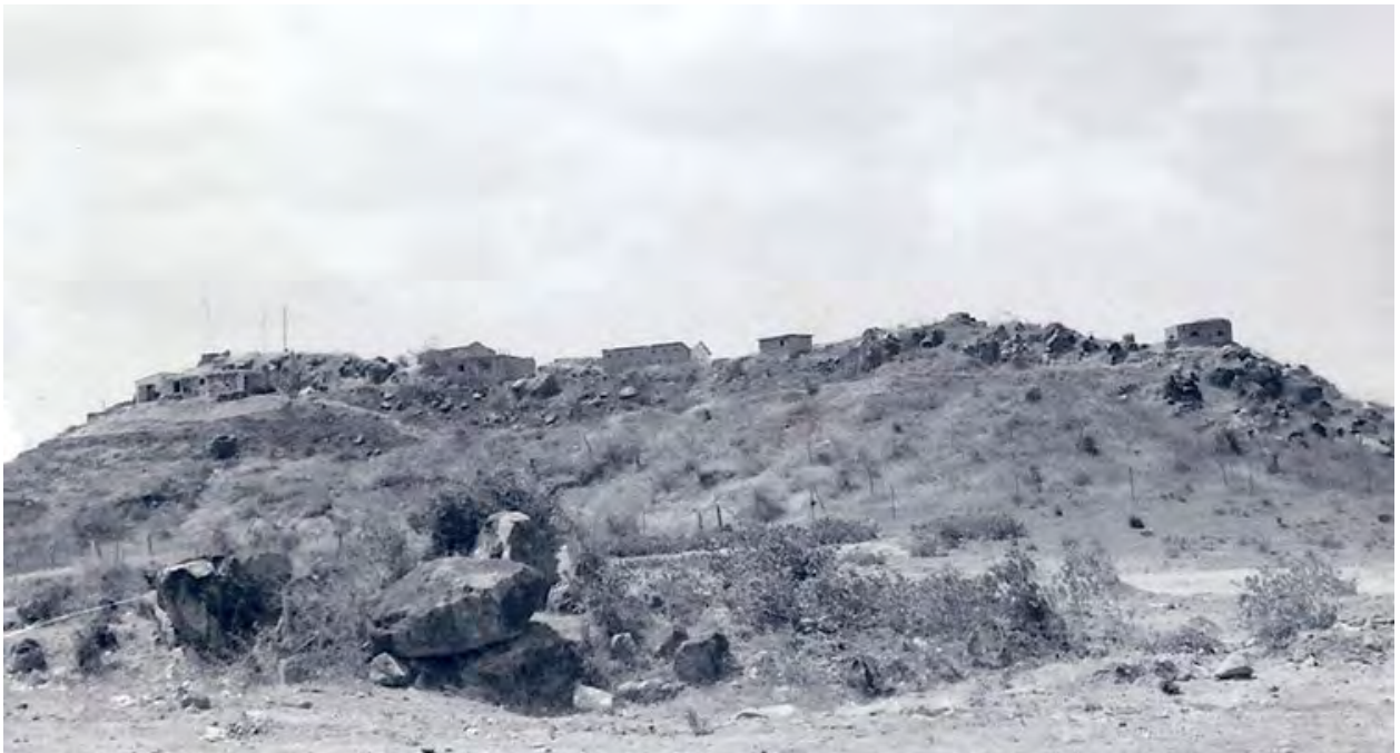
8. Phan Rang AB: PF or RF Outpost, north of Thop Chan.