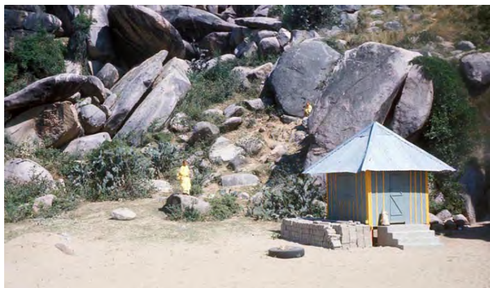
53 Phan Rang: Buddhist homes amongst boulder hillside.