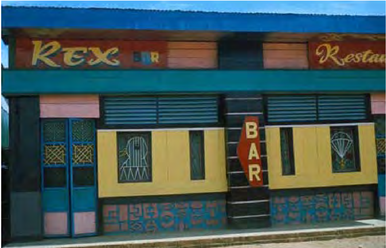
25. Phan Rang: REX Bar.