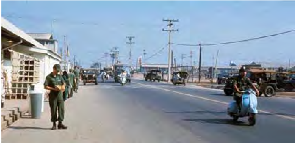
104. Tan Son Nhut AB, around the base.