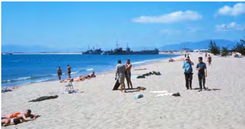
74. Thap Cham: Beach, with Navy LSTs at shore.