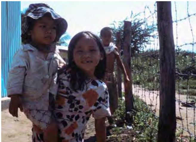
61. Thap Cham: Kids saying Hi to GI. [Do you think they remember us today?]