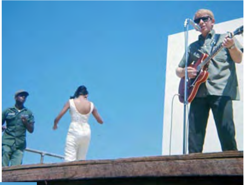
100. (above) Phan Rang AB: USO Jimmy Boyd Band. Dance With Me Henry!