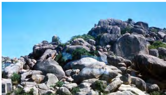
56. Phan Rang: Buddhist homes. View from vehicle on road to beach.