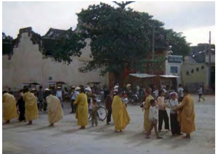
60. Phan Rang: Buddhist Monks in square.