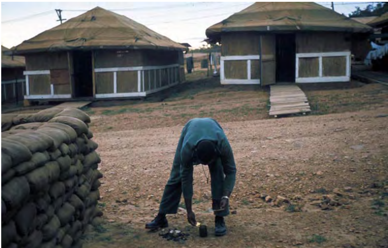
5. (below) Phan Rang AB: Who is he, and what's he doing ... up to something ... cooking C-Rats?