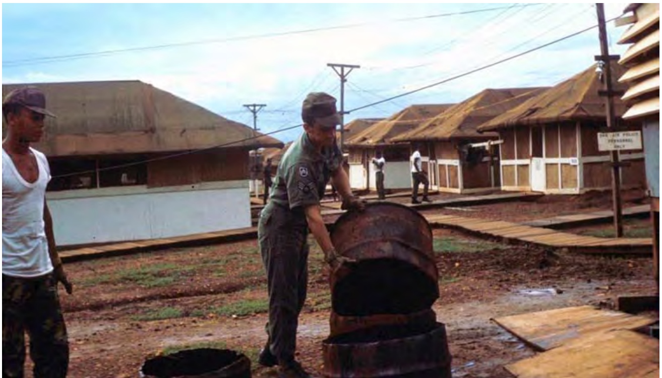
16. Stuff Burning Detail: Hey Airman! You busy? Six Hole (8 holes?) Outhouse Stuff Burning Detail.