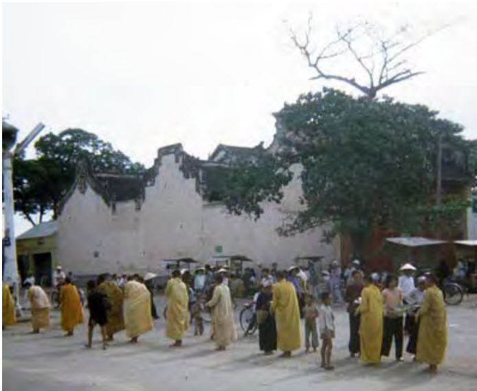
41. & 42. Phan Rang: Buddhist Monks in square.