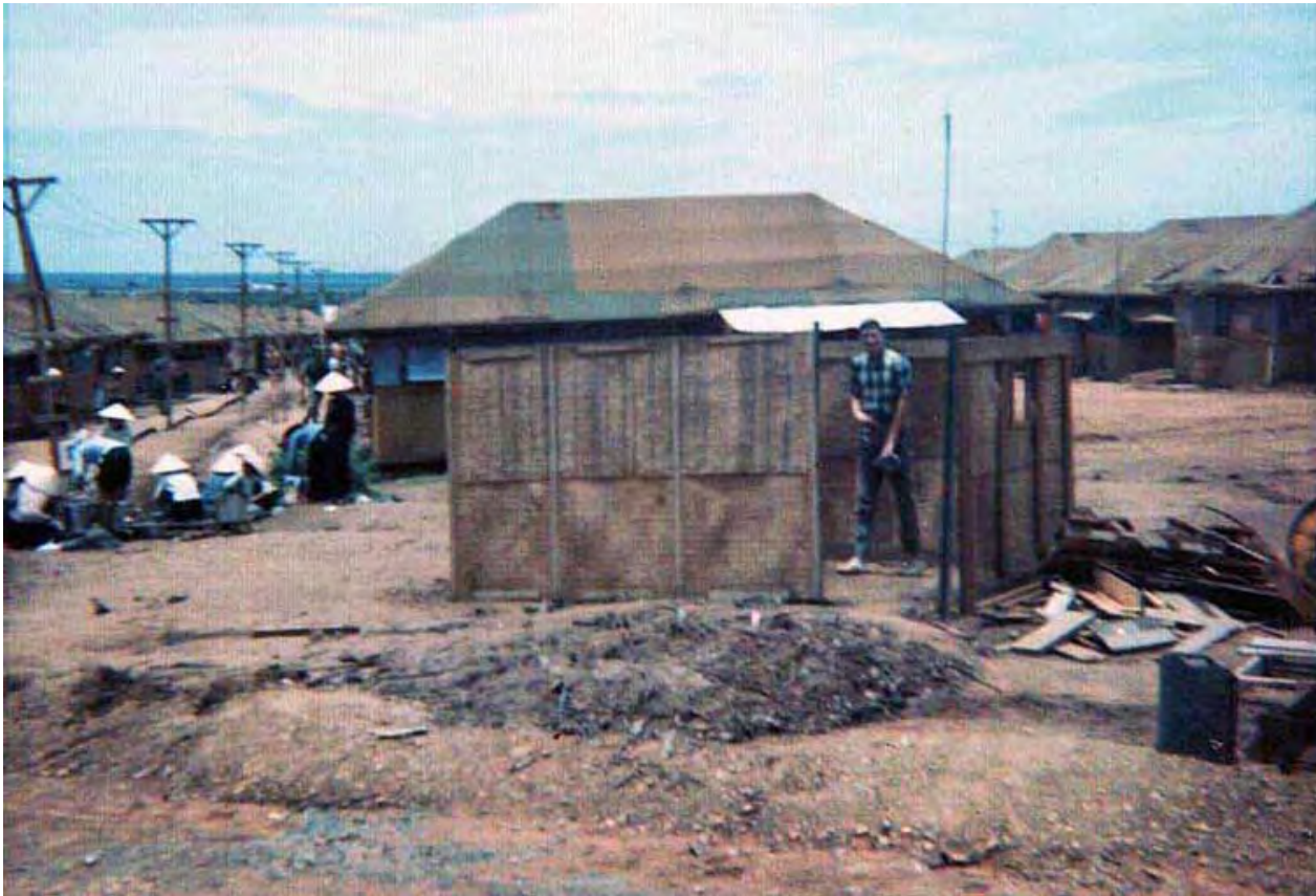
6. Phan Rang AB: Piss-Tube with courtesy-walls (early on, there were no walls). HEY!!! Is nothing scared anymore?