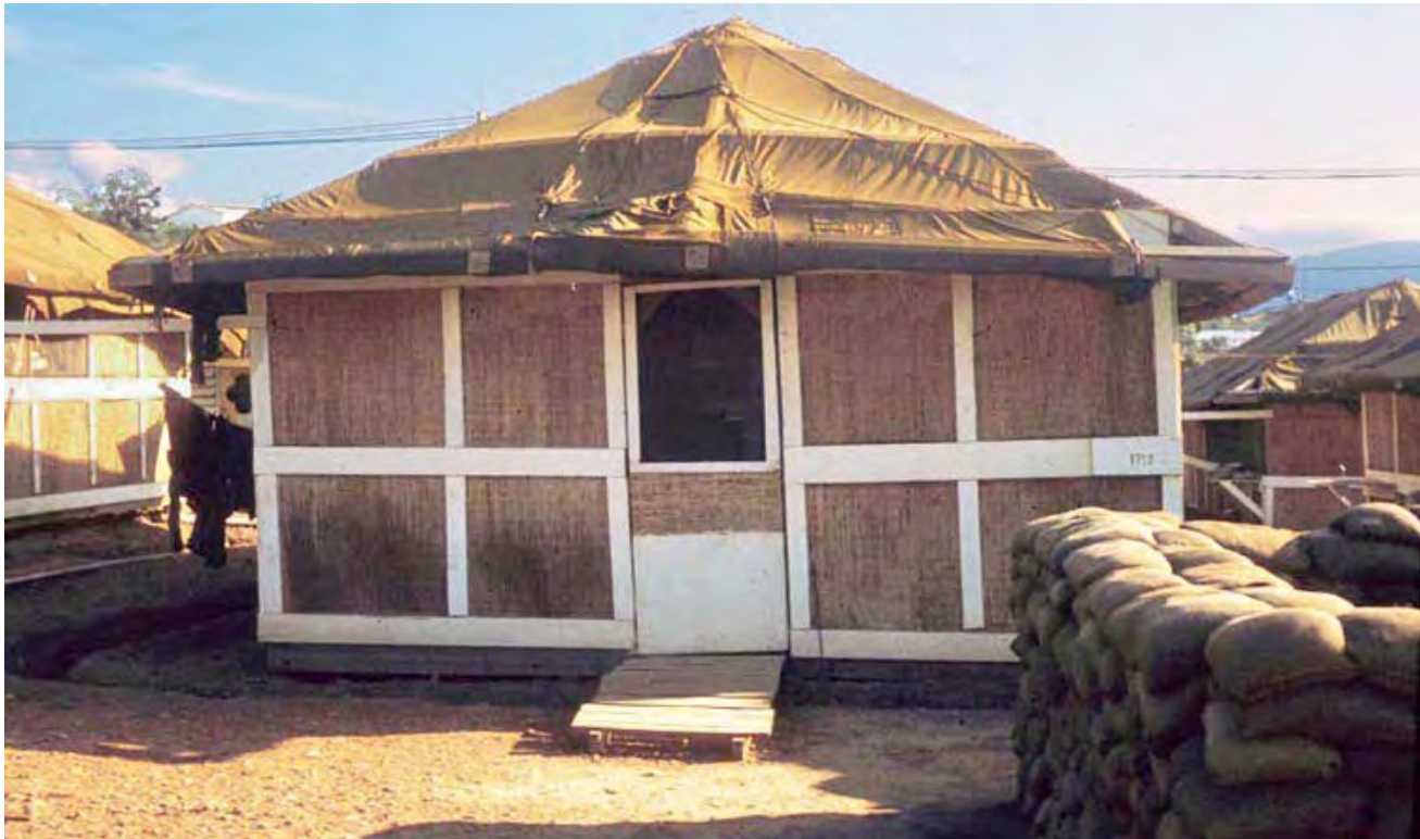
2. Phan Rang AB: 1966: New tent-huts and new sandbag bunkers -- we were going to need them.