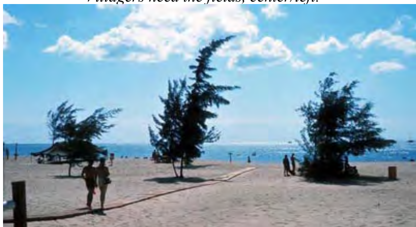
69. (above) The Beach: A day at the beach, and a little touch of home.