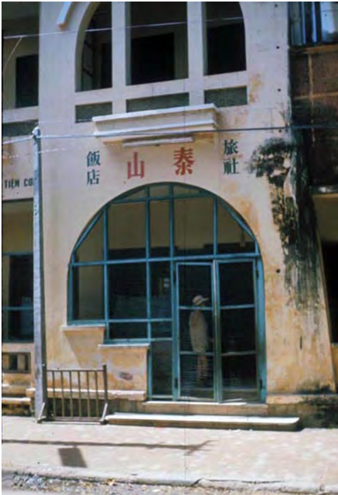
27. Phan Rang: nother Bar.