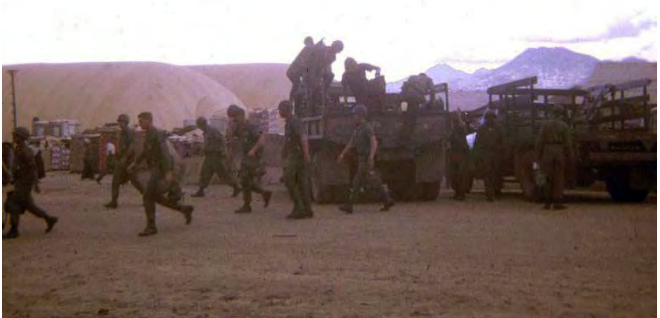
15. Phan Rang AB: 35th APS, Getting Off Shift. Note inflatable warehouses.