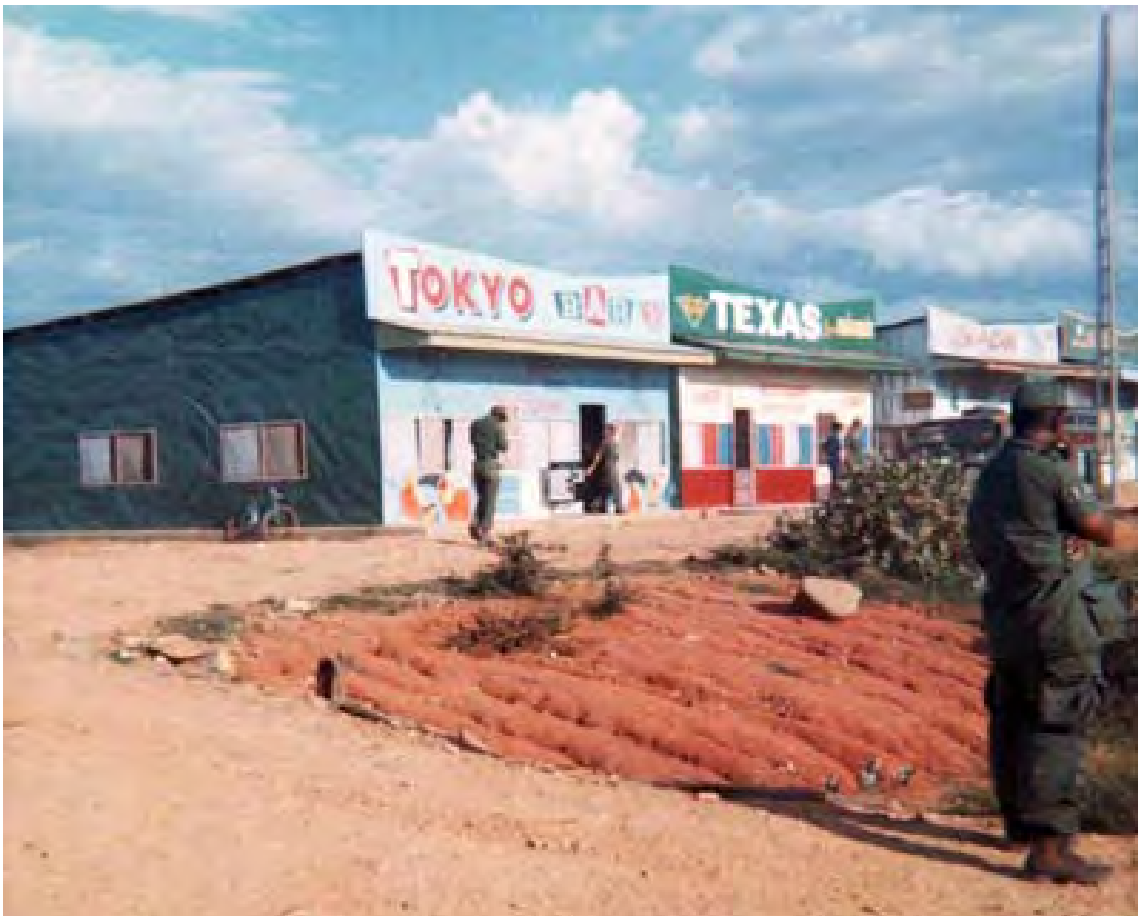
24. Early Phan Rang -- The Strip