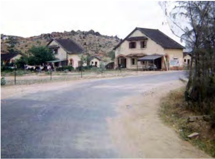
59. Phan Rang: Houses on road curve, heading back to base.