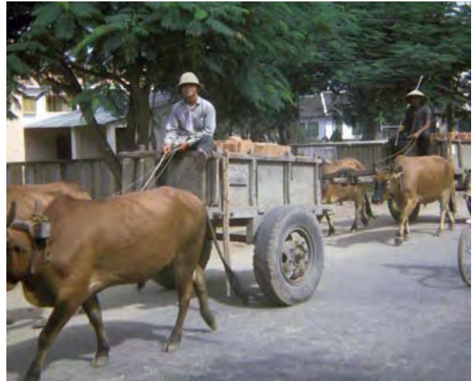
60. Thap Cham: Ox Carts loaded with bricks.