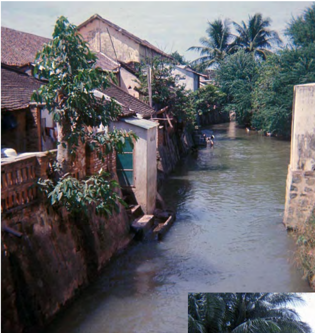
64. (left) Thap Cham river flows through village. Note mamasan scooping water. Fish, washie clothes, drinking water, sewer.