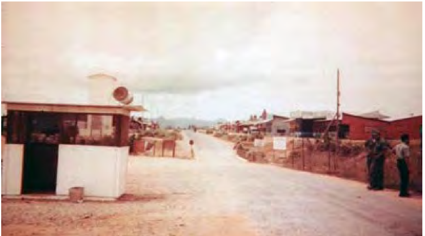
22. Phan Rang AB: Early 1966: Main Gate.