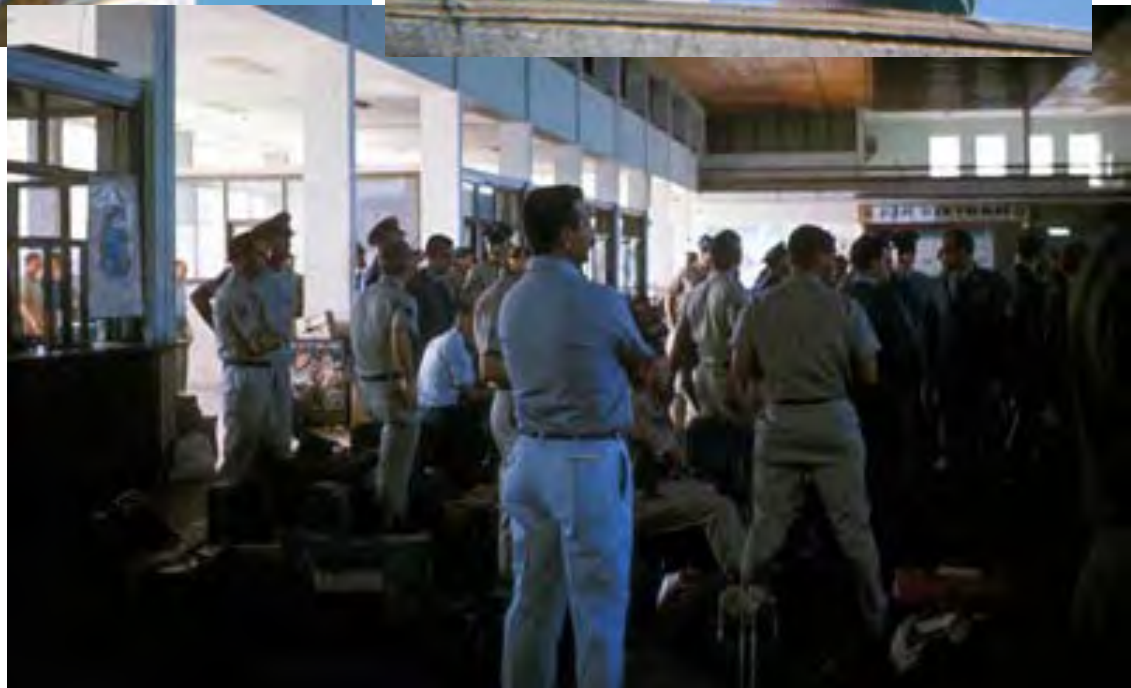
103. (right) Tan Son Nhut AB, Airport., Departures: R&R, PCS, DEROS.