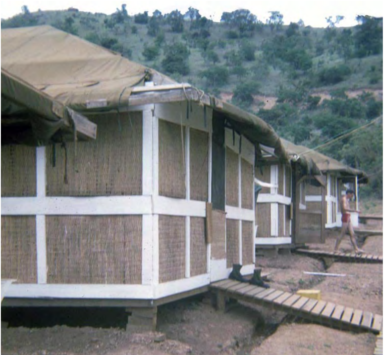
1. Phan Rang AB: 1966: New tent-huts, with wooden walkways and storm drains.