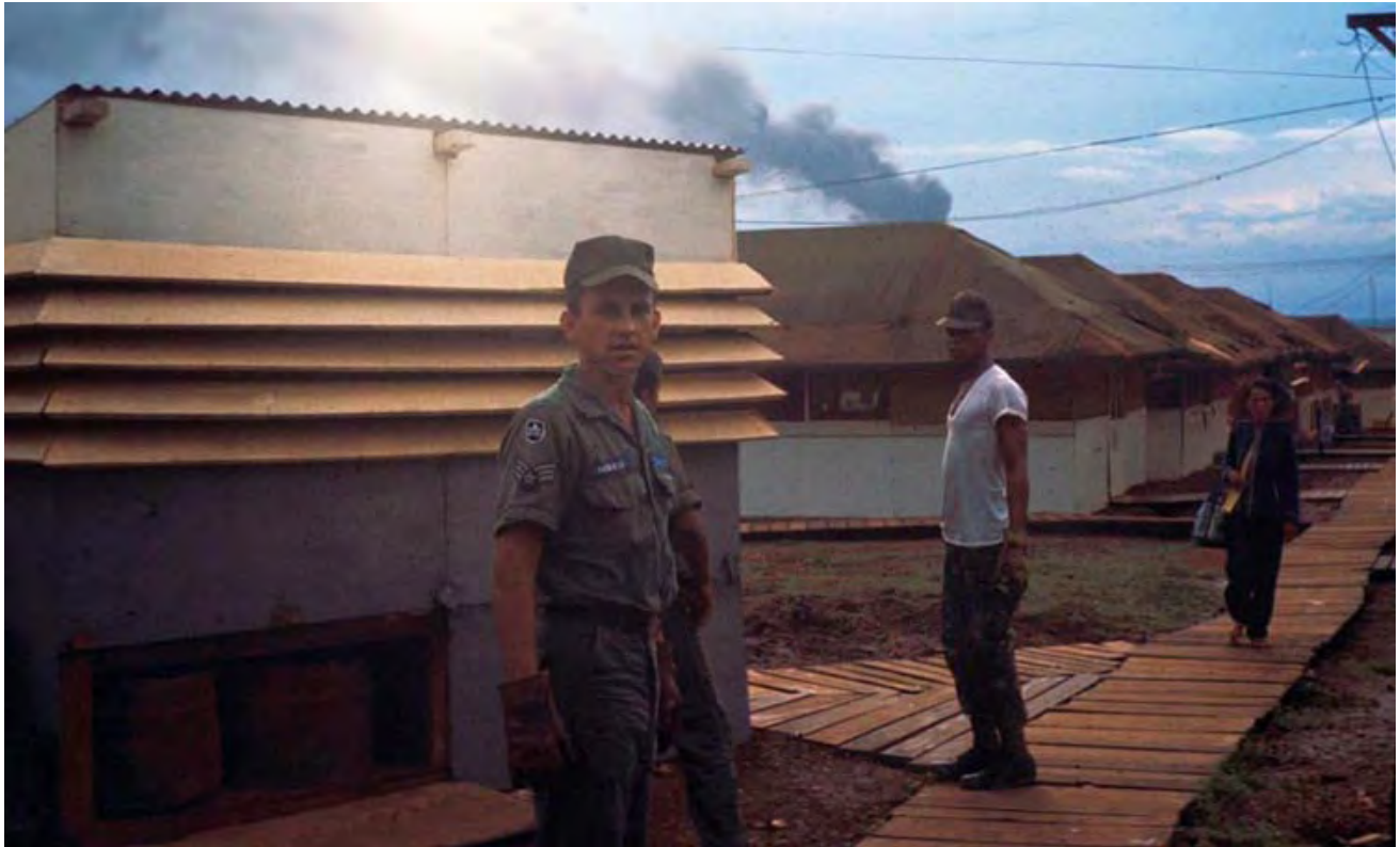
17. Happy in My Work! Where's the diesel?