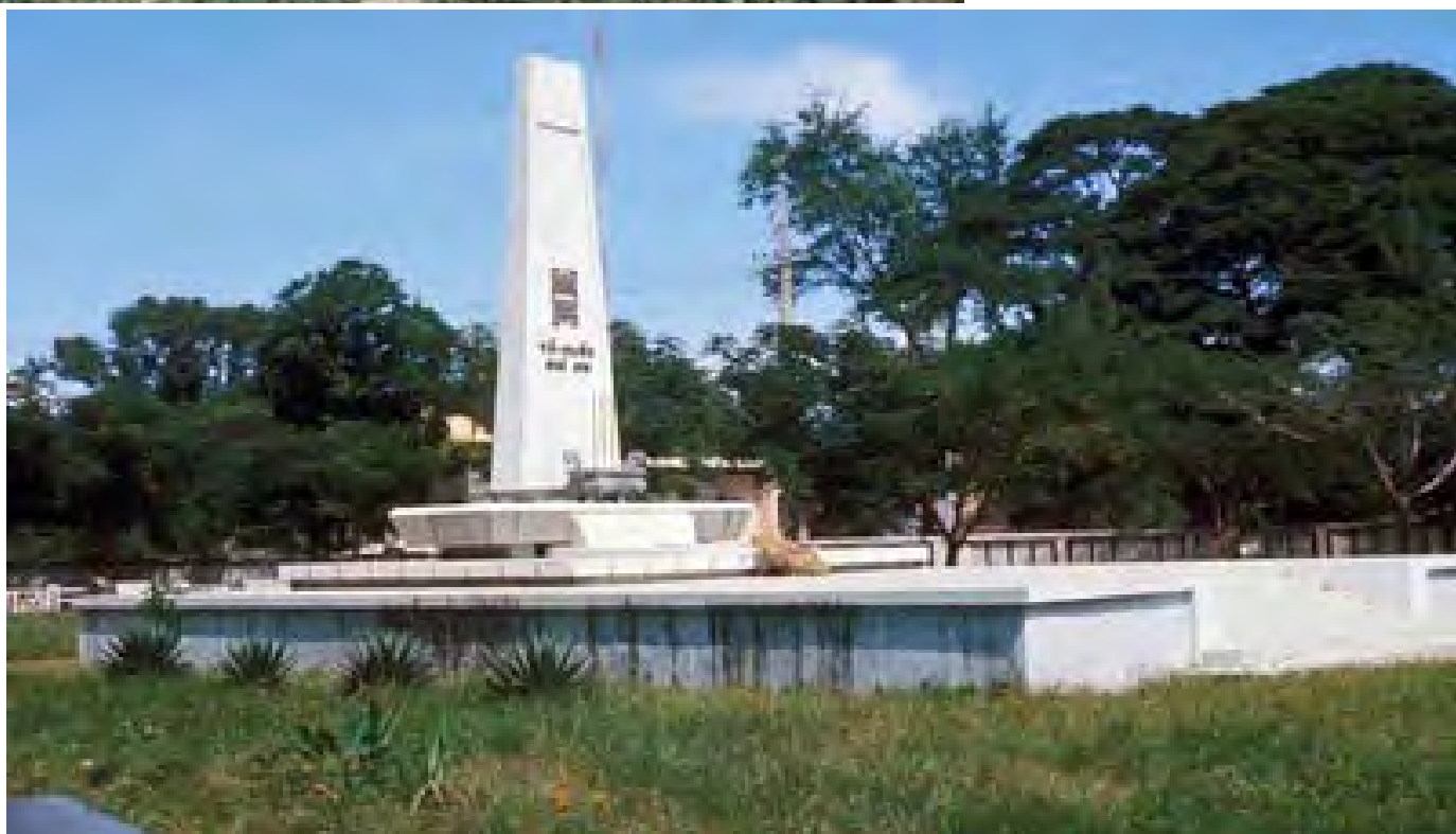
58. Phan Rang: ARVN War Memorial.