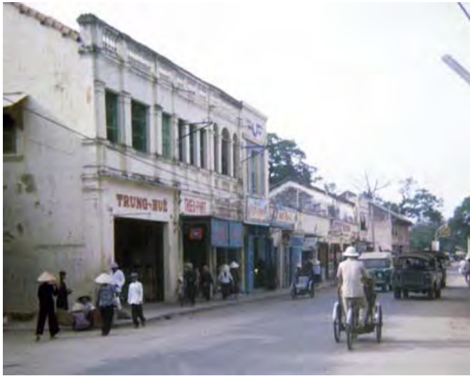
43. Phan Rang: Rush Hour.