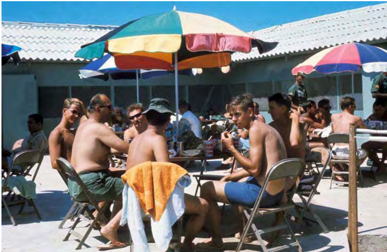
72 Thap Cham: Beach... and sodas... and buffalo-burgers... and don't tell anybody about this place!