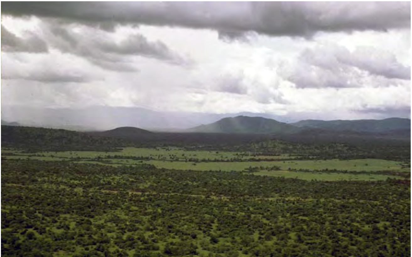
66. Road to Beach. You've got to admit... there was beauty in South Vietnam's countryside, worthy of quiet appreciation. I'm not sure exactly where that was. Looks like a view from Nui Dat, but there was no road running through there then (?).