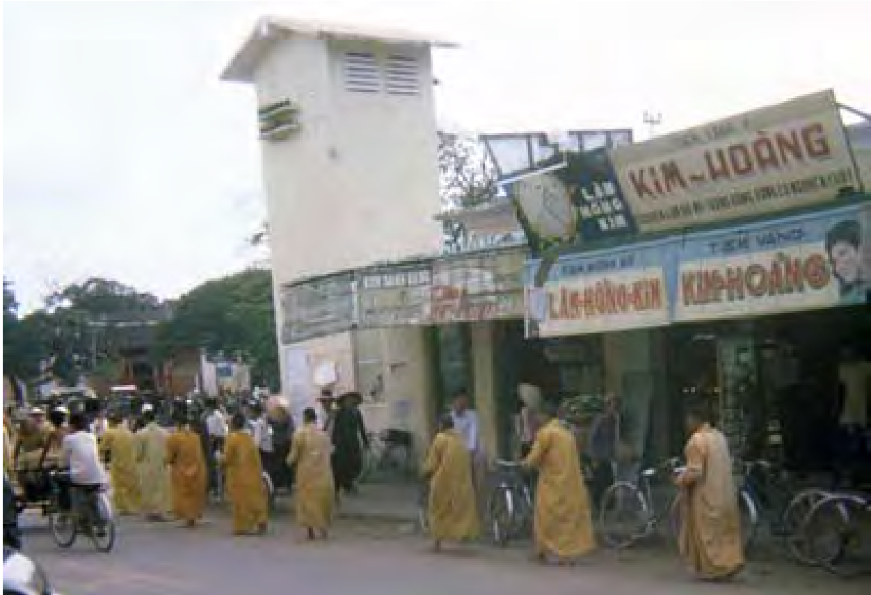
40. Phan Rang: Buddhist Monks downtown