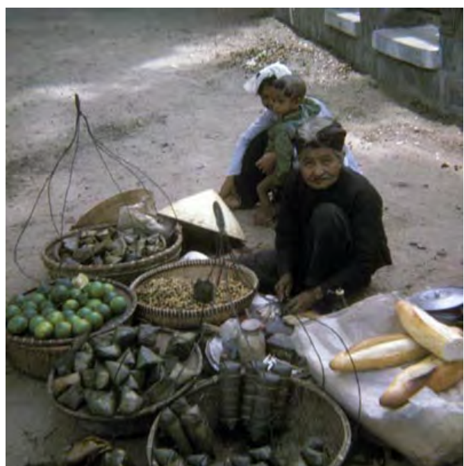
52. (right)Market Place. Granny and kids selling fruit.