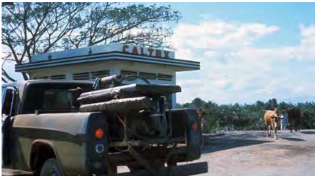
63. Thap Cham, Gas Station along road to Beach. Villager herds moo-cows.