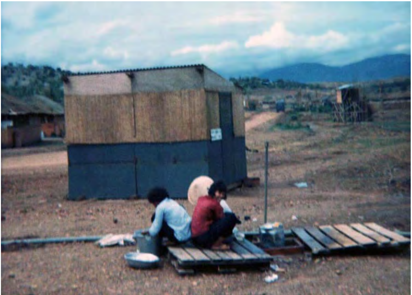
19 Let's washie clothesie by this nice crapper.