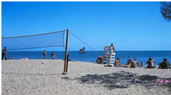
74. Thap Cham: Beach... Hey--look'at the boat!