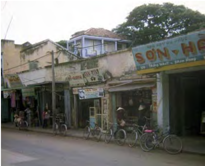
45. Phan Rang: Another Bar.