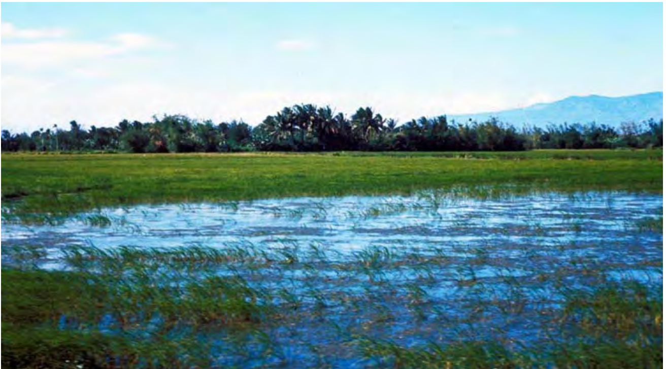
67. Thap Cham: Road to Beach. Rice Paddies grace the landscape. Here and there, a farmer surveys his land... and water buffalo graze.