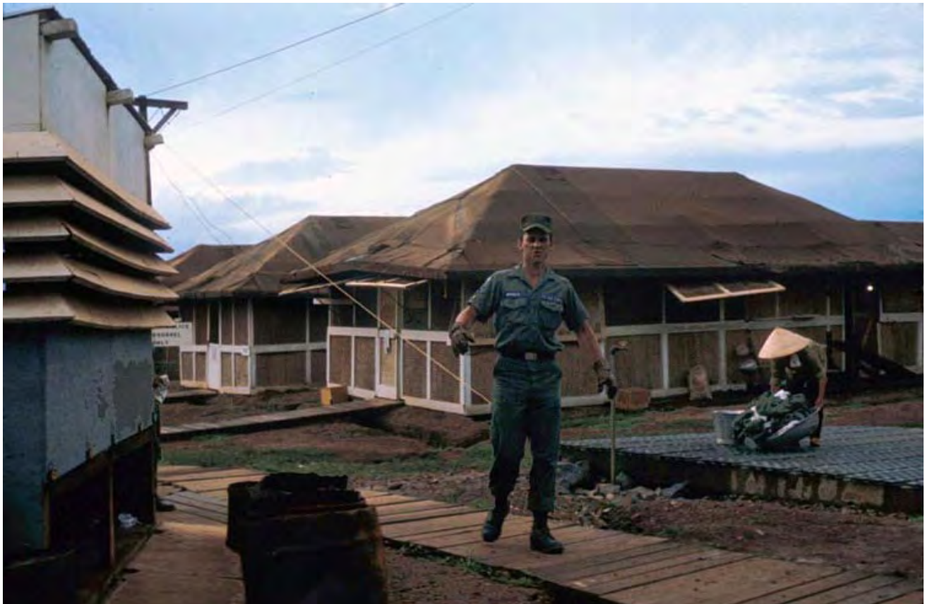
18. Not Happy in My Work!