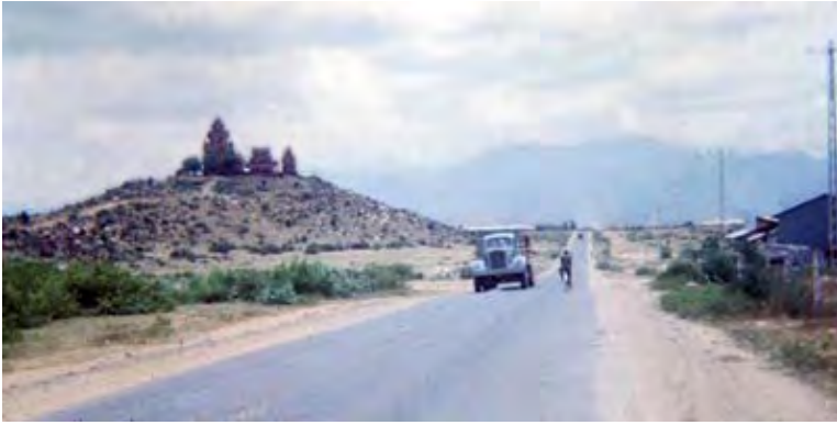
94. Thap Cham: Pagadoa Hilltop.