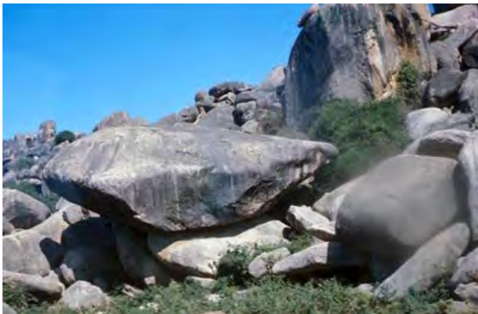
57. Phan Rang: Buddhist homes. Giant boulders.