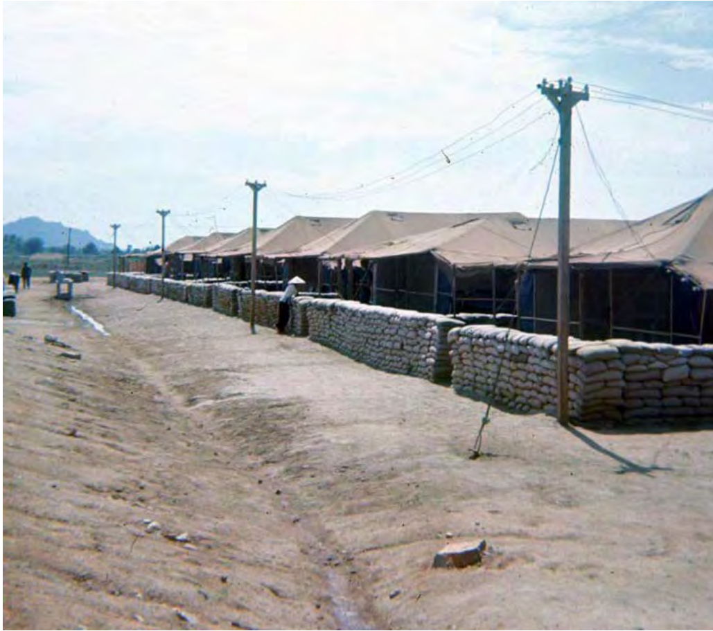
9. Phan Rang AB: US Army area, with Rows of Tent-Huts walled-in with sandbags. Soldier, center-far-left: HEYYYYYY... DINKY-DAO -- Quit Stealin' them sandbags!