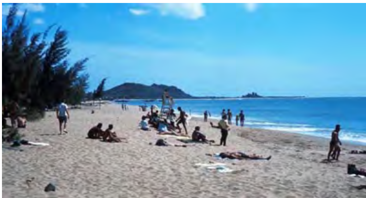
73. Thap Cham: Beach... and... and... HEY! Where're the babes?