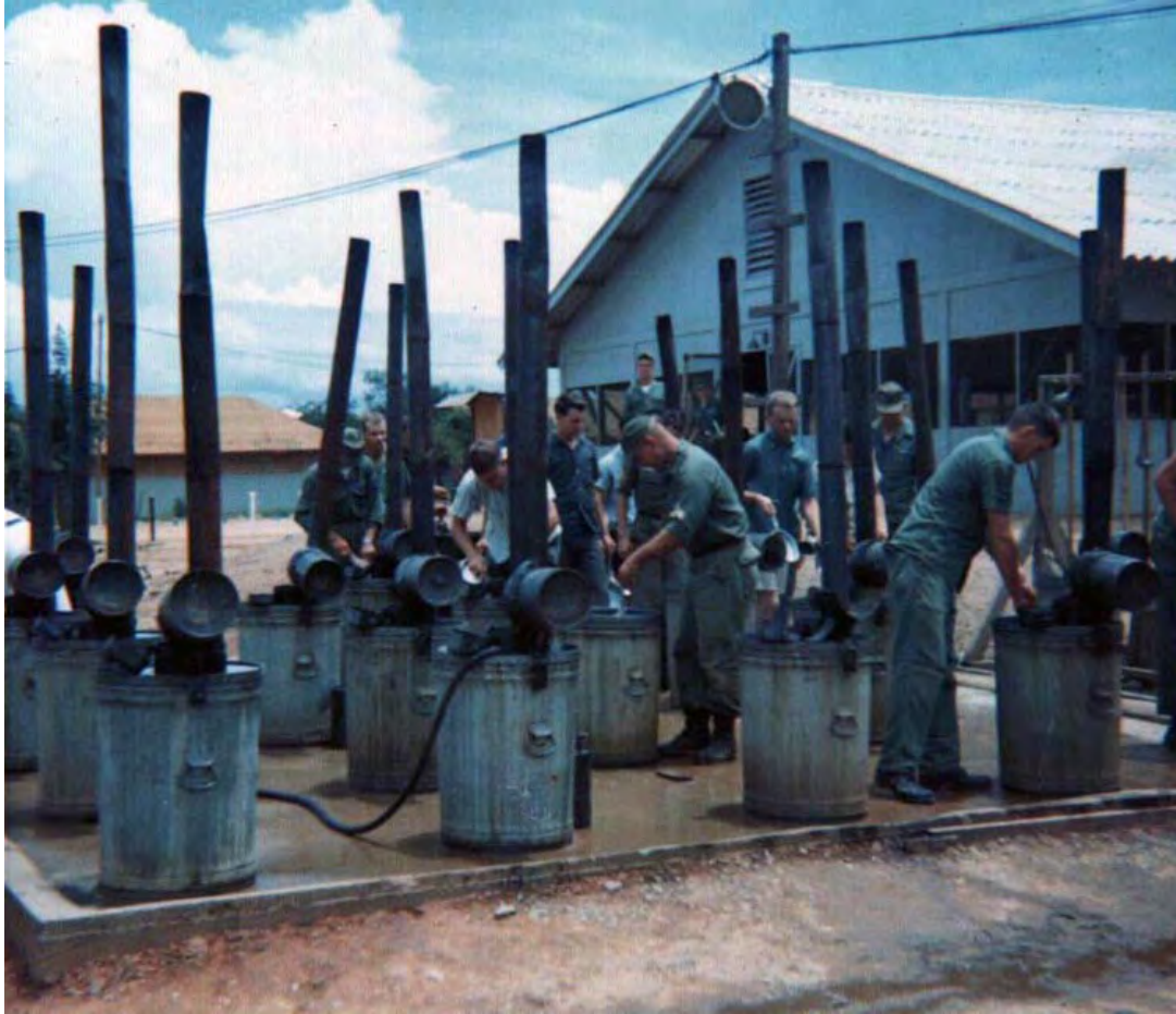
21. Phan Ran AB: Airmen washing Mess Kits.