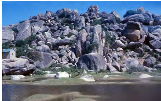
54. Phan Rang: Buddhist homes. Note fisherman.