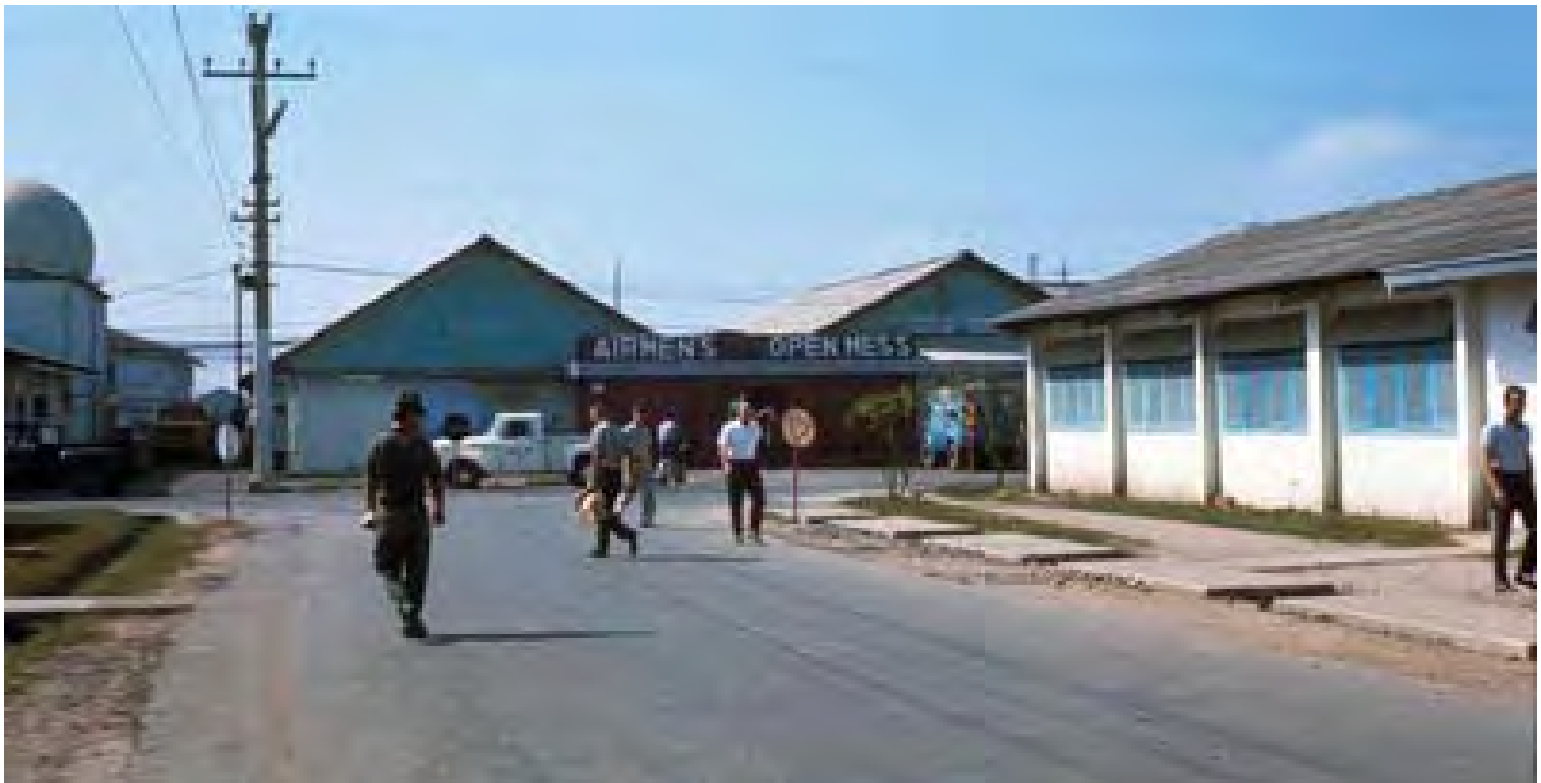
105. Tan Son Nhut AB, Airman's Open Mess.