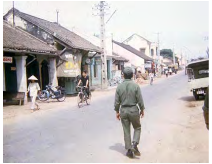
44. Phan Rang: Soldier in Thap Cham. Lookie at all the Bars... so many decisions.