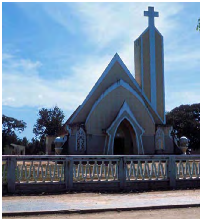
49. Phan Rang: Christian Church across the bridge.