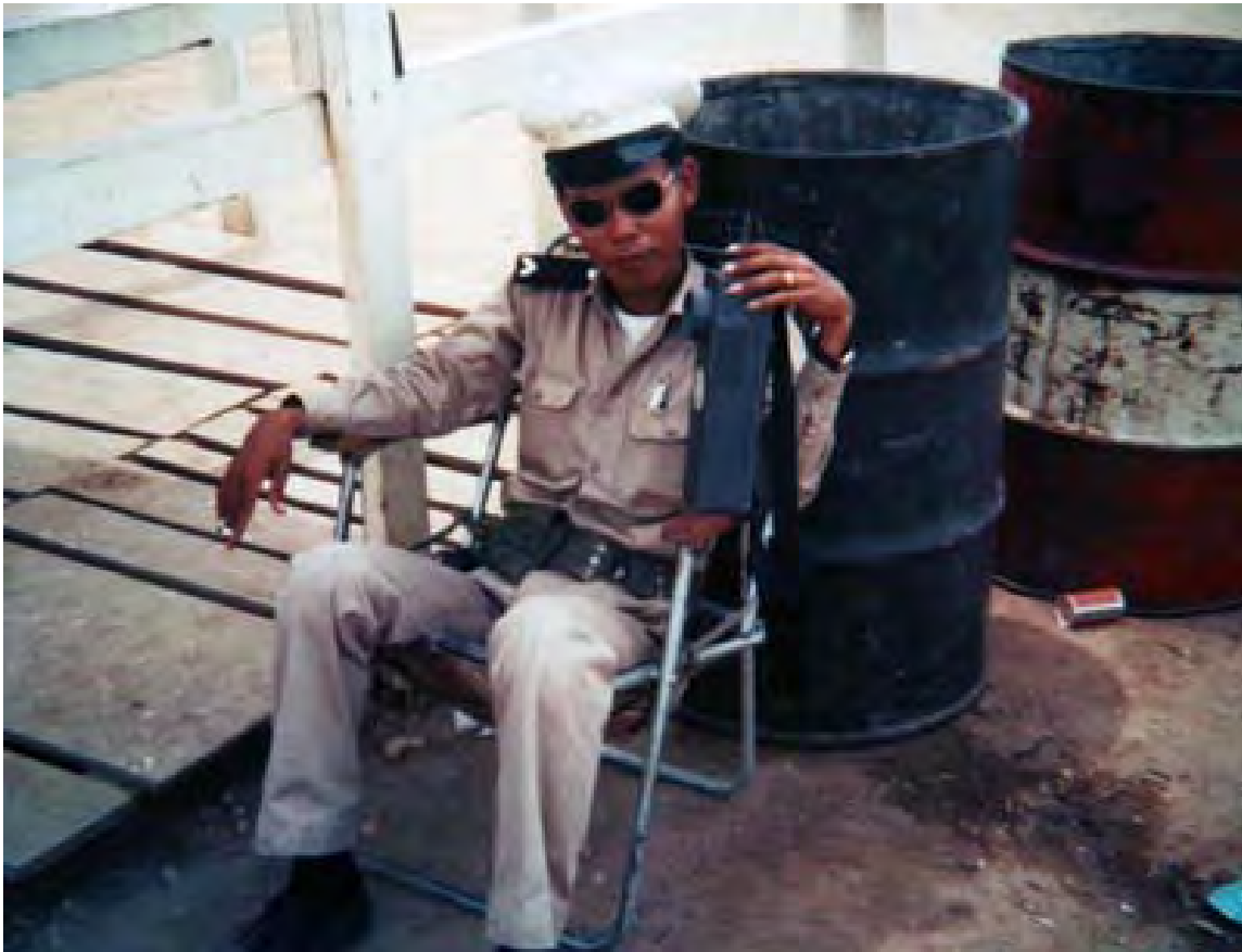
23. Phan Rang: Main Gate QC-White Mice.Hey GI...can't you see I'm on Break!