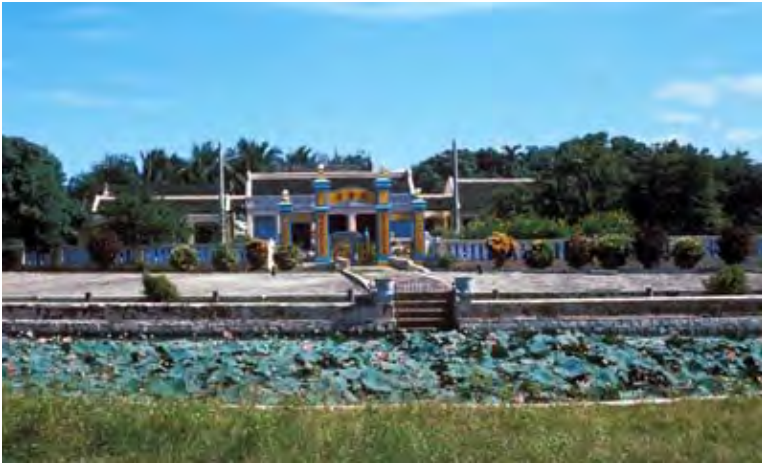
96. Thap Cham: Pagadoa Temple Gardens .