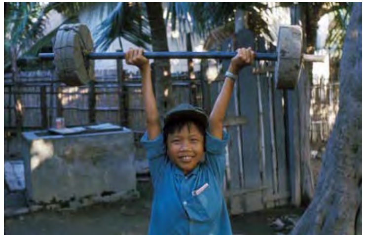
62. Thap Cham: Custom weights! Me Strong Boy!