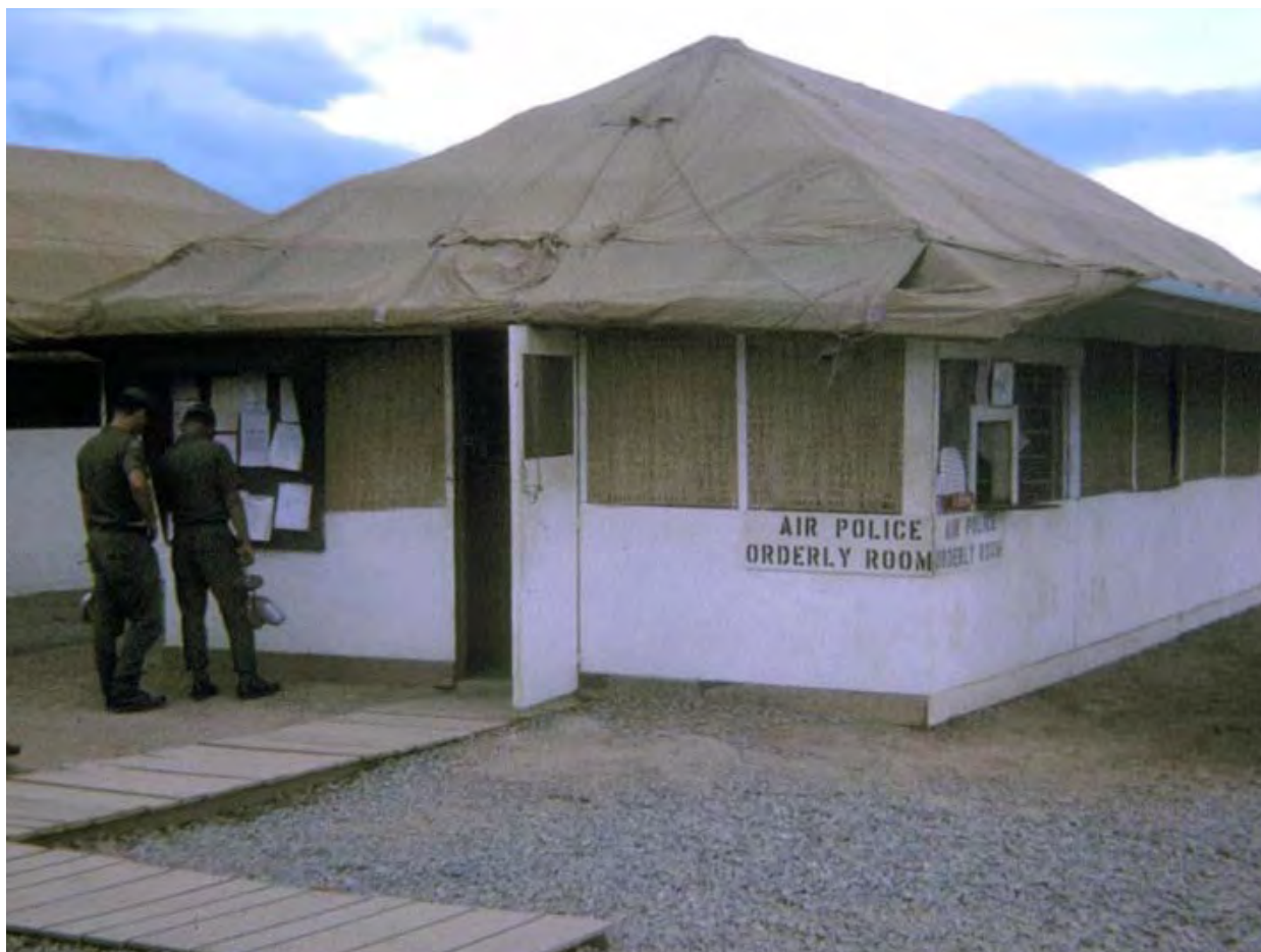
13. Phan Rang AB: 35th APS Orderly Room.