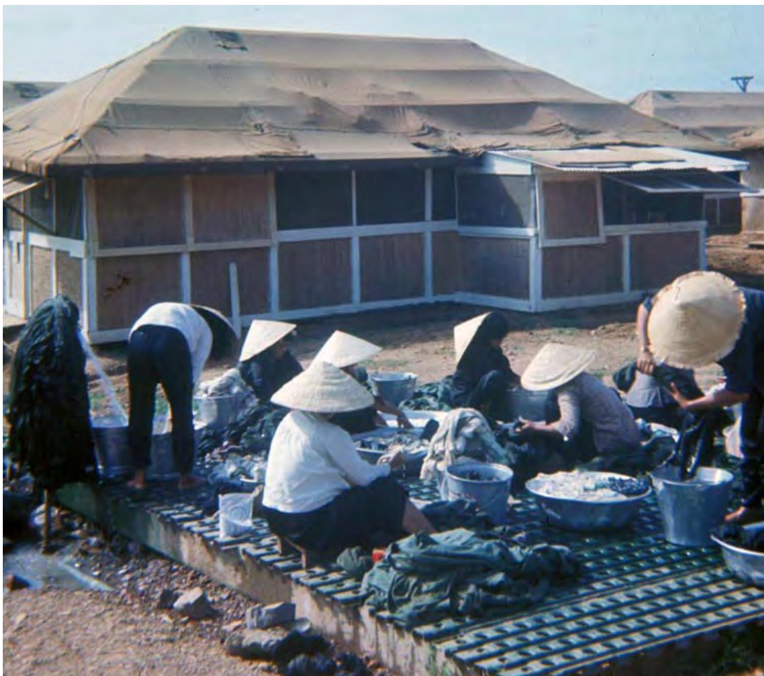
3. Phan Rang AB: 1966: Tent-Hut with a 'pull out' of sorts, and the ever present mamasans doing our laundry with what smelled like barf-water.