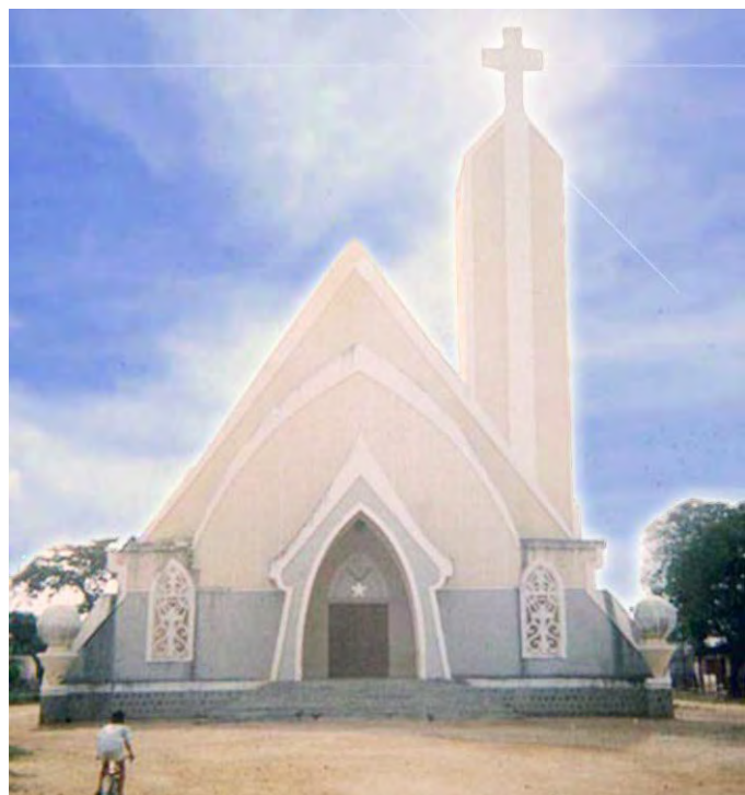
50 Phan Rang: Christian Church front view.