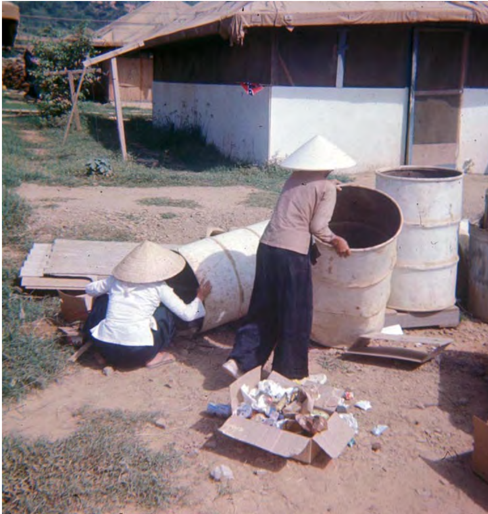
4. (left) Phan Rang AB: 1966: Tent-Hut with mamasans digging through trash for C-Rats. Note the CSA Rebel Flag on the hut's corner.