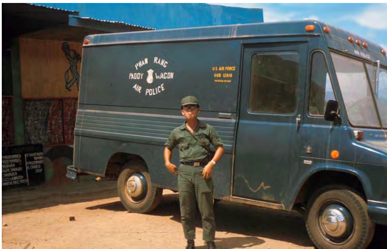
14. Phan Rang AB: Phan Rang AB: 35th APS Paddy Wagon. Hey... yous lookin' at me?