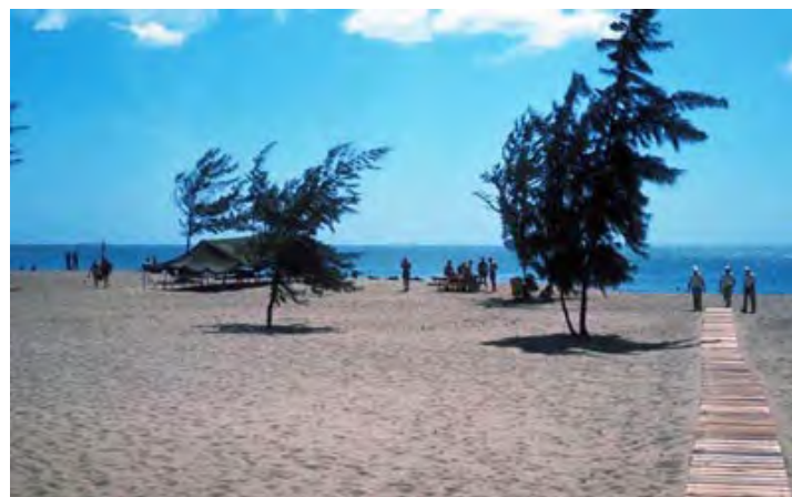
70. ((above-right)The Beach: Wooden walkways and molten-sands.