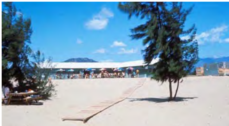
71. (right) Thap Cham: Beach and a patio with beach-umbrellas! How cool is that!