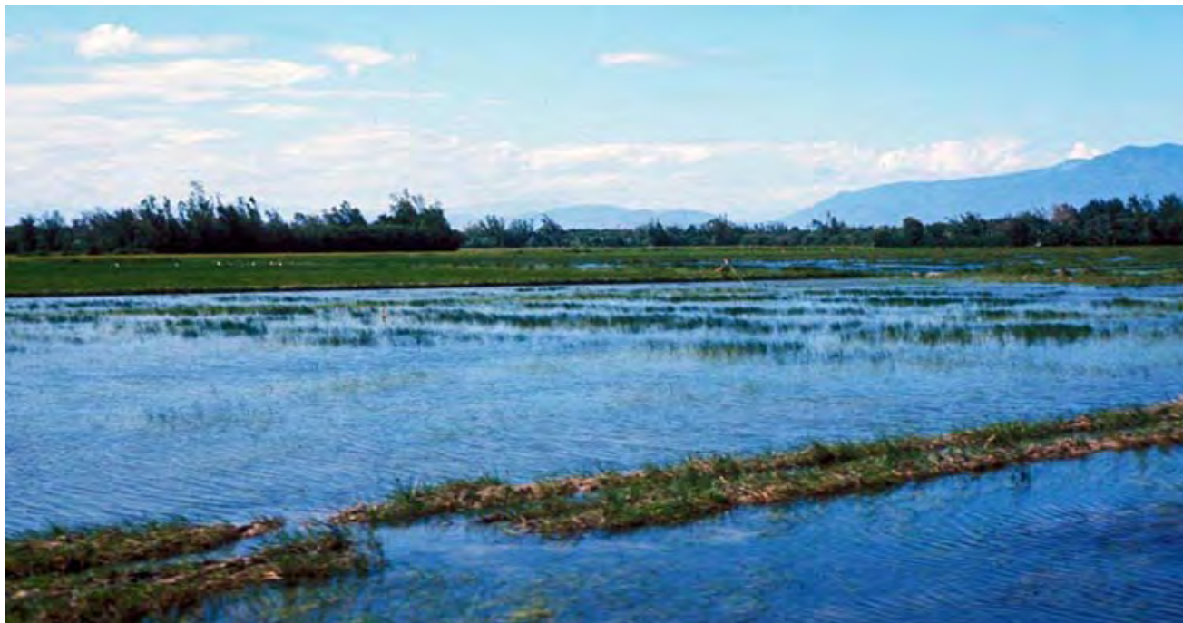
68 Thap Cham: Road to Beach. Rice Paddies levees share the water where most needed. Villagers need the fields, center/left.