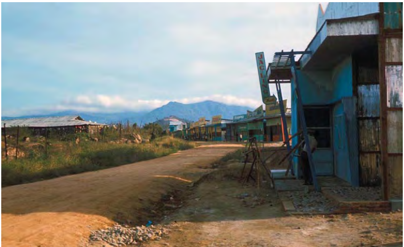
26. Phan Rang: The Strip, looking like an old western 'High Noon' movie set.