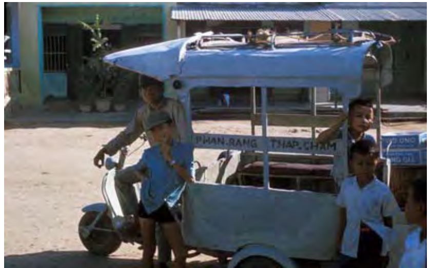
46. Phan Rang: Pedicabs to 'Phan Rang'and 'Thap Cham'... anywhere you want to go -- including church!