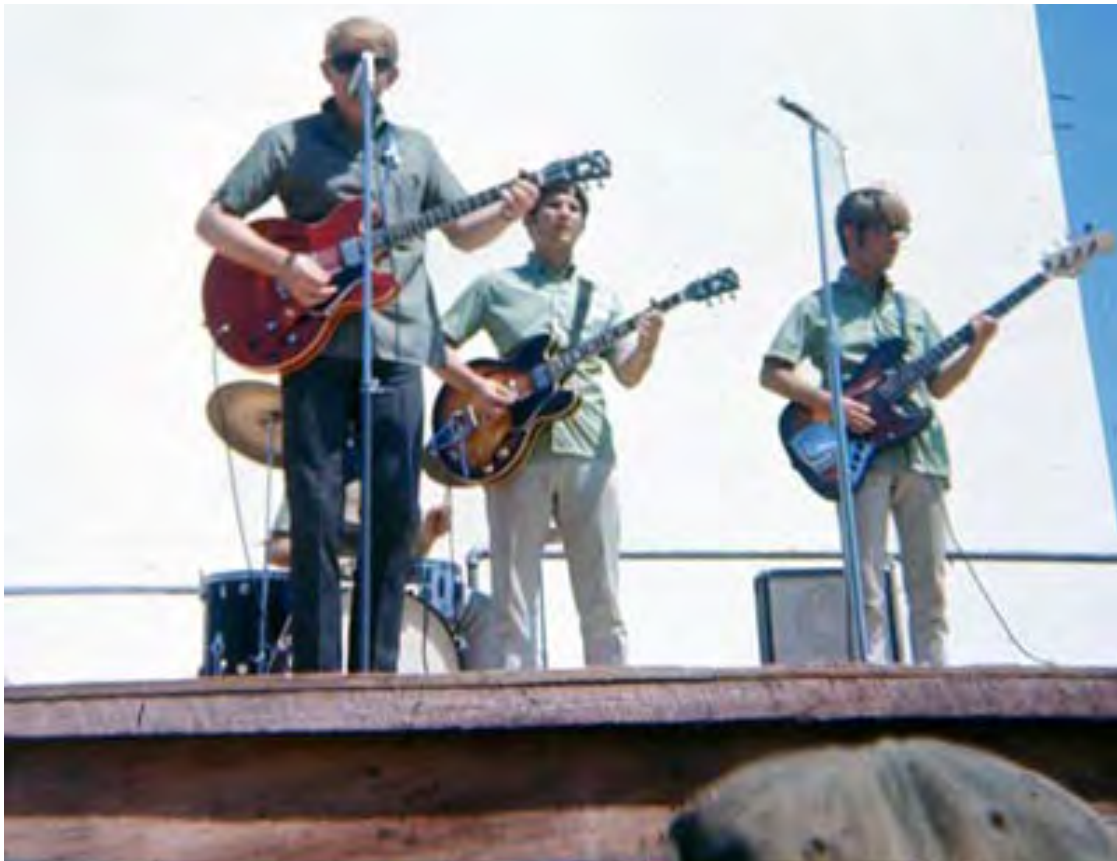
98. Phan Rang AB: USO Jimmy Boyd Band. Best known for I Saw Mama Kissing Santa Claus .