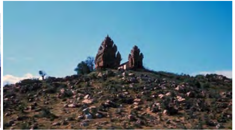
95. Thap Cham: Pagadoa closeup .