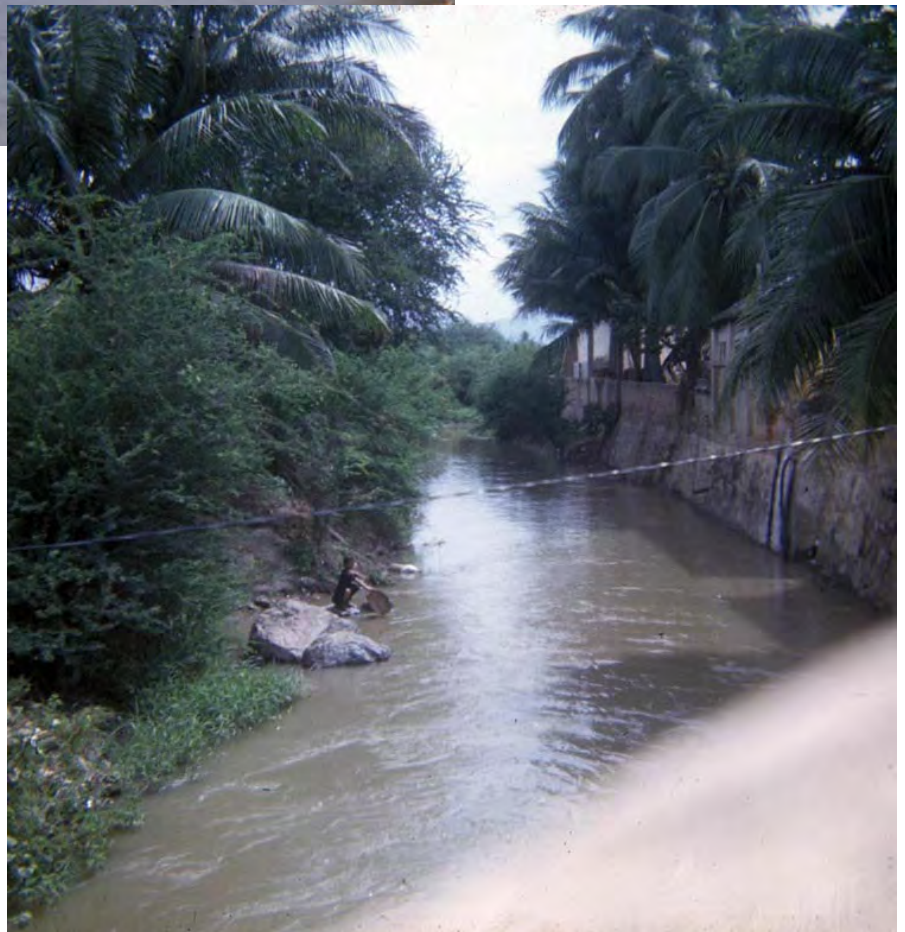
65. (below) Thap Cham river and village houses. Kid along riverbank, center/left.