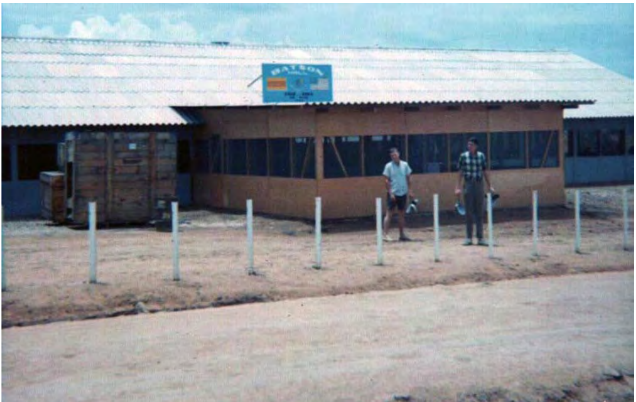
20. Phan Ran AB: Mess Kits. Hey! I know I left my ride parked RIGHT here!