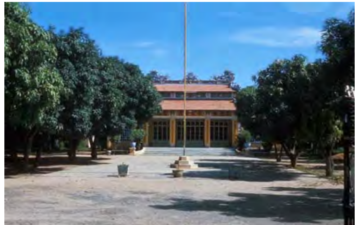
97. Thap Cham: Pagadoa Temple.