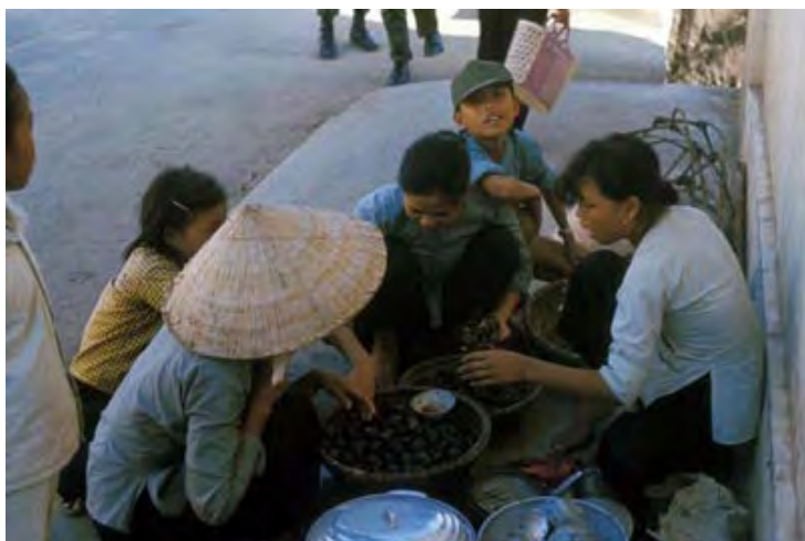
51. Market Place, ladies haggling over fruit.