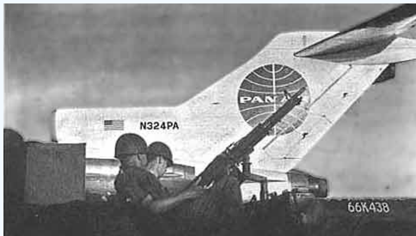
At Saigon field U.S. Air Force police guard jet awaiting soldiers headed for return home. 3. Phan Rang AB: QRT Jeep, M60, Heavy Weapons. flight line and Freedom Bird. 1970.