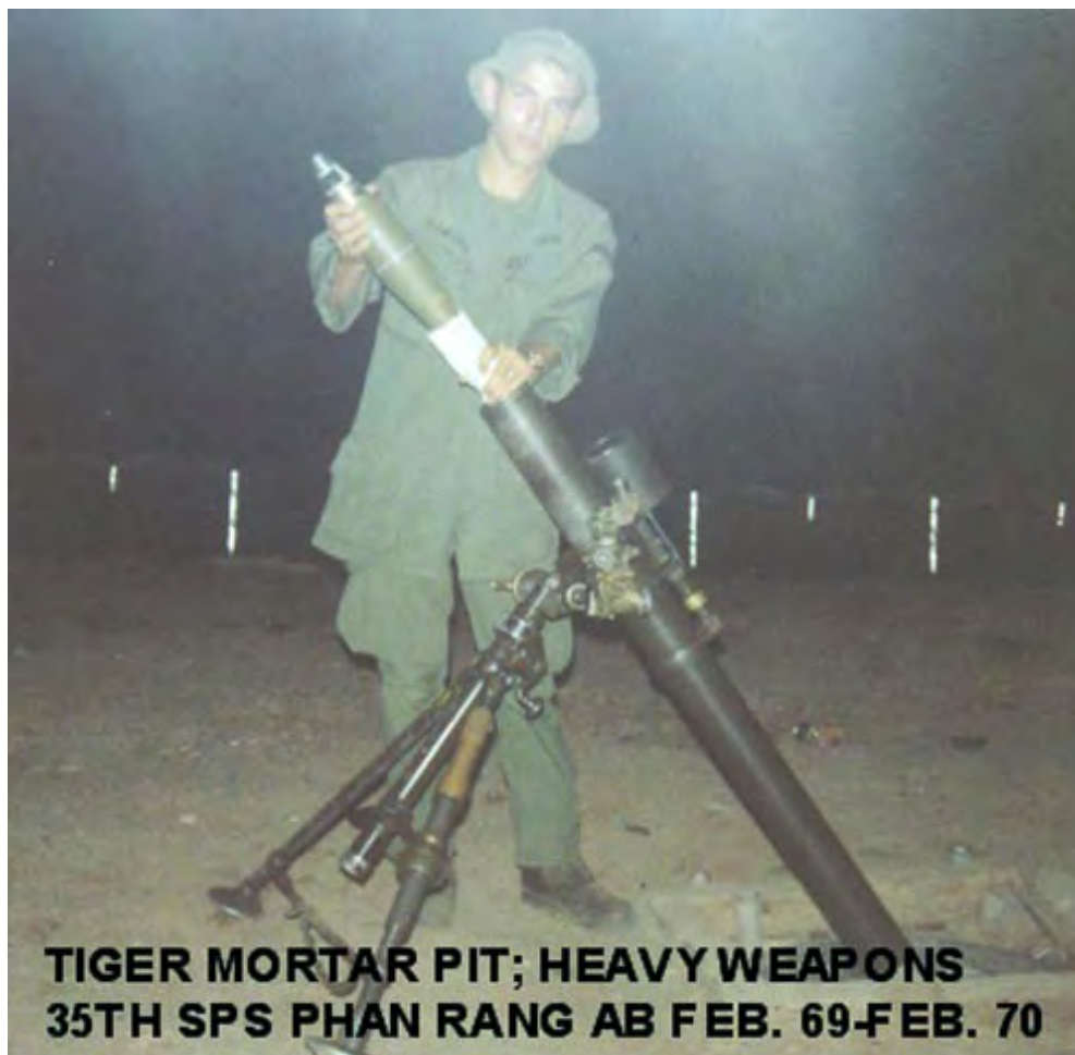
10. Phan Rang AB: Heavy Weapons, 35th SPS, Tiger Mortar Pit. Feb 1969-1970. 1969-1970.