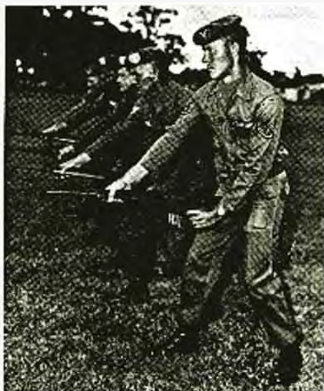
Finally through their training, these air policemen are ready for combat. Unit uses M-16 and heavier weapons.

6. Phan Rang AB: Article, The Airman: In the lush Hawaiian countryside, Air Policemen practice combat tactics. Crew fires a .50 caliber machine gun at a simulated enemy target.