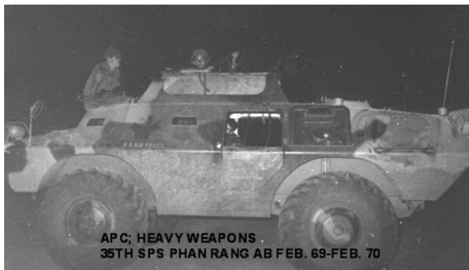
14. Phan Rang AB: Heavy Weapons, 35th SPS, V100. Feb 1969-1970.