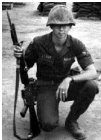
4. Phan Rang AB: Night-Eyes, flight line, M16. 1966-1967.