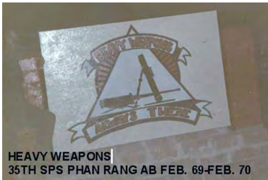
9. Phan Rang AB: Heavy Weapons, 35th SPS. Feb 1969-1970.