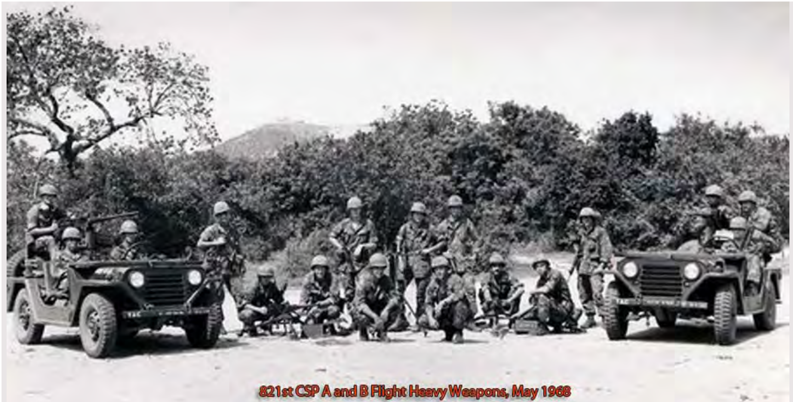
821st CSP A and B Flight Heavy Weapons, May 1968

1. Phan Rang AB: 821st CSPS, A and B Flights, Heavy Weapons, May of 1968.