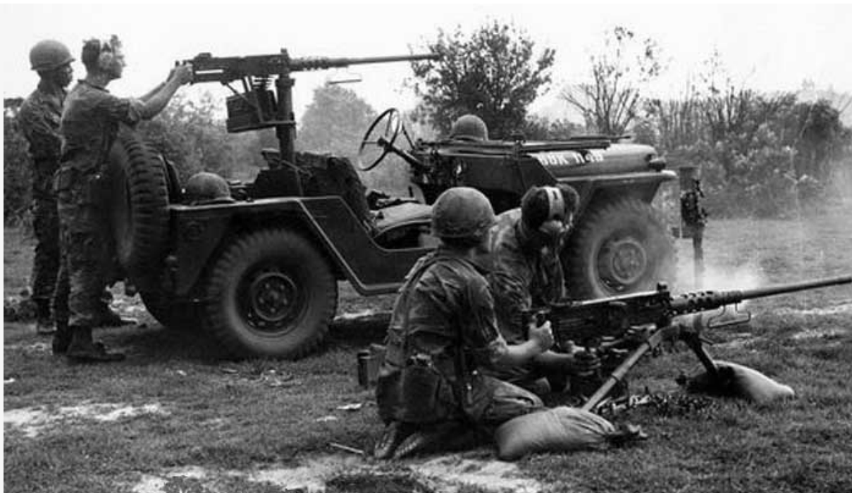
2. Phan Rang AB: 35th SPS,.50 Cal range. SAP-QRT Jeep, May of 1968.