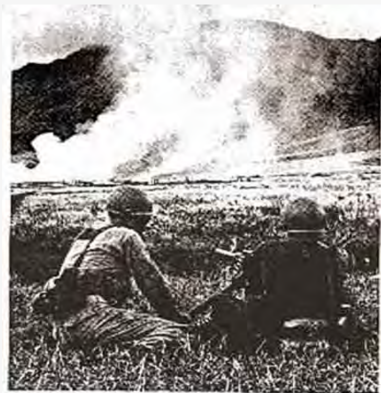
In the lush Hawaiian countryside, air policemen practice combat tactics. Crew fires a .50 caliber machine gun at a simulated enemy target. The Airman