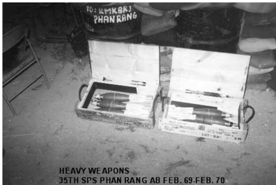
12. Phan Rang AB: Heavy Weapons, 35th SPS, Tiger Mortar Pit, The Meat: 81mm Mortar. Feb 1969-1970. 1969-1970.