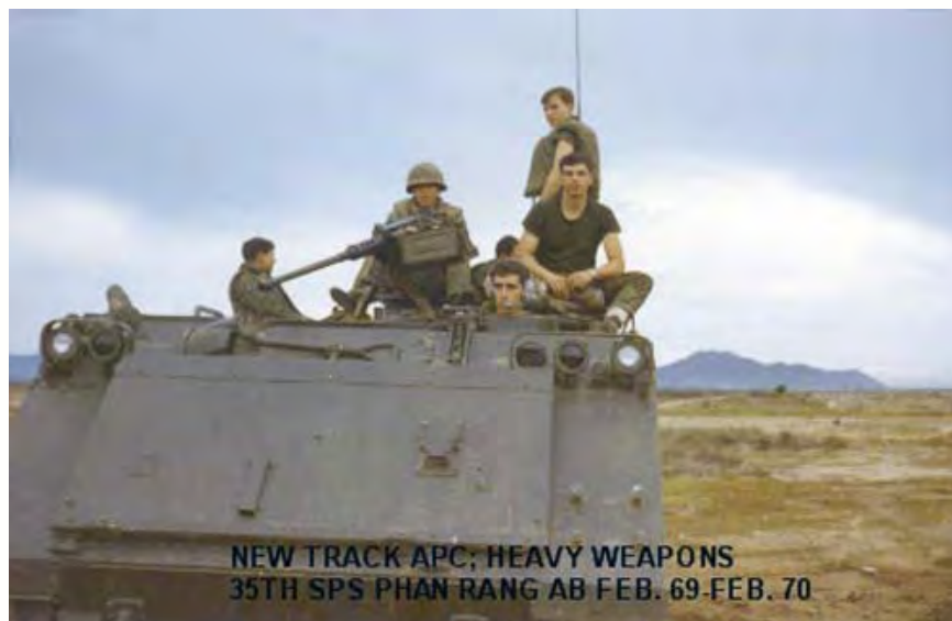
NEW TRACK APC; HEAVY WEAPONS 35TH SPS PHAN RANG AB FEB. 69-FEB. 70