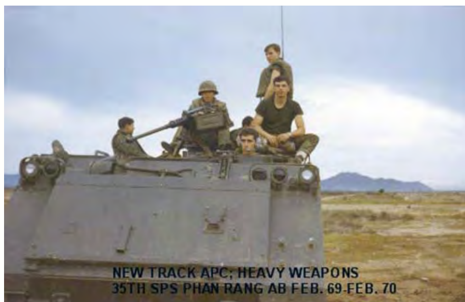
13. Phan Rang AB: Heavy Weapons, 35th SPS, Digging for IEDs. Feb 1969-1970. 1969-1970.