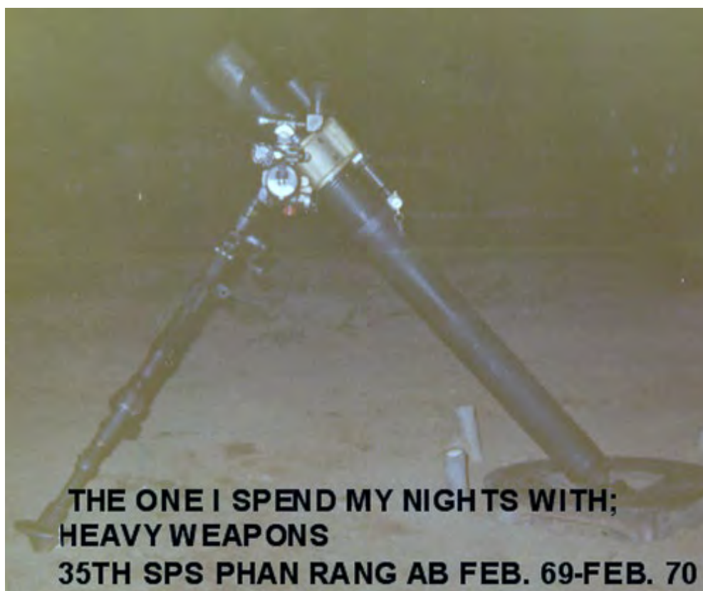
11. Phan Rang AB: Heavy Weapons, 35th SPS, Tiger Mortar Pit, 81mm Mortar. Feb 1969-1970. 1969-1970.