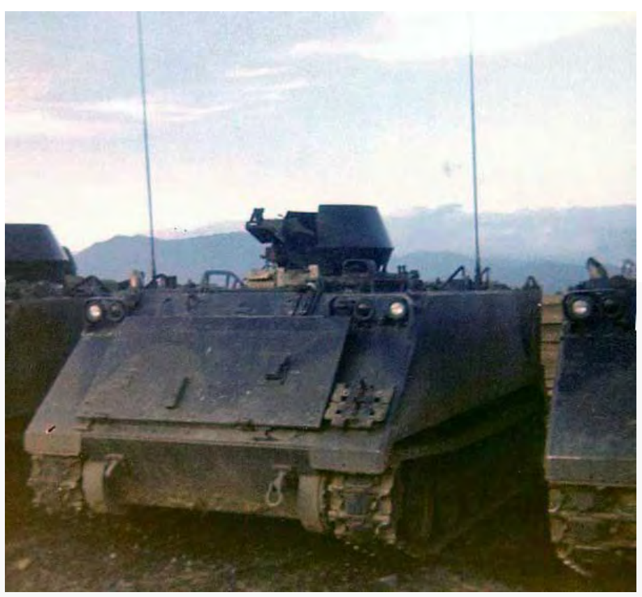
13. Phan Rang AB, M113s parked.