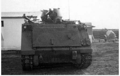
16. Phan Rang AB, M113.