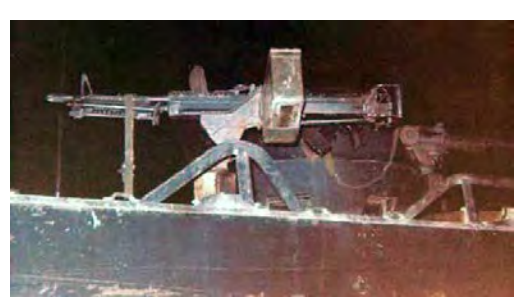
7. Phan Rang AB, An M60 with an aircraft trigger system.