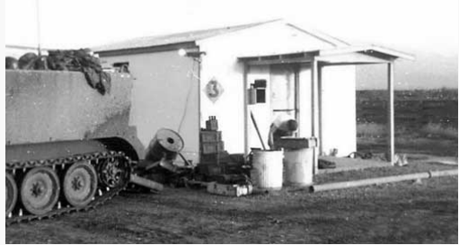
15. Phan Rang AB, M113 at Heavy Weapons armory.