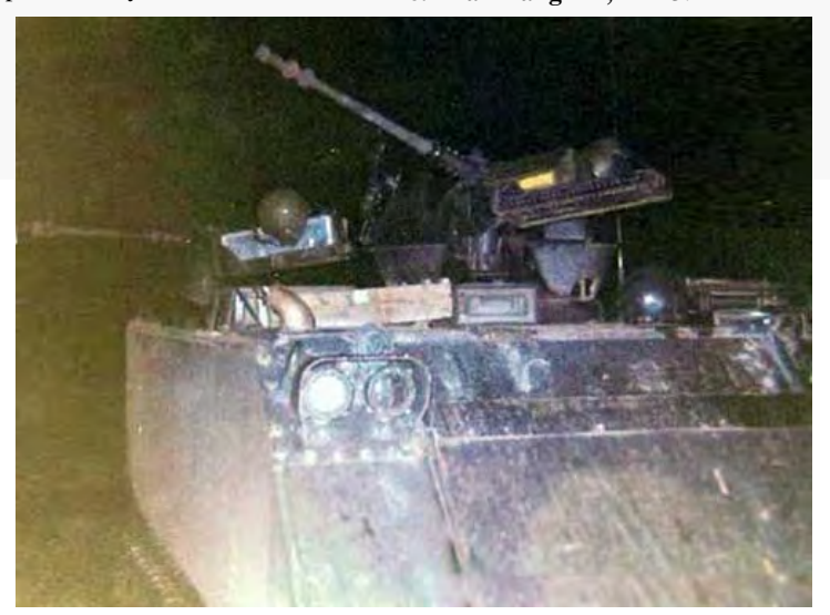
18. Phan Rang AB: M113, call sign 27bravo, with two .50cals.