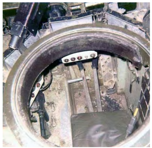
9. Phan Rang AB, M113's Driver's hatch and seat.