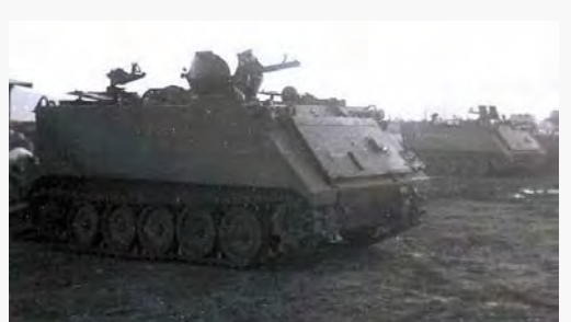
14. Phan Rang AB, M113.