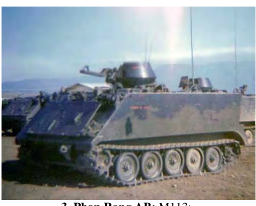
3. Phan Rang AB: M113: "Shadow of Satan."