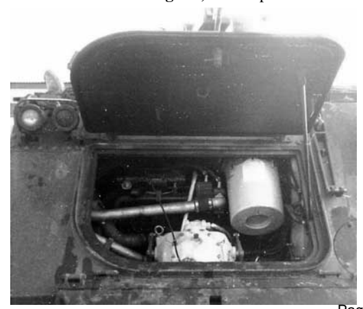
Page 2 of 4