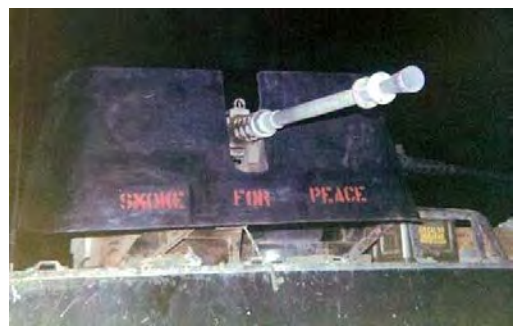
5. Phan Rang AB, M113: "Smoke for Peace."