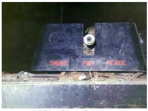
6. Phan Rang AB, M133.