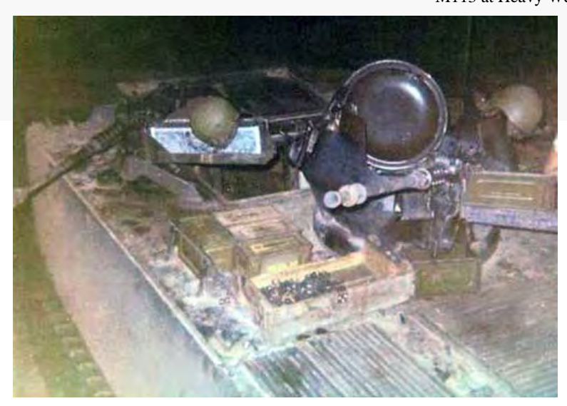
17. Phan Rang AB: M113, call sign 27bravo, with two .50cals.