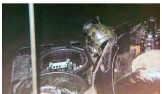
8. Phan Rang AB, M113 Turret and Helmet.