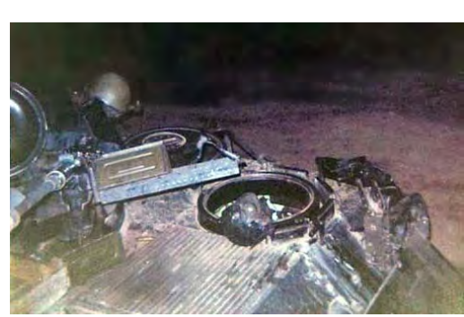
10. Phan Rang AB, Turret.