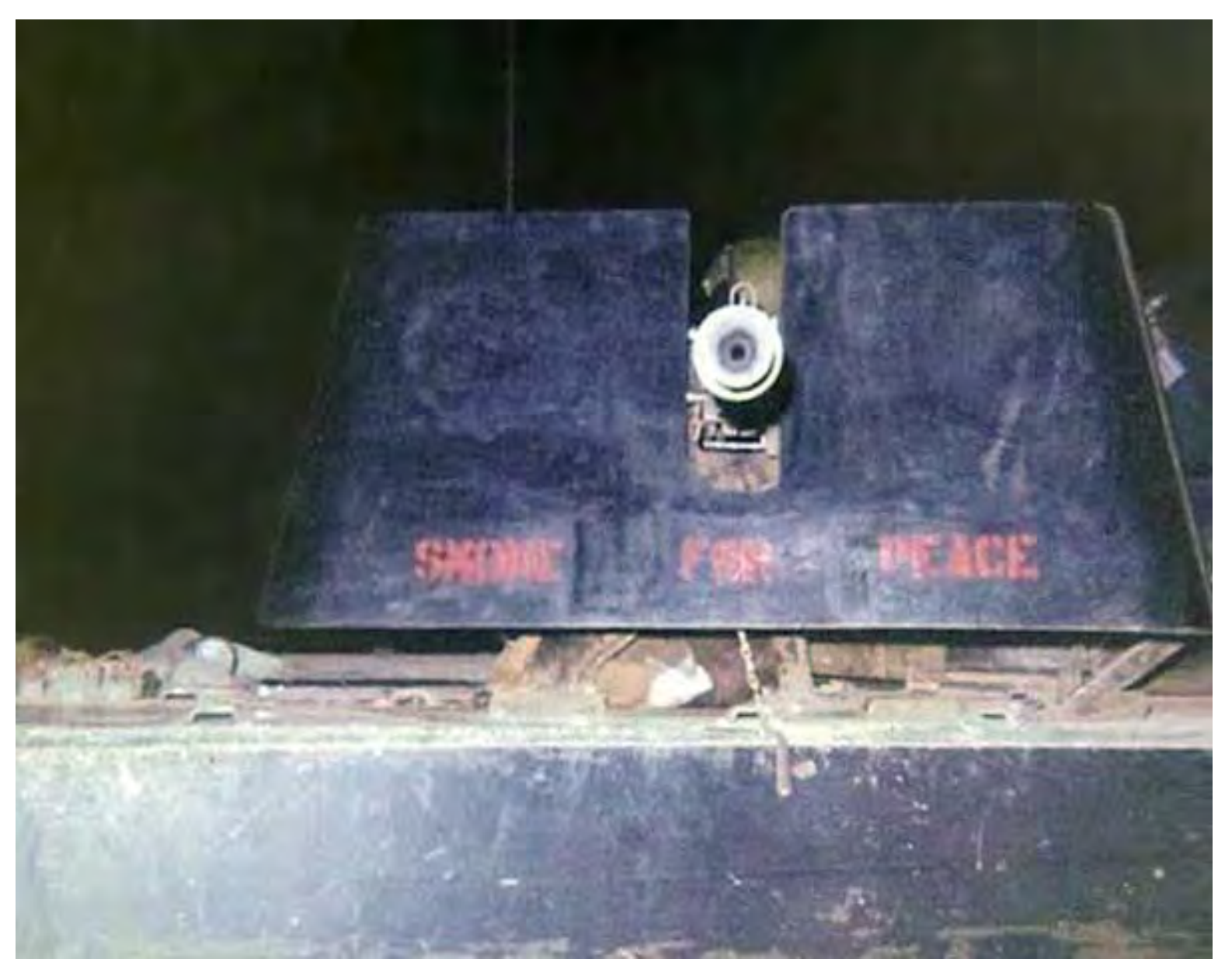
19. Phan Rang AB,M113: Interior.