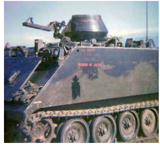
4. Phan Rang AB, M113.