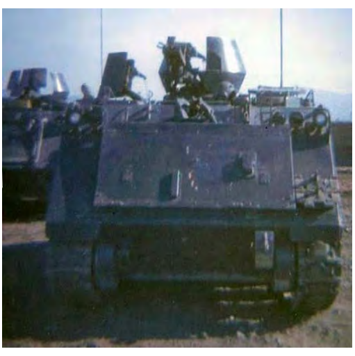
2. Phan Rang AB: M113.