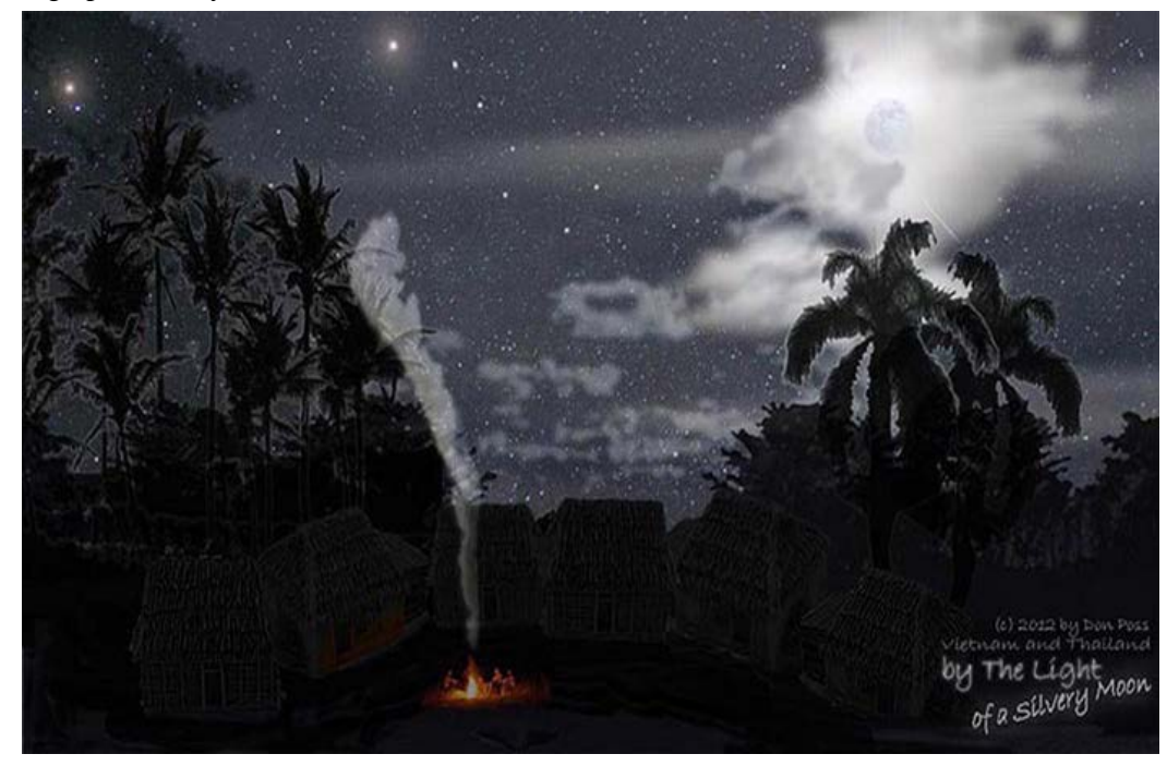
4. Phan Rang AB: Camp Eagle.