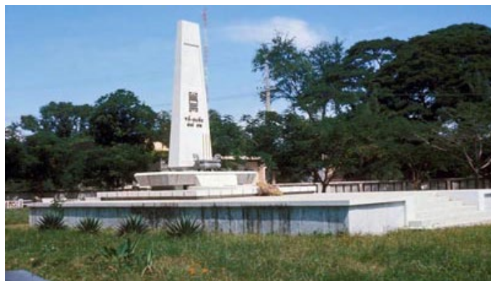
76. Phan Rang: ARVN War Memorial.