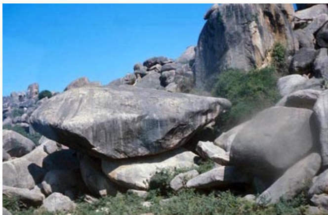
75. Phan Rang: Buddhist homes. Giant boulders.