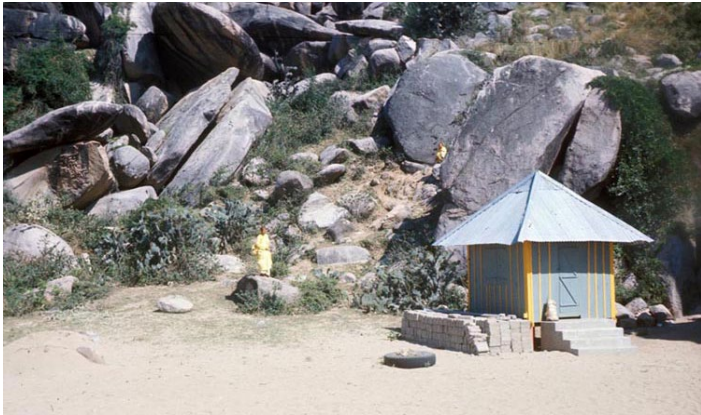
72. Phan Rang: Buddhist homes amongst boulder hillside.