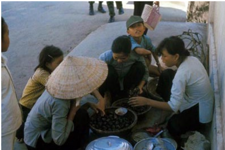
70. Market Place, ladies haggling over fruit.