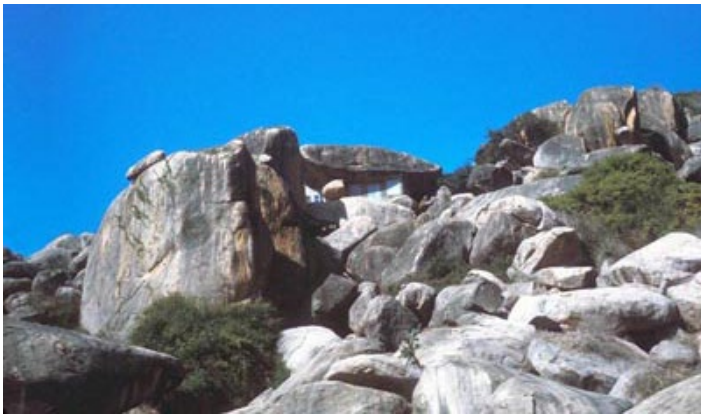
73. Phan Rang: Buddhist homes. Note house with boulder roof (center/top).