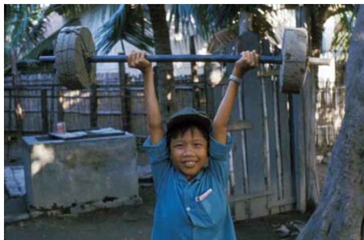
80. Thap Cham: Custom weights! Me Strong Boy!