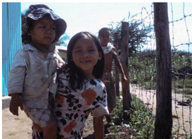
79. Thap Cham: Kids saying Hi to GI. [Do you think they remember us today?]