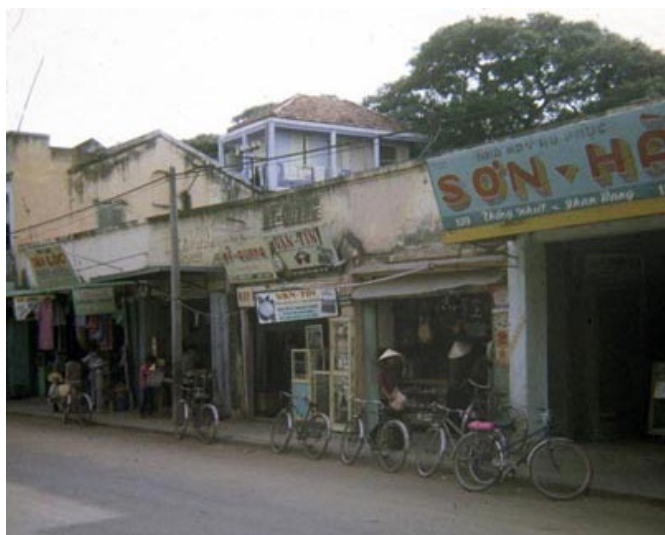
64. Phan Rang: Another Bar.