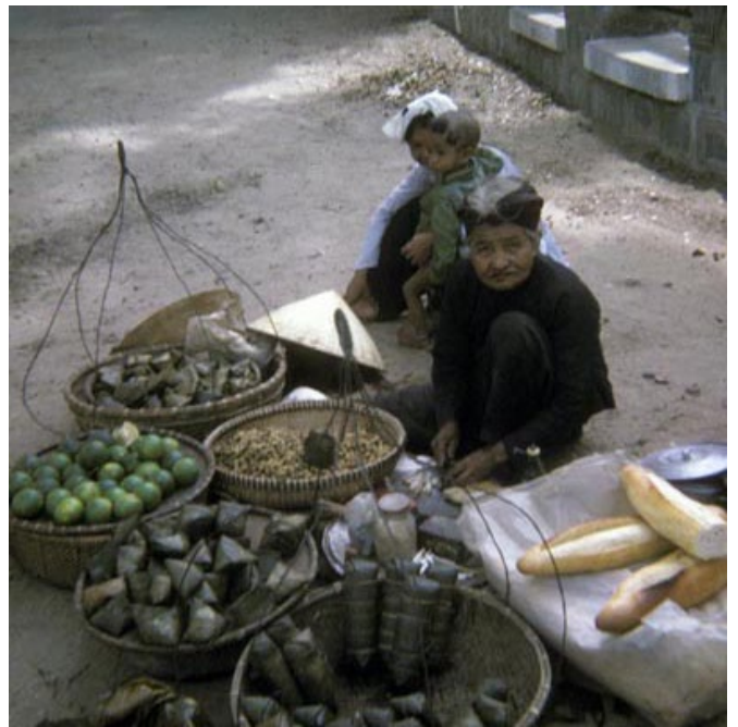
71. Market Place, Granny and kids selling fruit.