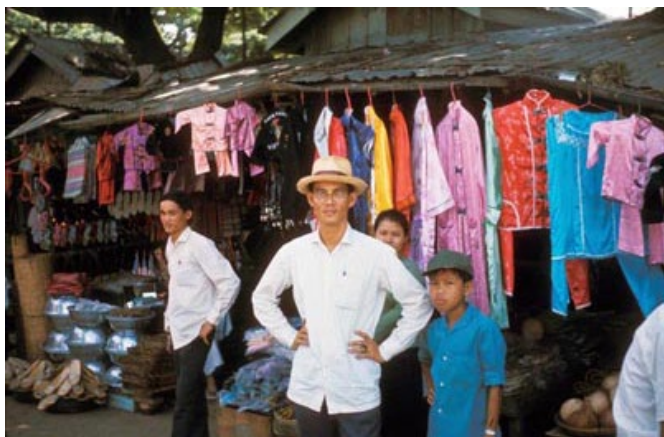
68. Phan Rang: Market Place.