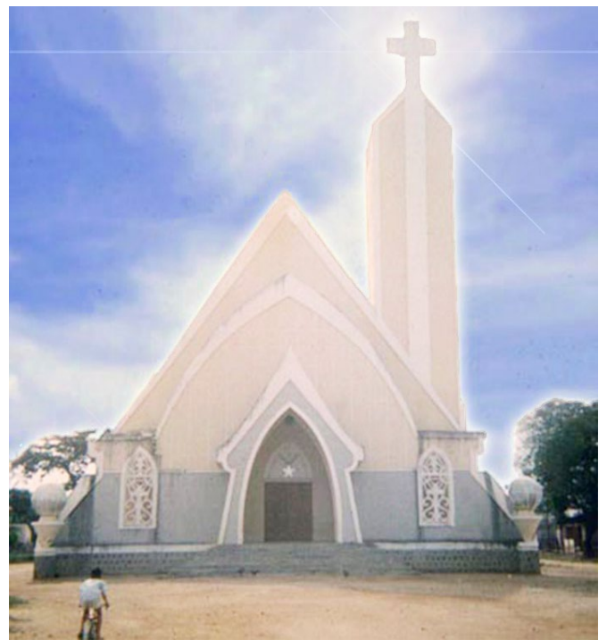
67. Phan Rang: Christian Church front view.