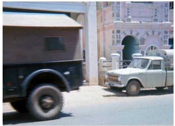
69. Phan Rang: Driving around. RV anyone?