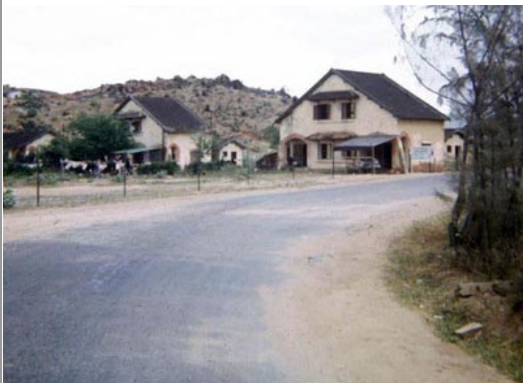
77. Phan Rang: Houses on road curve, heading back to base.