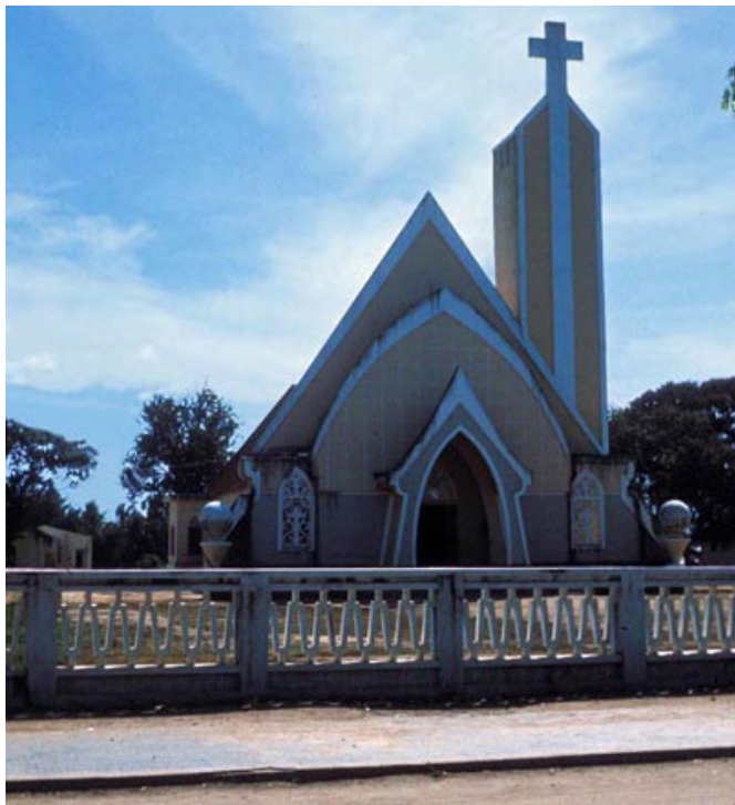
66. Phan Rang: Christian Church across the bridge.