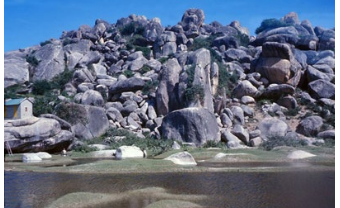
73. Phan Rang: Buddhist homes. Note fisherman.