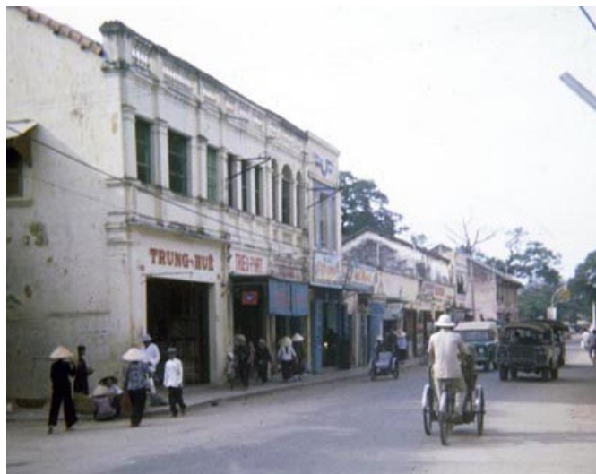
62. Phan Rang: Rush Hour.

Page 1 * Page 2 * Page 3 * Page 4 * Page 5 * VSPA * War-Stories