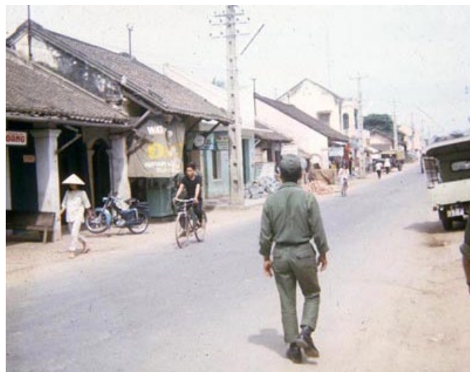
63. Phan Rang: Soldier in Thap Cham. Lookie at all the Bars... so many decisions.