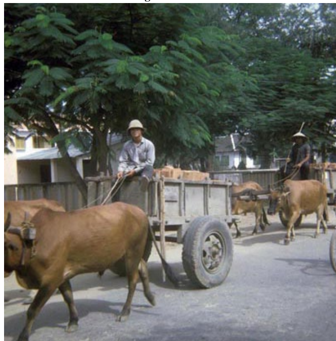
78. Thap Cham: Ox Carts loaded with bricks.