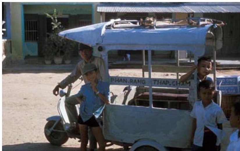
65. Phan Rang: Pedicabs to 'Phan Rang'and 'Thap Cham'... anywhere you want to go -- including church!