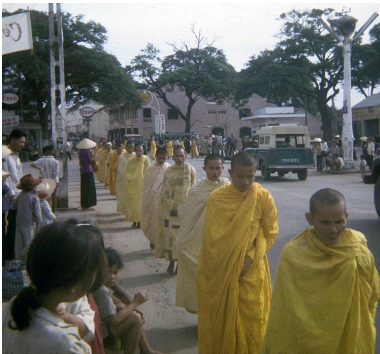
58. Phan Rang: Buddhist Monks downtown to receive alms and food. [Generally, held anti-war sentiments. I wonder how they enjoyed their reeducation camps?]