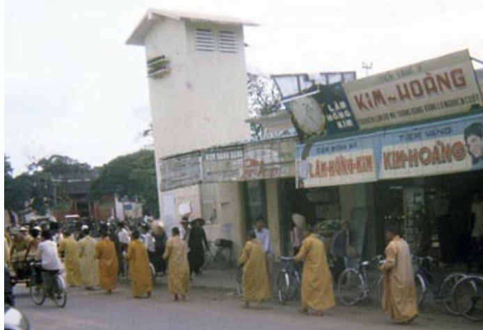
59. Phan Rang: Buddhist Monks downtown