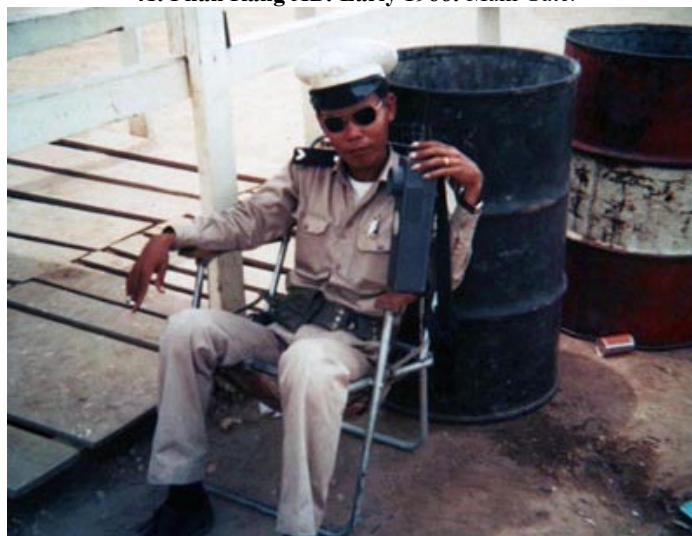
42. Phan Rang: Main Gate QC-White Mice.