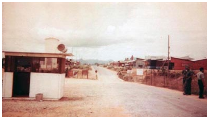
41. Phan Rang AB: Early 1966: Main Gate.

Page 1 * Page 2 * Page 3 * Page 4 * Page 5 * VSPA * War-Stories