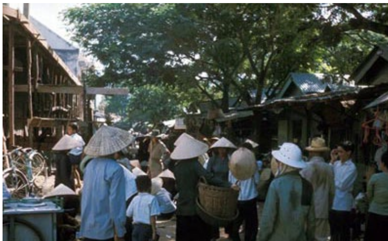
55. Phan Rang: Xin, at market.