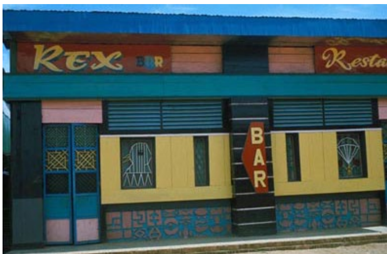
44. Phan Rang: REX Bar.