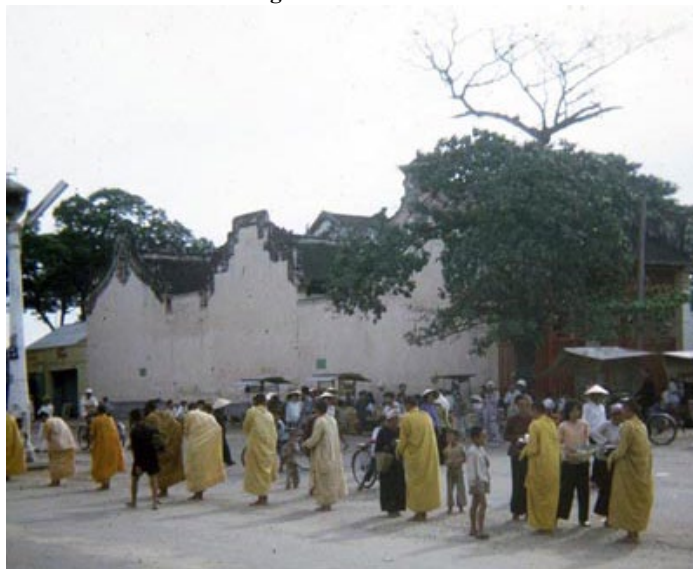
60. Phan Rang: Buddhist Monks in square.