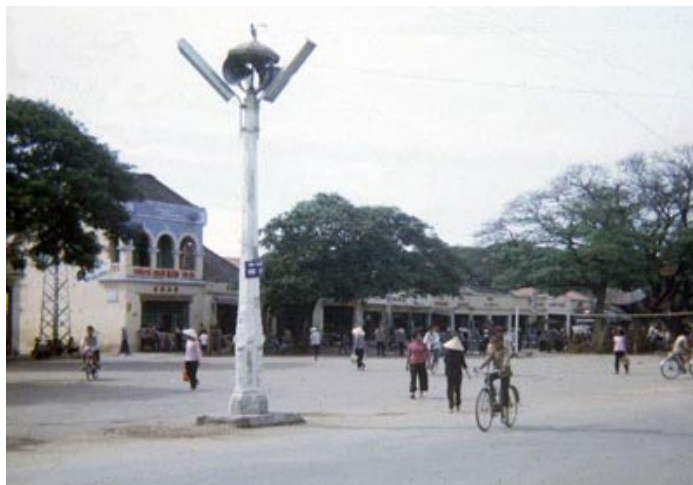
57. Phan Rang: Shop Keepers in Open Market.