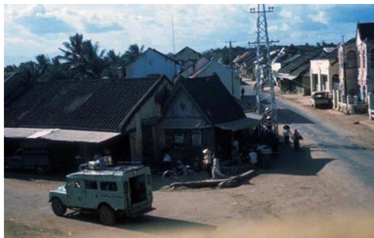
56. Phan Rang: Downtown.