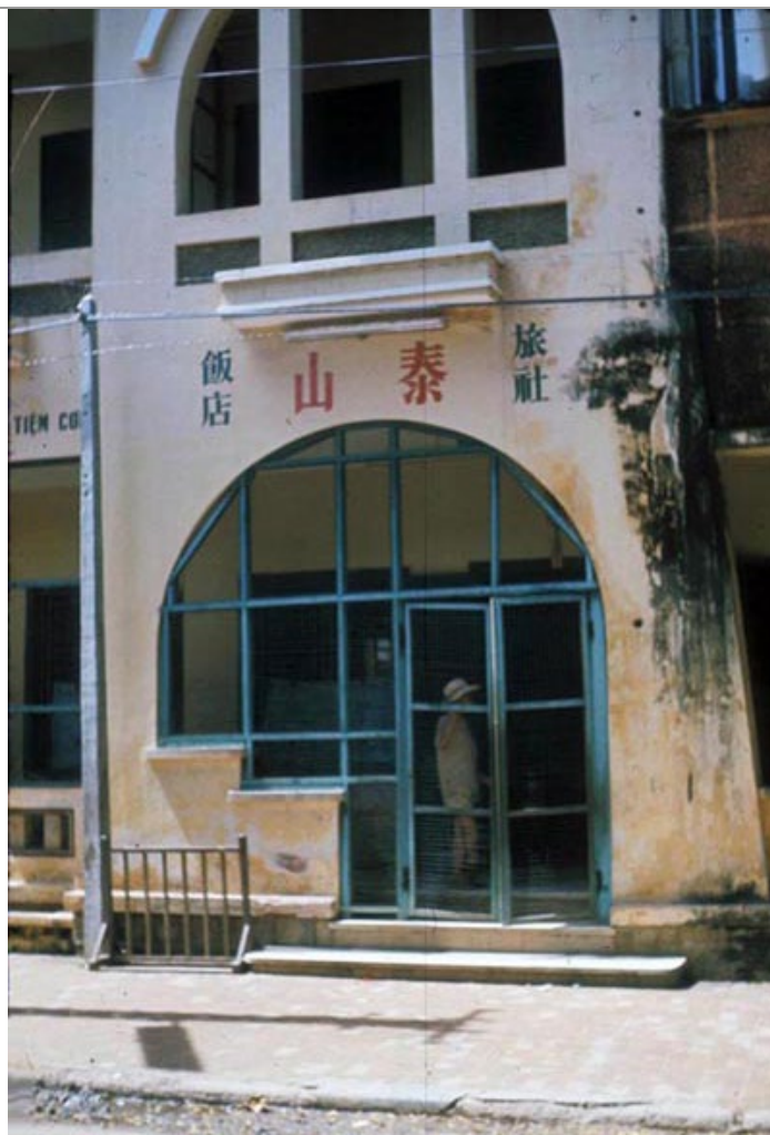
46. Phan Rang: Another Bar.