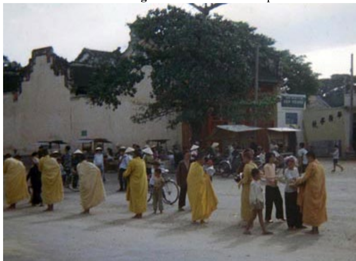
61. Phan Rang: Buddhist Monks in square.