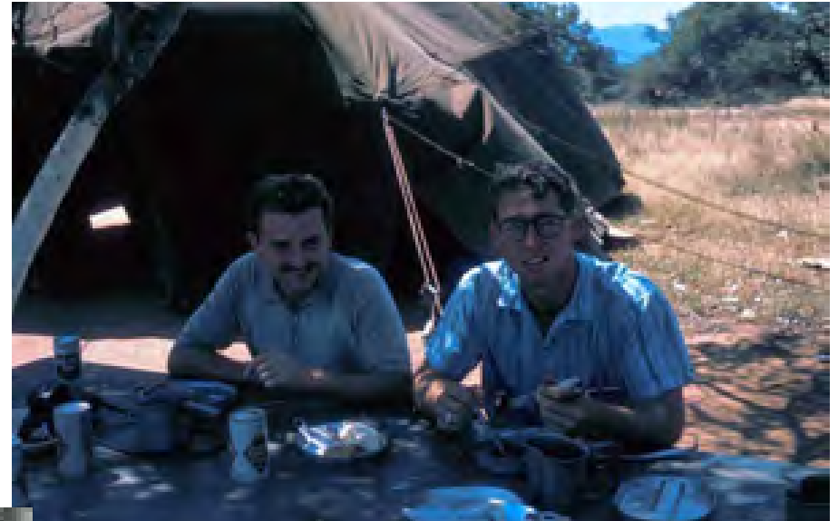
13. Phan Rang AB: Metal mess-kits mask whatever food with a metallic-taste.