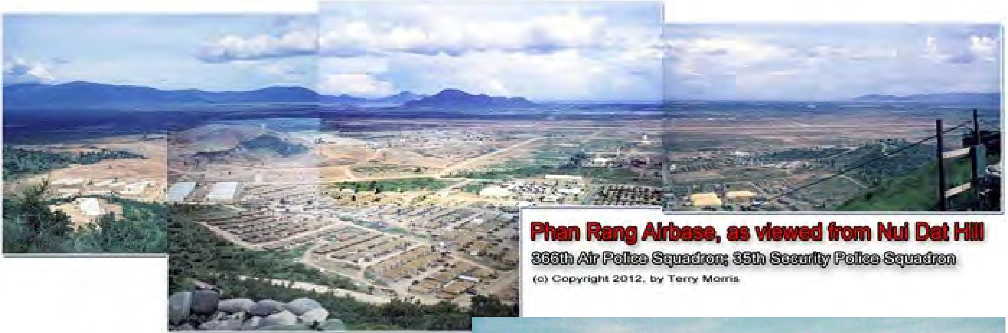
Phan Rang Airbase, as viewed from Nui Dat Hill 366th Air Police Squadron; 35th Security Police Squadron