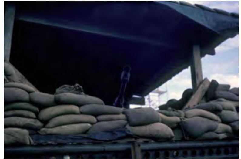
9. Phan Rang AB: Bunker with business-end of a 50.cal commanding attention.