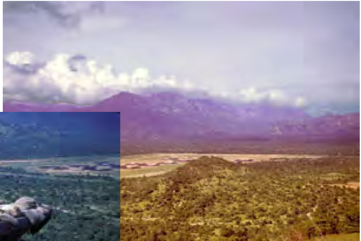
4. Phan Rang AB (above, early 1966): Bomb Dump , placed safely away from aircraft and growing Air Police cantonment area.