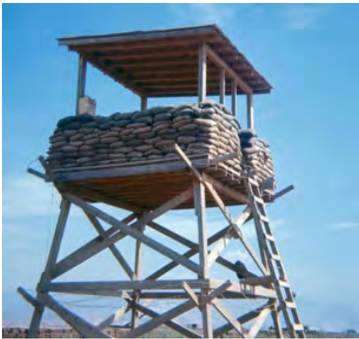
7. Phan Rang AB: OP-1 Tower Bunker, overlooks sprawling fields of tall grass and perimeters, armed with an M60 machine gun. OP1 - No .50 cal. at this tower. OP2 - Had tonly .50 cal during my time.