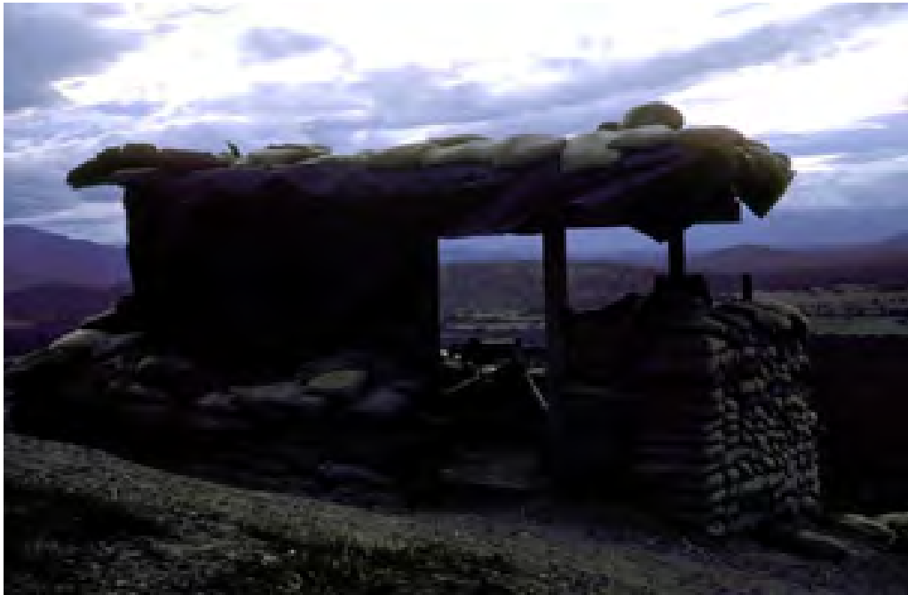
6. Phan Rang AB, Bomb Dump (early 1966) nestled in the valley of the shadow , between rolling hills and scrub tree cloaked mounds.