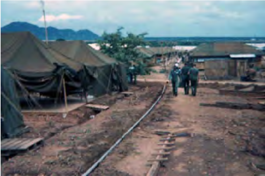
12. Phan Rang AB: 366th APS walk trails of baked clay or muddy-quagmire before wooden-pallet walkways are built.