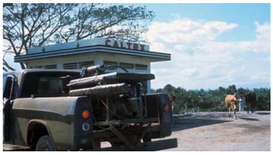
83. Thap Cham, Gas Station along road to Beach. Villager herds moo-cows.