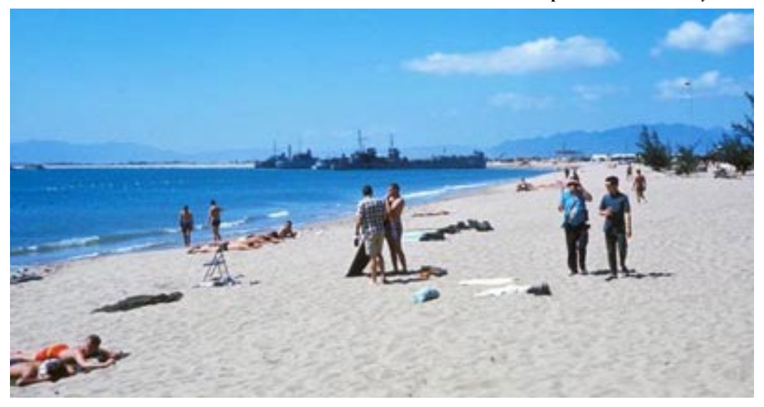
93. Thap Cham: Beach, with Navy LSTs at shore.