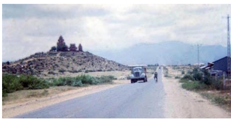
94. Thap Cham: Pagadoa Hilltop.