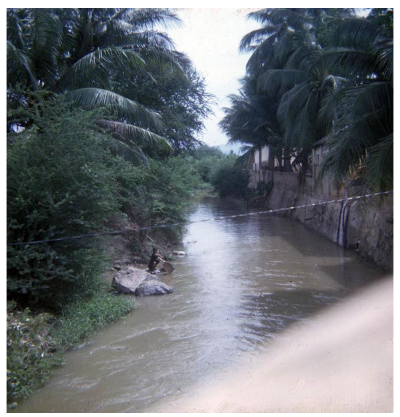
82. Thap Cham river and village houses. Kid along riverbank, center/left.