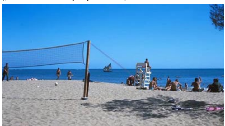
92. Thap Cham: Beach... Hey--look'at the boat!