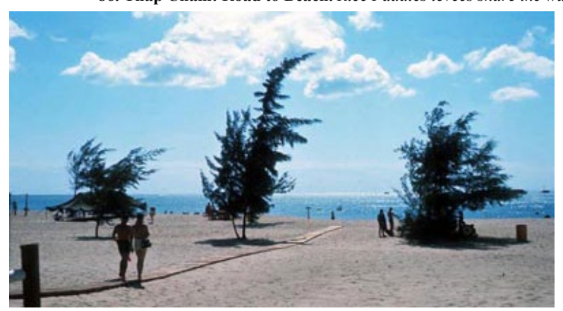
87. The Beach: A day at the beach, and alittle touch of home.