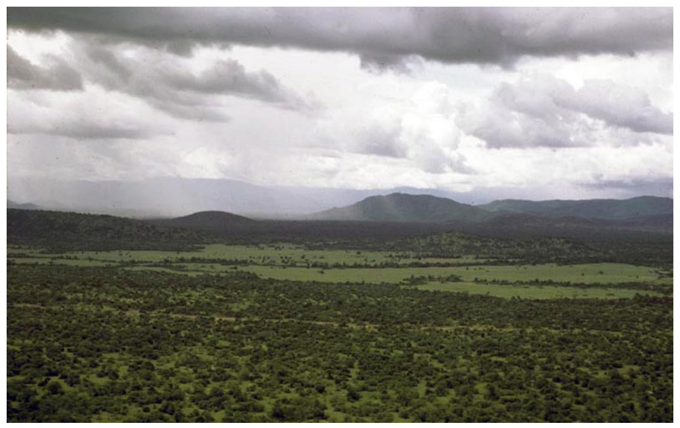
84. Road to Beach. You've got to admit... there was beauty in South Vietnam's countryside, worthy of quiet appreciation. I'm not sure exactly where that was. Looks like a view from Nui Dat, but there was no road running through there then (?).