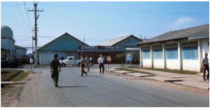
104. Tan Son Nhut AB, around the base.