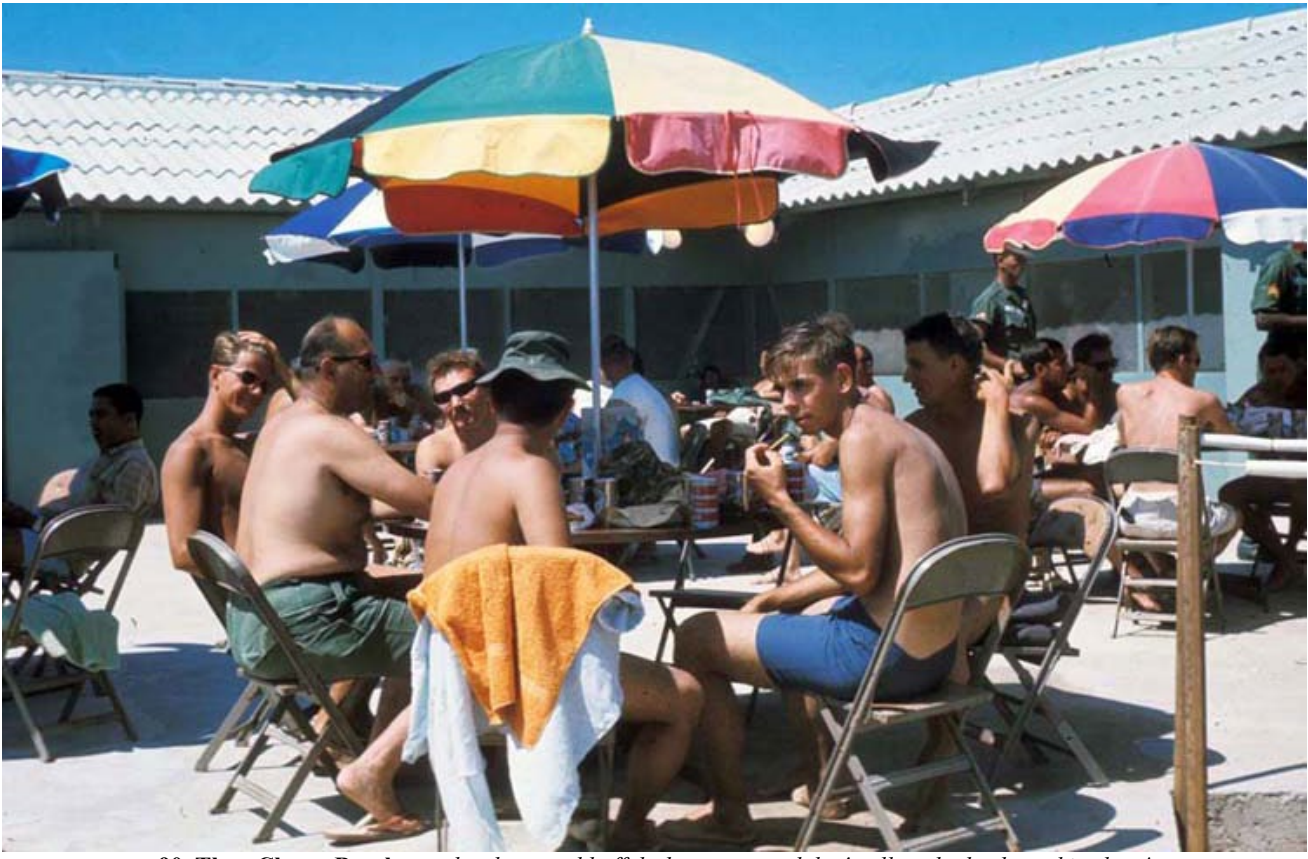
90. Thap Cham: Beach... and sodas... and buffalo-burgers... and don't tell anybody about this place!