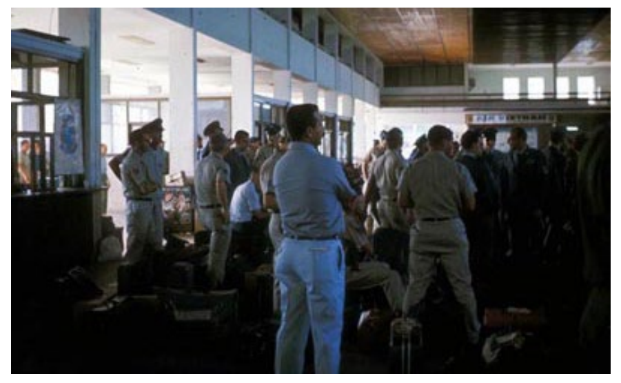
103. Tan Son Nhut AB, Airport., Departures: R&R, PCS, DEROS.