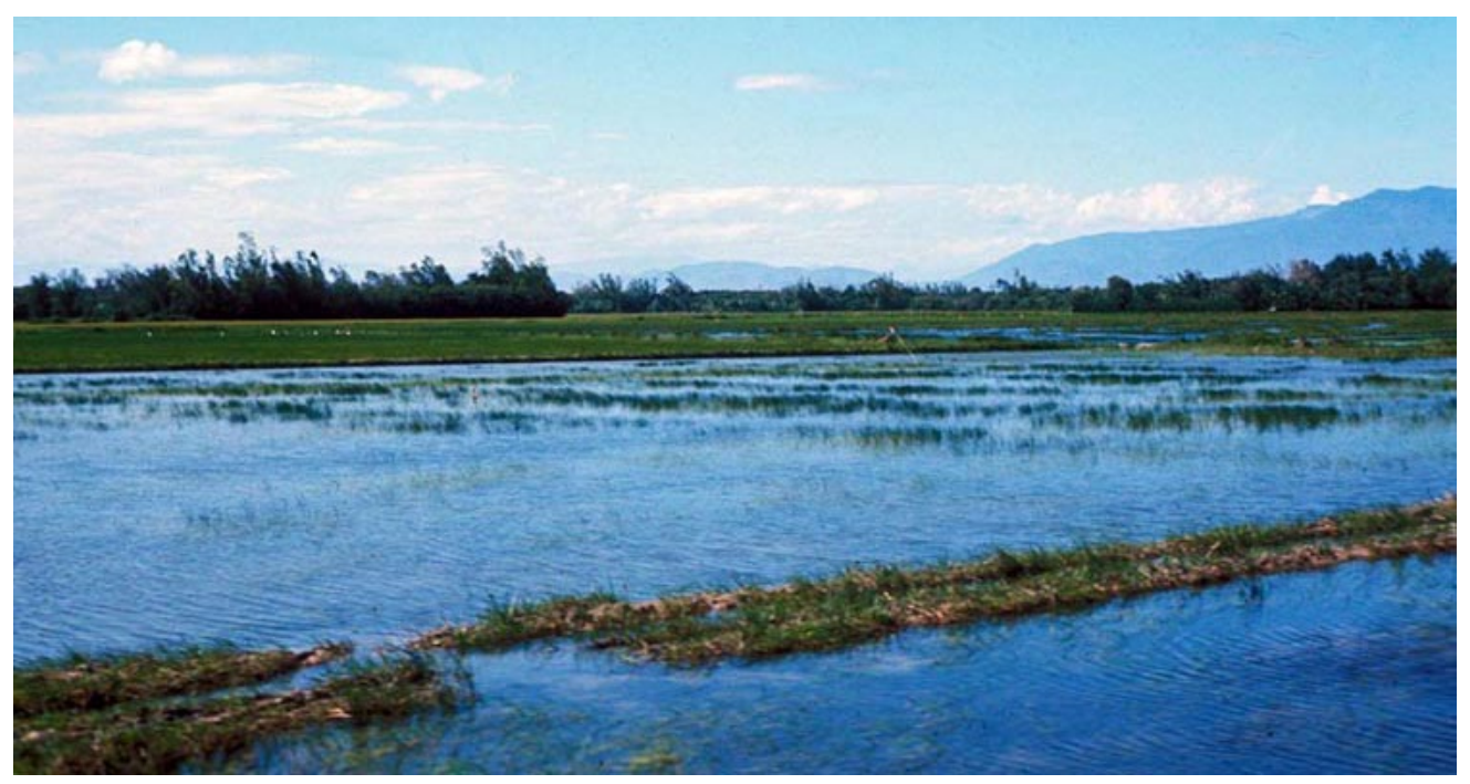
86. Thap Cham: Road to Beach. Rice Paddies levees share the water where most needed. Villagers need the fields, center/left.