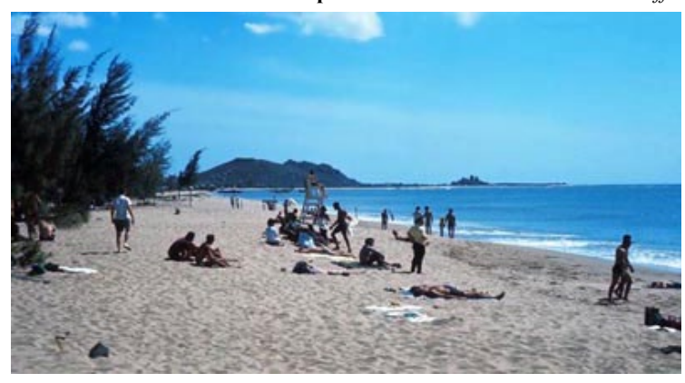
91. Thap Cham: Beach... and... HEY! Where're the babes?