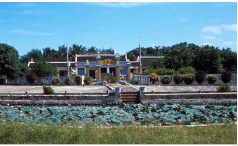
96. Thap Cham: Pagadoa Temple Gardens.