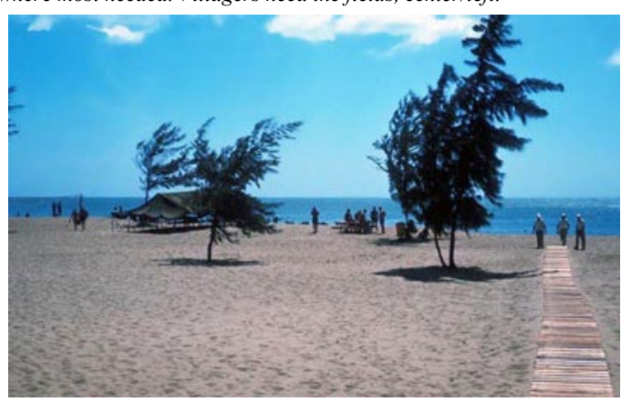
88. The Beach: Wooden walkways and molten-sands.