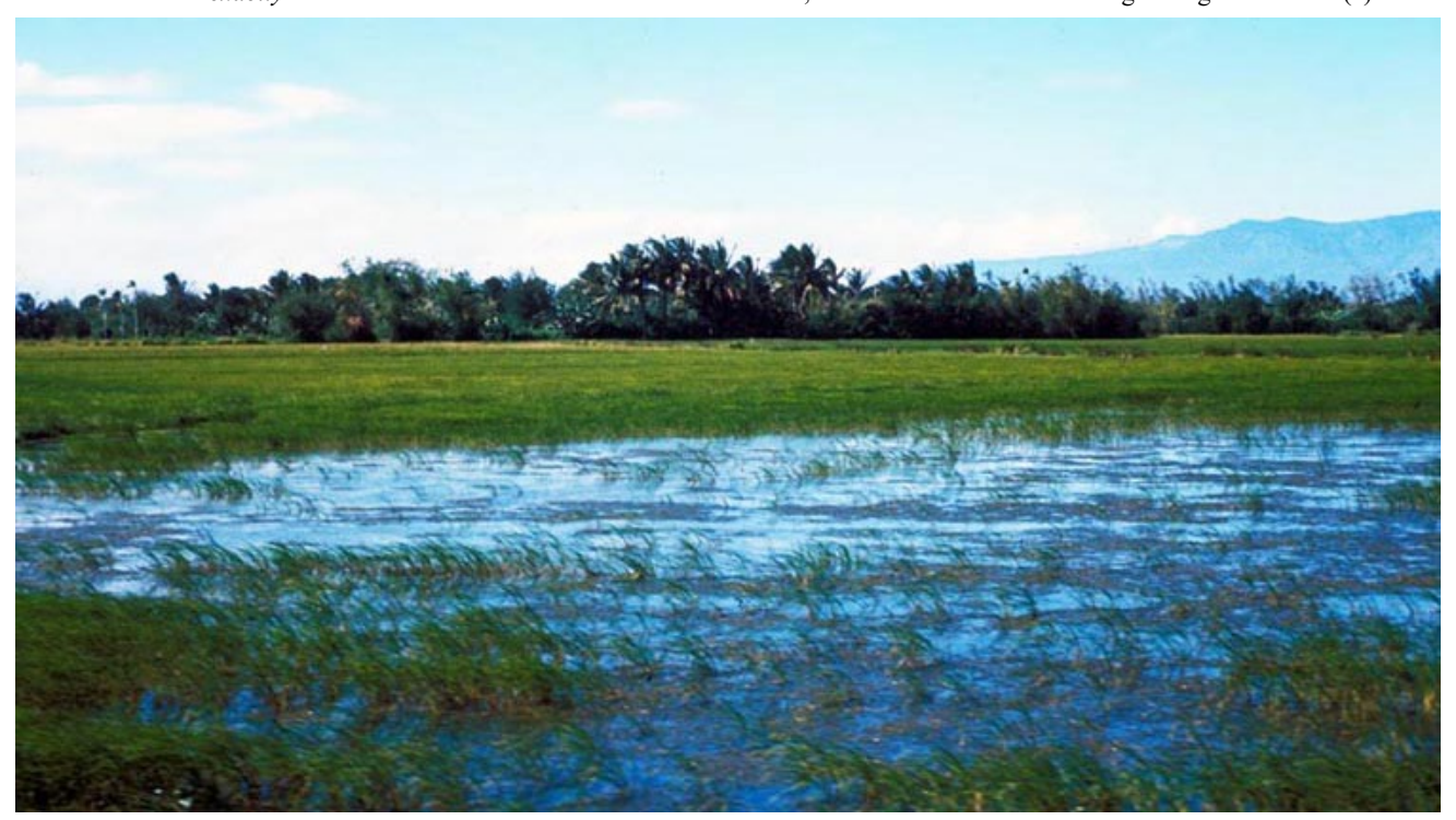
85. Thap Cham: Road to Beach. Rice Paddies grace the landscape. Here and there, a farmer surveys his land... and water buffalo graze.