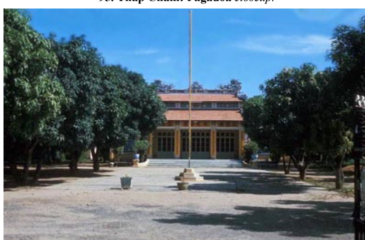
97. Thap Cham: Pagadoa Temple.