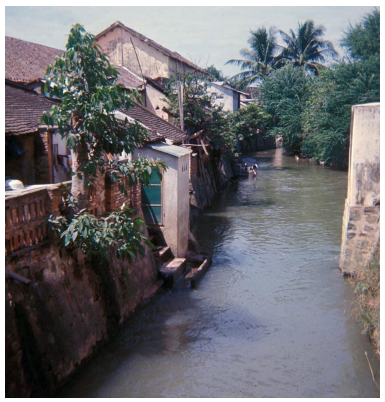
81. Thap Cham river flows through village. Note mamasan scooping water. Fish, washie clothes, drinking water, sewer.