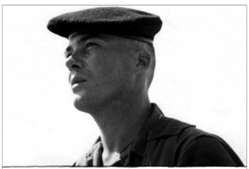
DEPARTMENT OF THE AIR FORCE (PACAP) AFO SAN PRANCISCO 96307