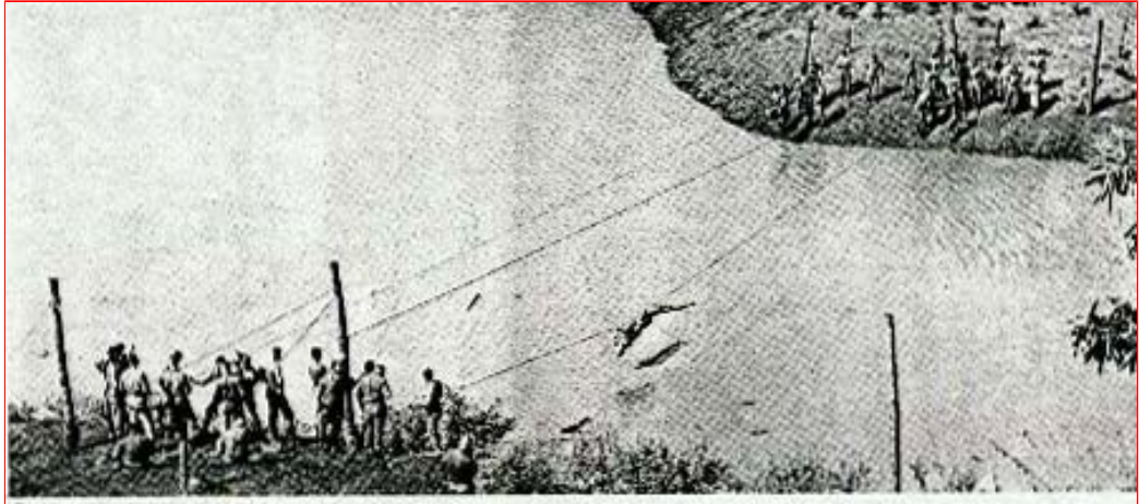
Combat members of the 1041st Security Police Squadran must be ready to surmaunt any obstacle they must. Here they span a 20-meter river using a single rope technique knows as the Swiss seat. A slip here means a refreshing dip in the stream.