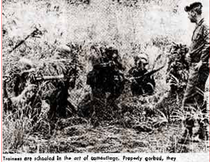
Trainess are schooled in the art of cambutlege. Property garbad, they are almost impossible to spor. See the M-16 aimed directly of yea?

Next, the call for volunteers went out to security policemen. The requirements were stiff. Not only did applicants have to be highly motivated, but their last five proficiency reports had to be in the top 10 percent! Naturally, applicants also had to be in nearperfect physical condition. One hundred seventy men were chosen.