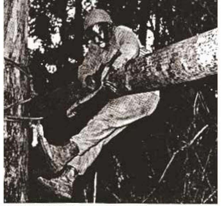
Trainees hit this chest-high log under a full head of steam; samesault over it with weapons in hand. This obviocle is called, appropriately enough, the "belly-buster."