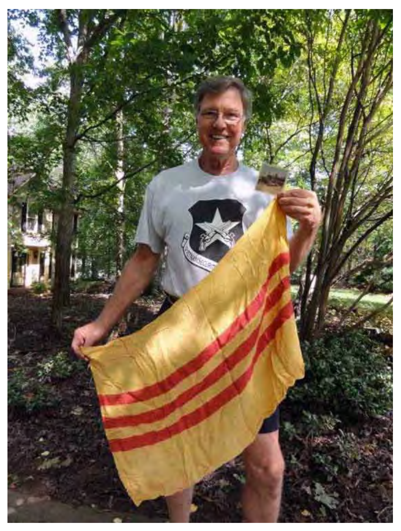
5. Here's a photo of me with the SVN flag I traded "C" rations for. I'm holding the photo of the flag flying on the bunker at the Water Point after the attack and after my trade with the local boy who climbed the flag pole in the village to get the flag for me.