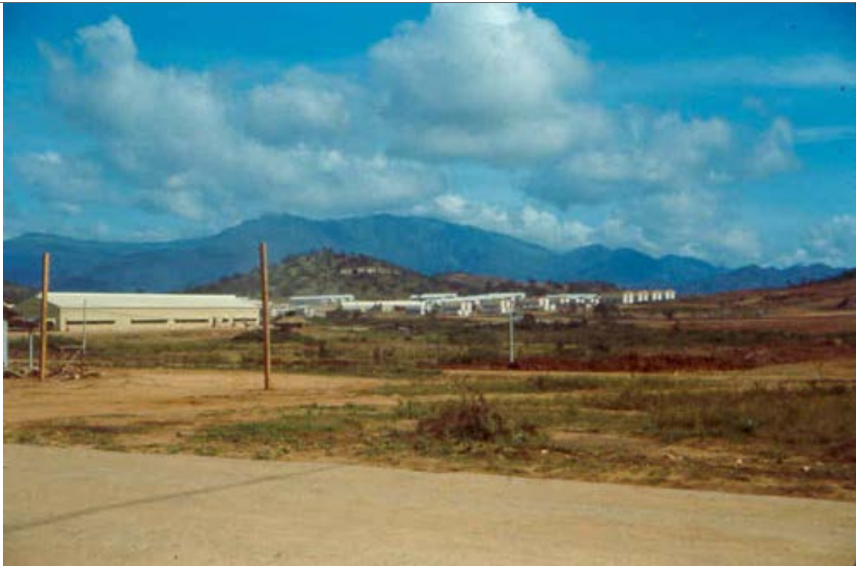
18. Phan Rang Aviators' Quarters, 1966.

1- Town Patrol * 2- MP Station * 3- Convoy-Eagle Station * 4- Phan Rang Area * 5- MED Call * 6- Seaside * 7- SP Quarters Phan Rang AB Stories and Photos * VSPA Homepage