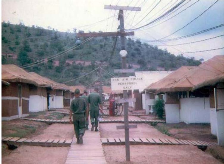
6. Phan Rang SPS Quarters. 1966.