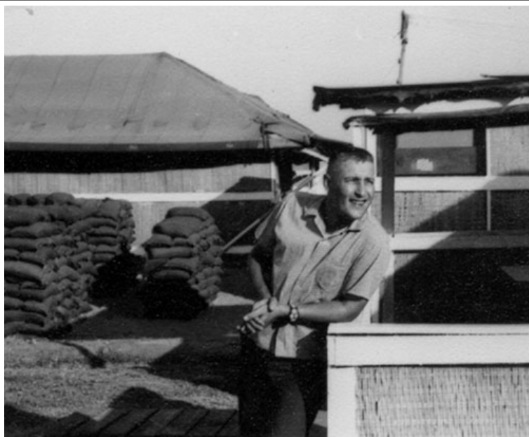
13. Phan Rang SPS Quarters 1966.