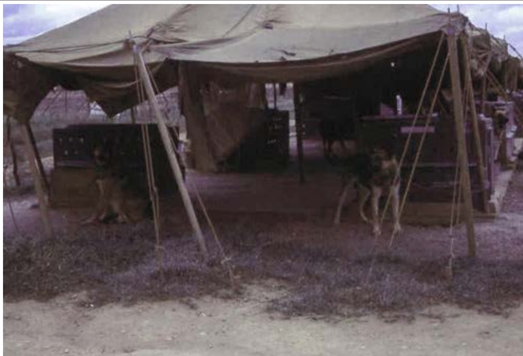
2. Phan Rang SPS Quarters. K-9 kennels, early 1966. 1966.