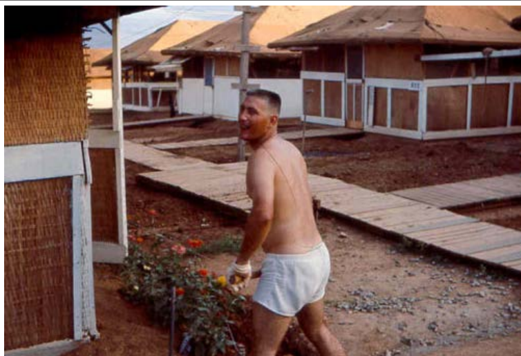
7. Phan Rang SPS Quarters. 1966.