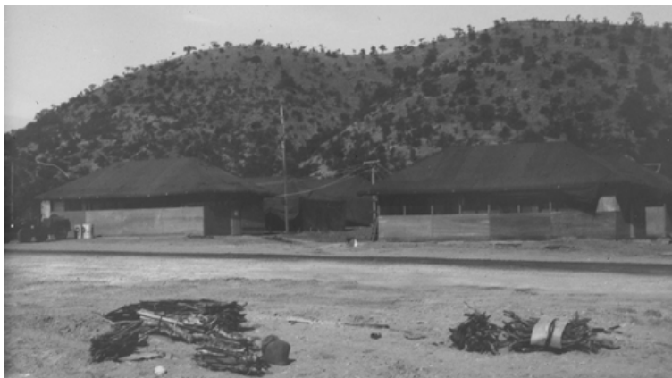
4. Phan Rang SPS Quarters. New hooches. 1966.