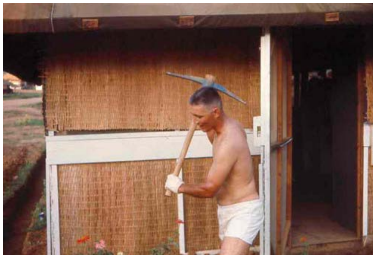
9. Phan Rang SPS Quarters. 1966.