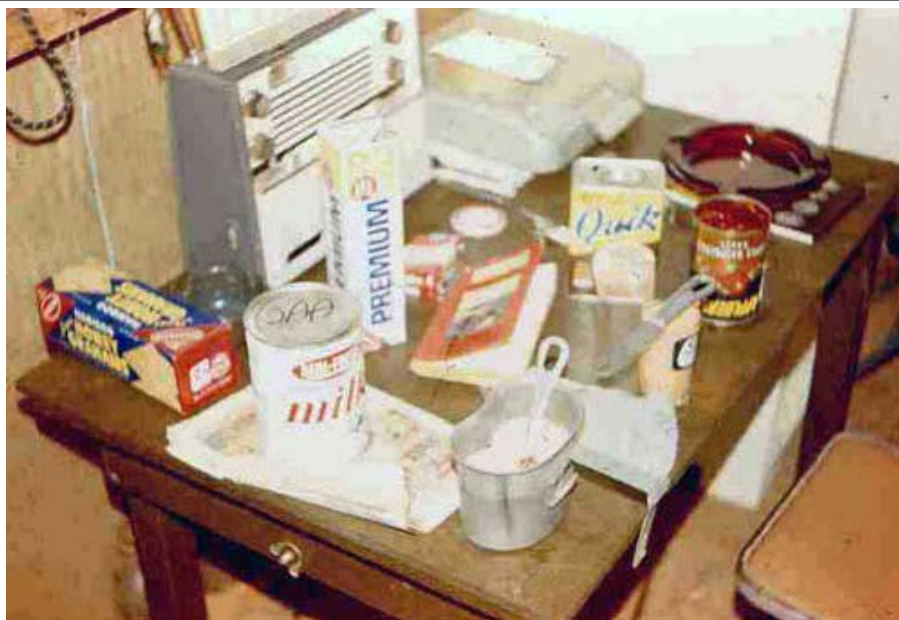
17. Phan Rang SPS Quarters: Dining-In 1966. Note: Canteen Cup, Chocolate mix, crackers and peanut butter and a radio -- gotta love it!