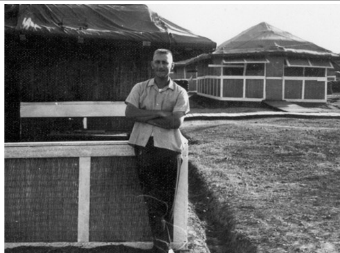
12. Phan Rang SPS Quarters 1966.