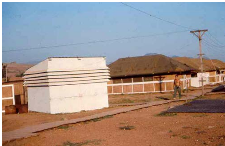
15. Phan Rang SP Popular Meeting Place. 1966.