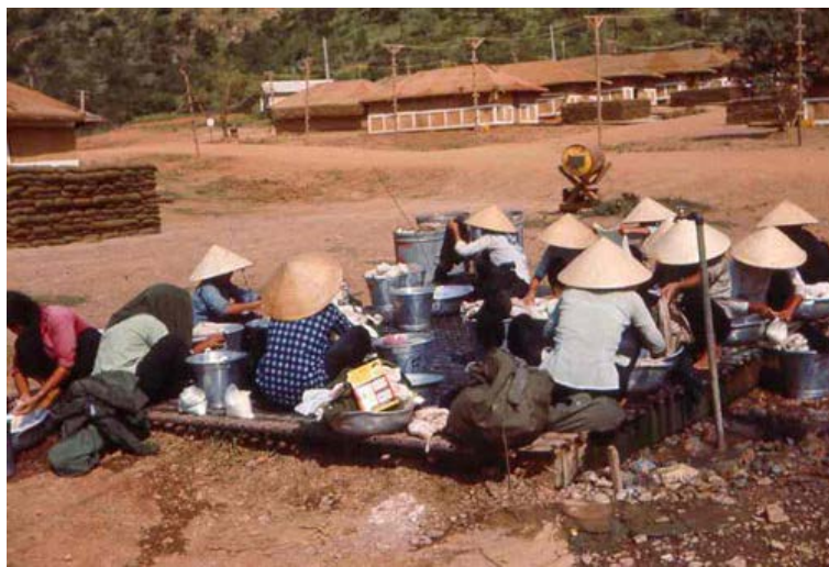
10. Phan Rang SPS Quarters. 1966.