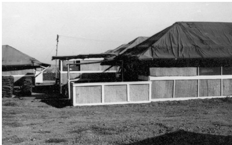
14. Phan Rang SPS Quarters 1966.