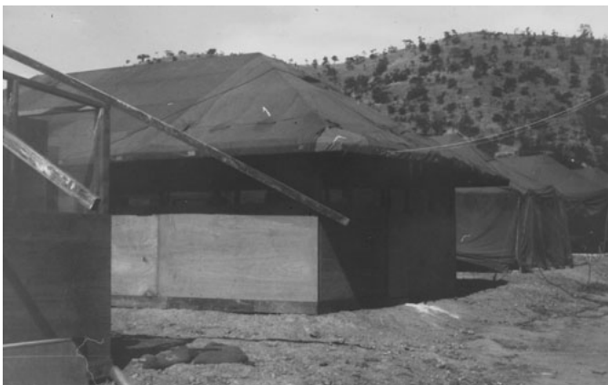
3. Phan Rang SPS Quarters. New hooches. 1966.