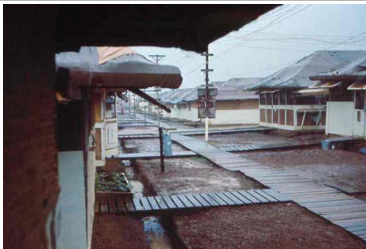
11. Phan Rang SPS Quarters. 1966.