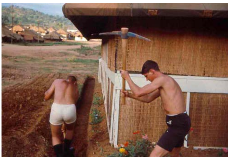
8. Phan Rang SPS Quarters. 1966.