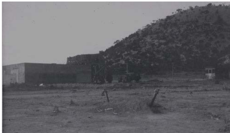
16. Phan Rang SPS Quarters. P-tubes. 1966.