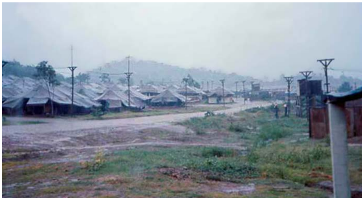
1. Phan Rang SPS Quarters. Rainy Day... Tent City, early 1966. 1966.

1- Town Patrol * 2- MP Station * 3- Convoy-Eagle Station * 4- Phan Rang Area * 5- MED Call * 6- Seaside * 7- SP Quarters Phan Rang AB Stories and Photos * VSPA Homepage