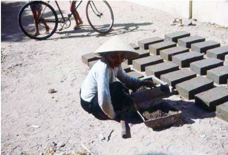
9. Phan Rang MED Call. 1966.