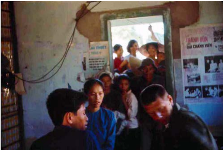
1. Phan Rang MED Call. 1966.

1- Town Patrol * 2- MP Station * 3- Convoy-Eagle Station * 4- Phan Rang Area * 5- MED Call * 6- Seaside * 7- SP Quarters Phan Rang AB Stories and Photos * VSPA Homepage