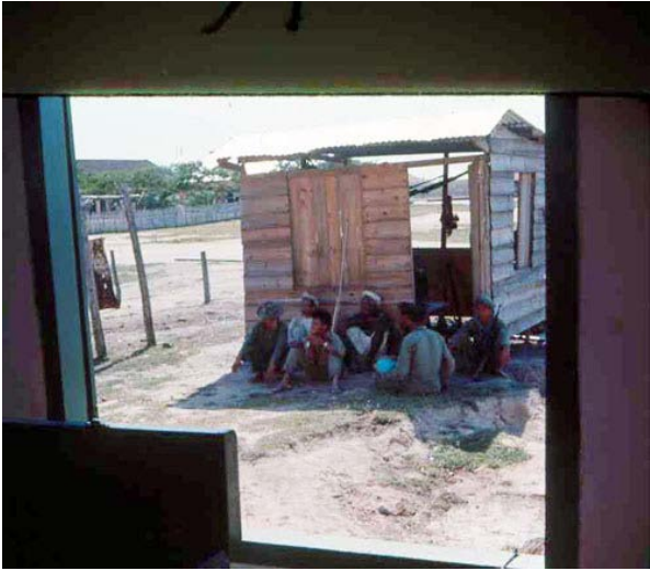
11. Phan Rang MED Call. 1966.