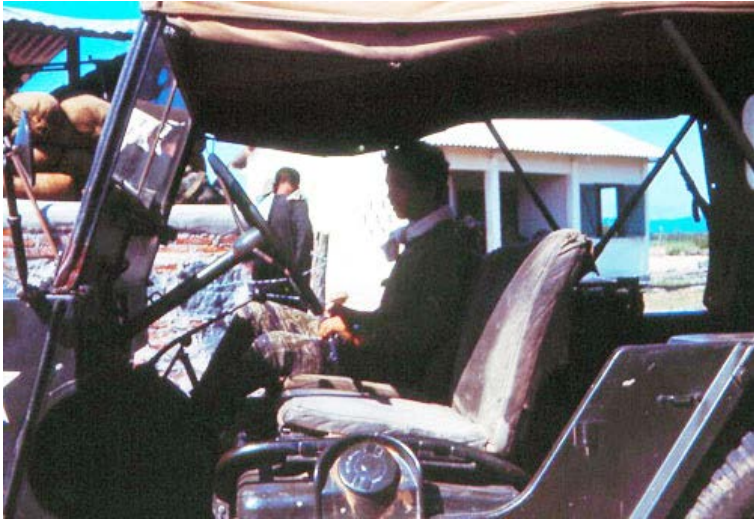
12. Phan Rang MED Call. 1966.