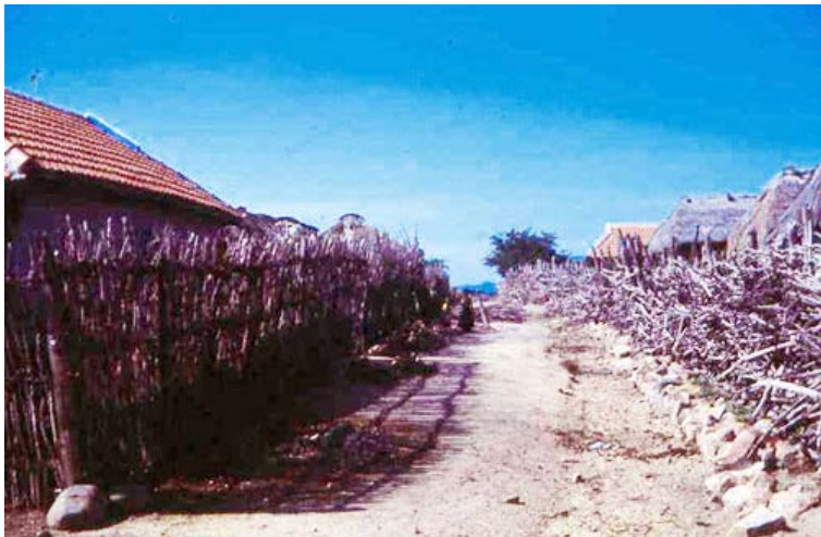
7. Phan Rang MED Call. 1966.