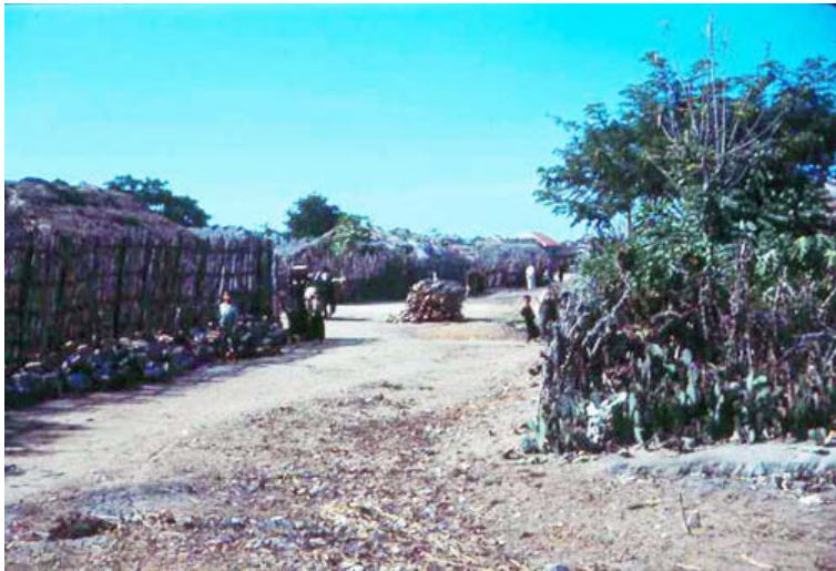
5. Phan Rang MED Call. 1966.