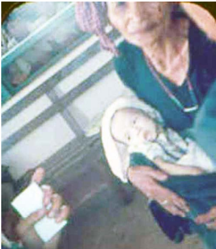
17. Phan Rang MED Call. 1966.