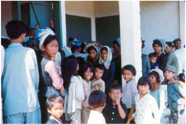
14. Phan Rang MED Call. 1966.