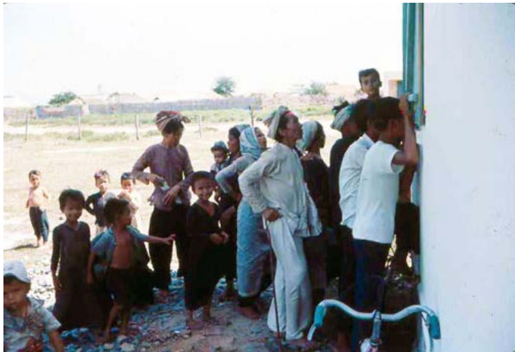
15. Phan Rang MED Call. Window peepers. 1966.