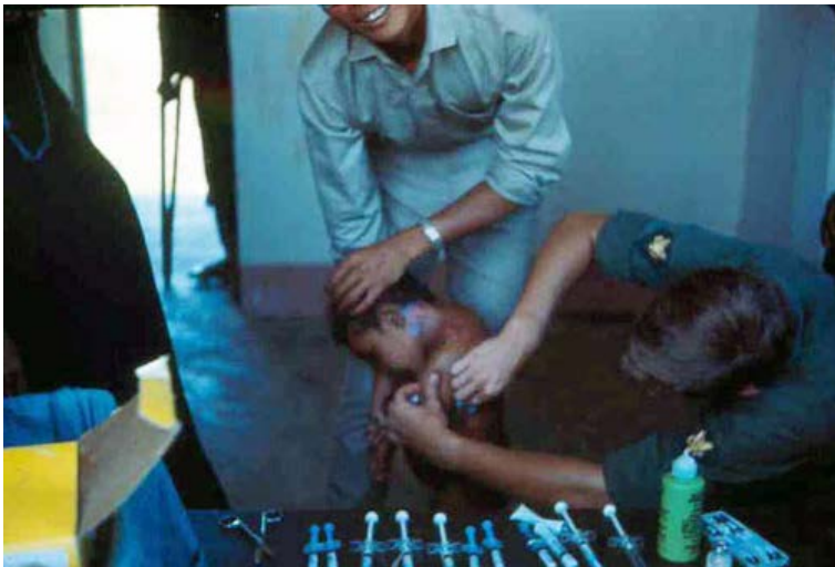
16. Phan Rang MED Call. 1966.