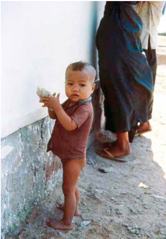
20. Phan Rang MED Call. 1966.

1- Town Patrol * 2- MP Station * 3- Convoy-Eagle Station * 4- Phan Rang Area * 5- MED Call * 6- Seaside * 7- SP Quarters Phan Rang AB Stories and Photos * VSPA Homepage