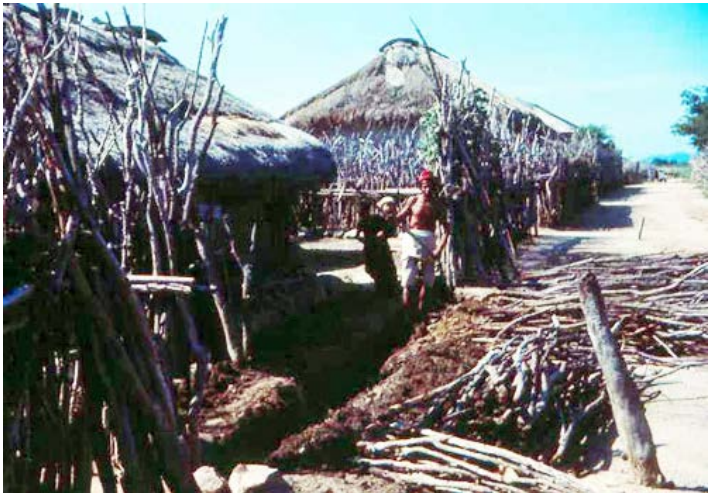
8. Phan Rang MED Call. 1966.