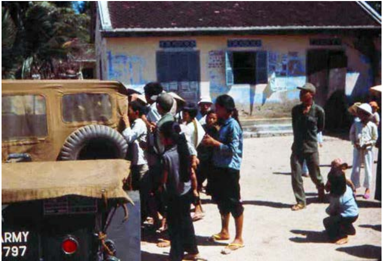
10. Phan Rang MED Call. 1966.