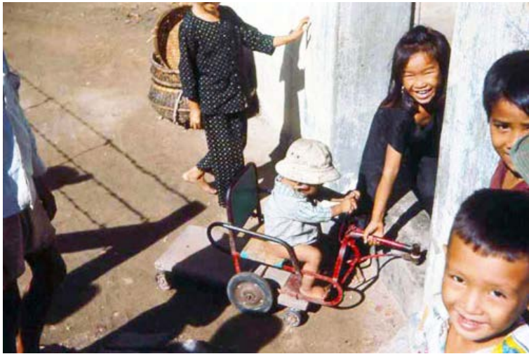
19. Phan Rang MED Call: NEXT! 1966.