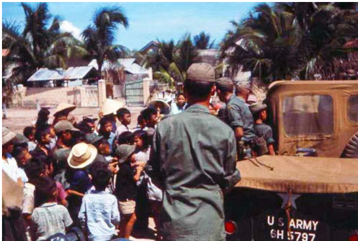
3. Phan Rang MED Call. 1966.