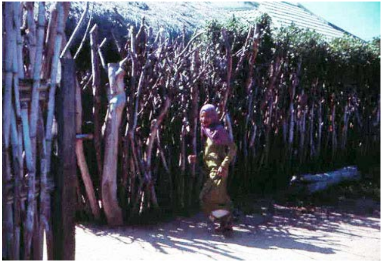
6. Phan Rang MED Call. 1966.