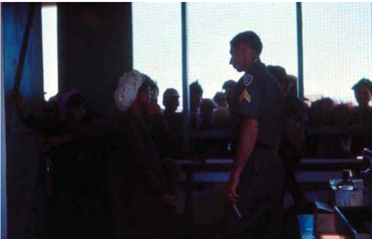
4. Phan Rang MED Call. 1966.