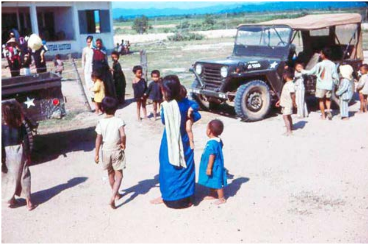
13. Phan Rang MED Call. 1966.