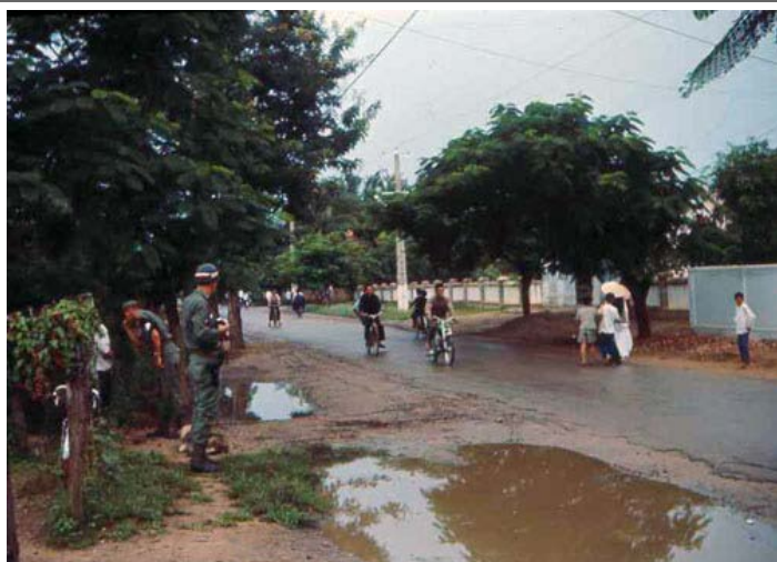
21. Phan Rang MP Station. 1966.