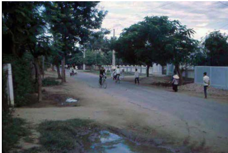
20. Phan Rang MP Station. 1966.