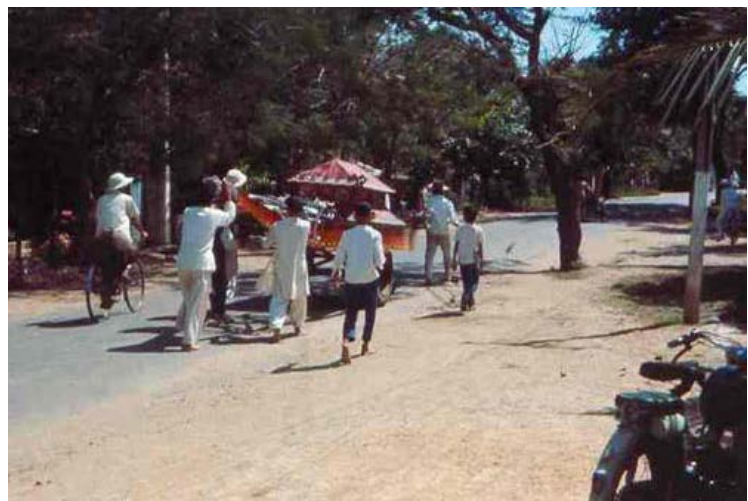
16. Phan Rang MP Station. 1966.