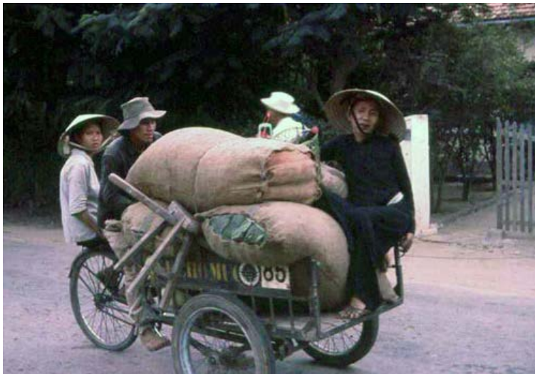
11. Phan Rang MP Station. 1966.