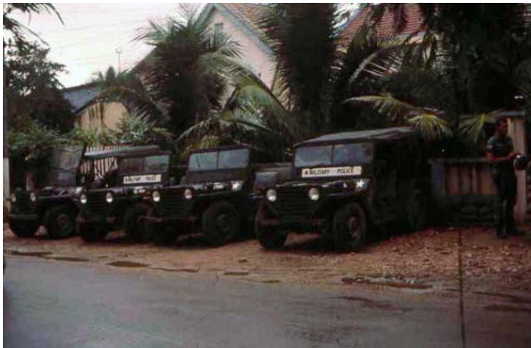
9. Phan Rang MP Station. QC/MP Jeeps. 1966.