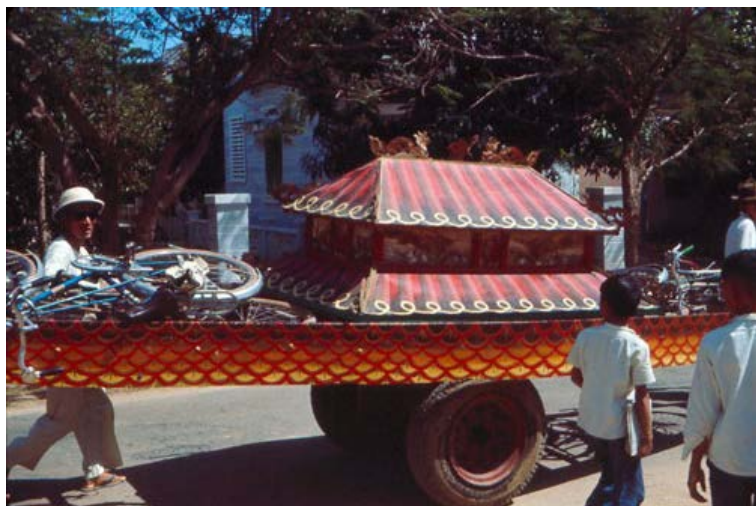
13. Phan Rang MP Station. 1966.