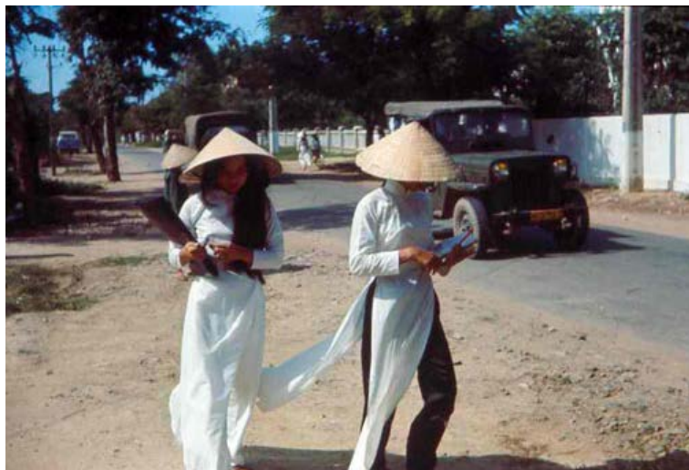
17. Phan Rang MP Station. 1966.