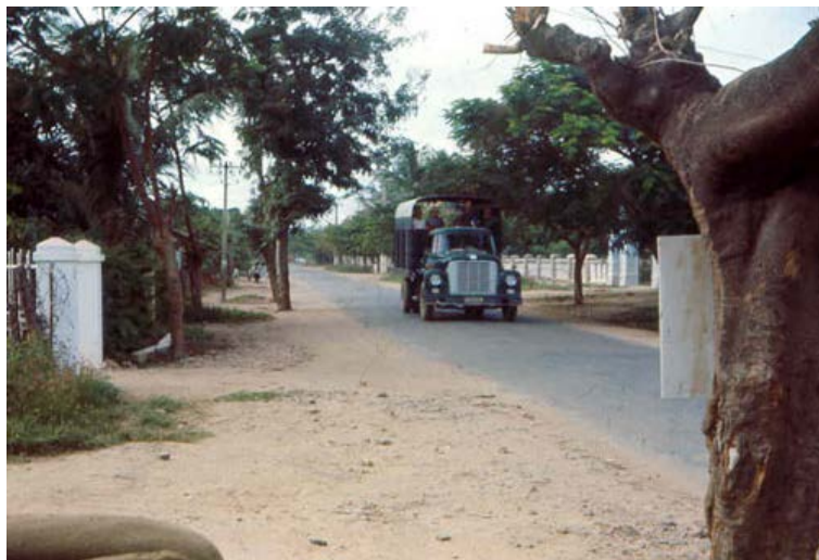
18. Phan Rang MP Station. 1966.