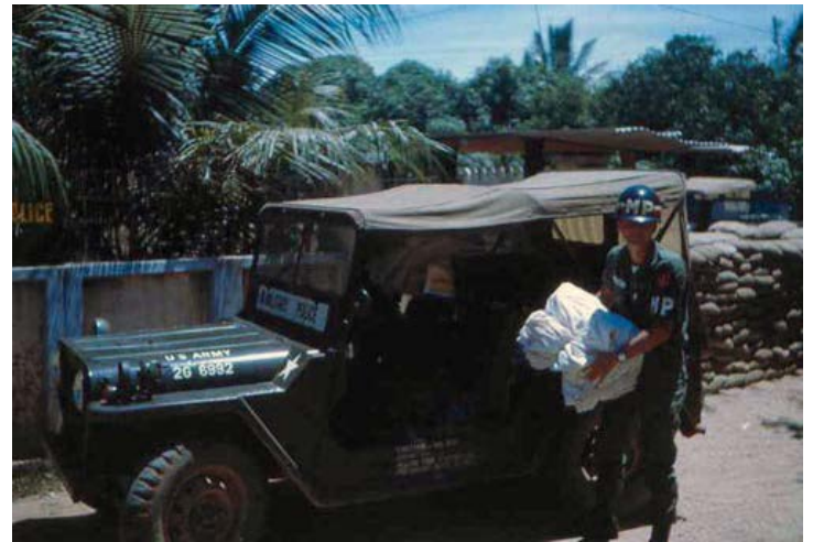
10. Phan Rang MP Station. QC/MP Jeeps. 1966.