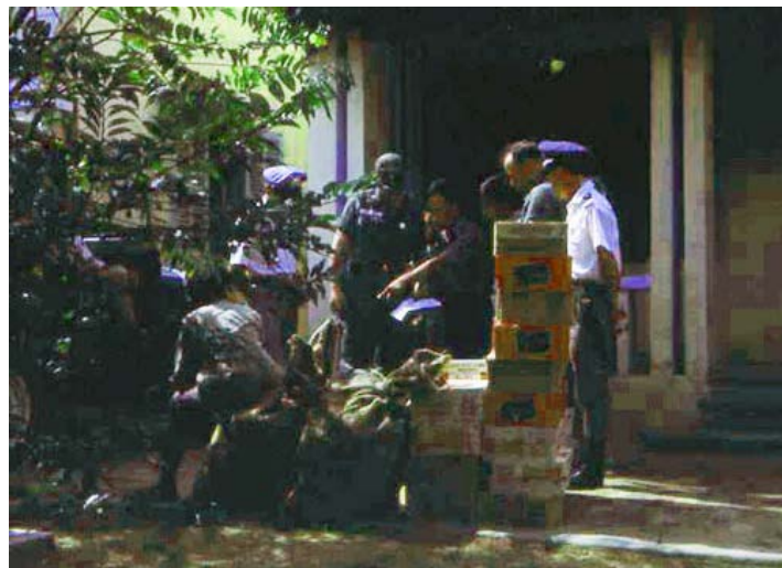
28. Phan Rang MP Station. 1966.