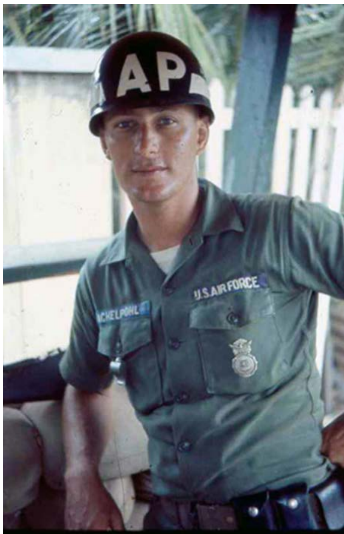
3. Phan Rang MP Station. Bunker 1966.