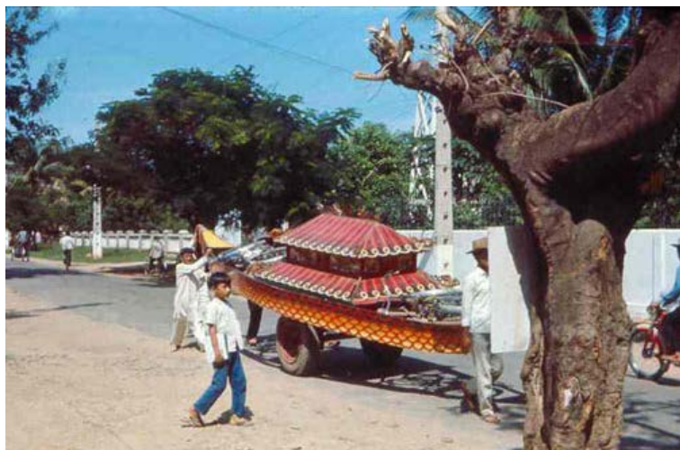
15. Phan Rang MP Station. 1966.