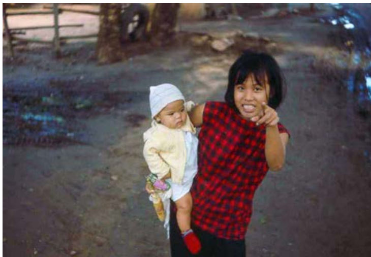
25. Phan Rang MP Station. 1966.