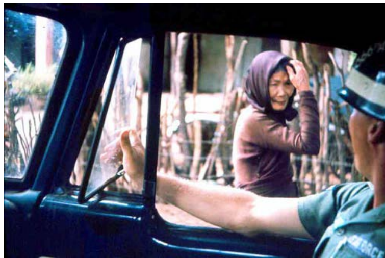
26. Phan Rang MP Station. Wood Station. 1966.