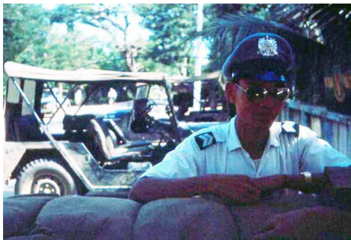
29. Phan Rang MP Station. 1966.