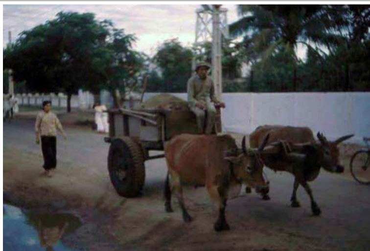
23. Phan Rang MP Station. 1966.