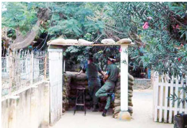
5. Phan Rang MP Station. Check point bunker. 1966.