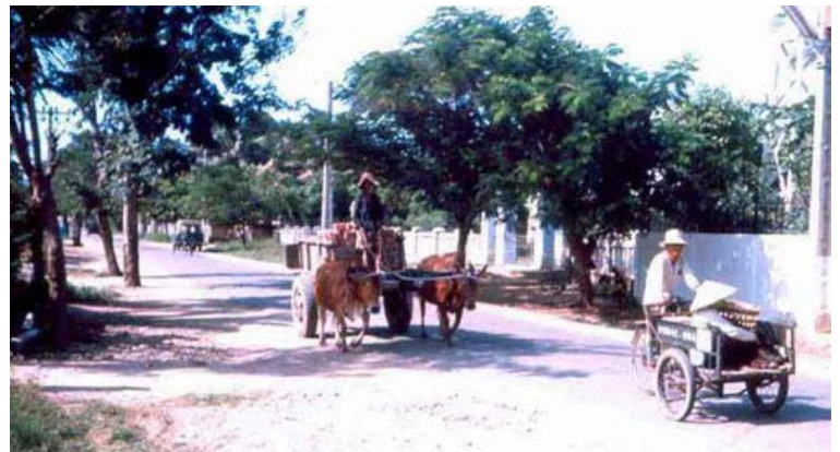
12. Phan Rang MP Station. 1966.