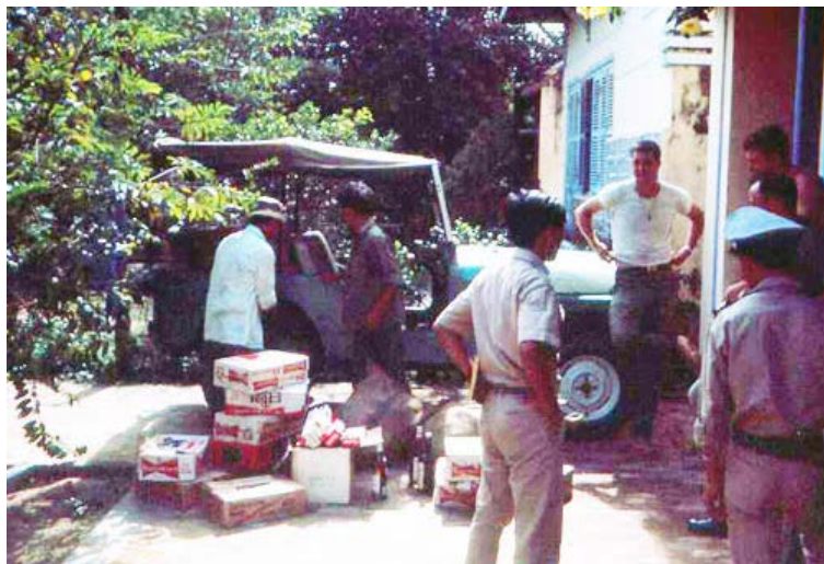
27. Phan Rang MP Station. 1966.