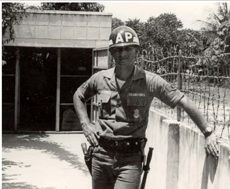
1. Phan Rang MP Station. 1966.

1- Town Patrol * 2- MP Station * 3- Convoy-Eagle Station * 4- Phan Rang Area * 5- MED Call * 6- Seaside * 7- SP Quarters Phan Rang AB Stories and Photos * VSPA Homepage