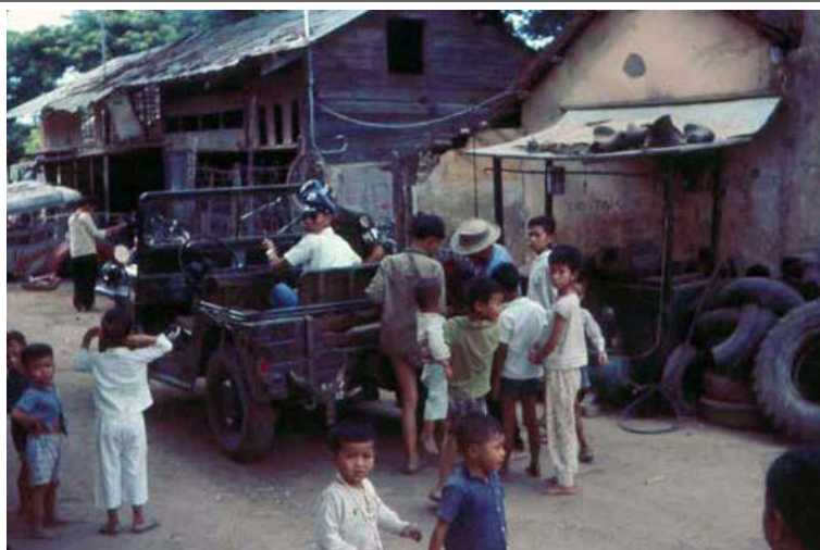
22. Phan Rang MP Station. 1966.