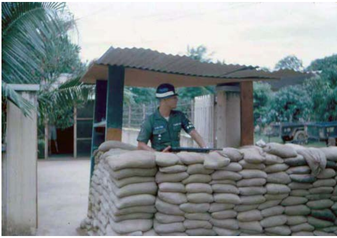
7. Phan Rang MP Station. Check point bunker. 1966.