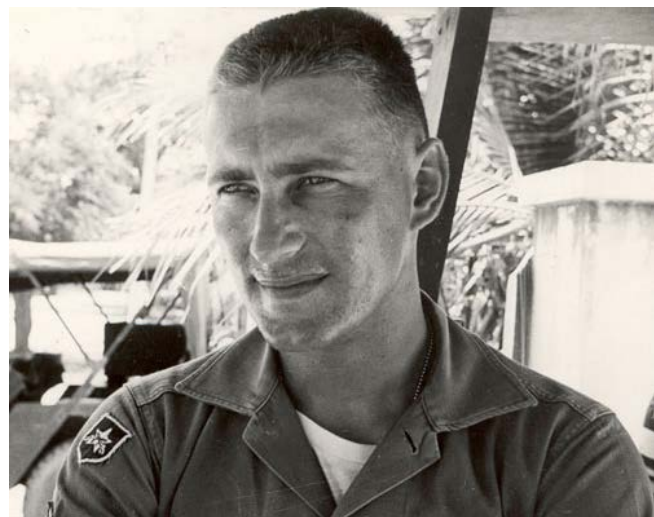
6. Phan Rang MP Station. 1966.