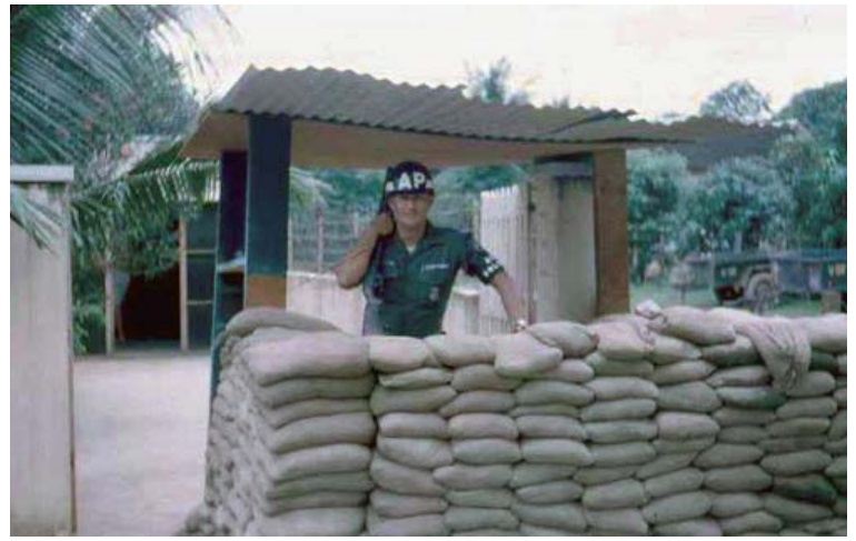
8. Phan Rang MP Station. Check point bunker. 1966.