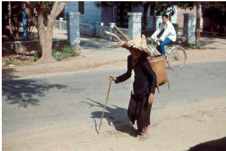
14. Phan Rang MP Station. 1966.