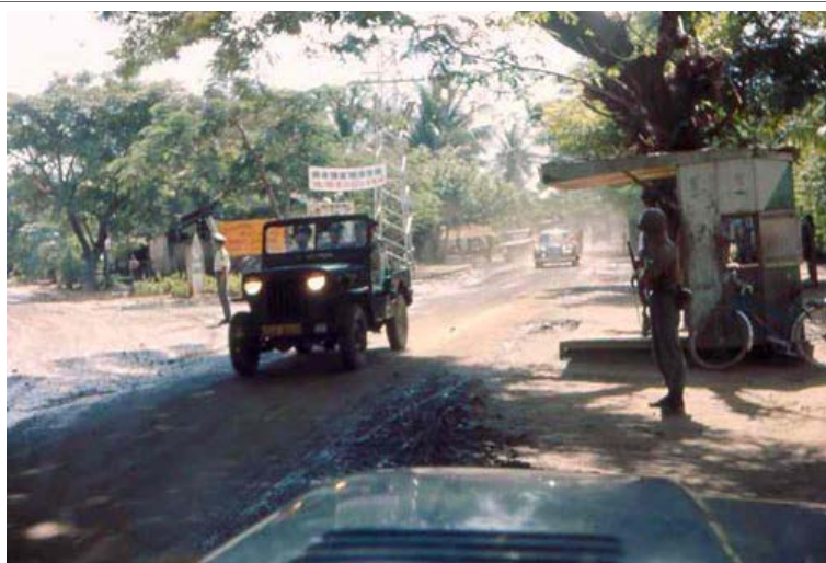
24. Phan Rang MP Station. 1966.