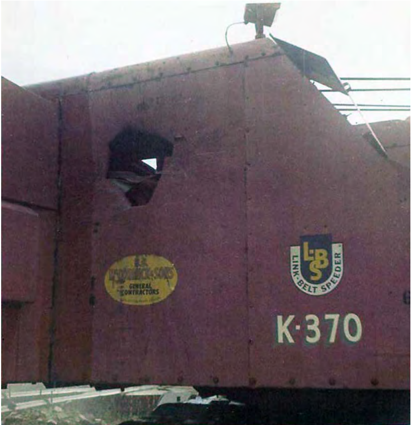
8. Phan Rang AB: Waterpoint Bunker, Outside of Base. Shrapnel punctures in side of crane.