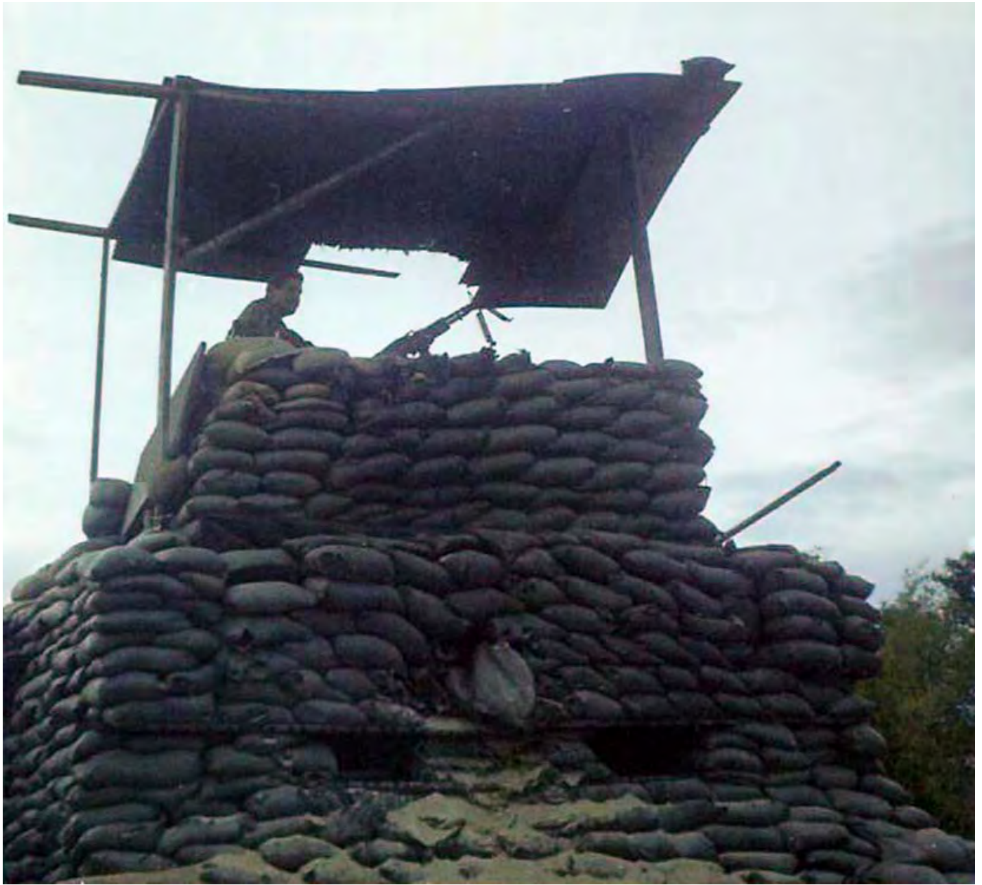
6. Phan Rang AB: Waterpoint Bunker, Outside of Base. M60.