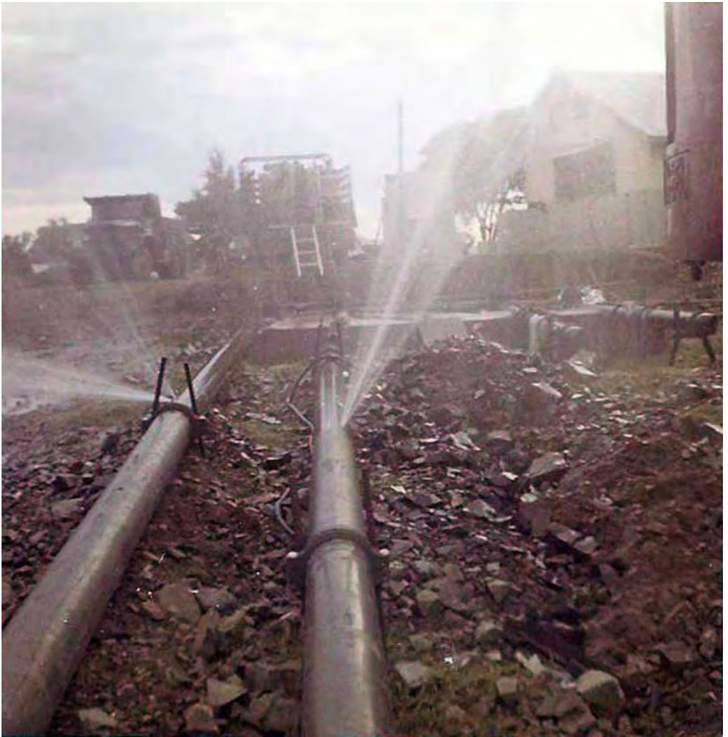
7. Phan Rang AB: Waterpoint Bunker, Outside of Base. Shrapnel punctures in water pipes.