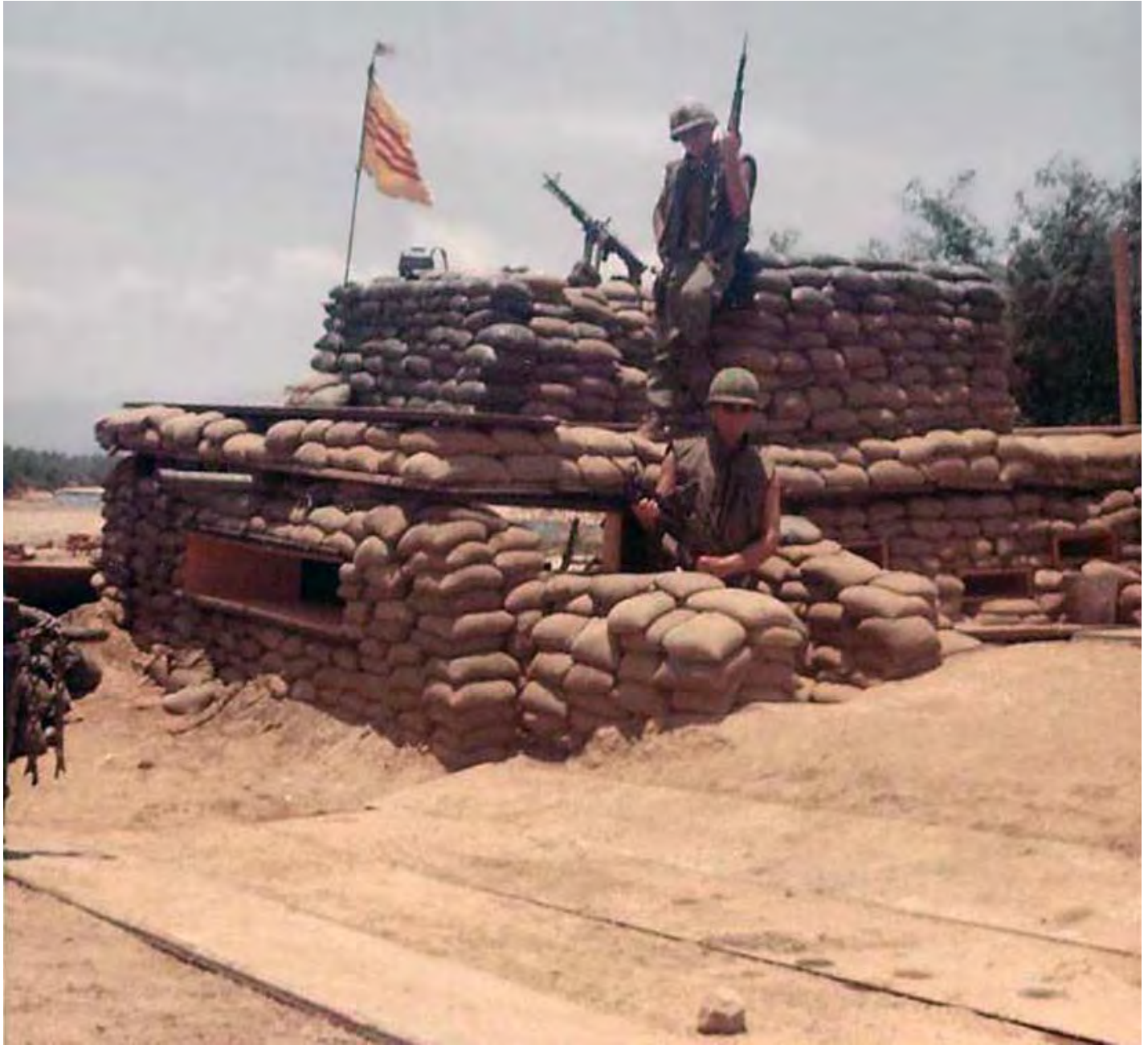
4. Phan Rang AB: Waterpoint Bunker, Outside of Base. M50. Note the (very small) USA Flag fluttering ontop of the South Vietnam flag!