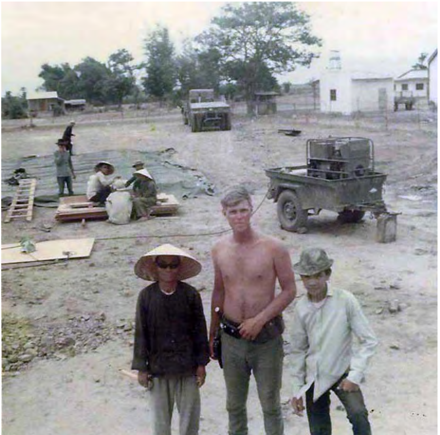
9. Phan Rang AB: Waterpoint Bunker, Outside of Base. Vietnames Workers.