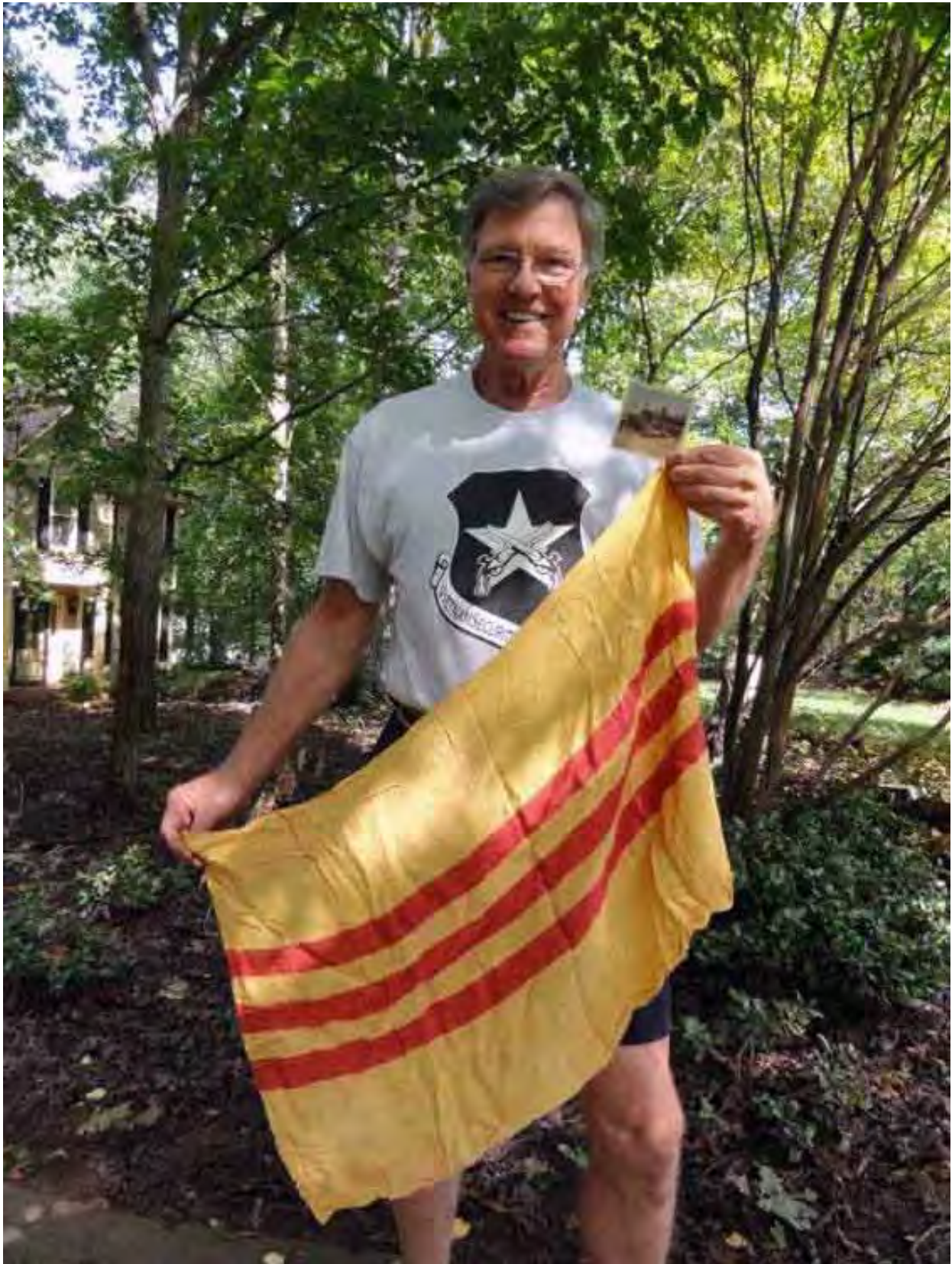
5. Here's a photo of me with the SVN flag I traded "C" rations for. I'm holding the photo of the flag flying on the bunker at the Water Point after the attack and after my trade with the local boy who climbed the flag pole in the village to get the flag for me.