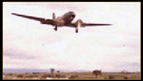
2) Pleiku: C-47 on short-final approach for landing.