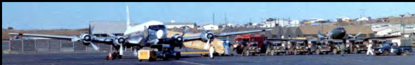
5) ... some were medevaced... others, made the final flight to rest.