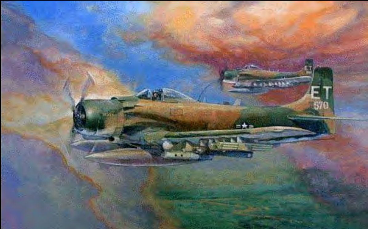
7) An ever-present Spad taxis to battle, as wounded are loaded in the aircraft above.