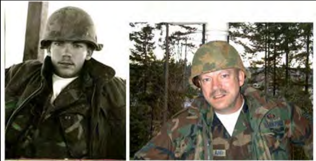
8) Father-Time moves on, as he must.