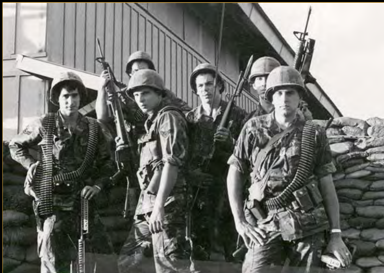
1) Schofield Barracks: 822nd CSPA. Were we every so young?