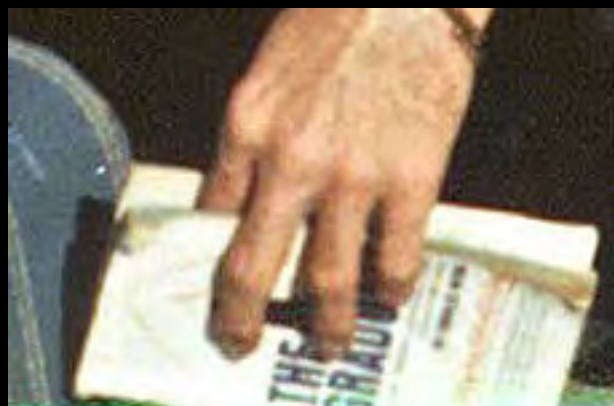
6) For those taking the Freedom Bird, a good book, like The Graduate , is great to have.