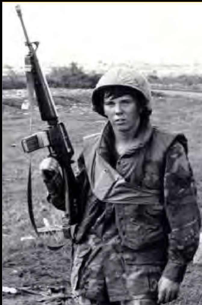
2) Pleiku: The training paid off. Still... After a while, it got to be a real drag.