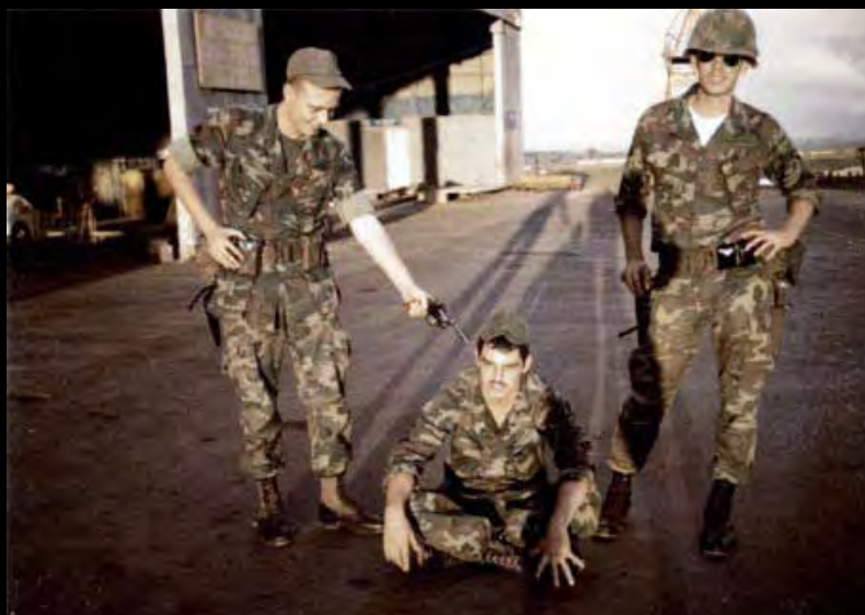
3) ... and boring enough for silly-games . This one cost me an Article-15. YoungAndDumb was one word, and seemed to go hand-in-hand.