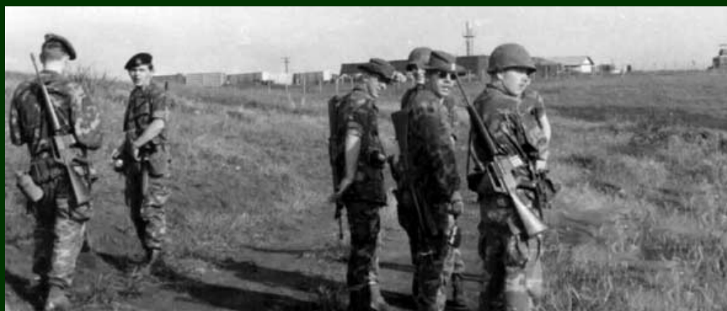
2) Aug 1967 'Ku Kops prepare to sweep perimeter.