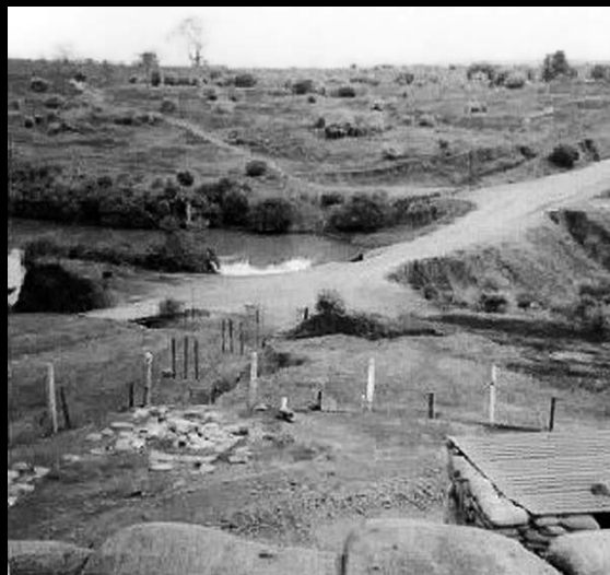
15) Pleiku SPS Bunker at River crossing. I believe this northeast corner of perimeter. Can anybody out there "Name That Post?"