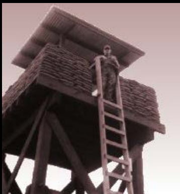
22) Perimeter Tower #7. AAAAAarrrrr-gggg Toe-ie. Splat.