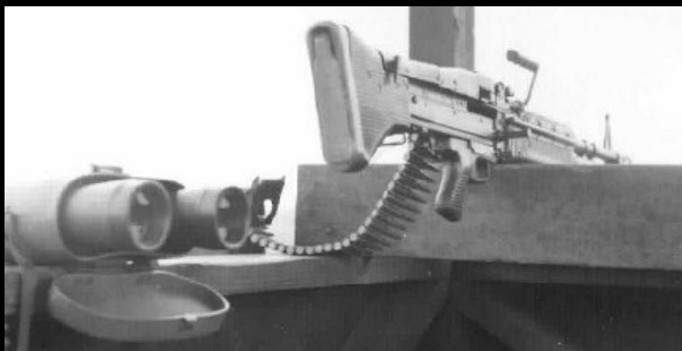
25) Tower Weapons! Tools of the trade.