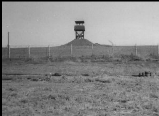
23) View of Tower from Perimeter.