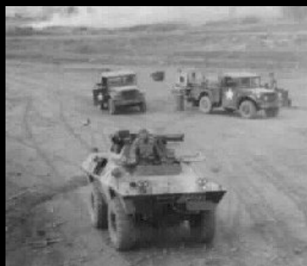
18) and 19) V100 as RSAT.