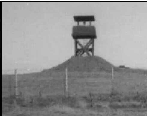
24) View of Tower from Perimeter.