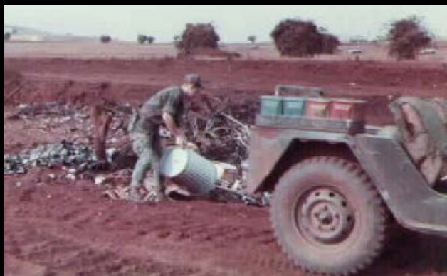
21)... Well... somebody's got to do it.