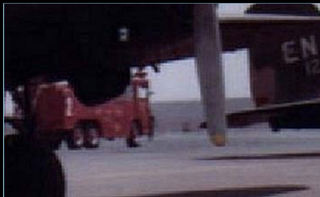
12) Every present Fire-Crash trucks.