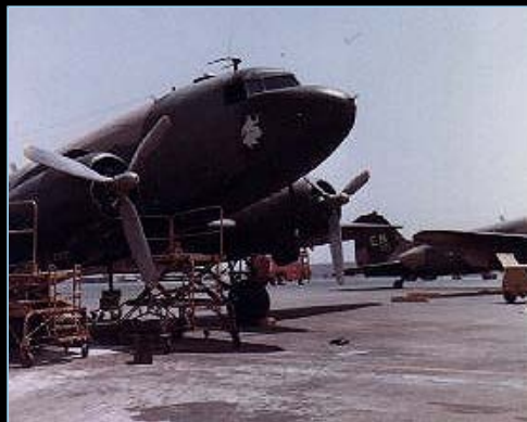
11) Spooky Gunship.