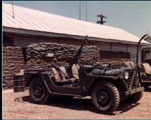
9) Pleiku SAT GPV in front of CSC.