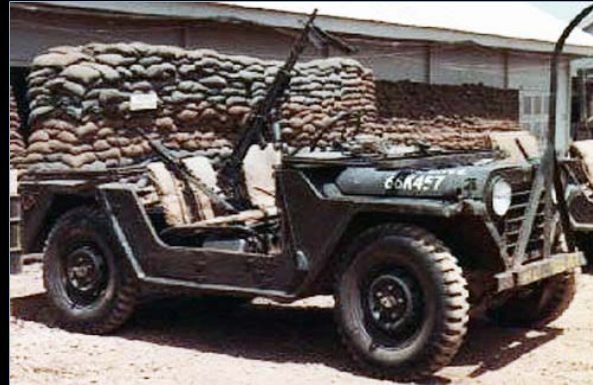
10) I like the GPV part since everyone is into "GPs" and SUVs today).