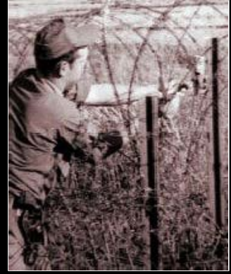
8) Perimeter, Arming Trip Flares on concertina wire.