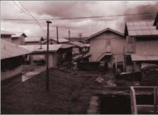
2) Pleiku, 633rd SPS Barracks.