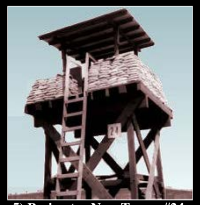
5) Perimeter New Tower #24.