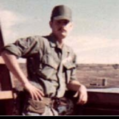
6) Pat/Hawk 5, himself, Shorttimer in Jan 1969. Hawk was the call signs for SATs, and Hawk 5 (me) was the utility patrol.