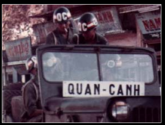
1) Q.C., South Vietnamese Military Police, patrol downtown Pleiku.