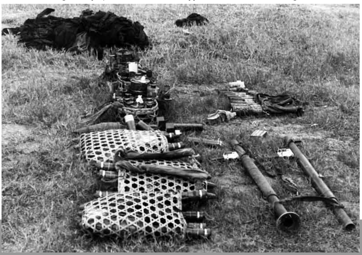
Photo below: Ton & Half 37th Security Police in ton'n'half Truck, recovering Viet Cong dead, wounded, and weapons cache.

One of the other recon groups uncovered a large cache of weapons and the clothing left behind as the sapper team disrobed to leave behind as much human scent as possible. Of interest is that undergarments of at least two women were found in the clothing pile. By the clothing count, projections were that the sapper team was about 25 strong.