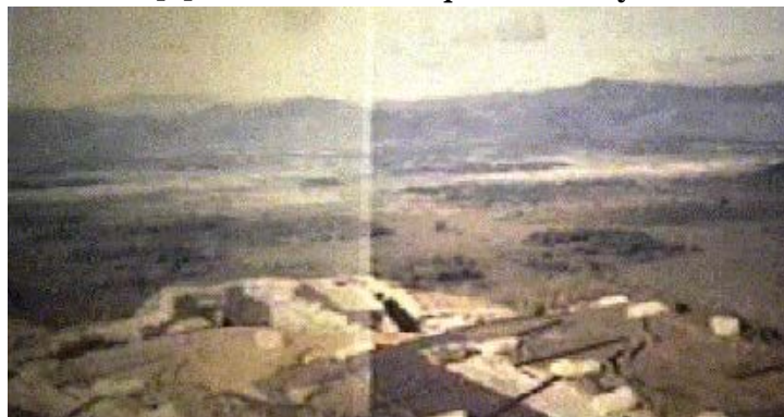
[3] PhuCat - Hill 151.