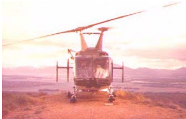
[6] Phù Cát - Hill 151,... click... Let's go home, men!