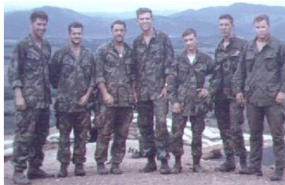
[2] Phù Cát: Close up... and dirty!