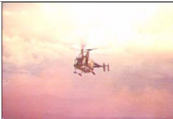
[4] Phù Cát - Hill 151, Chopper Pedro approaches.