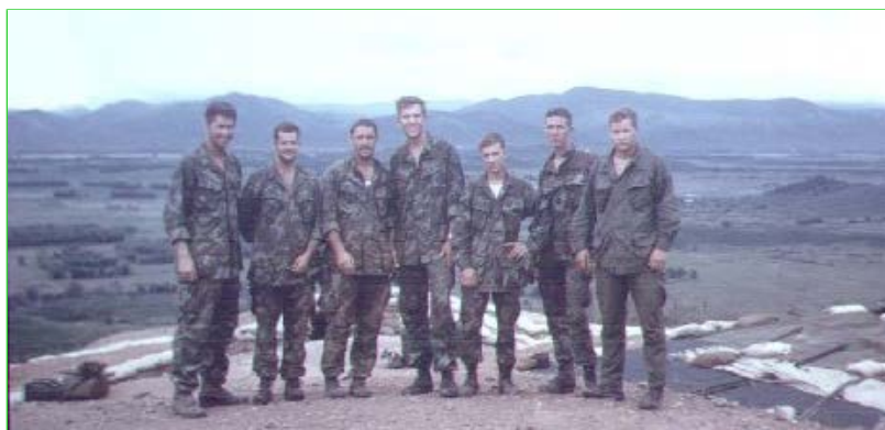
[1] Phù Cát (Dec 4, 1968): My fire-team on top of Hill 151.