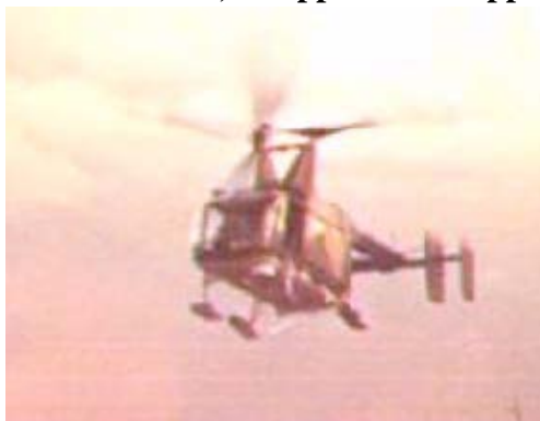
[5] Phù Cát - Hill 151, Relief... or just more C-rations?