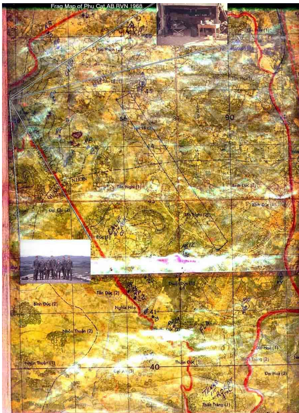
12. (Click Map for full View)