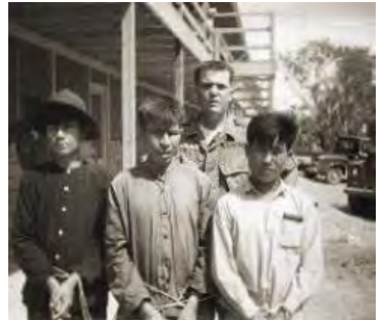
[17] (right) Three VC POWs in custody.