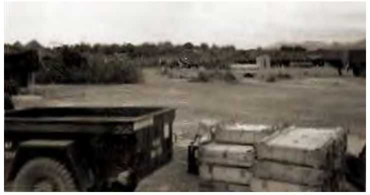
[8] Phù Cát Supplies keep arriving at a steady pace!