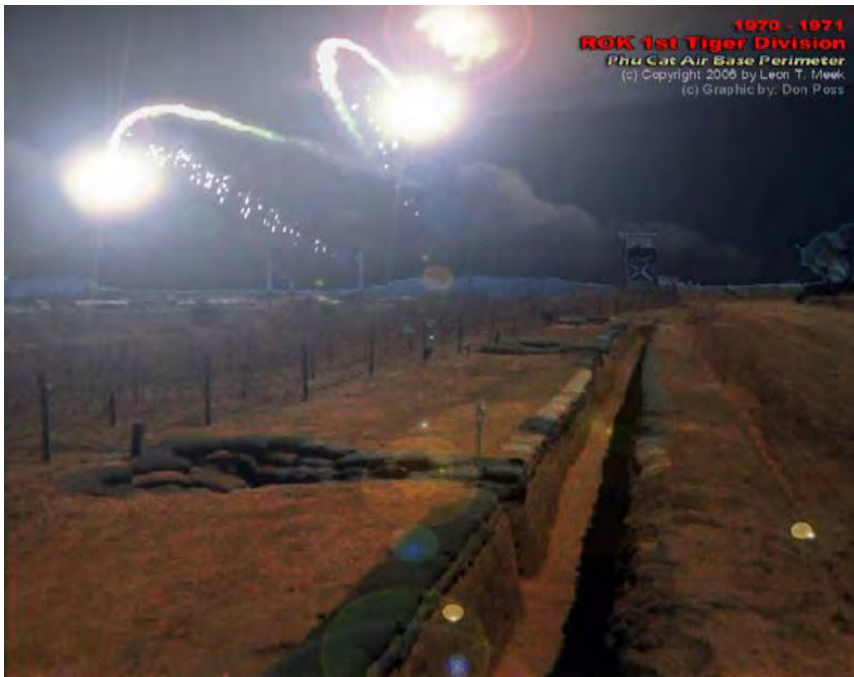
[15] (above) Composite photo of ROK trenches.