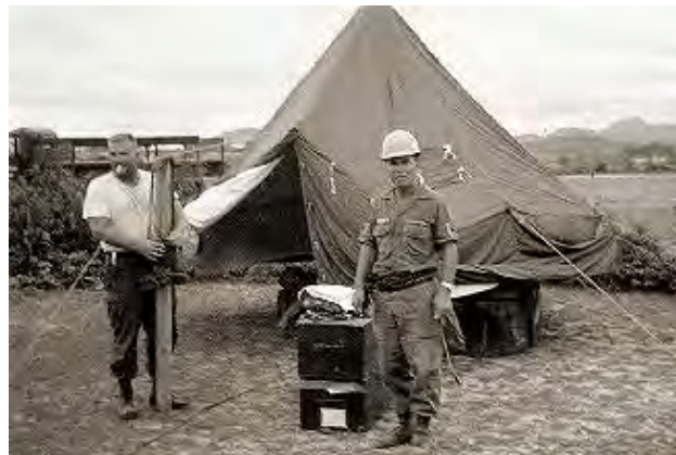
[4] We set up camp adjacent to the Temple and placed our M60's on the elevated graves to give elevated firing positions. Bunkers went up along with the tents in background.