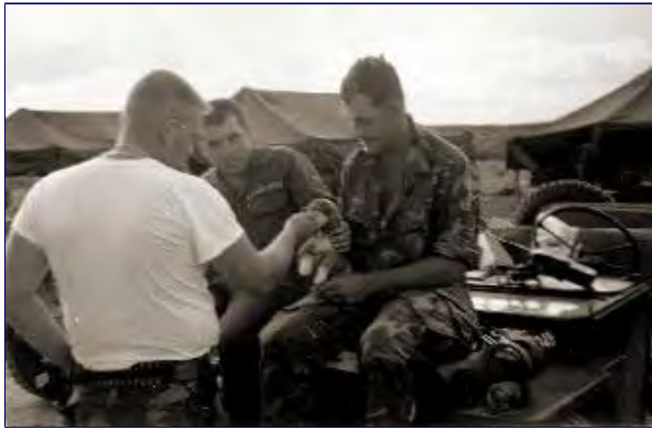
[7] Time out to pet a new mascot! Rabies, Sarge? No way!