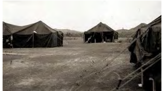
[12] HEY! Where are the cots?