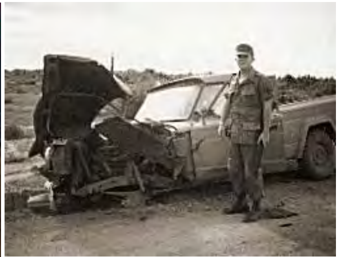
[16] Well... it was a nice ride while it lasted. Where's the BX, anyway?