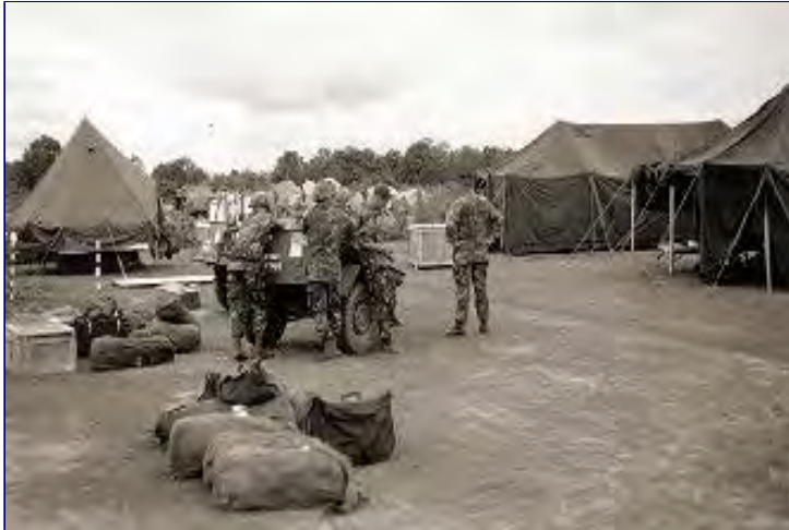
[9] All right you men... Back to work!