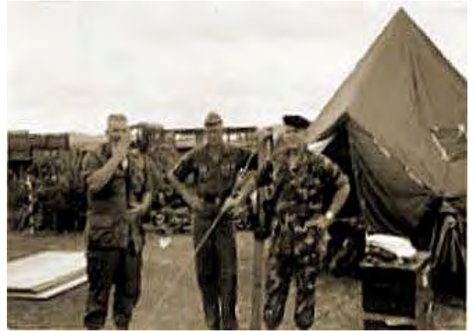
[10] Cots? Who cares! Where's the beer!