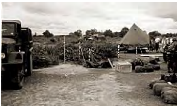
[11] Equipment is trucked in continually.