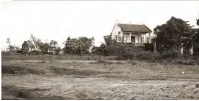
[2 & 3] This temple is the first thing we saw when we drove in to Phù Cát Air Base to-be property. There were still monks in it when we arrived.