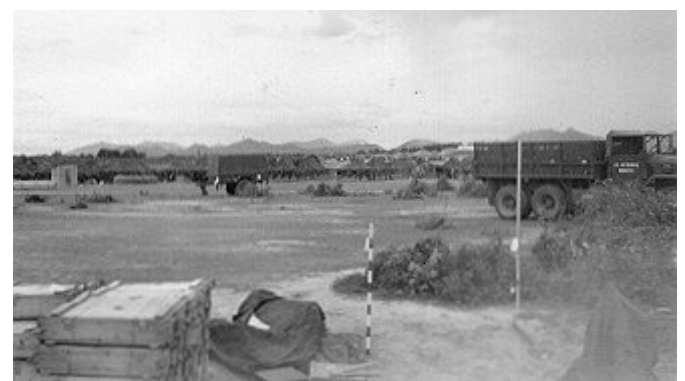
[14] Tent City begins to rise.