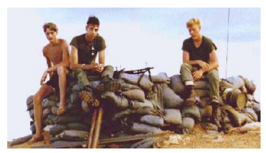
The 37th SPS sent up one E-4 and three Airmen. Pretty view... we were to sound the alarm for rockets... but the best part was --- it was cooler at night.