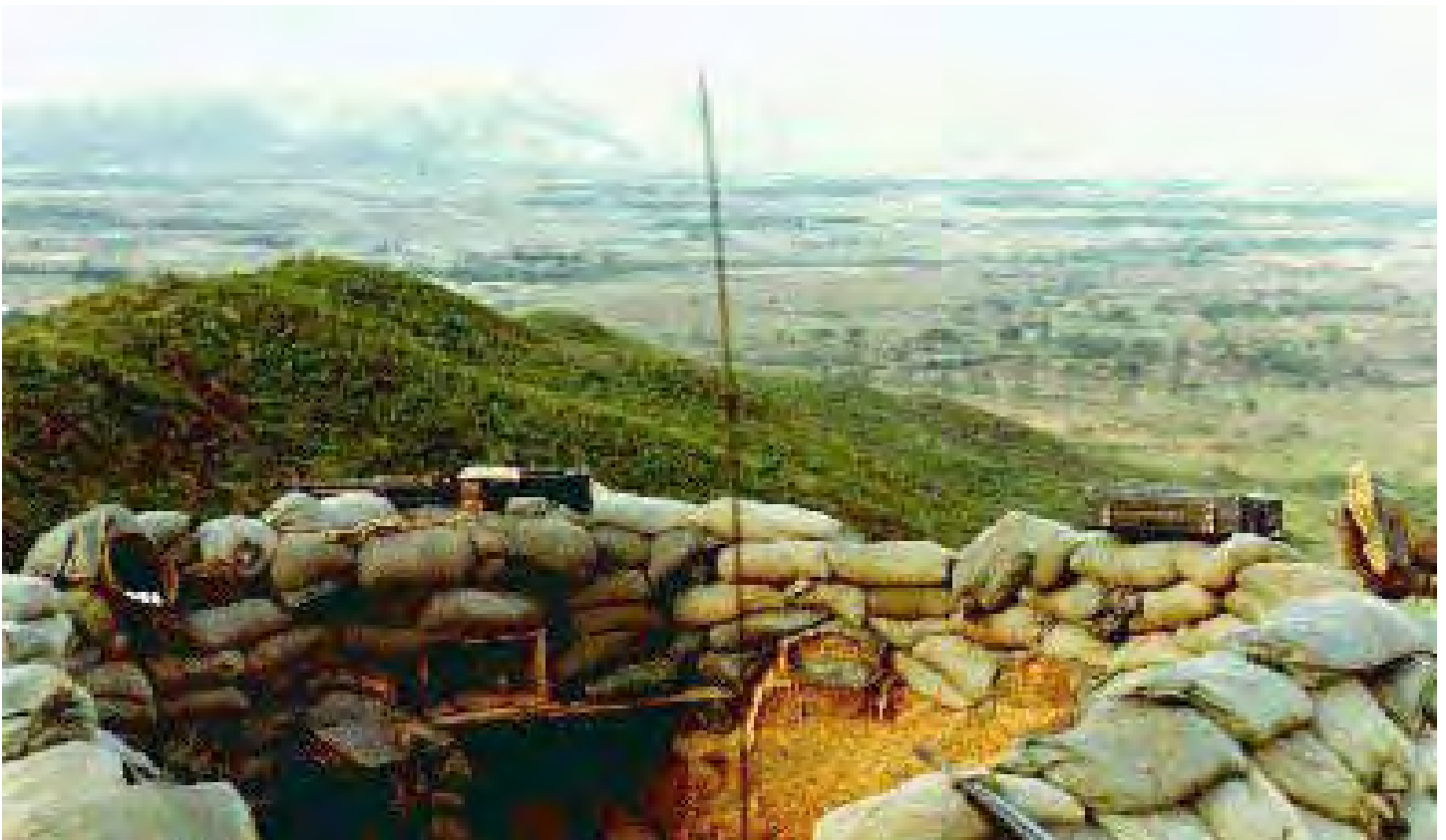
The Security Police squadron had an OP on the top of one of the hills (left side).