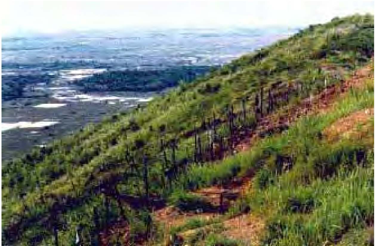
Here is a view of the hills of the south end of Phù Cát Air Base.