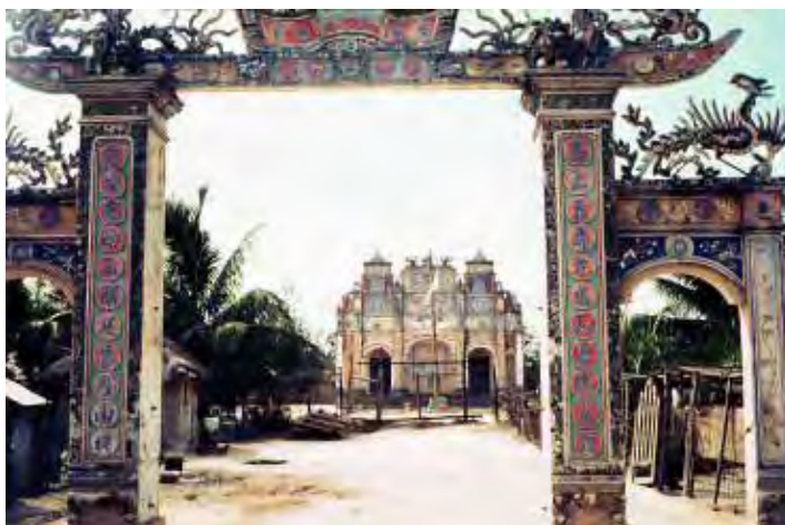
27. Buddhist temple near base.