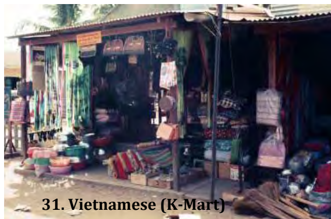
31. Vietnamese (K-Mart)