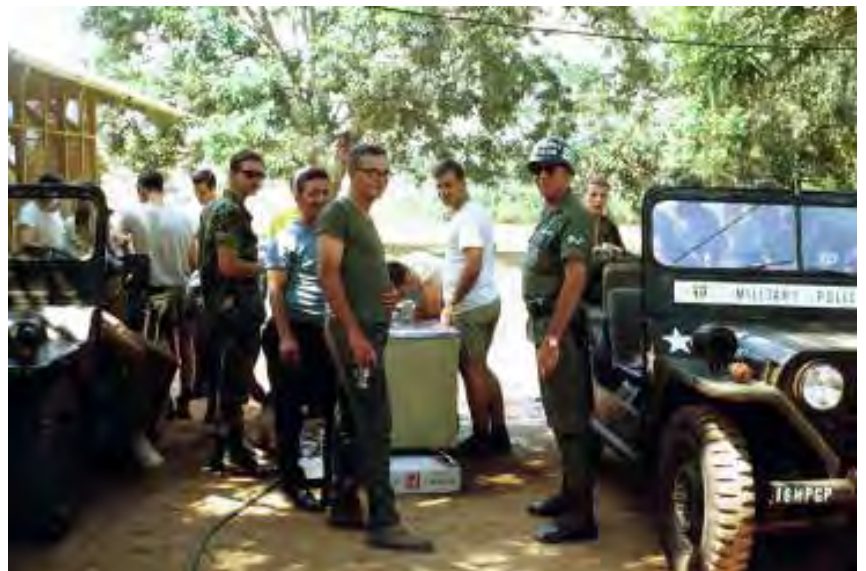
7. Red Horse recreation area (names