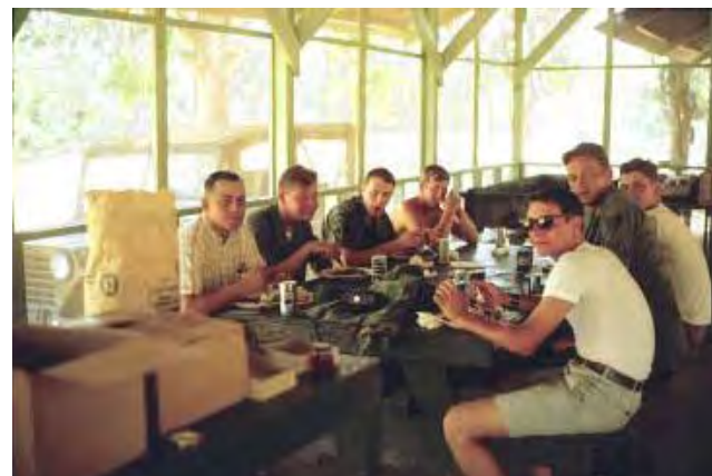
26. Anyone look famili