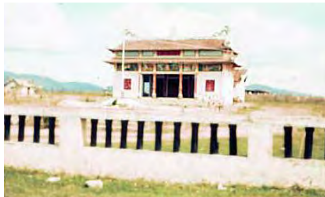
22. Buddhist temple near by.