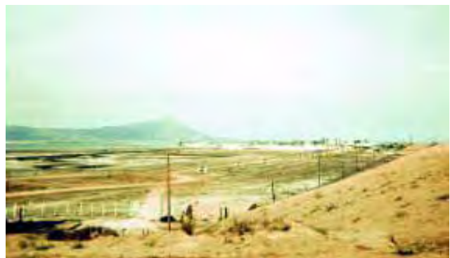
19. Perimeter area Phu Cat