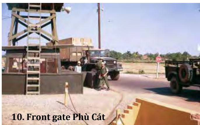
10. Front gate Phù Cát