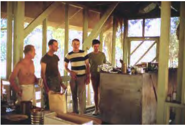
14. Waiting for the steaks to cook