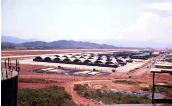
16. Phù Cát flight line and reventment areas