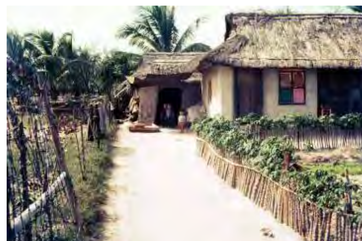
28. Vietnamese home along "The Stri