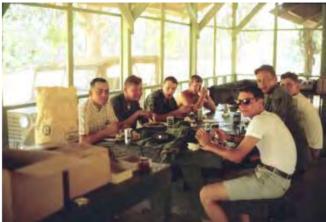
36. Anyone look familiar?