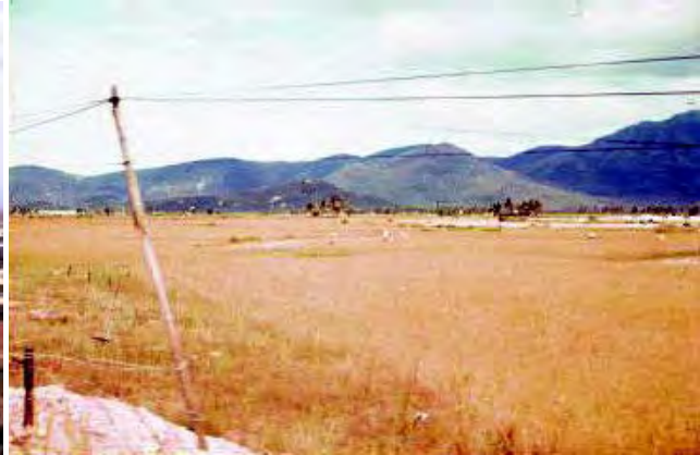
17. Rice paddy around perimeter