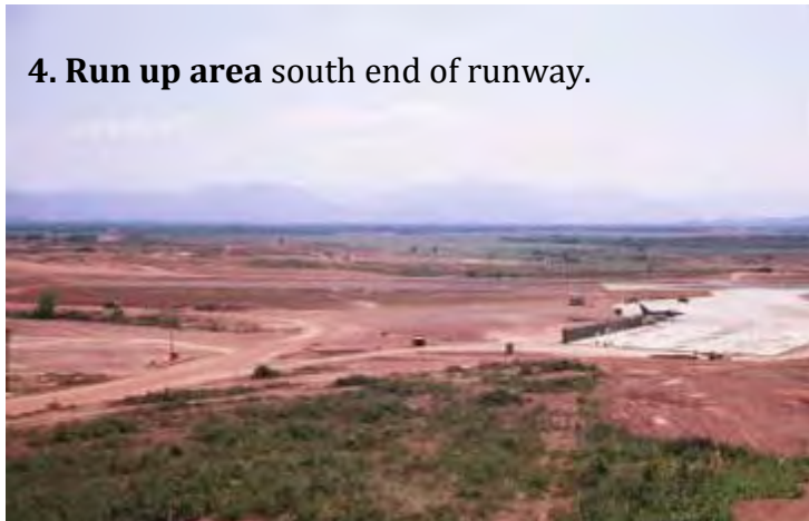
4. Run up area south end of runway.