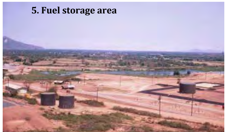
5. Fuel storage area