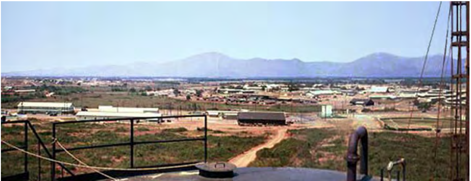
2. & 3. (composite) Phù Cát AFB (water tower post).