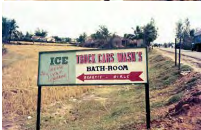
33. (Beautiful-Girls) never located.