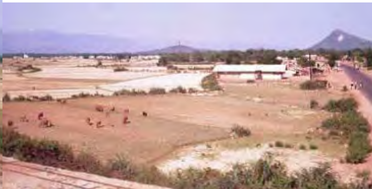
9. Front gate looking towards Hwy-1.