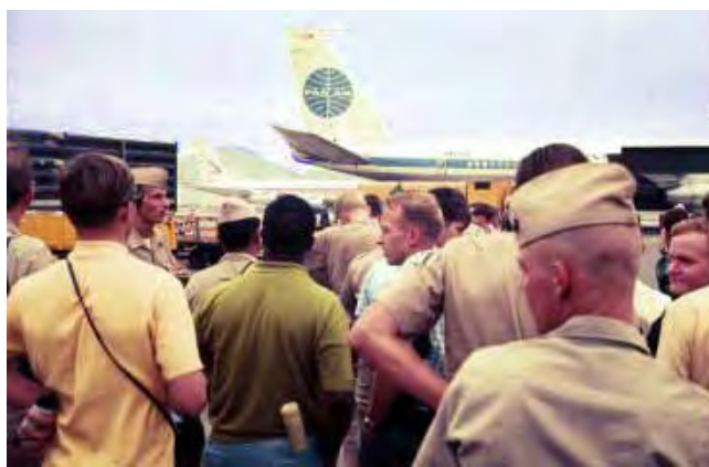
34. R&R Bound, Sydney Australia.