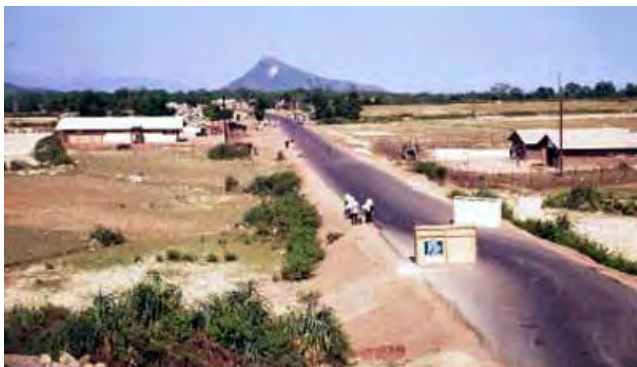
18. "The Strip" from front gate.