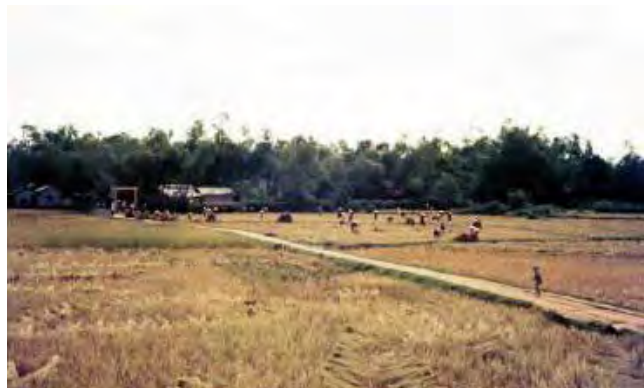
21. Farmers working the rice fields next to base