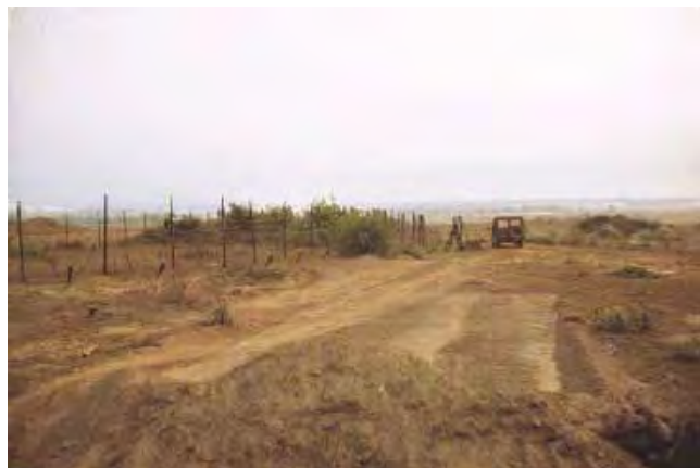
23. Sapper attack area March 1969.