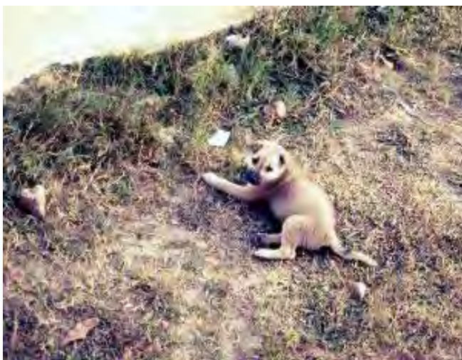
6. "Mac" Law enforcement mascot.