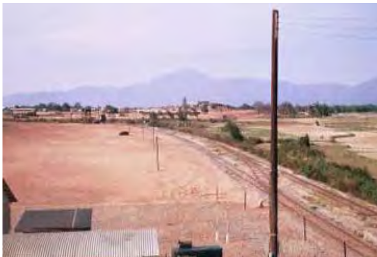
8. ROK camp adjacent to base.