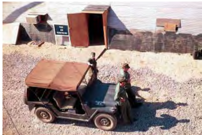
15. Pass and ID front gate