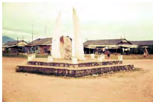
25. Monument near Phù Cát base.