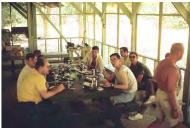
24. Recognize anyo