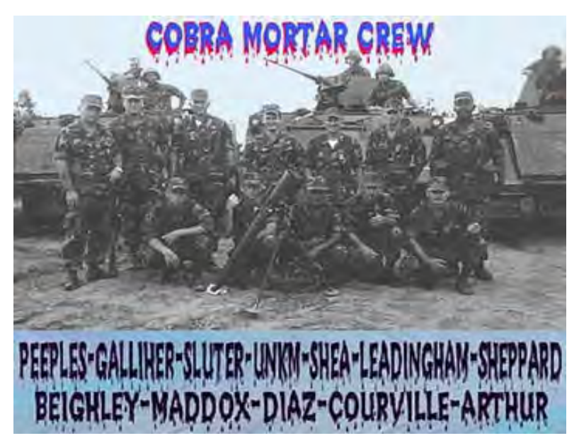
2. Phu Cat AB, Cobra Mortar Crew.