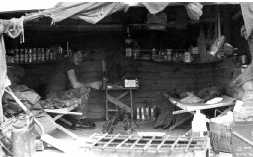
17. (Close up of #18, below.)