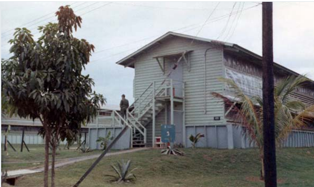
5. Phù Cát AB, New Barracks.