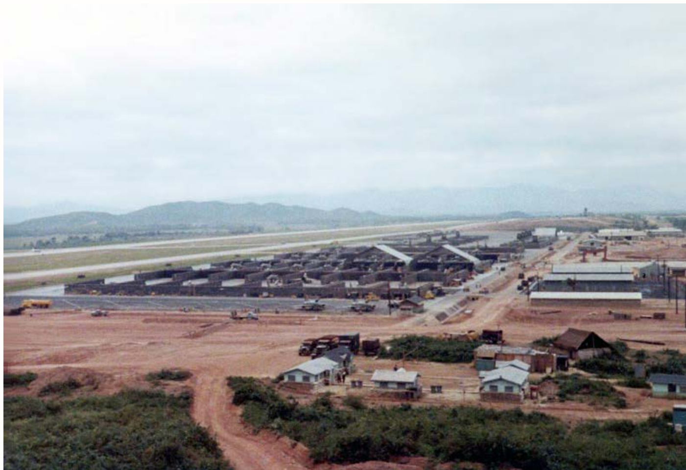
27. Phù Cát AB, New flight line.