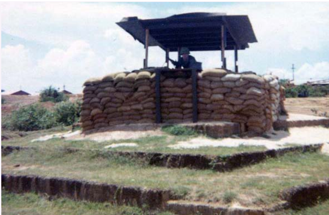
22. One of the Rooks.