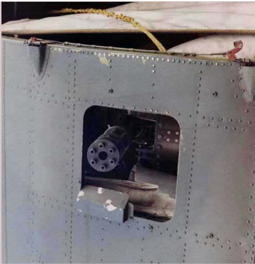
24. Spooky gets your attention!