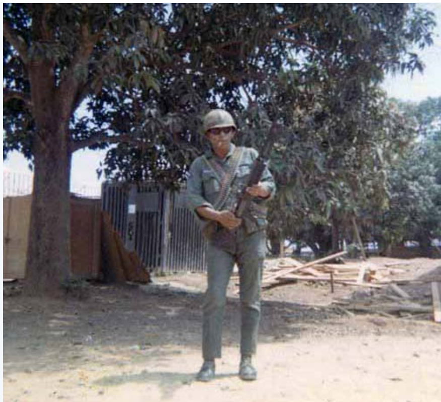
20. Unknown Airman.