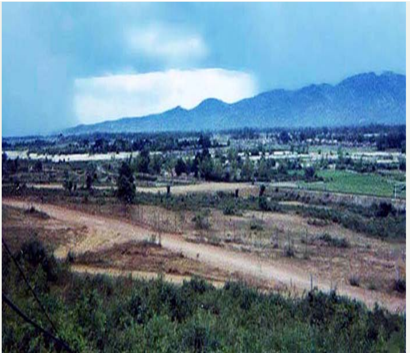
25. Original Landscape.