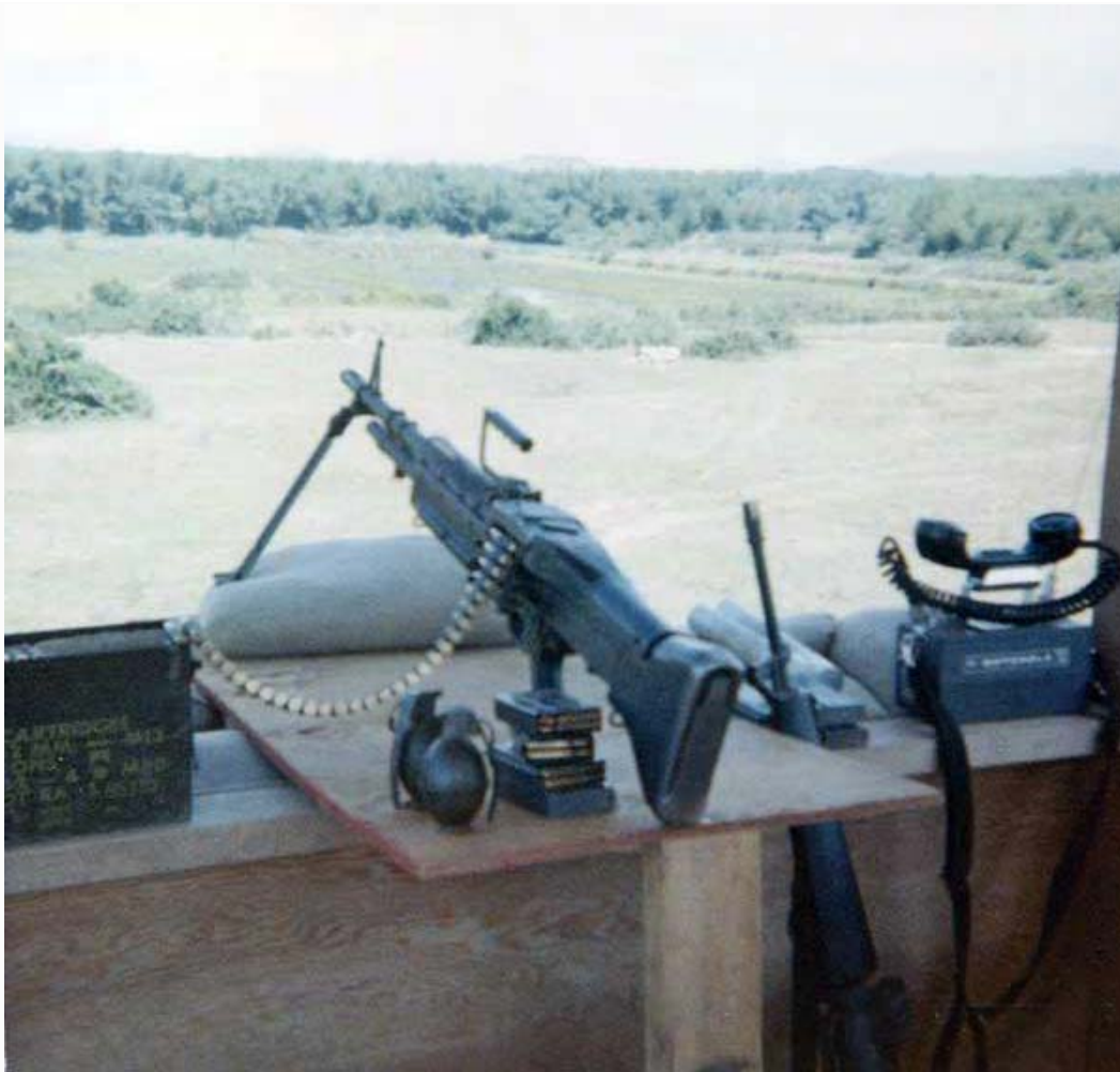
28. View from a Rook.