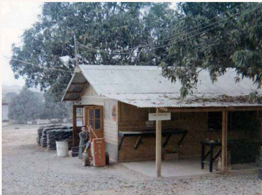
19. Clubhouse then Armory.