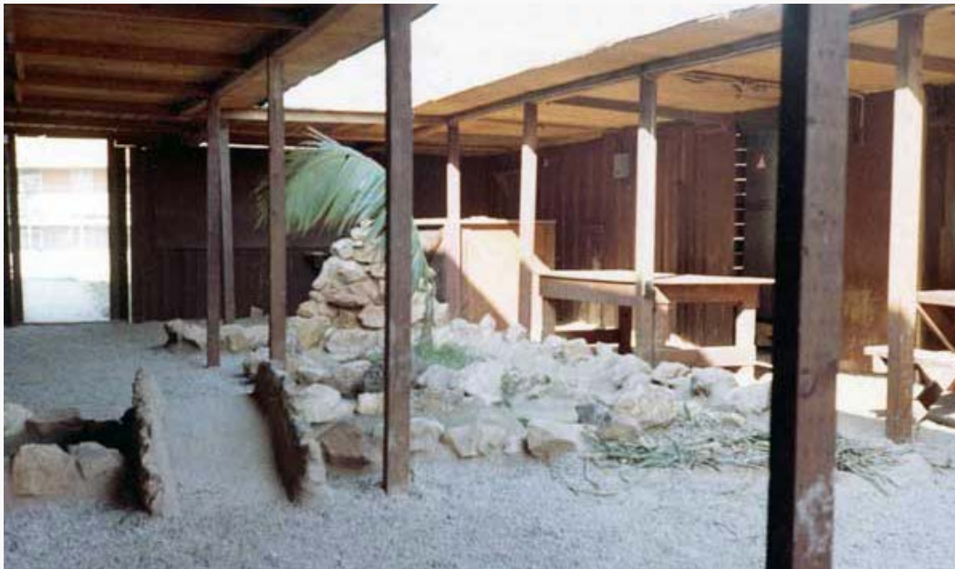
10. Break Area.