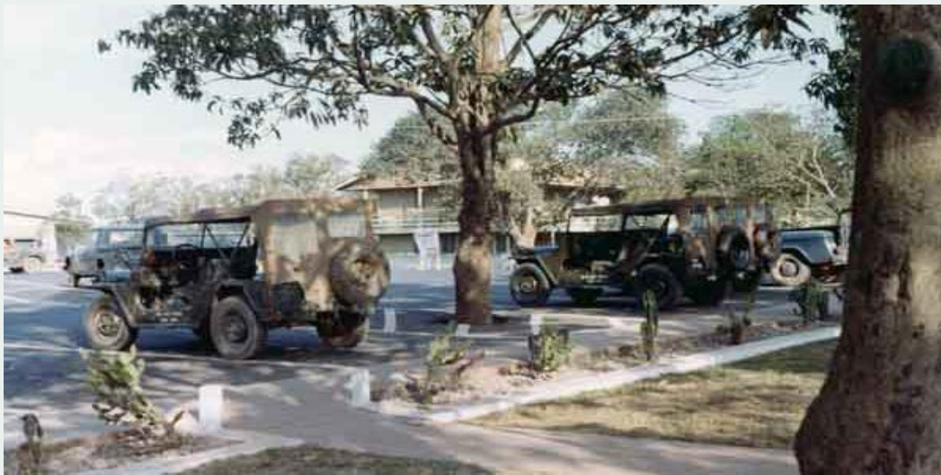
17. Near Guardmount location.