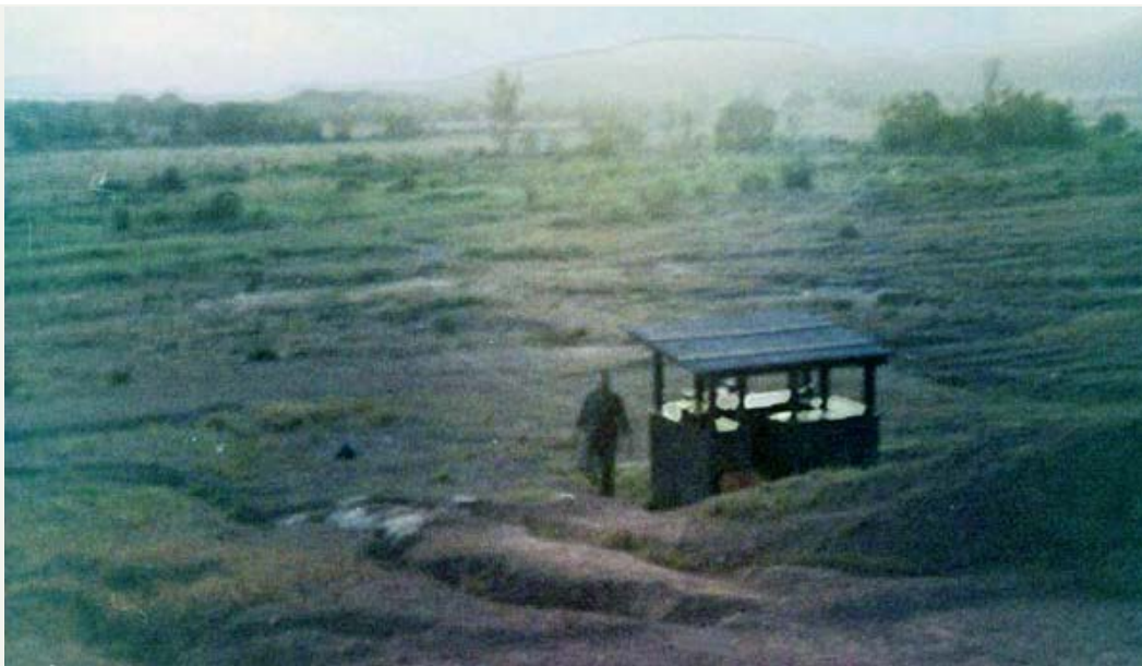
16. A last look at twilight.