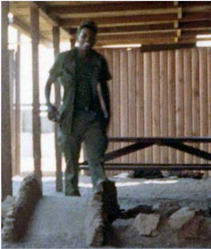
9. Break Area.