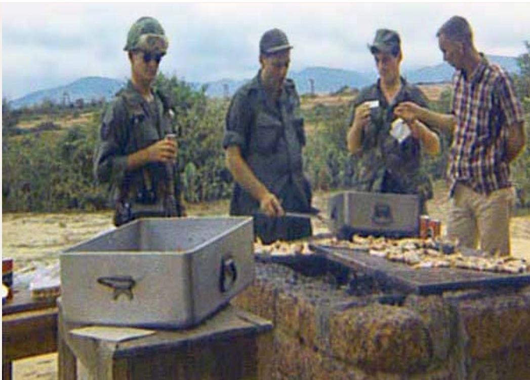
14. BBQ Chow down.