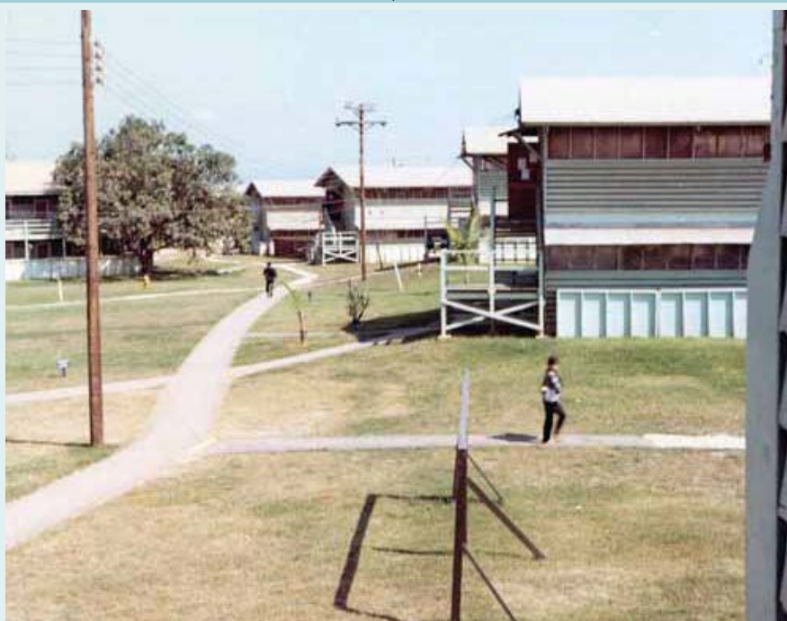
4. Phù Cát AB, Original Barracks.