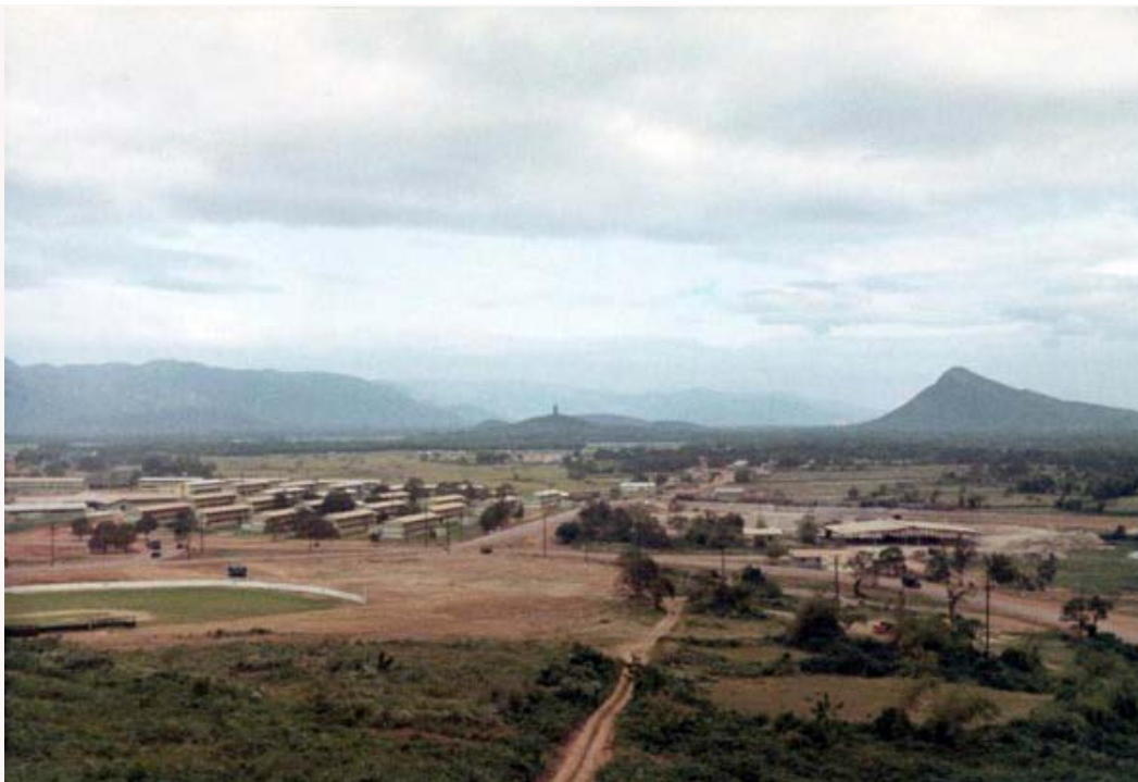
26. Phù Cát AB, from a distance.