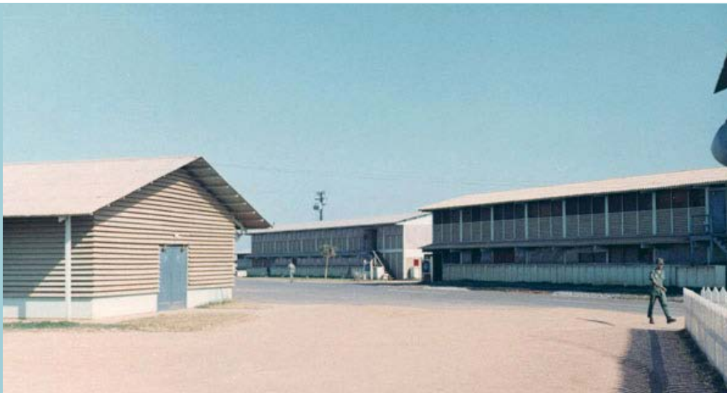
3. Phù Cát AB, Barracks area.