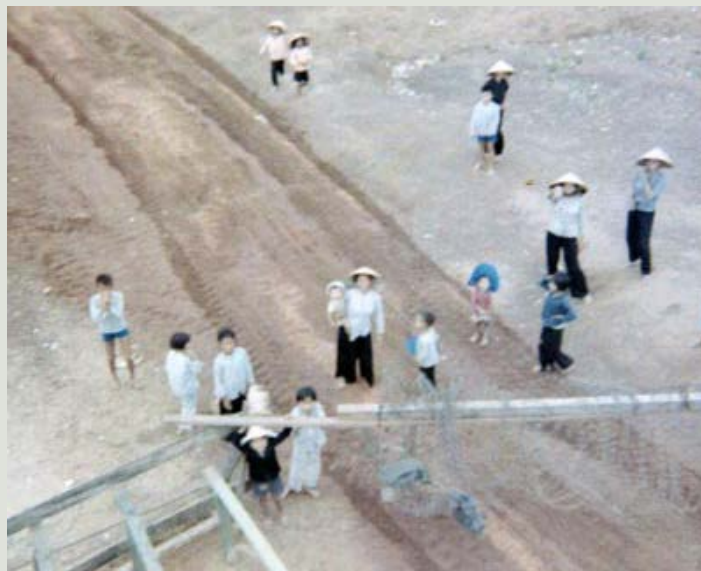
29. View from a Tower.