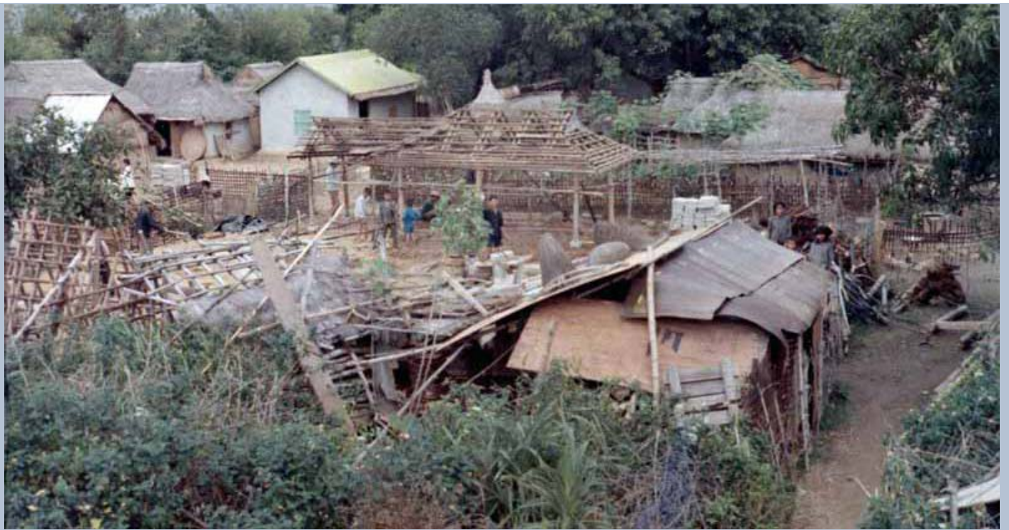
30. View from a Tower.