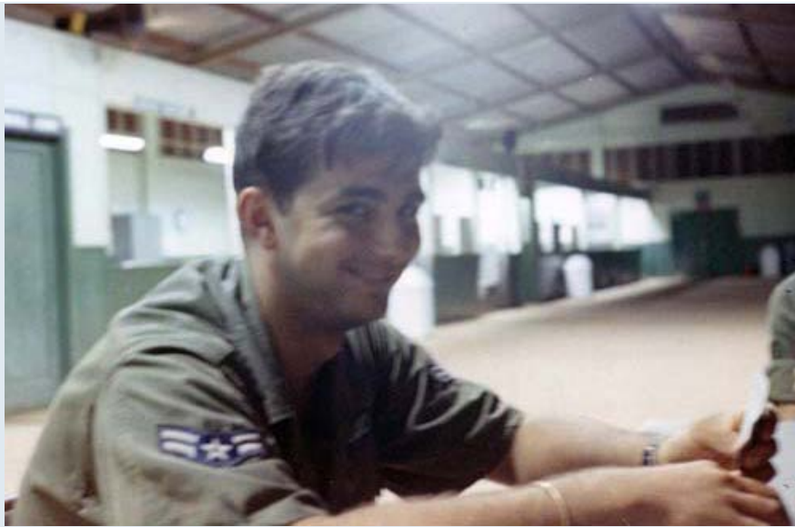
11. A little Card Game. This is my, I'm holding Aces Grin poker face.