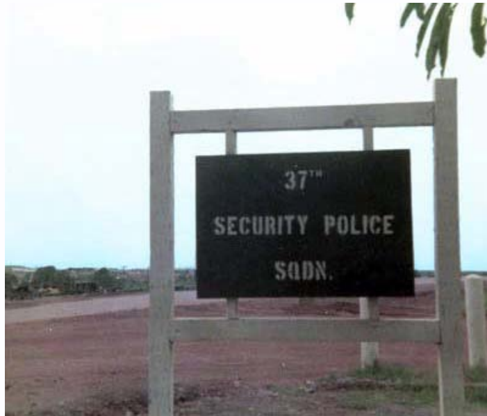
1. Phù Cát AB, 37th SPS entrance.