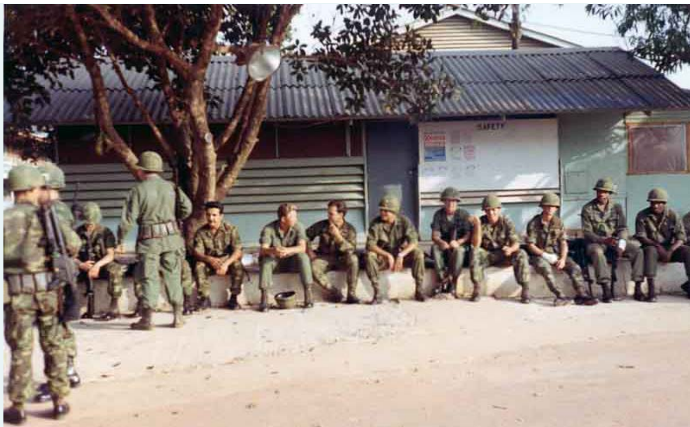
18. Waiting to Post.