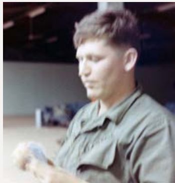
12. Card Game: He thinks I think he's holding Aces... hymm... he knows I know he thinks I think....