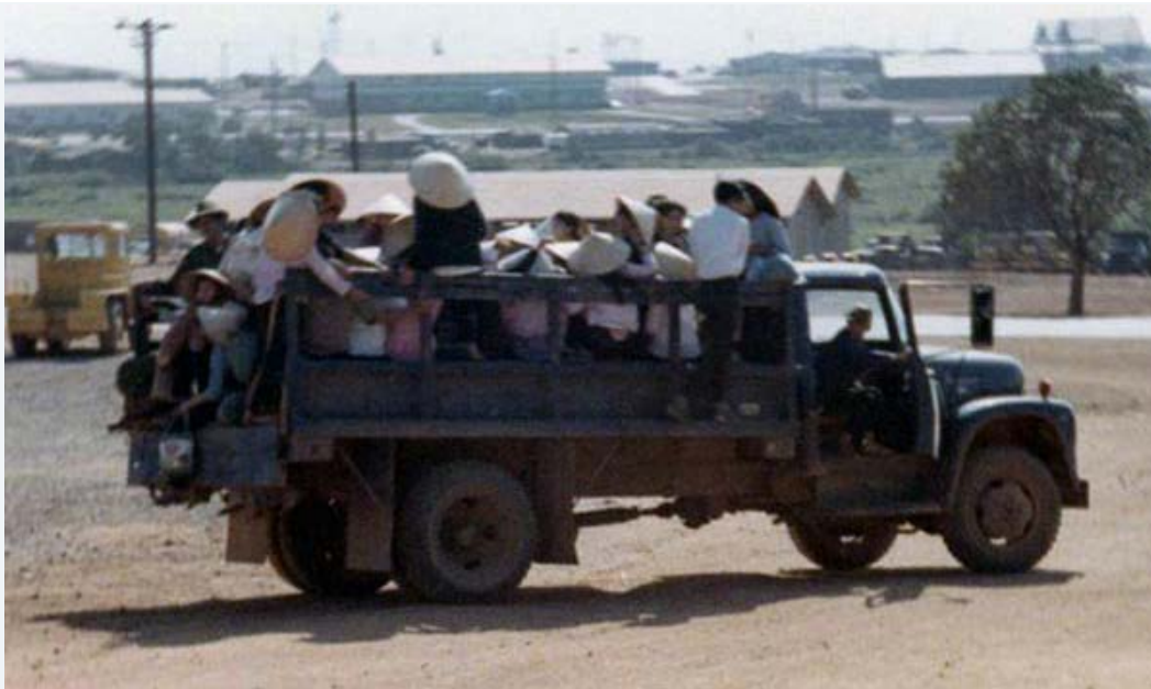
32. Vietnamese civilian workers coming to work.