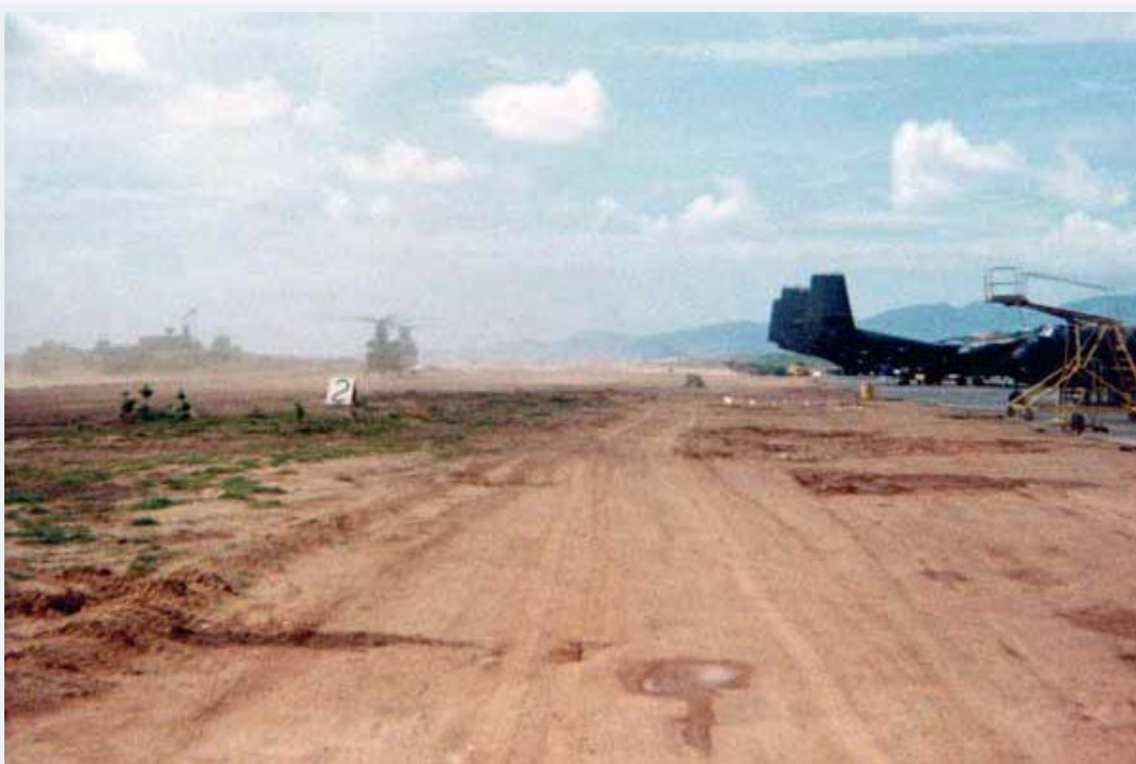
23. Original flight line.