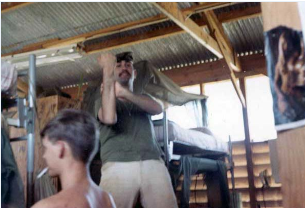
7. A moment of self-expression.