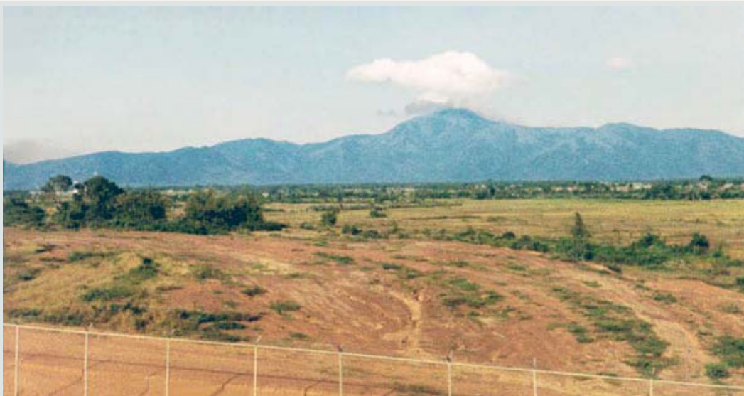
15. Near original flight line.