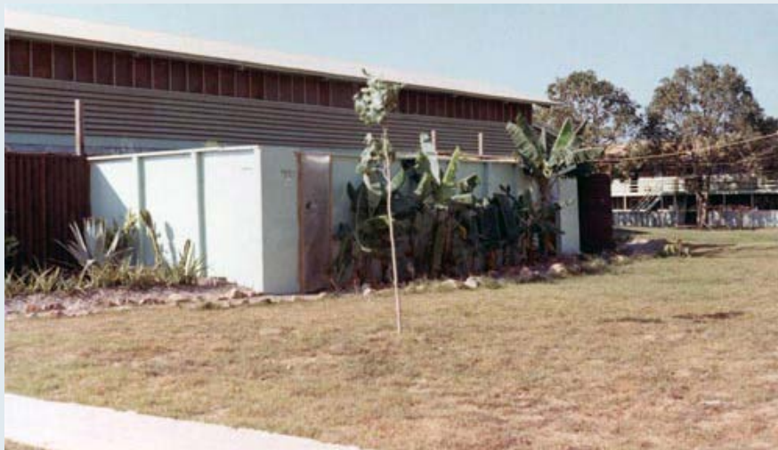
13. Horticulture area.