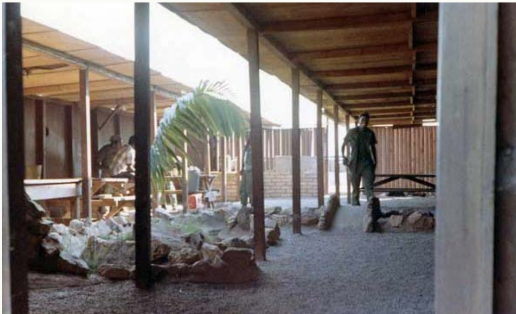
8. Break Area.