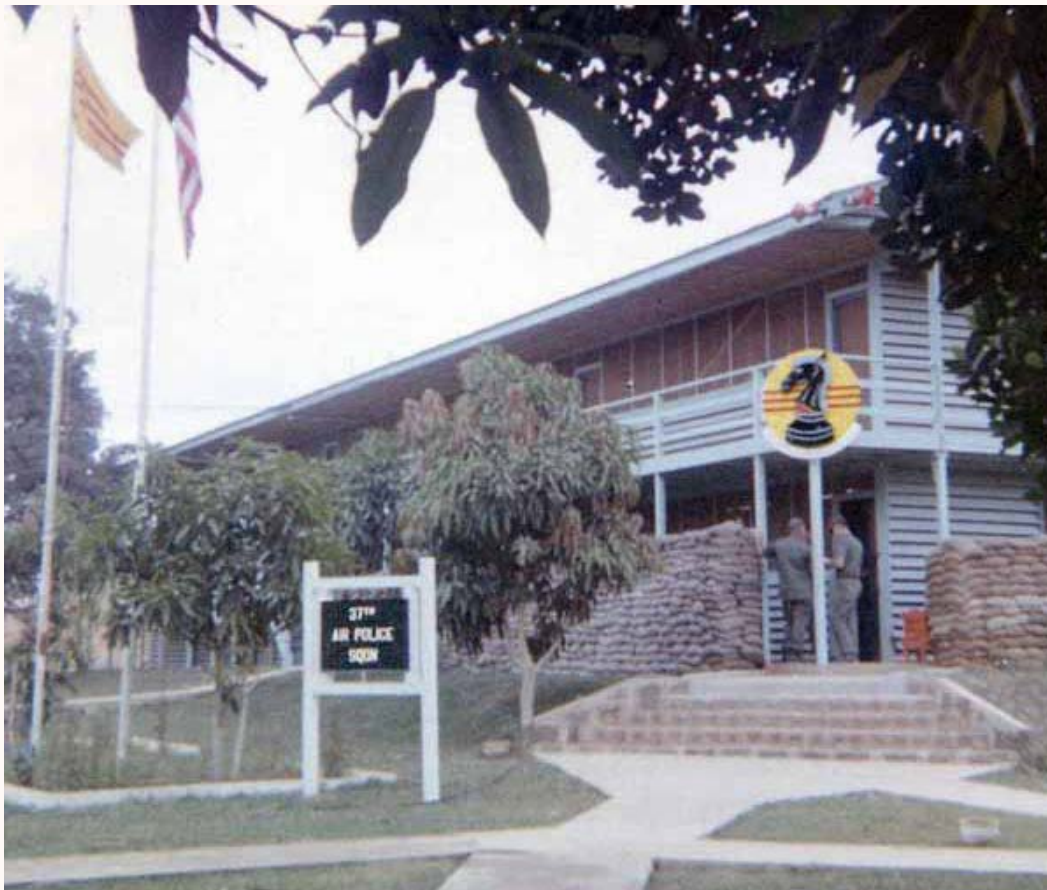
2. Phù Cát AB, Approach to barracks.