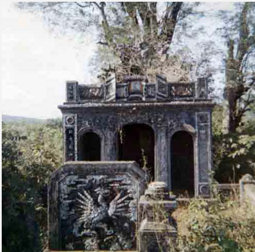
31. Temple on the perimeter.